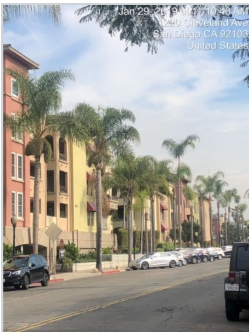
Subject 1270 Cleveland Ave Unit C231 View Side