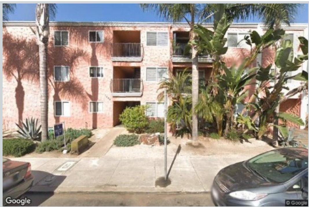
Listing Comp 2 3688 1st Ave Unit 38