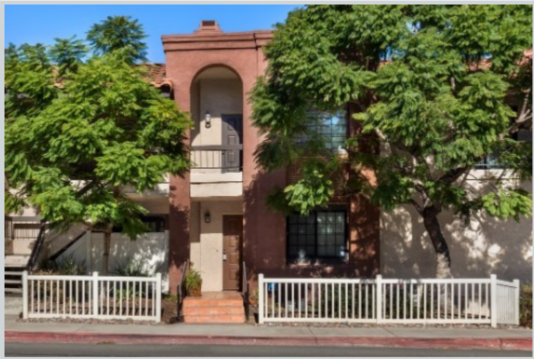
Listing Comp 1 3963 Eagle St 4