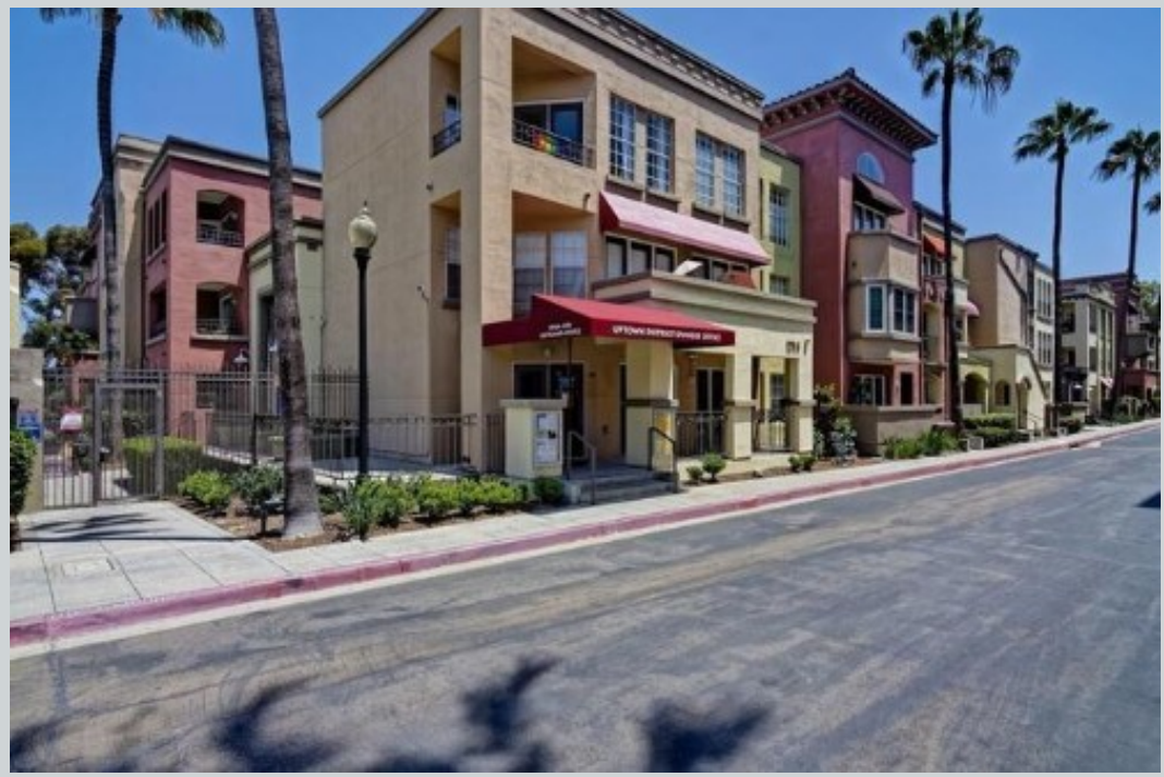
Sold Comp 2 1260 Cleveland Ave Unit G313