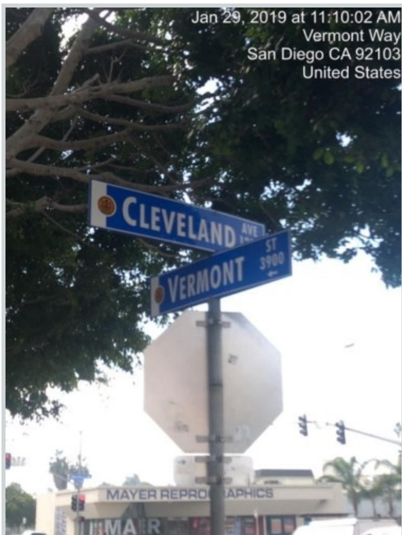
Subject 1270 Cleveland Ave Unit C231 View Address Verification