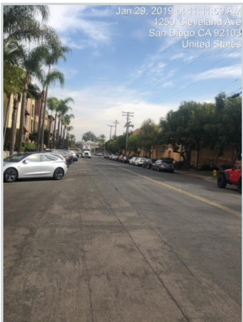
Subject 1270 Cleveland Ave Unit C231 View Street