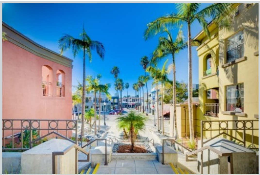
Sold Comp 1 1270 Cleveland Ave Unit B236