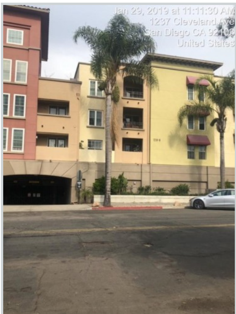
Subject 1270 Cleveland Ave Unit C231 View Address Verification