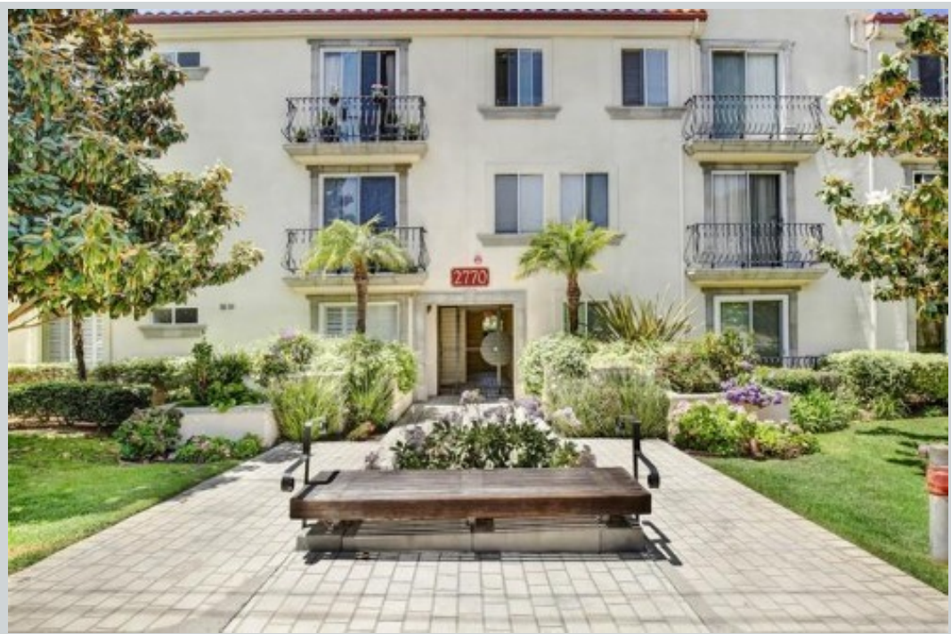
Sold Comp 3 2770 2nd Ave #210