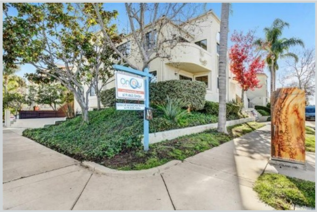
Listing Comp 3 3727 Richmond #1 San Di