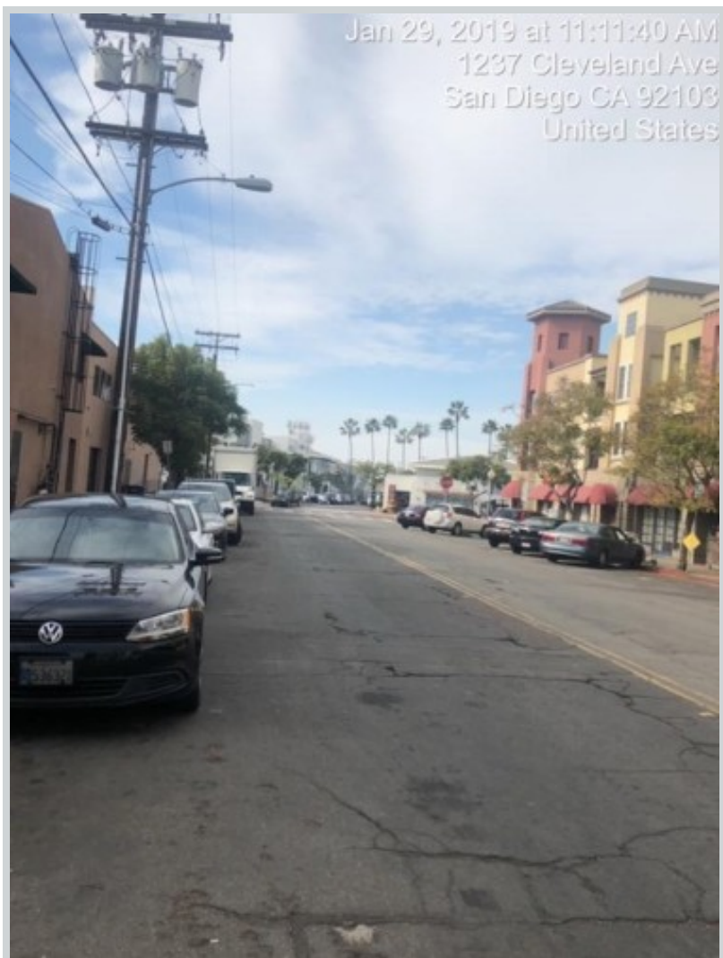
Subject 1270 Cleveland Ave Unit C231 View Street