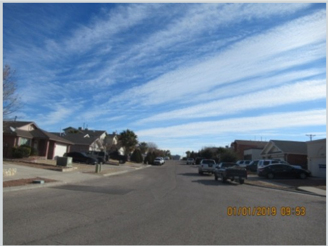
Subject 14225 Desert Ash Dr