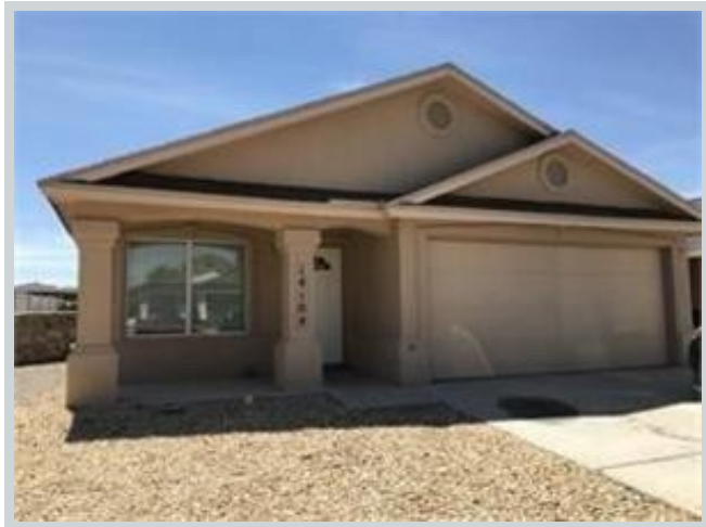
Sold Comp 1