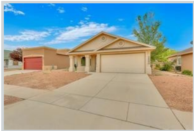
Sold Comp 2