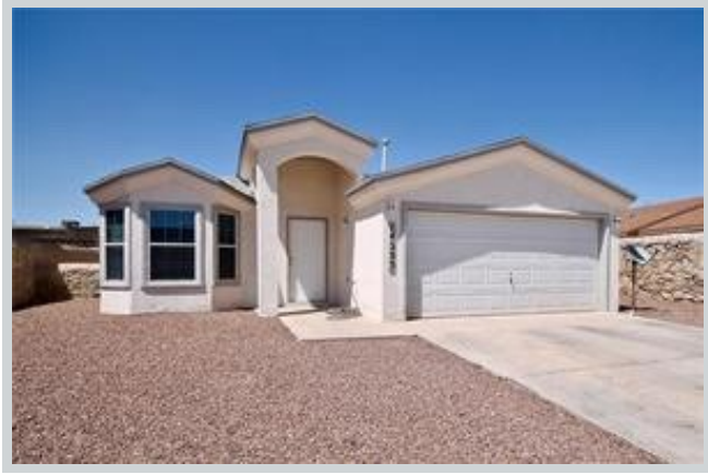
Listing Comp 2