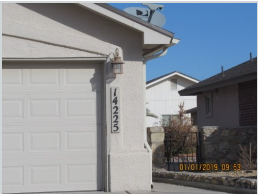
Subject 14225 Desert Ash Dr