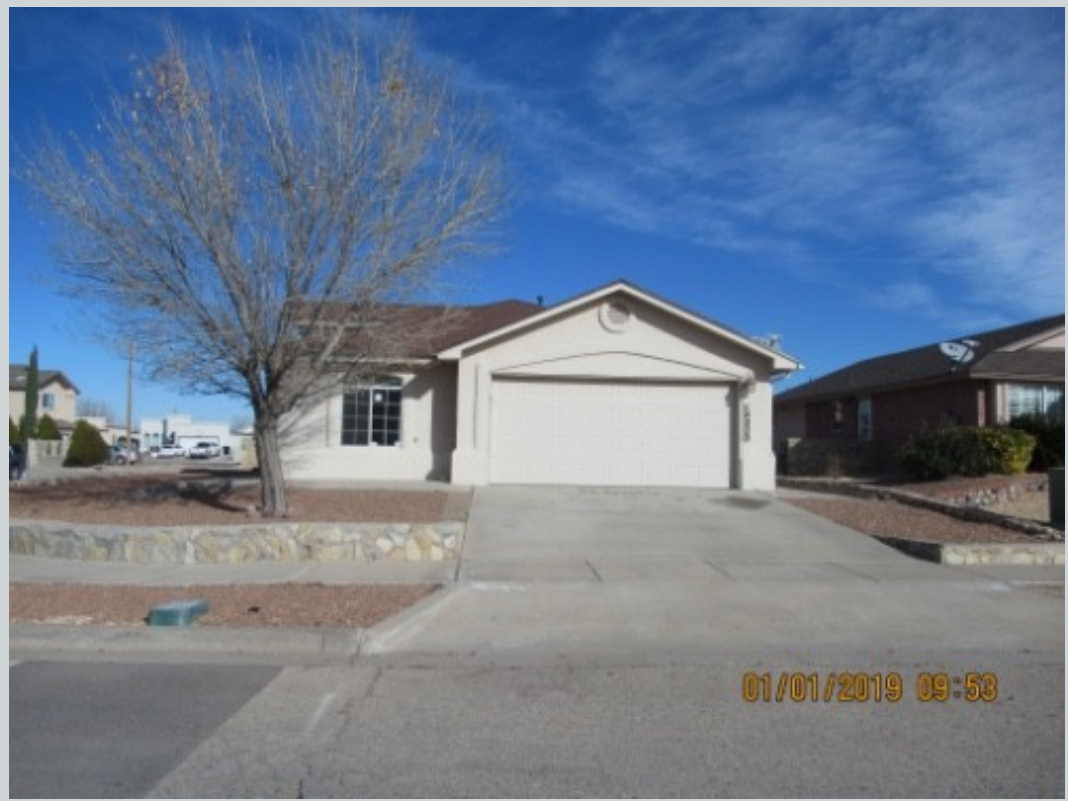
Subject 14225 Desert Ash Dr