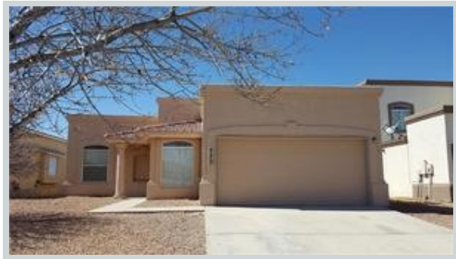
Sold Comp 3