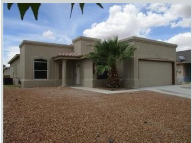
Listing Comp 3