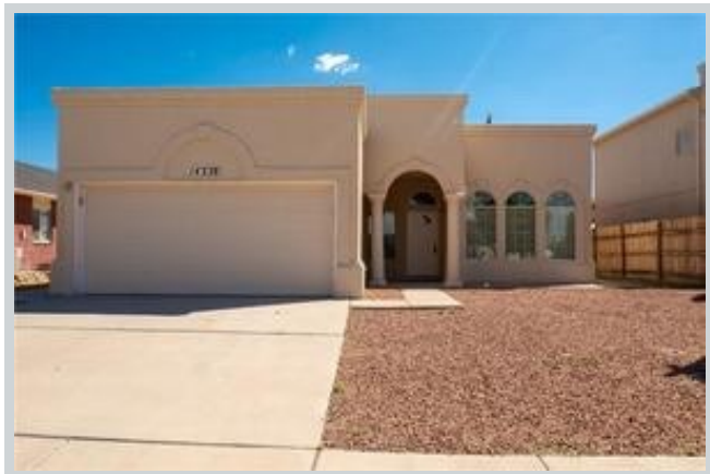
Listing Comp 1