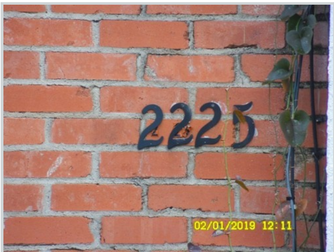
Subject 2225 Spanish Trl