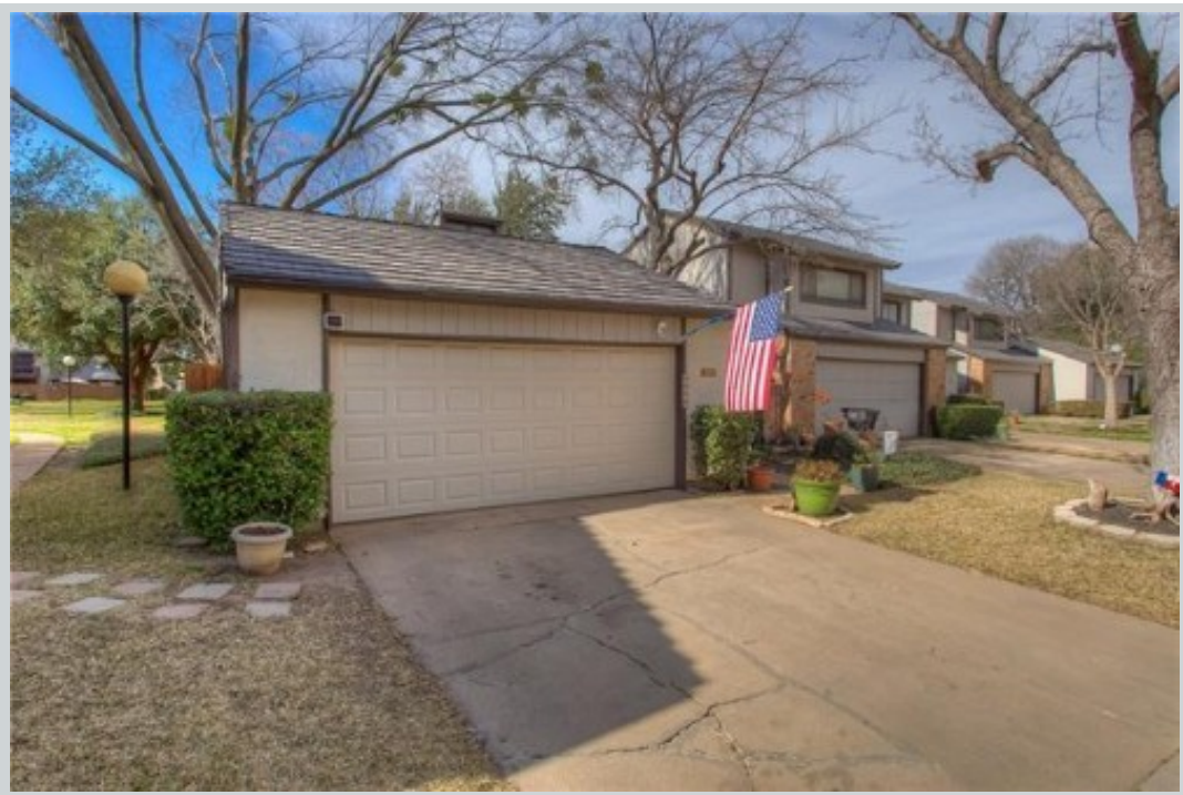
Listing Comp 3 1016 Woodoak Ct