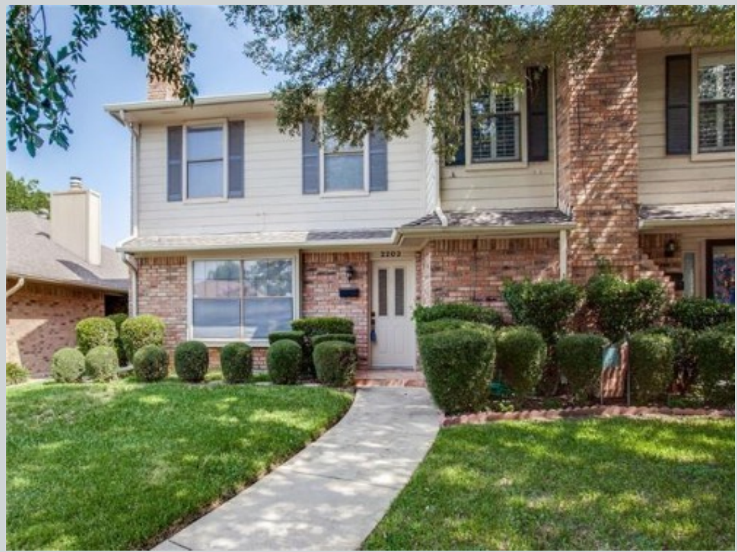
Sold Comp 1 2203 St Vincent Ct