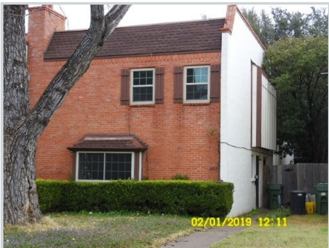
Subject 2225 Spanish Trl