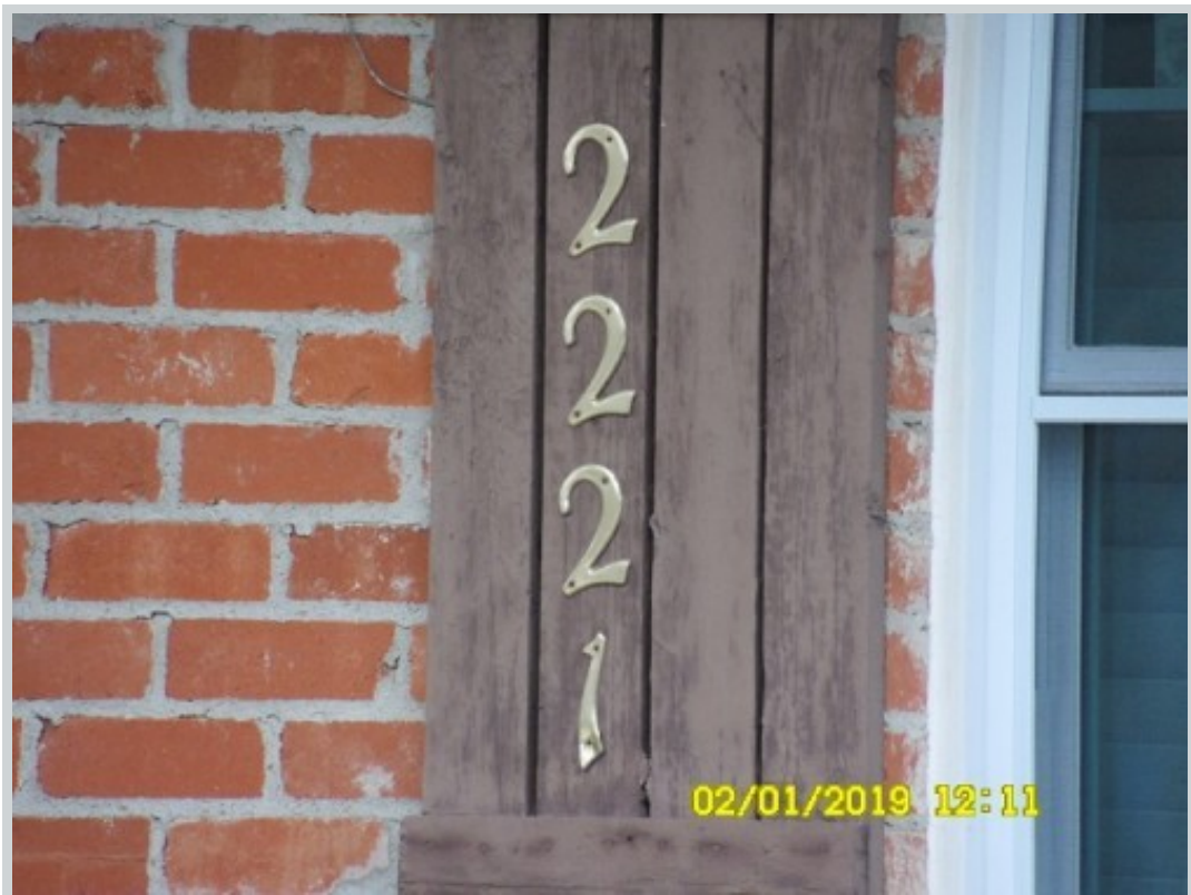
Subject 2225 Spanish Trl View Address Verification Comment "other side address"

Address 2225 Spanish Trail, Arlington, TX 76013 Loan Number 36784 Suggested List $164,000 Suggested Repaired $164,000 Sale $162,000