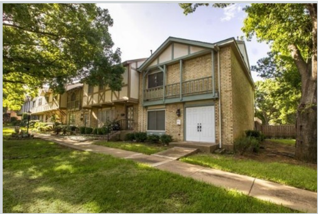
Sold Comp 2 474 Westview Terrace