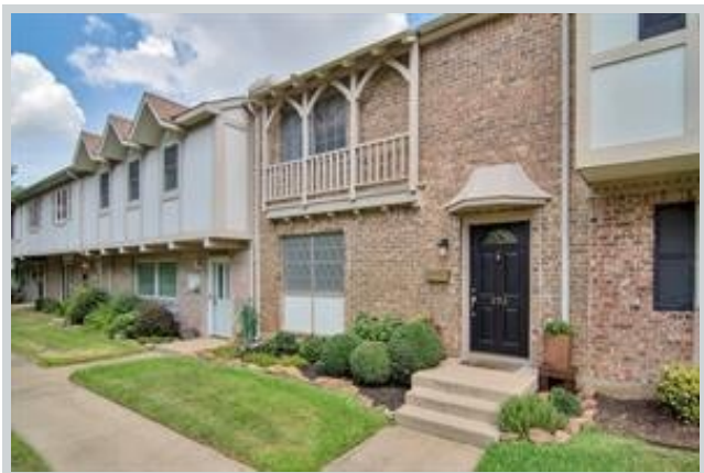
Sold Comp 3 292 Westview Terrace View Front