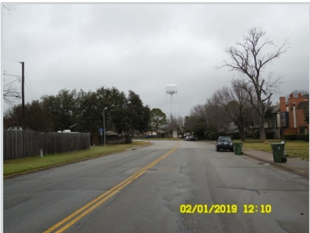
Subject 2225 Spanish Trl View Street