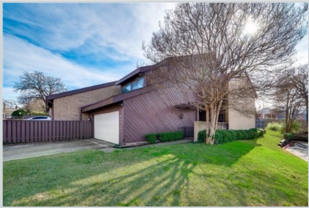
Listing Comp 2 710 Oakwood Trl