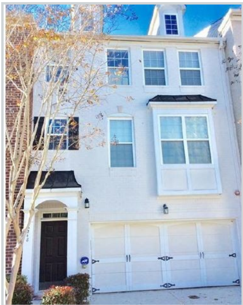
Listing Comp 3 6248 Sawtooth Oak Court Se View Front