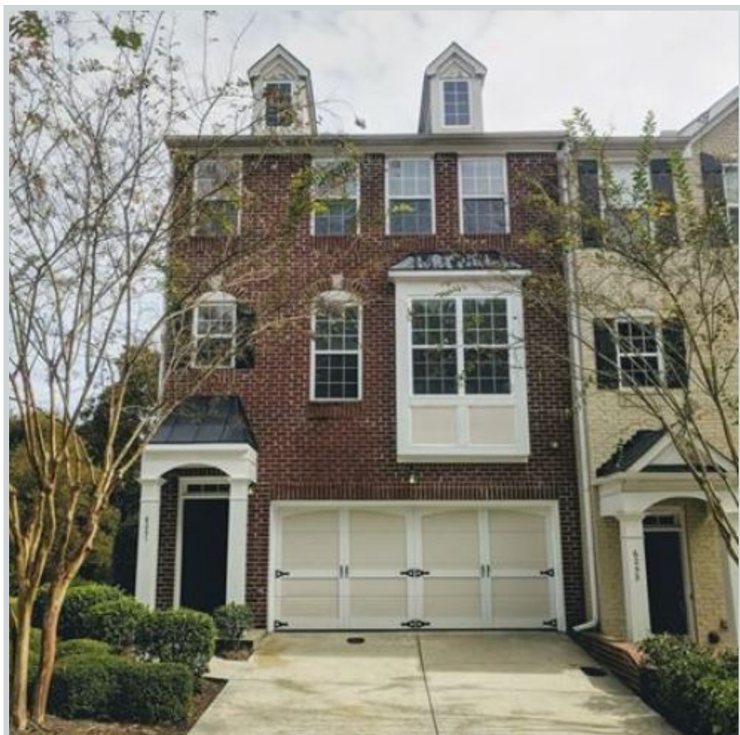
Sold Comp 1 6251 Sawtooth Oak Court Se View Front