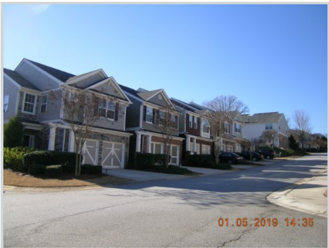
Subject 6053 Mayfield Way Se