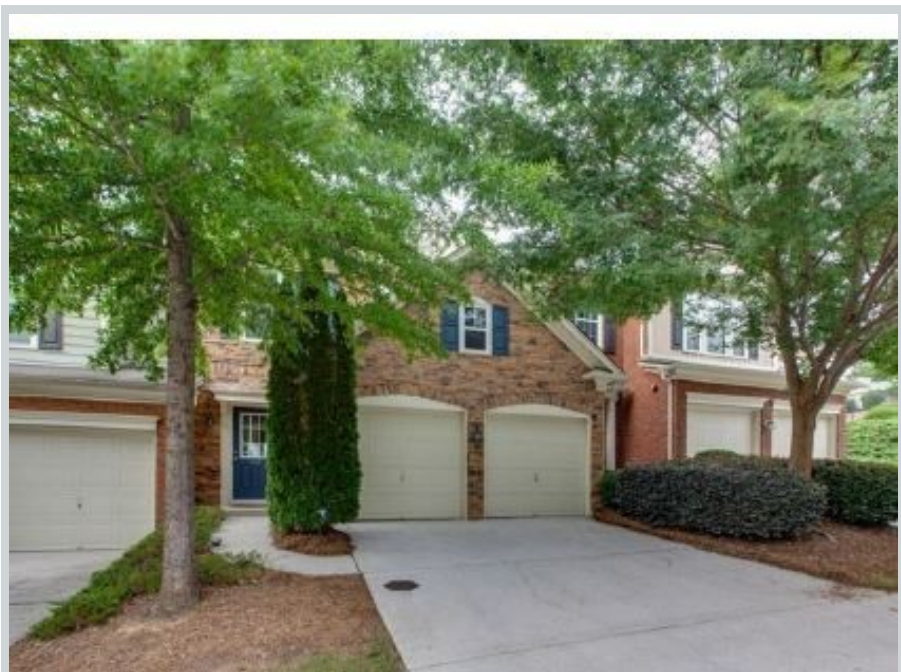
Sold Comp 3 1652 Fair Oak Way View Front