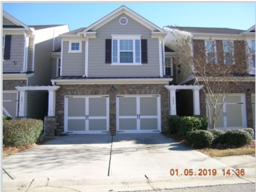
Subject 6053 Mayfield Way Se