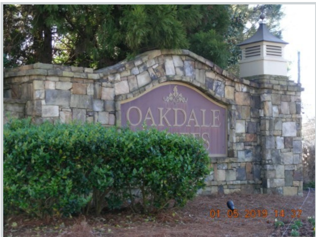
Subject 6053 Mayfield Way Se