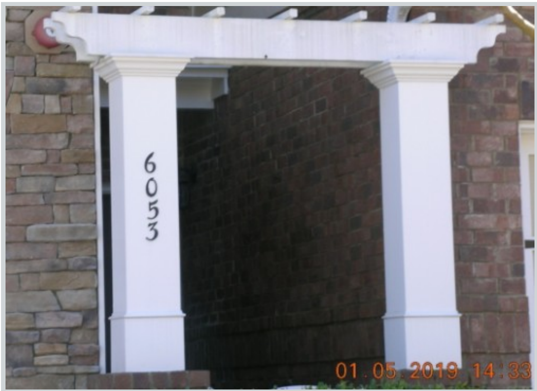
Subject 6053 Mayfield Way Se

Address 6053 Mayfield Way, Mableton, GA 30126 Loan Number 36785 Suggested List $265,000 Suggested Repaired $265,000 Sale $255,000