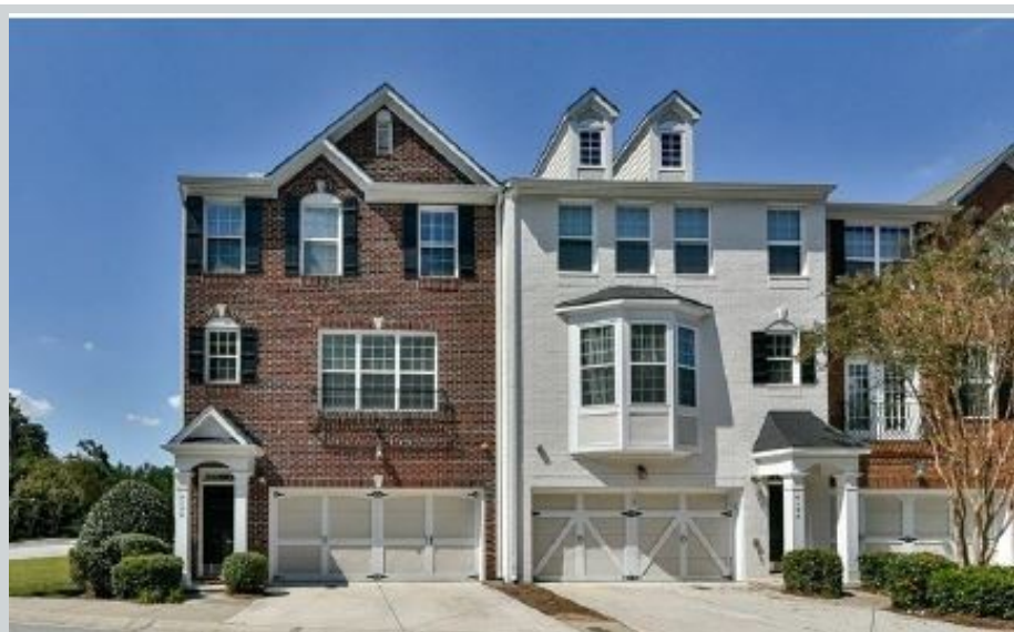
Sold Comp 2 6196 Indian Wood Circle Se View Front

Address 6053 Mayfield Way, Mableton, GA 30126 Loan Number 36785 Suggested List $265,000 Suggested Repaired $265,000 Sale $255,000