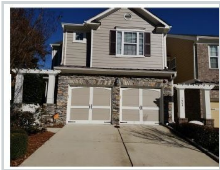
Listing Comp 2 1601 Watercress Court Se View Front