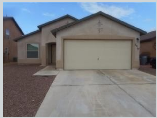
Sold Comp 2