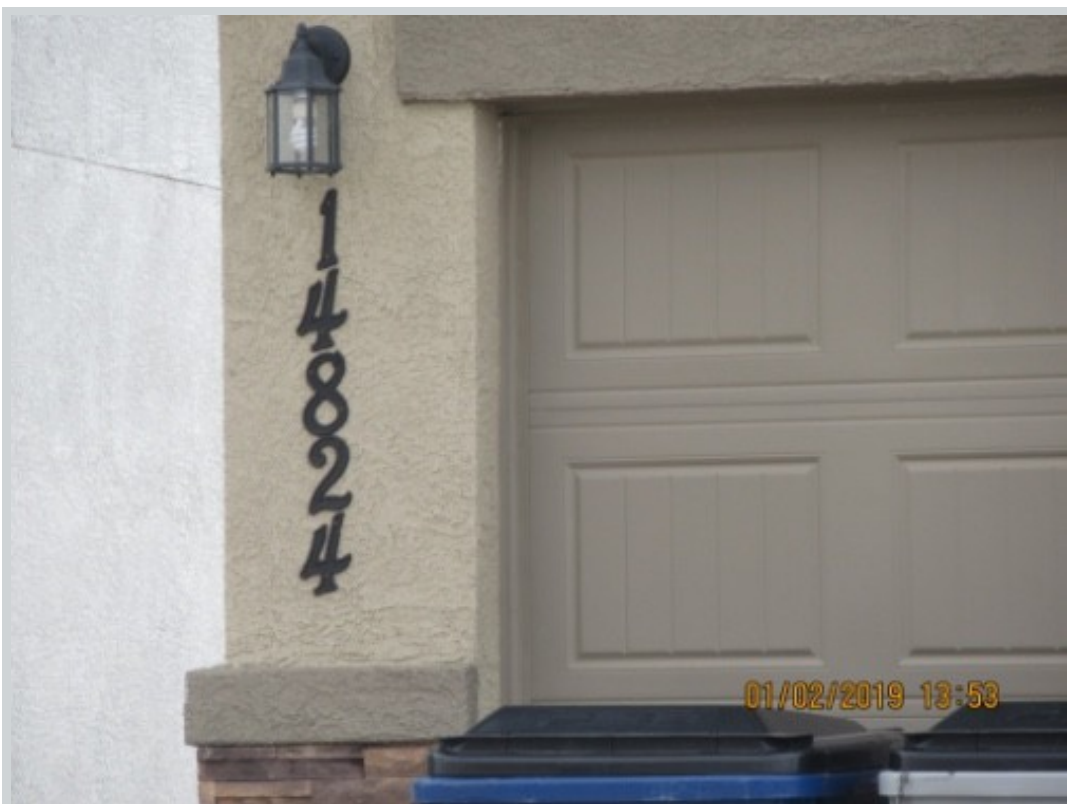
Subject 14824 Orsten Artis Ave