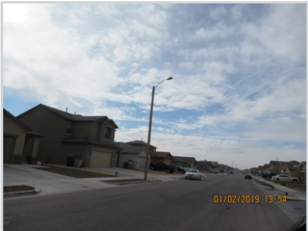
Subject 14824 Orsten Artis Ave