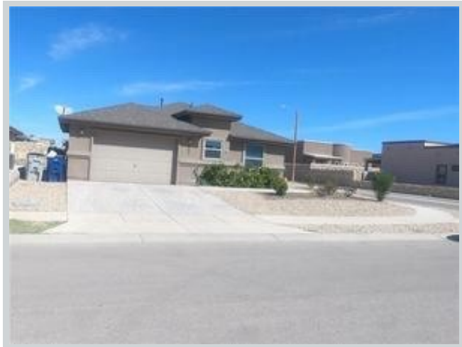
Listing Comp 1