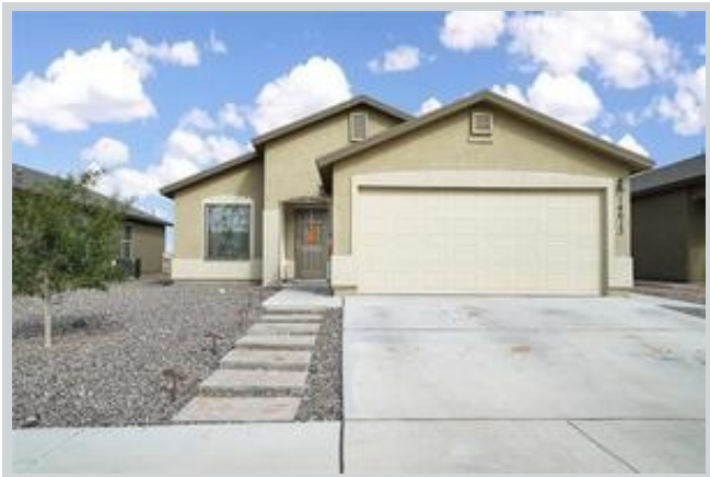
Sold Comp 3