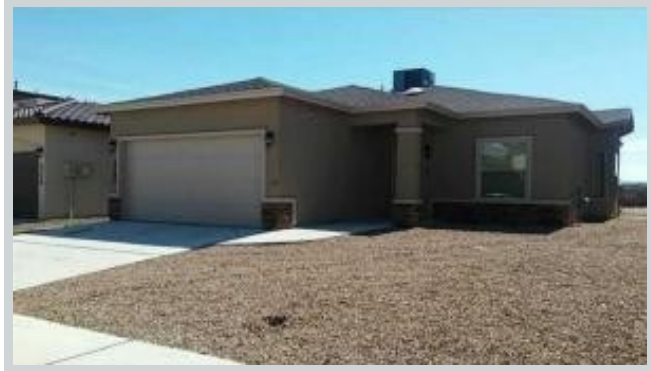
Listing Comp 3