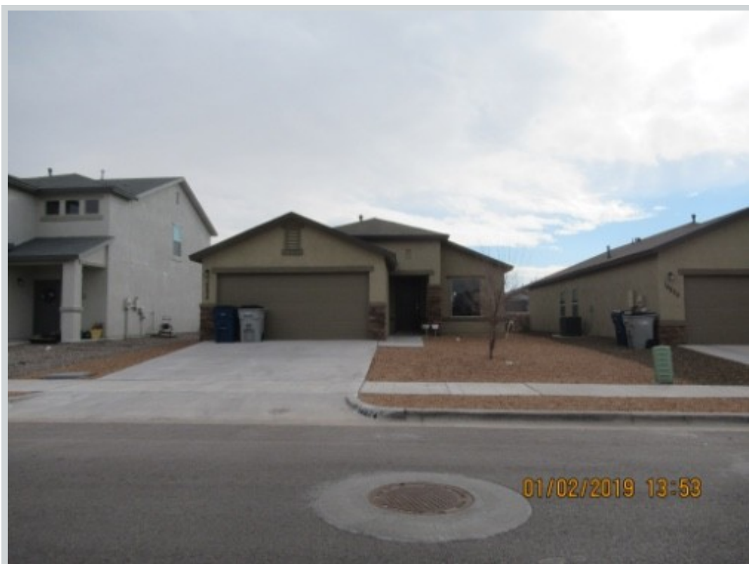
Subject 14824 Orsten Artis Ave