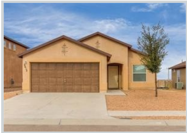
Sold Comp 1