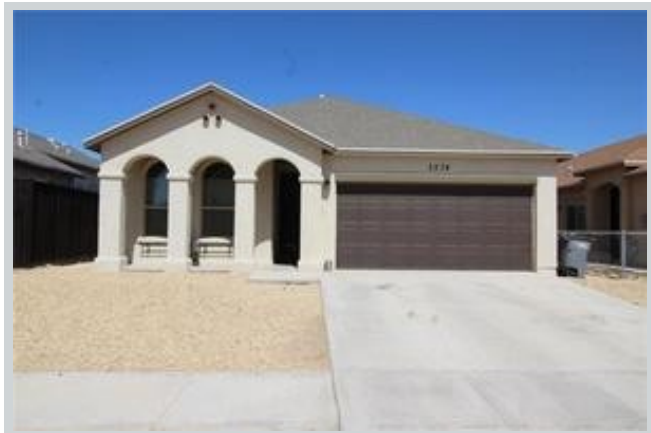
Listing Comp 2