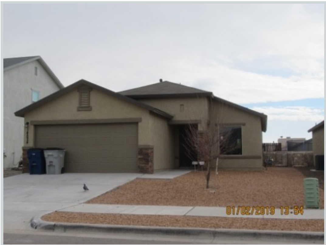
Subject 14824 Orsten Artis Ave