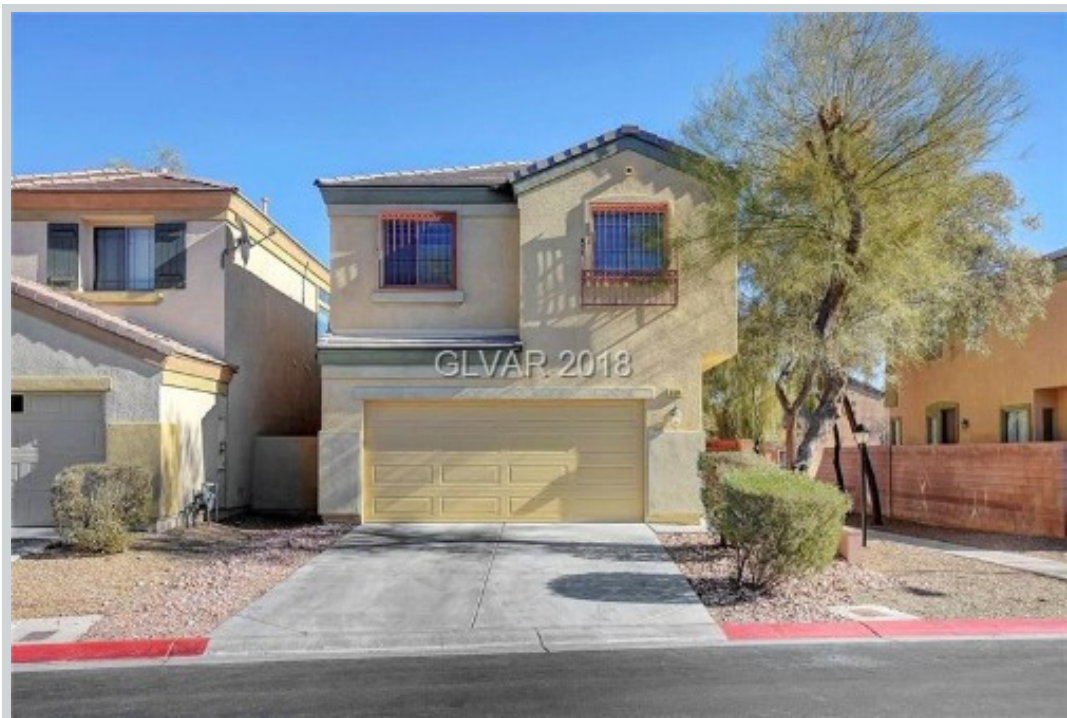
Listing Comp 3 6504 Raven Hall St View Front

Address 11 Stockton Edge Avenue, North Las Vegas, NV 89084 Loan Number 36795 Suggested List $240,000 Suggested Repaired $245,000 Sale $235,000