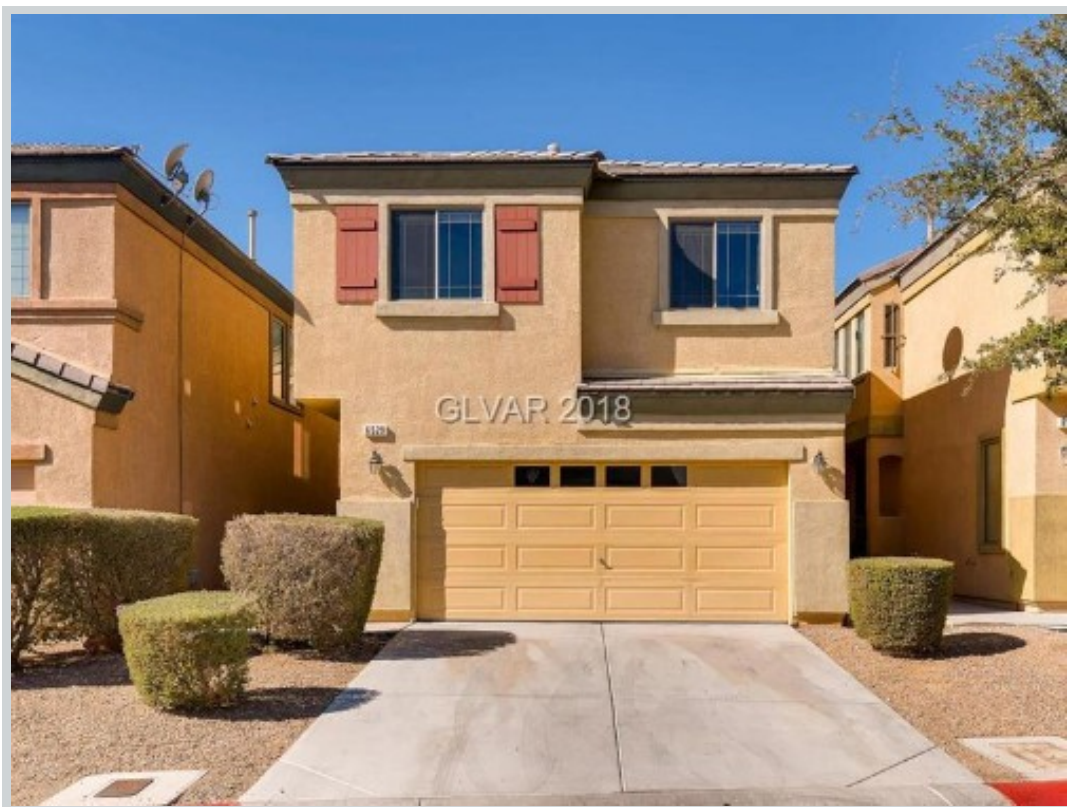
Sold Comp 1 6529 Butterfly Sky St View Front