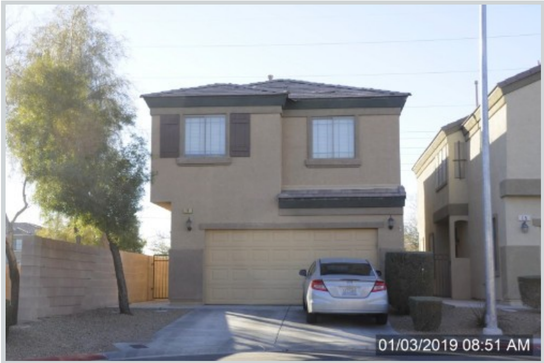
Subject 11 Stockton Edge Ave