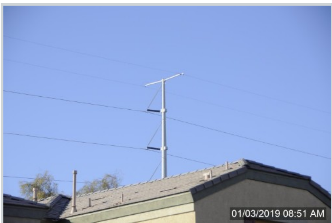
Subject 11 Stockton Edge Ave