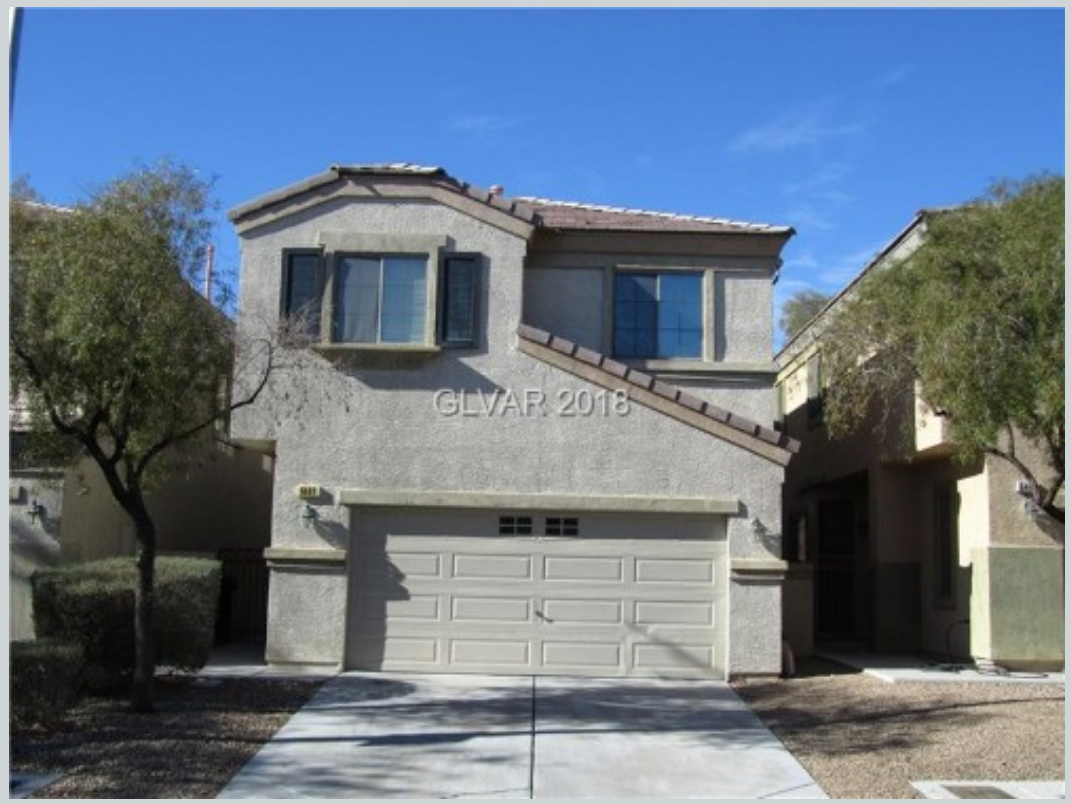
Listing Comp 1 6441 Butterfly Sky St