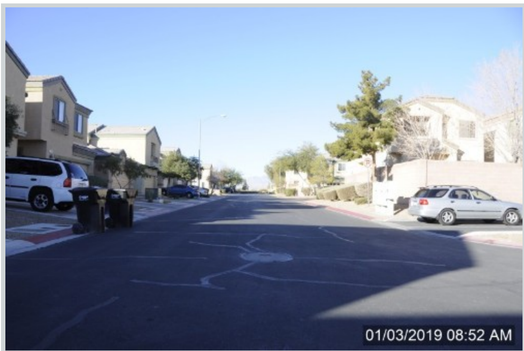
Subject 11 Stockton Edge Ave

Address 11 Stockton Edge Avenue, North Las Vegas, NV 89084 Loan Number 36795 Suggested List $240,000 Suggested Repaired $245,000 Sale $235,000