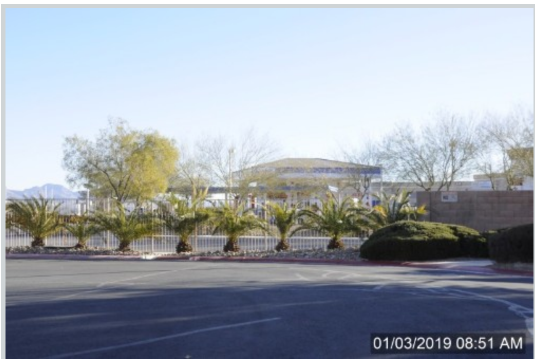
Subject 11 Stockton Edge Ave View Other Comment "Commercial Properties Located Across the Street from the Left Side of the Subject"