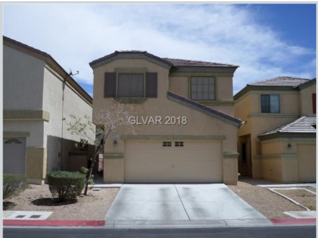
Listing Comp 2 6432 Raven Hall St