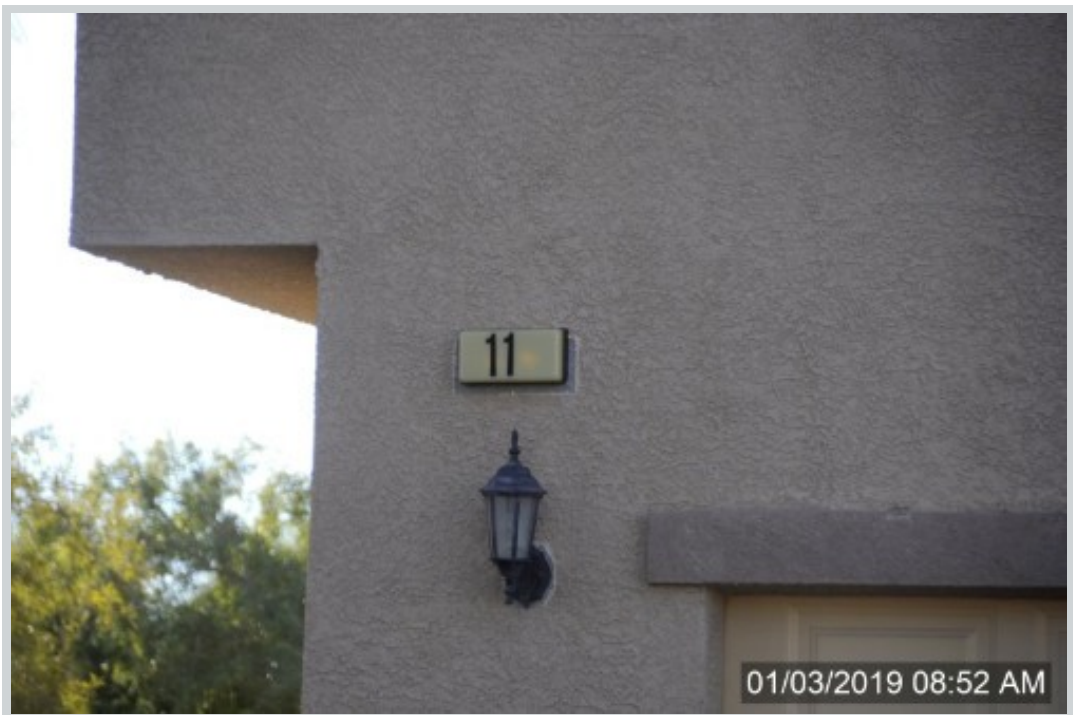
Subject 11 Stockton Edge Ave