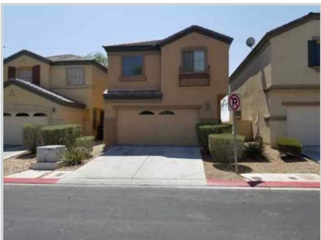
Sold Comp 3 121 Stockton Edge Ave View Front