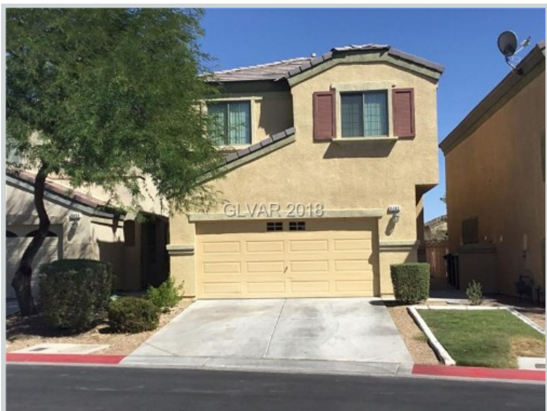
Sold Comp 2 6460 Butterfly Sky St View Front

Address 11 Stockton Edge Avenue, North Las Vegas, NV 89084 Suggested Repaired $245,000 Sale $235,000 Loan Number 36795 Suggested List $240,000