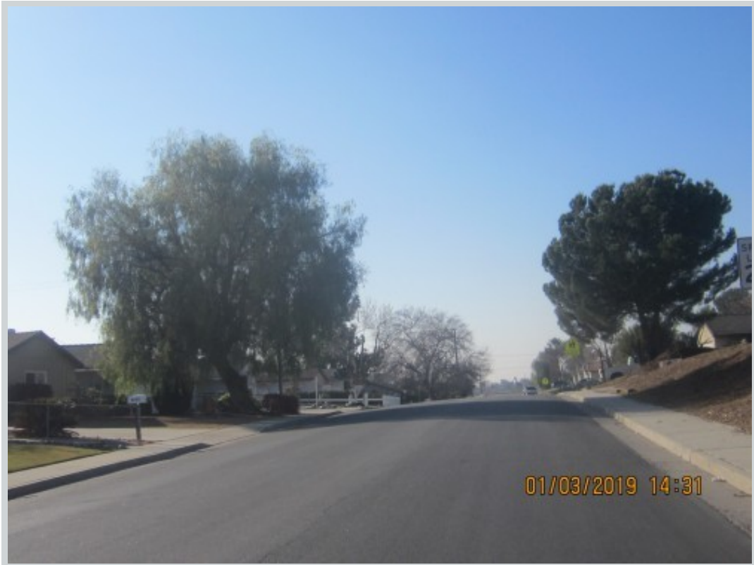
Subject 8033 Willis Ave