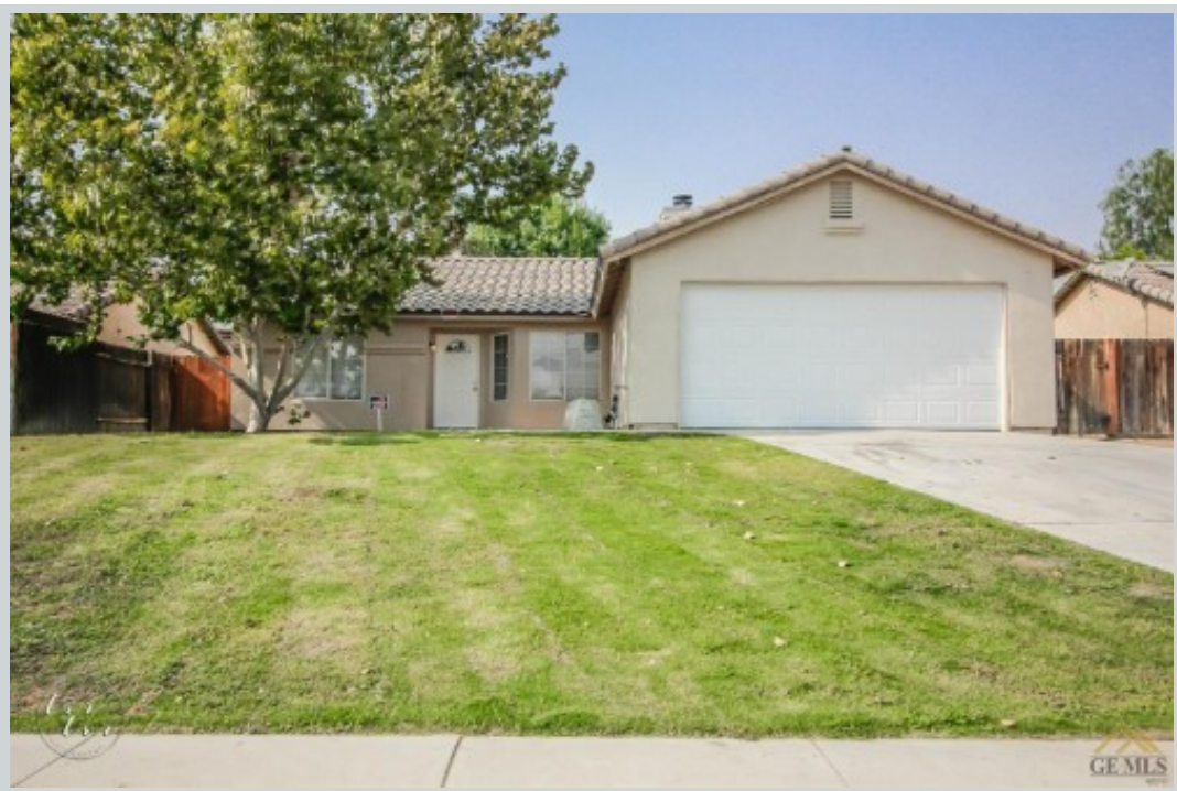
Sold Comp 2 7808 Willis Avenue