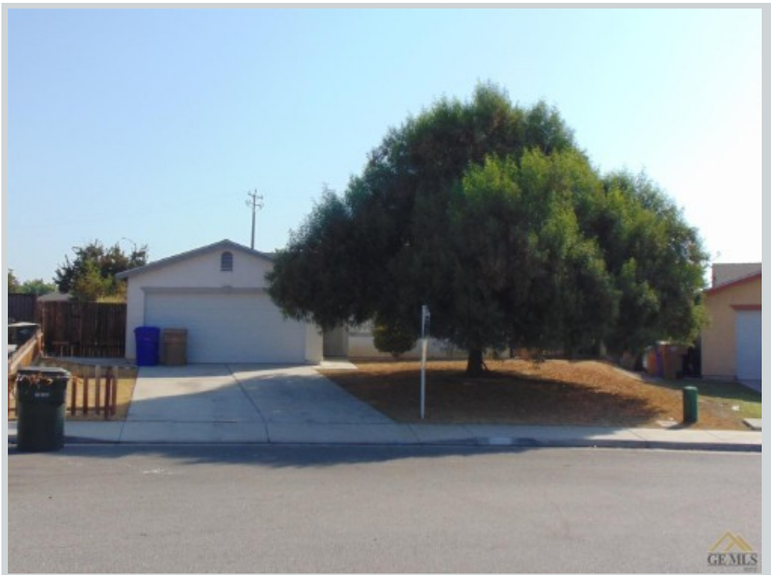
Listing Comp 2 1059 Deer Ridge Drive View Front

Address 8033 Willis Avenue, Bakersfield, CA 93306 Loan Number 36796 Suggested List $205,000 Suggested Repaired $205,000 Sale $200,000