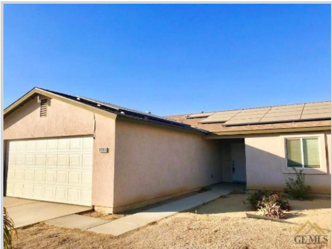
Listing Comp 1 8330 Rosewood Avenue