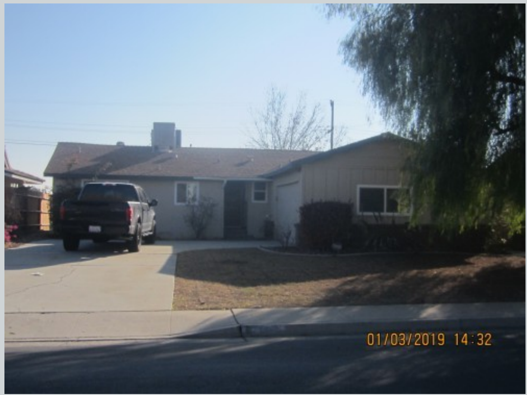
Subject 8033 Willis Ave