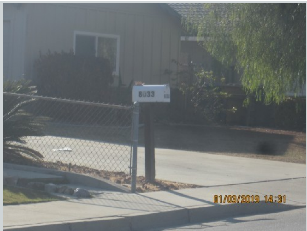
Subject 8033 Willis Ave