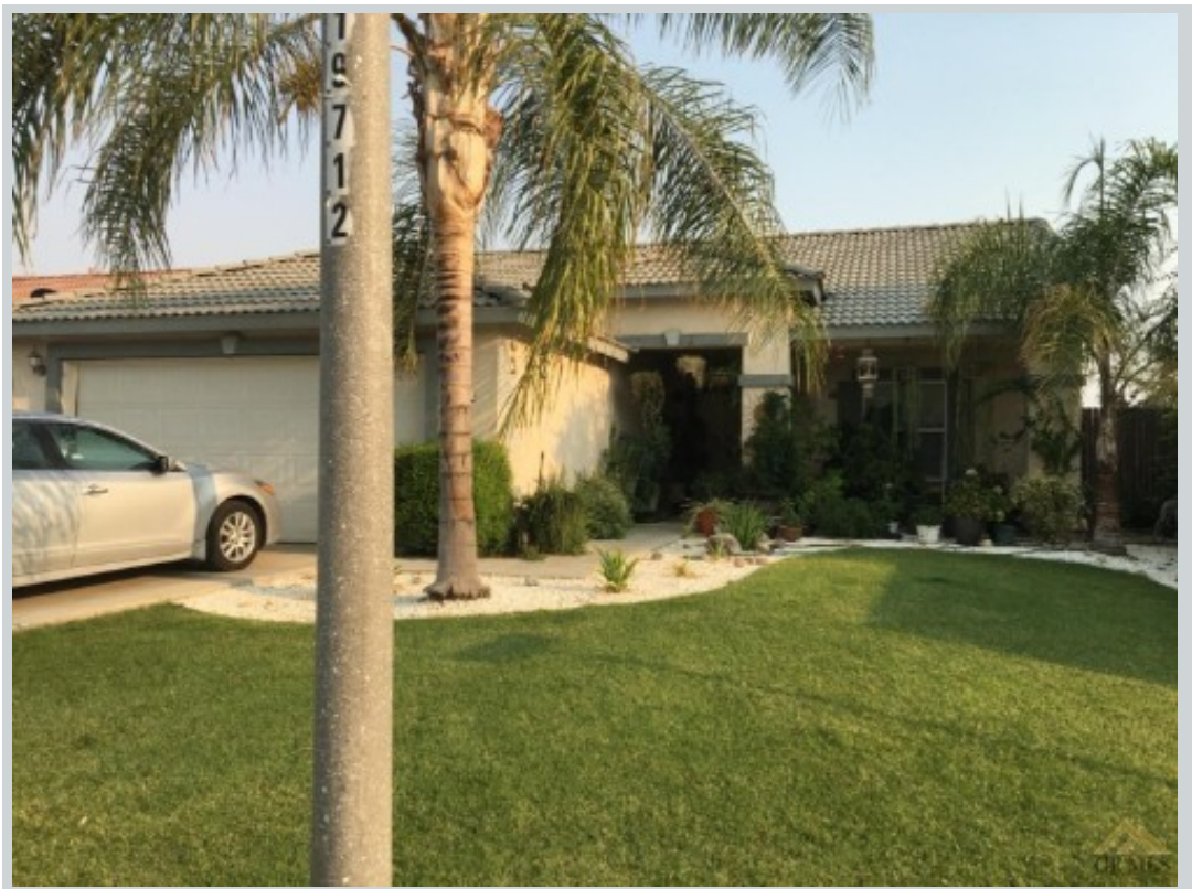
Listing Comp 3 9007 Lorelei Rock Drive View Front