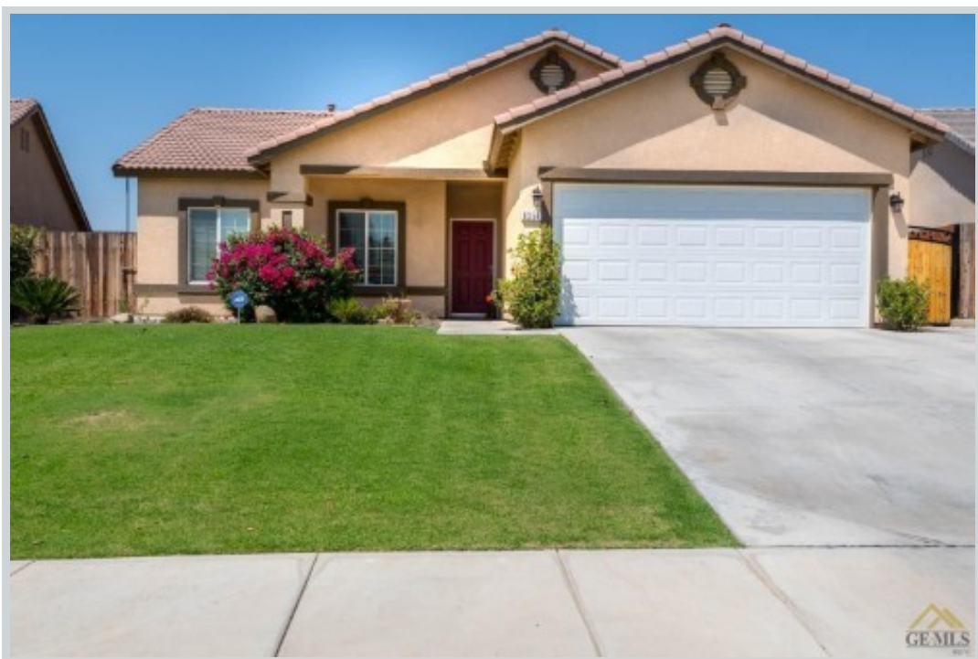
Sold Comp 3 8354 Andromeda Lane