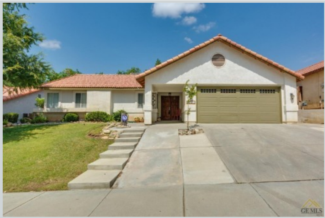
Sold Comp 1 3216 Fortier Street