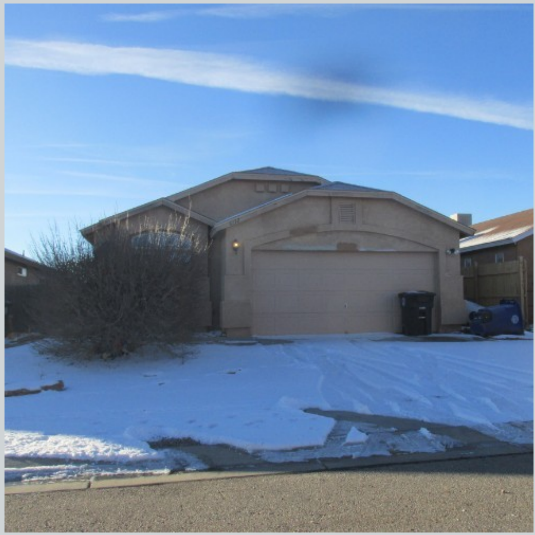
Subject 6112 Cyonus Ave Nw