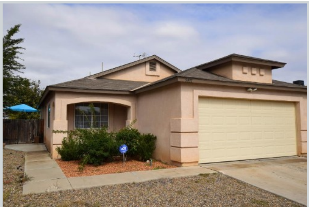
Listing Comp 1 5951 Canis Ave