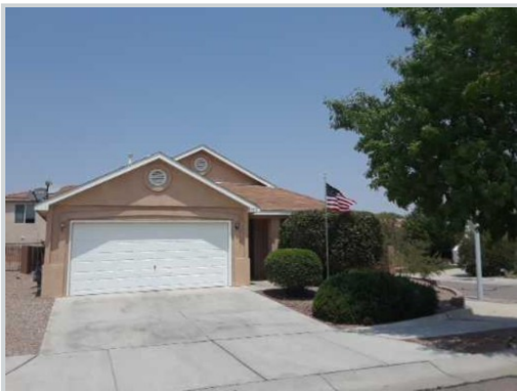
Sold Comp 3 5931 Sleepy Nights Rd