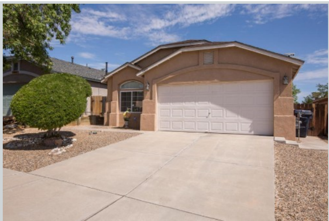
Sold Comp 1 5905 Perseus Ave