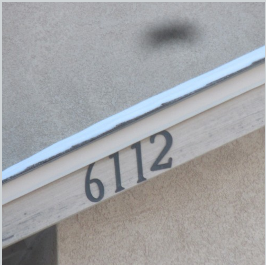
Subject 6112 Cyonus Ave Nw