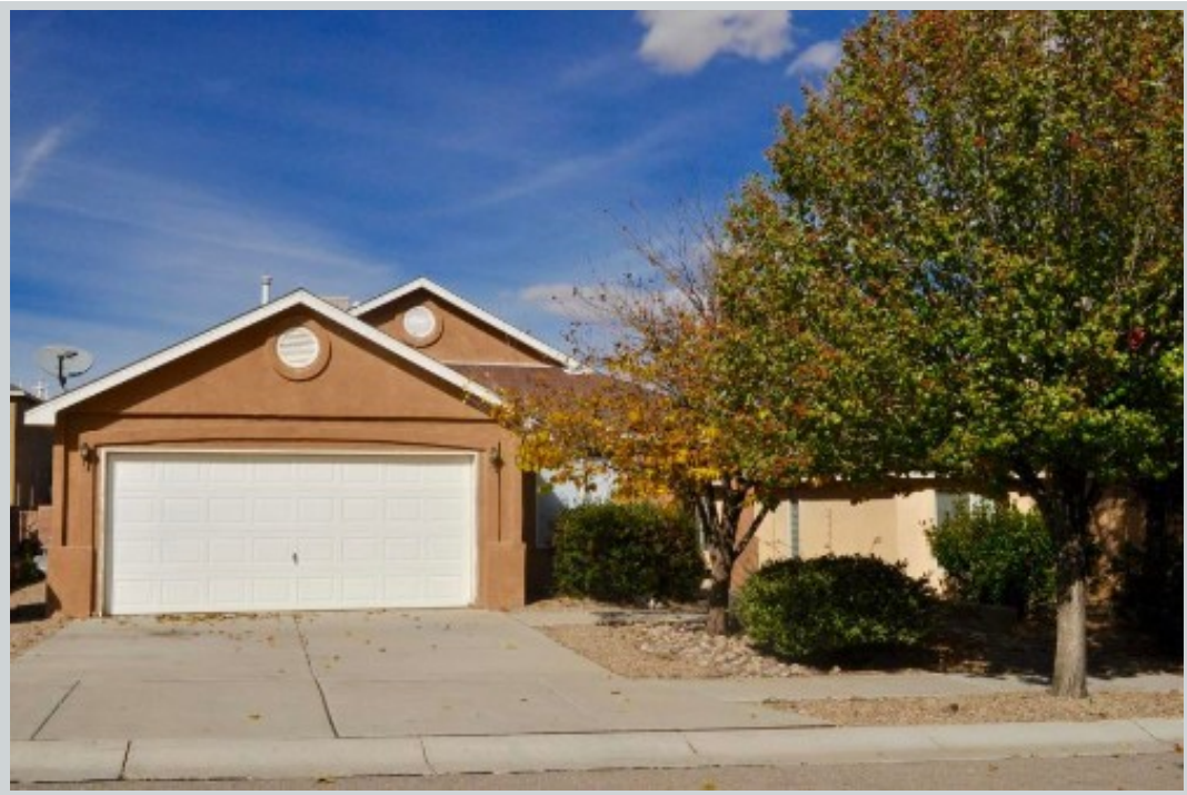
Listing Comp 2 5919 Night Rose Ave