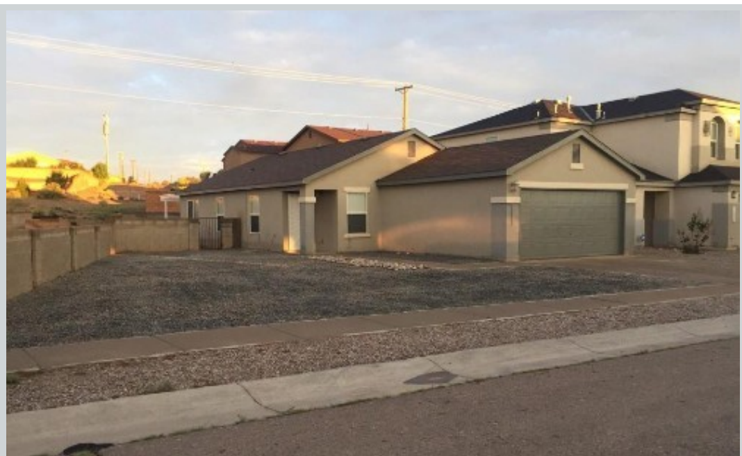
Listing Comp 3 11023 Park North St