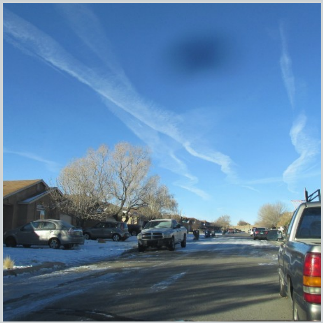
Subject 6112 Cyonus Ave Nw