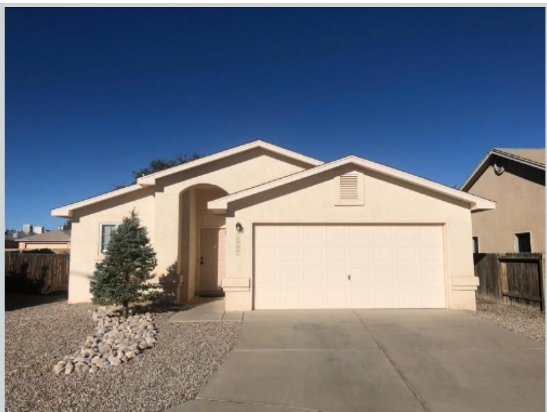
Sold Comp 2 10605 Pisces Ct