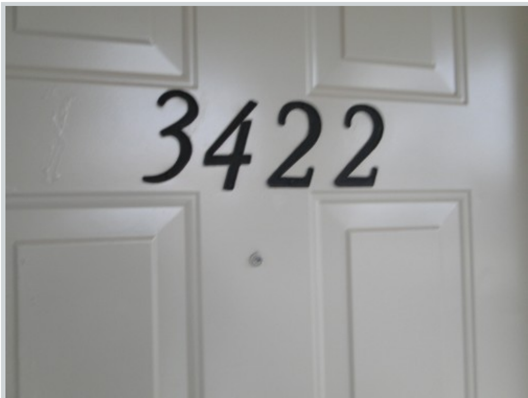
Subject 1575 W Warm Springs Rd Unit 3422