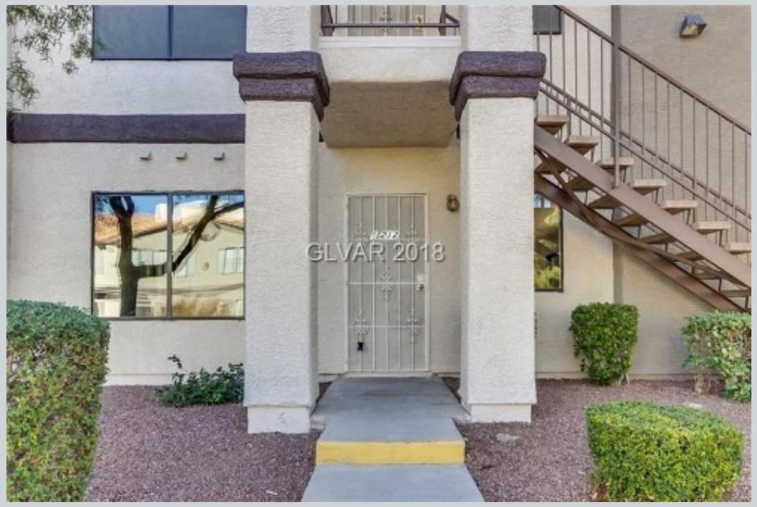
Listing Comp 2