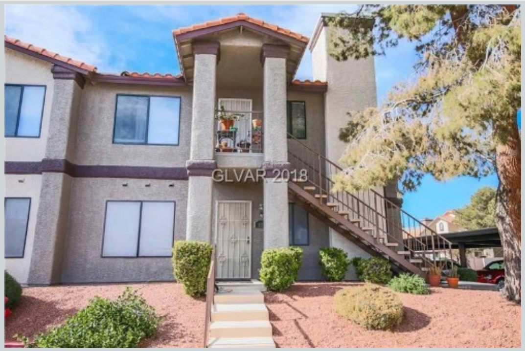
Listing Comp 3