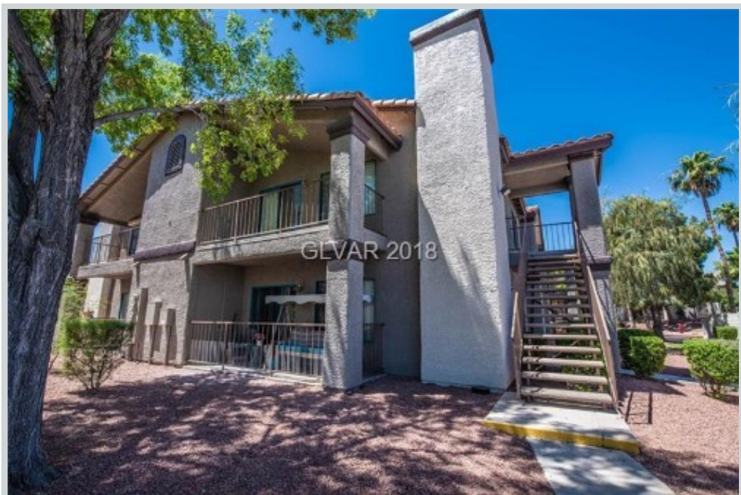
Sold Comp 2