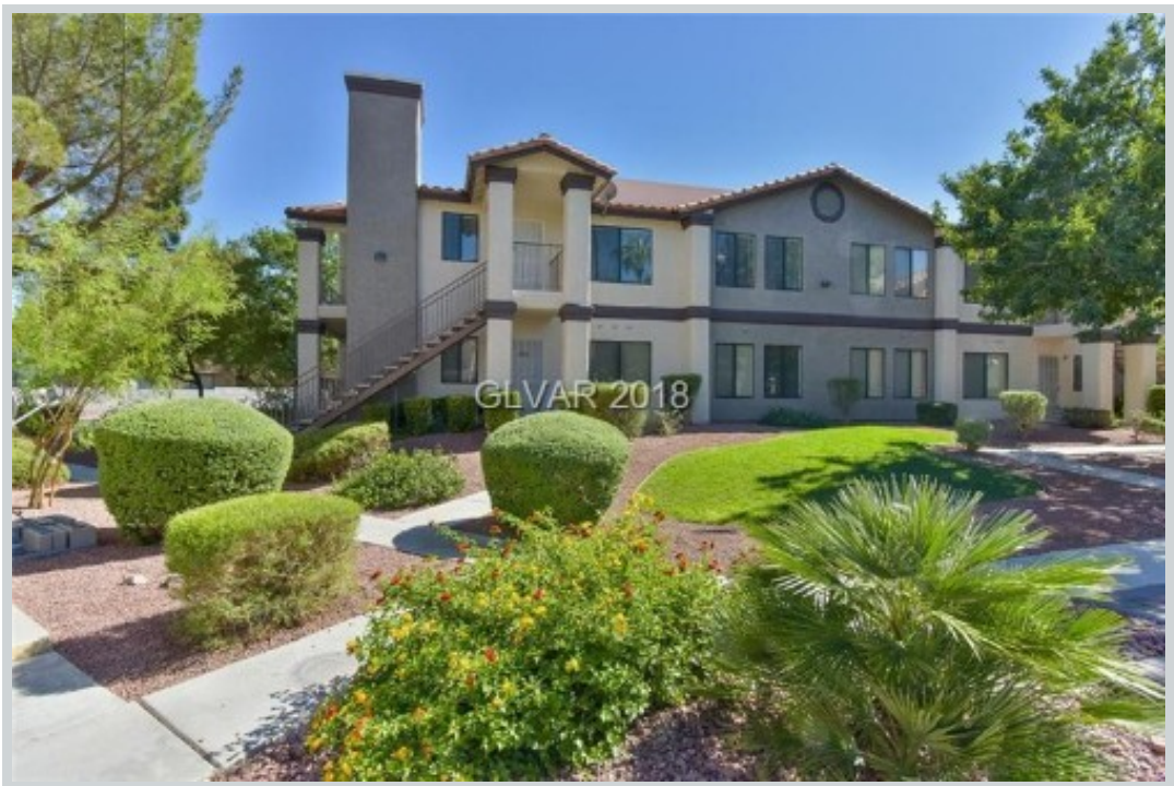
Sold Comp 3