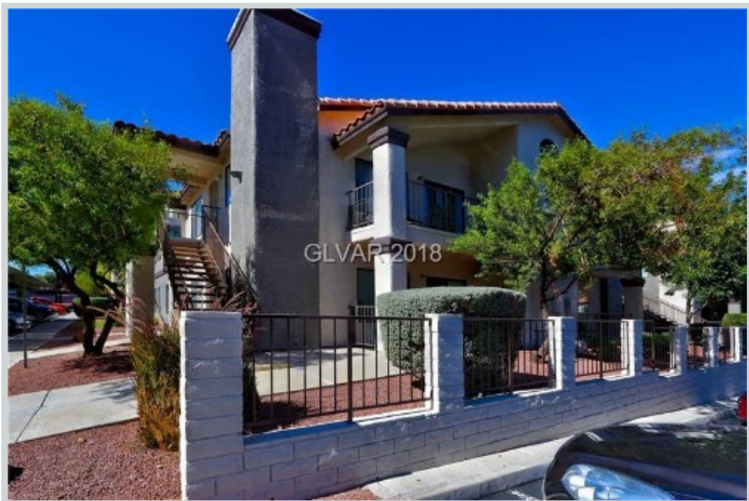
Sold Comp 1

Address 1575 W Warm Springs Road 3422, Henderson, NV 89014 Loan Number 36824 Suggested List $172,000 Suggested Repaired $172,000 Sale $169,000