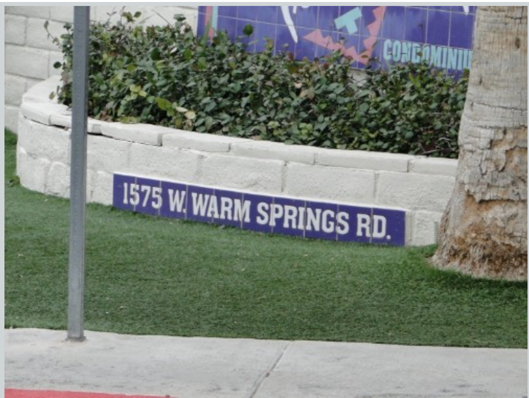
Subject 1575 W Warm Springs Rd Unit 3422