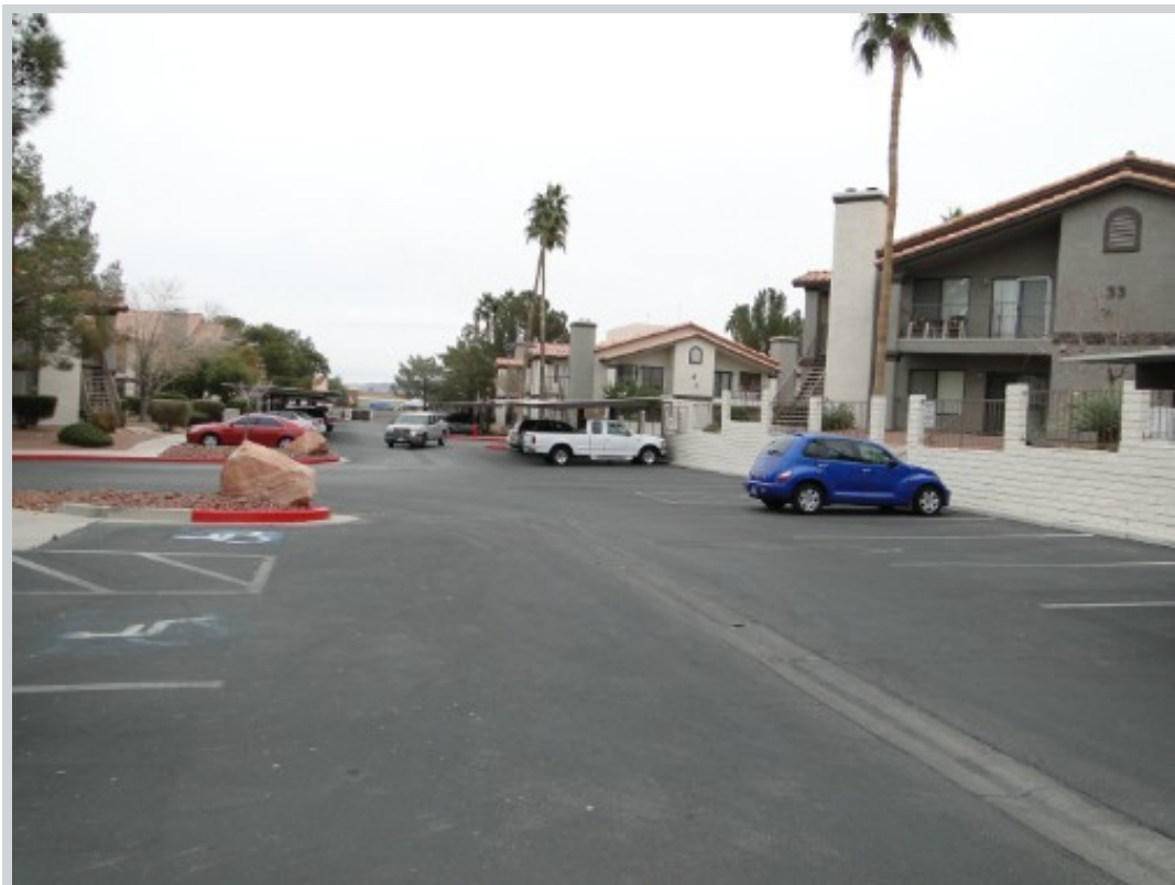
Subject 1575 W Warm Springs Rd Unit 3422