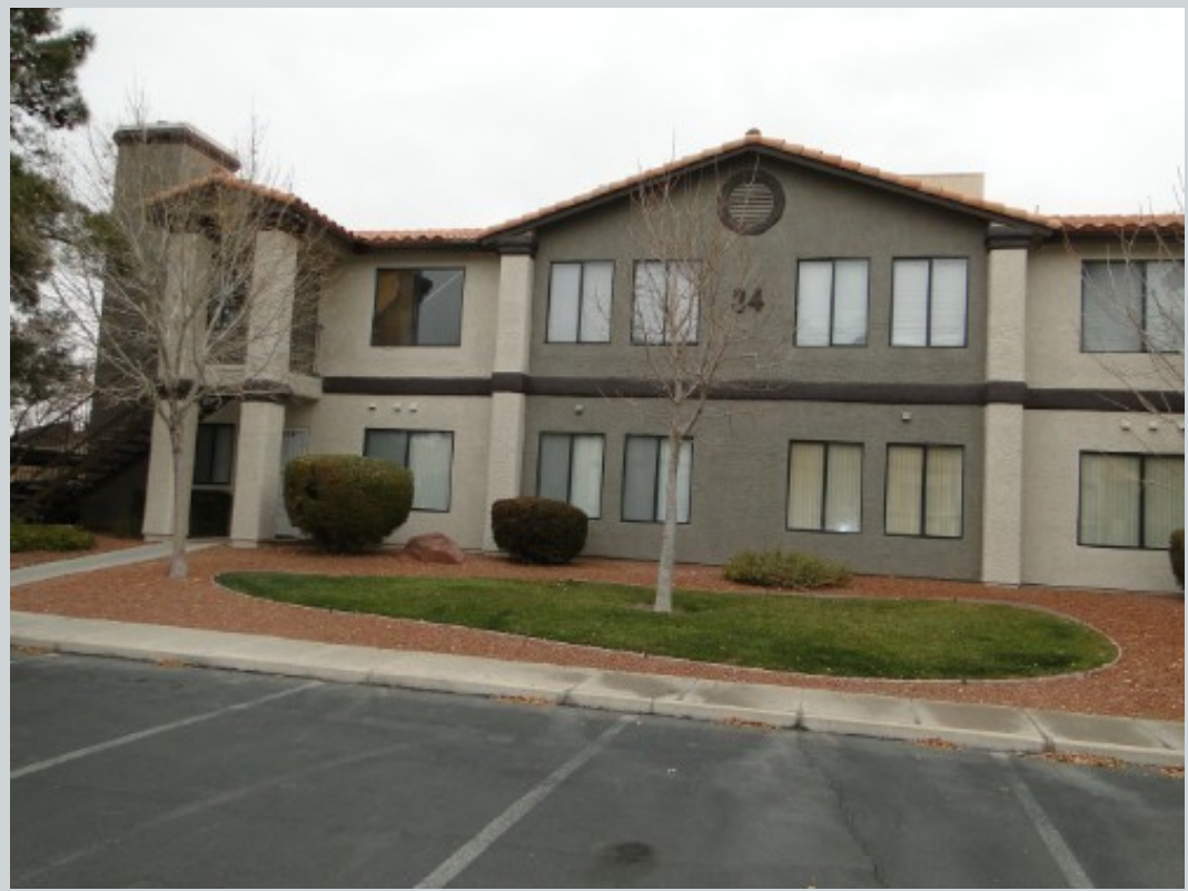
Subject 1575 W Warm Springs Rd Unit 3422