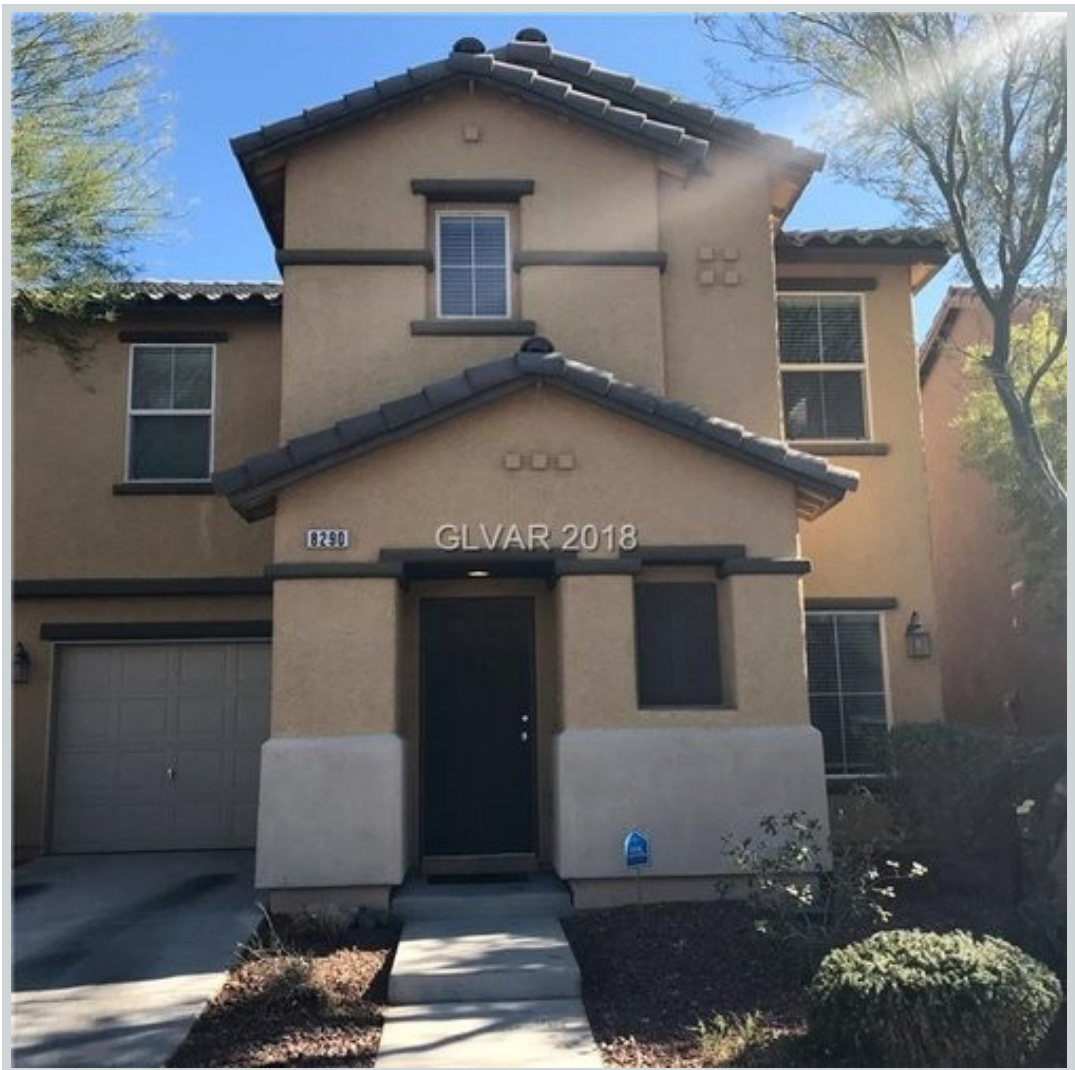
Listing Comp 3 8290 Cullinan Ln