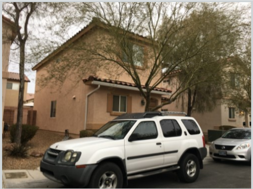
Subject 8379 Pearl Beach Ct