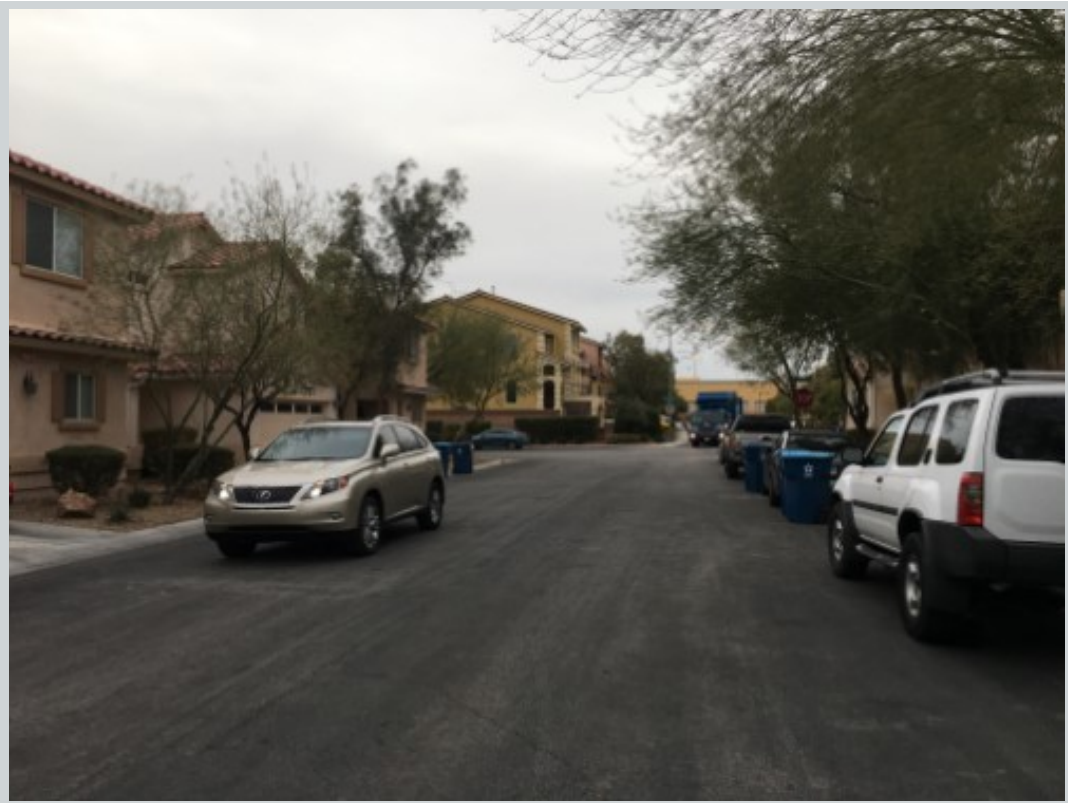
Subject 8379 Pearl Beach Ct