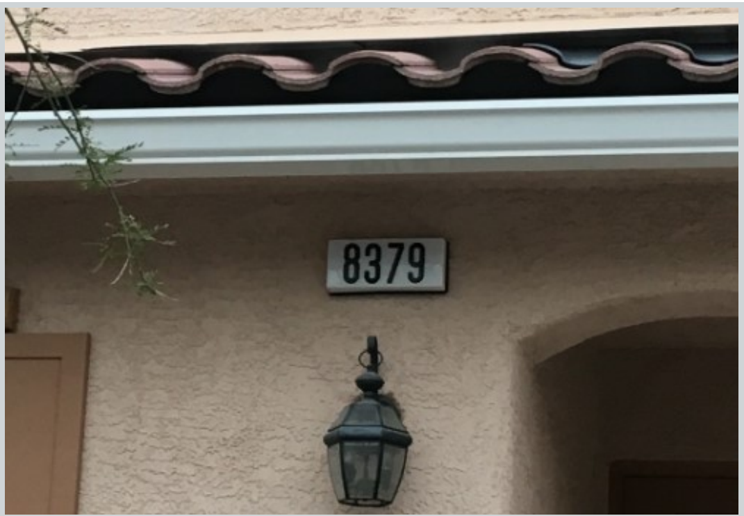
Subject 8379 Pearl Beach Ct