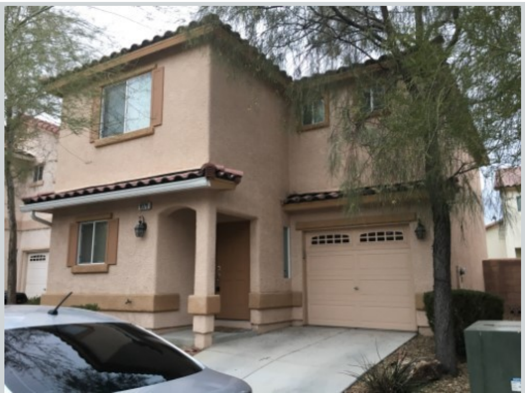
Subject 8379 Pearl Beach Ct