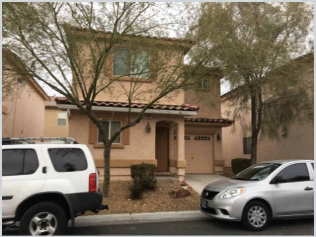
Subject 8379 Pearl Beach Ct