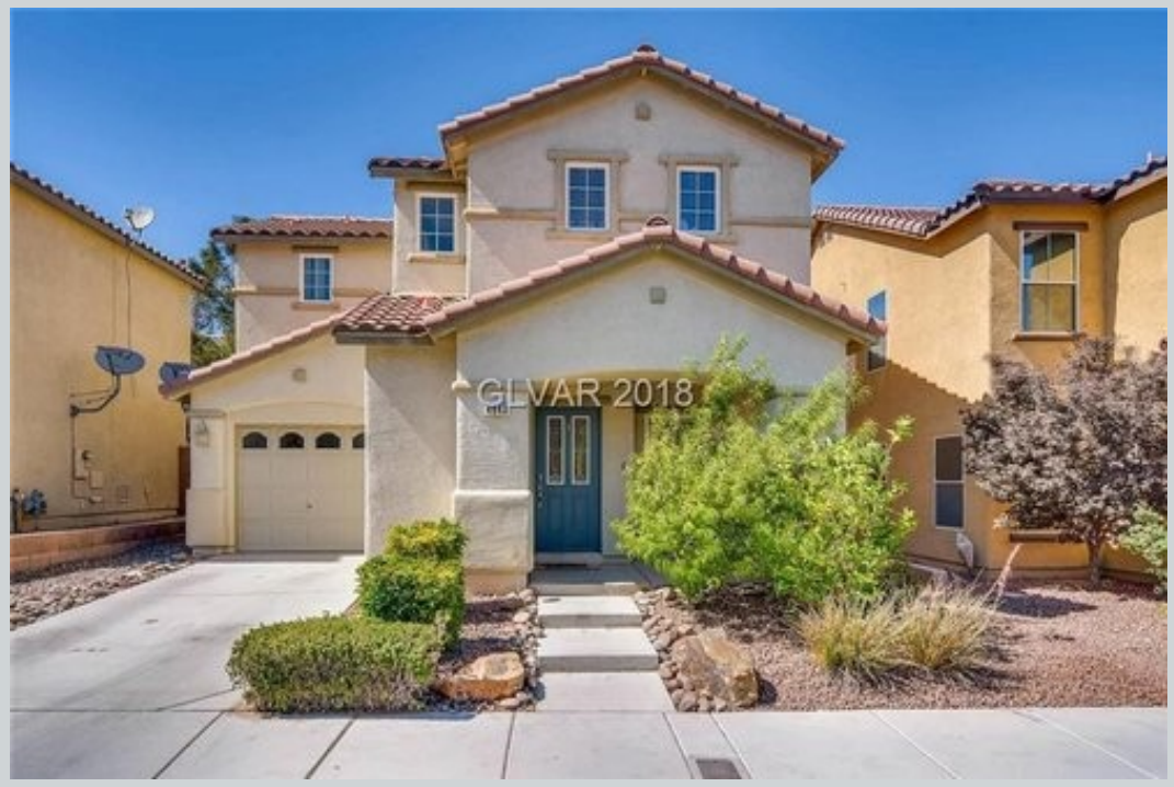
Sold Comp 1 4840 W Shelbourne Ave