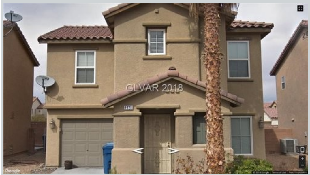
Listing Comp 2 4820 Golden Shimmer Ave