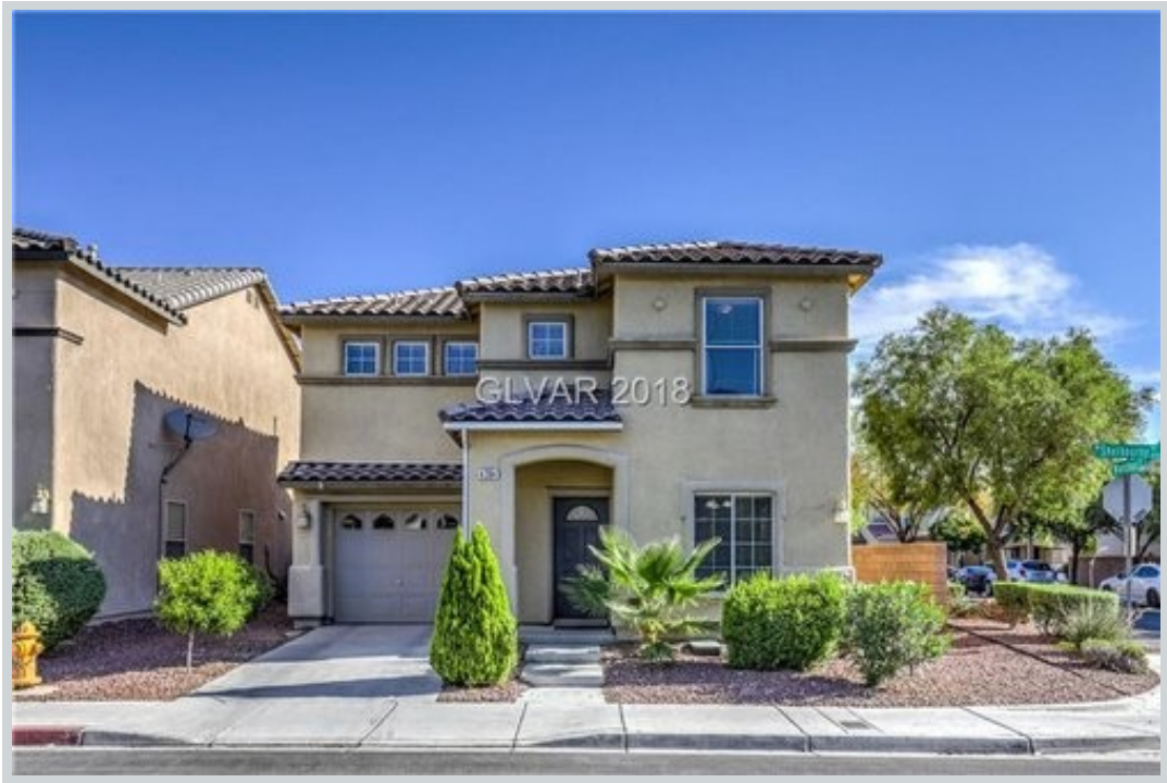
Sold Comp 3 4784 W Shelbourne Ave