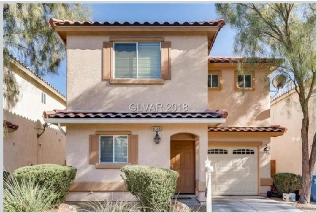
Listing Comp 1 8366 Pearl Beach Ct