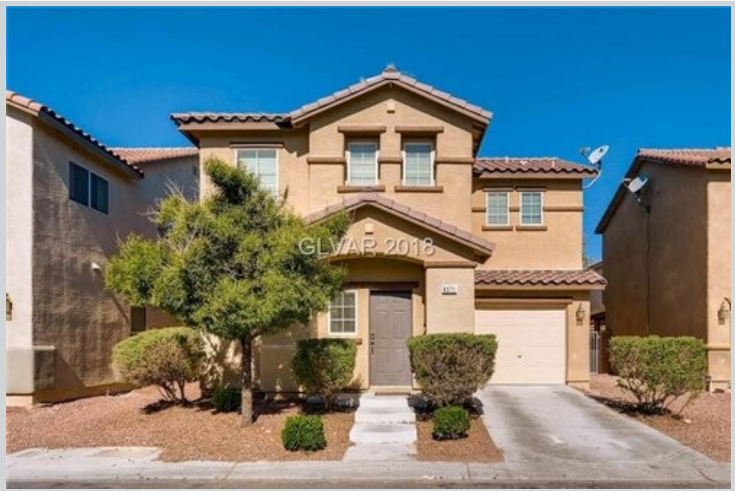
Sold Comp 2 8371 Golden Amber St