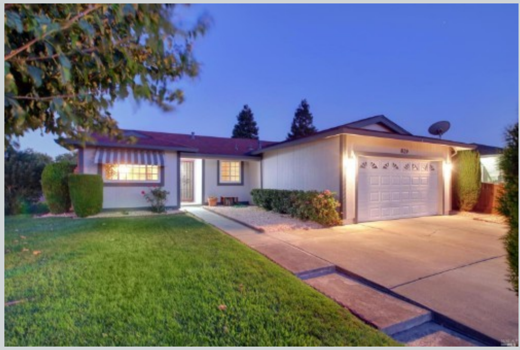
Sold Comp 2 829 Tree Duck