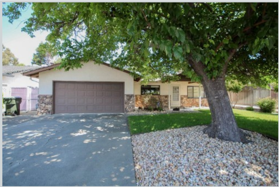
Sold Comp 3 504 Avalon