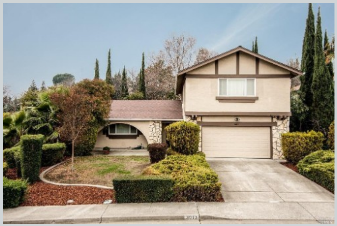
Listing Comp 3 3013 Chestnut