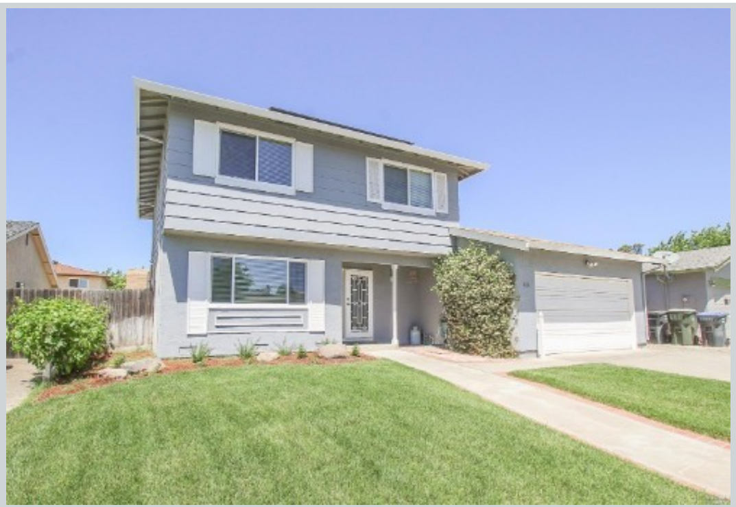
Sold Comp 1 826 Scaup