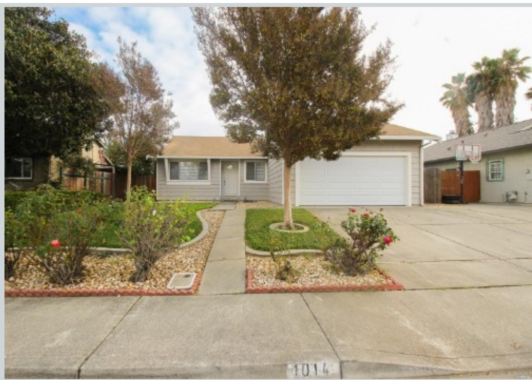
Listing Comp 2 1014 Westwind