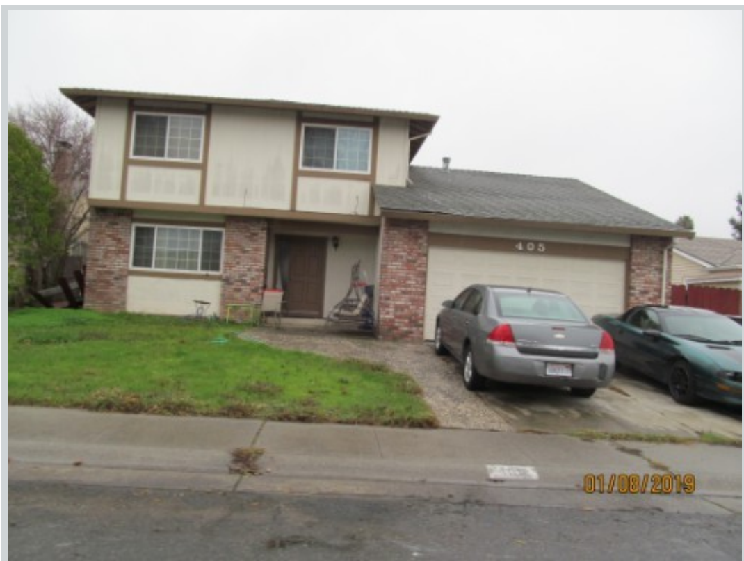
Subject 405 Shoveller Dr