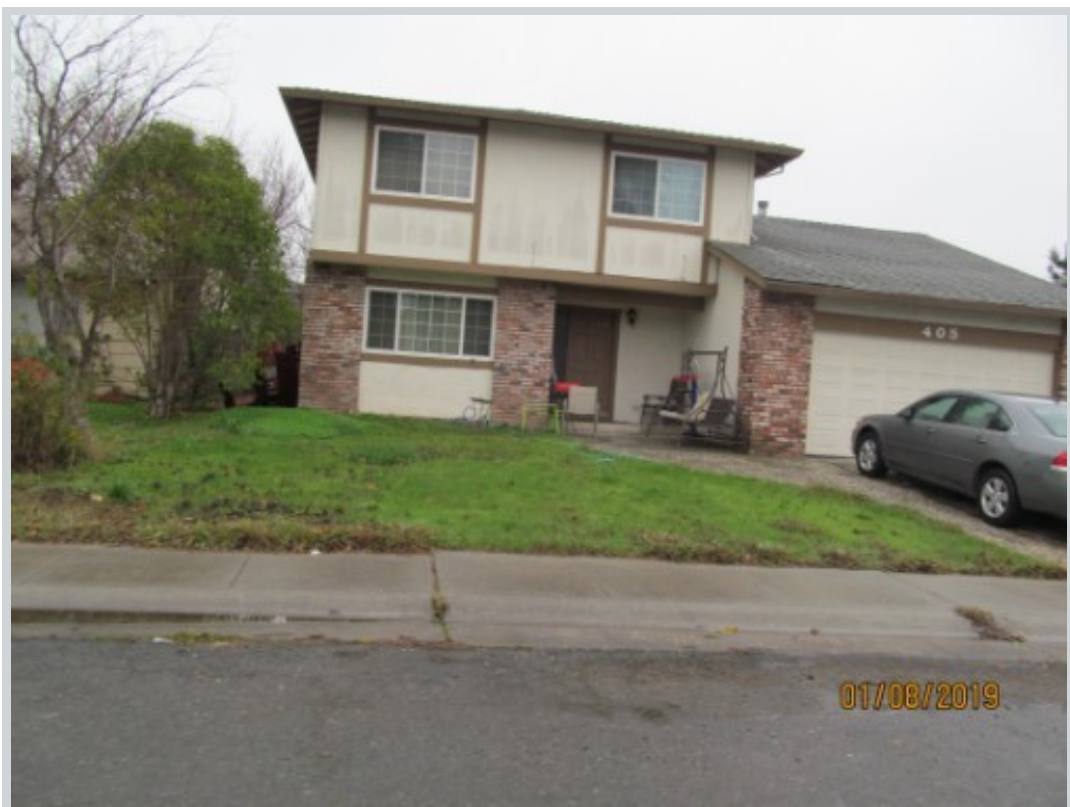
Subject 405 Shoveller Dr