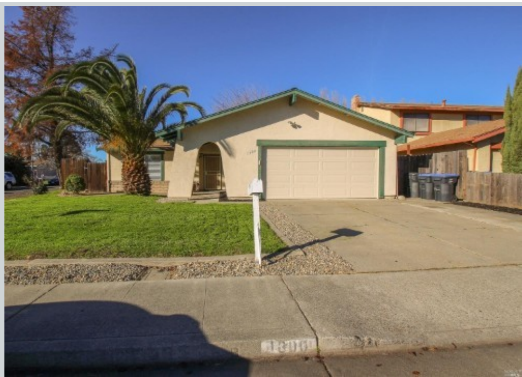
Listing Comp 1 1300 Humphrey