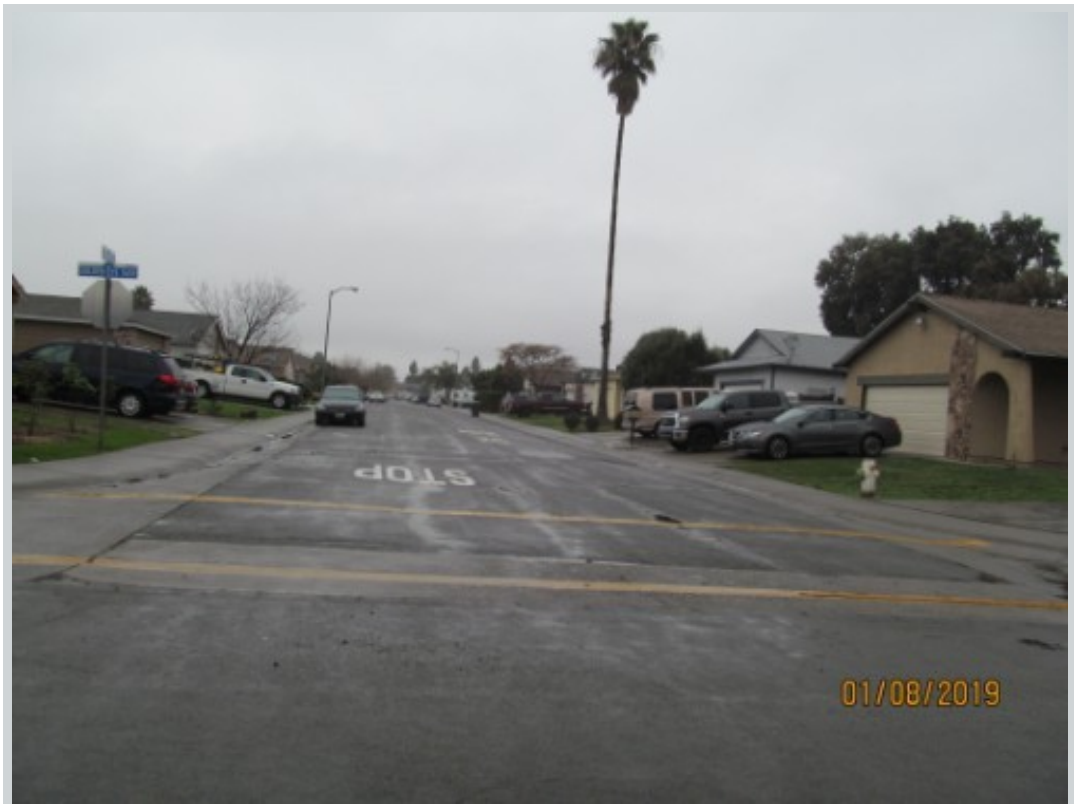
Subject 405 Shoveller Dr