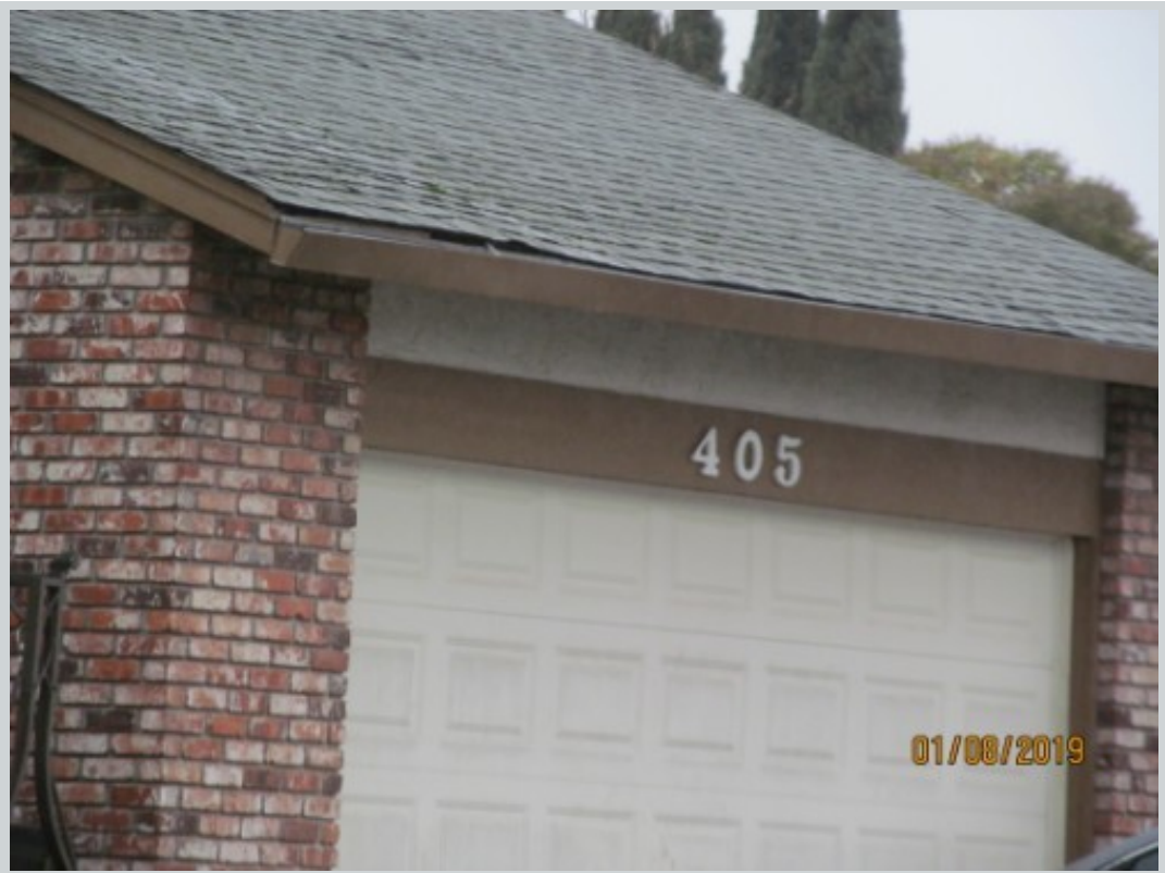
Subject 405 Shoveller Dr