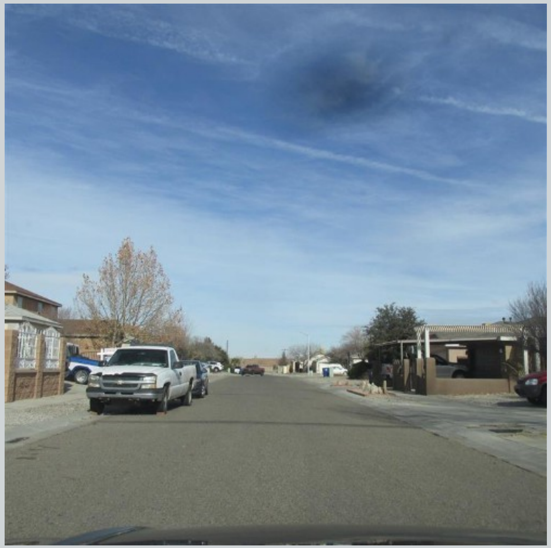
Subject 443 Barberry St Sw