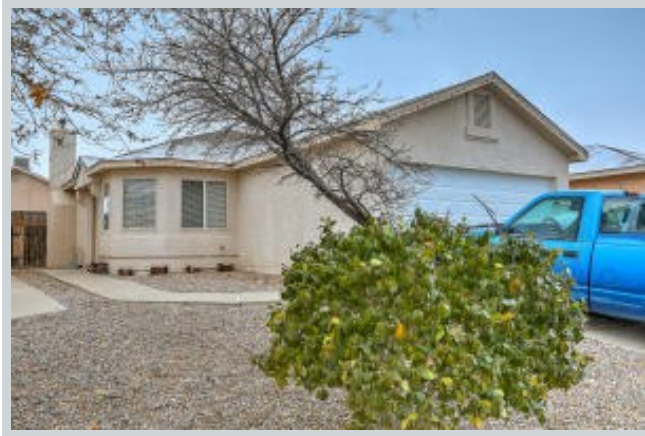
Listing Comp 2 223 San Tomas Ln View Front