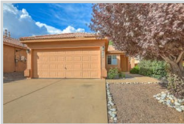
Listing Comp 3 7431 Via Tranquilo View Front