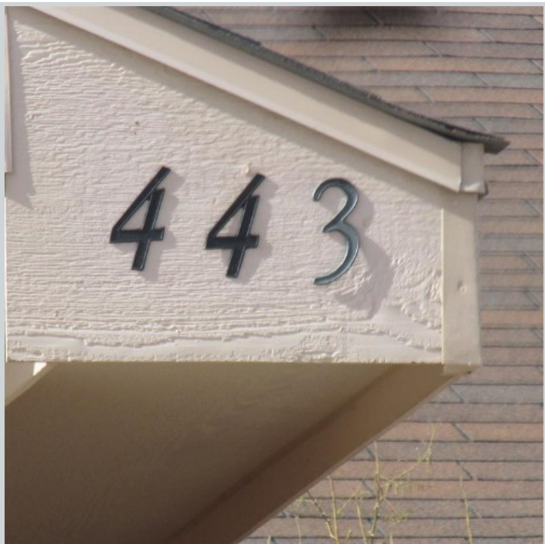
Subject 443 Barberry St Sw