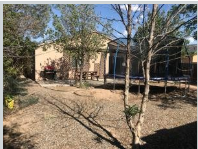
Sold Comp 1 527 Whisper Pointe St View Front