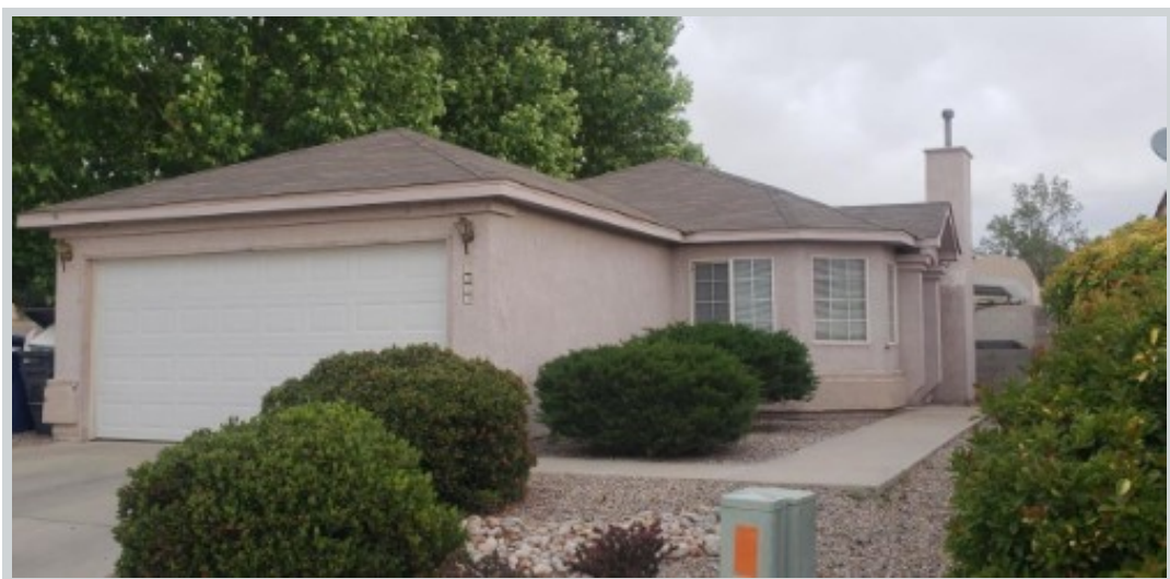
Sold Comp 3 8519 Vista Chamisa Ln