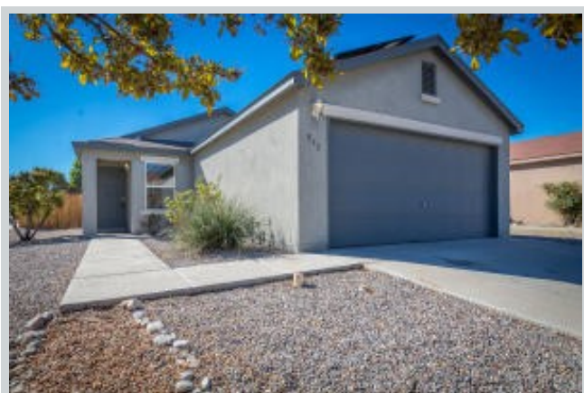
Sold Comp 2 543 Cole Spring Dr View Front