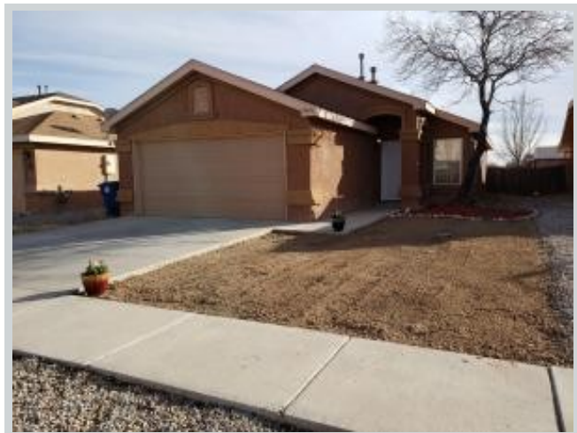
Listing Comp 1 8016 Greythorn Rd