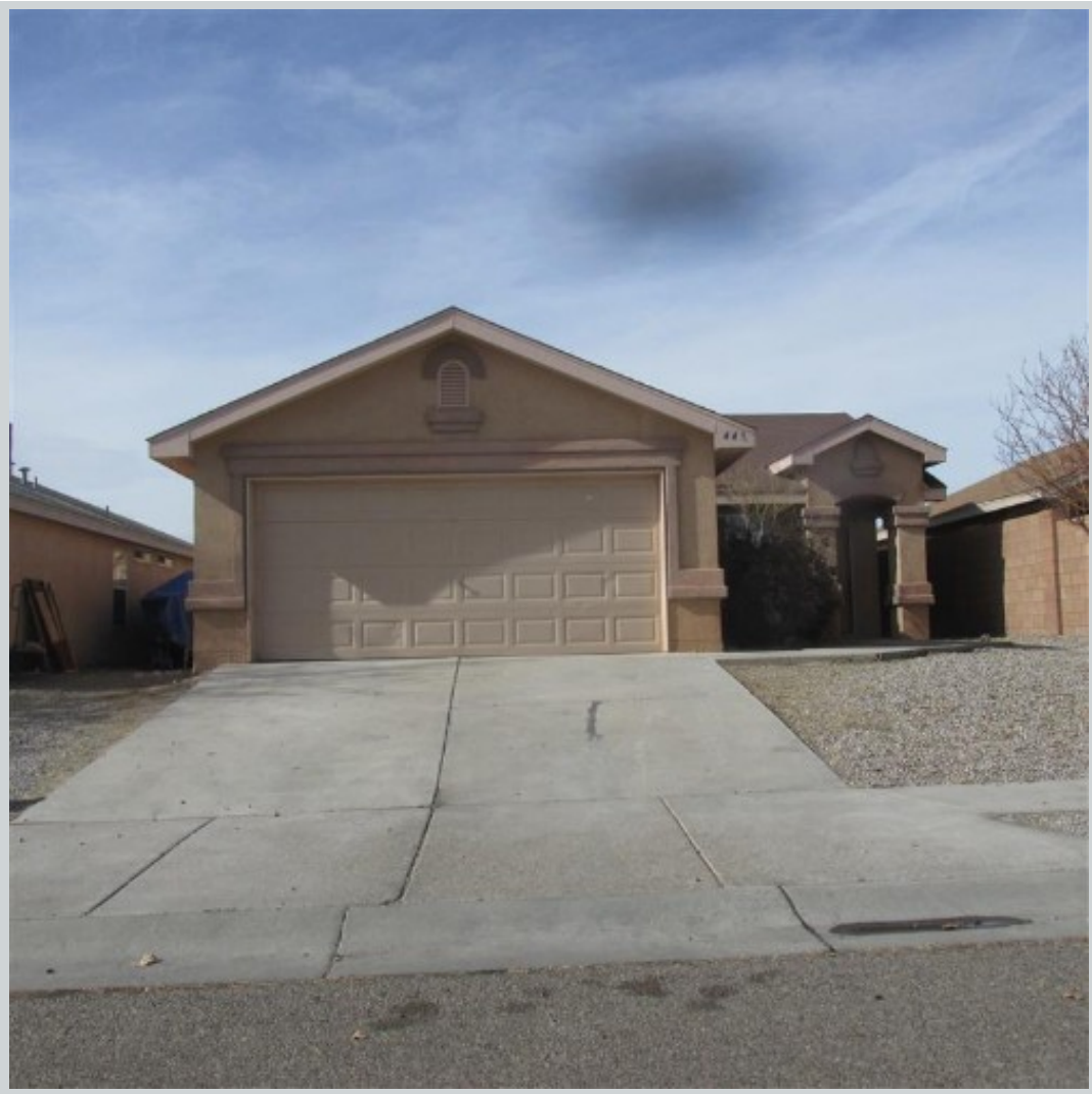
Subject 443 Barberry St Sw