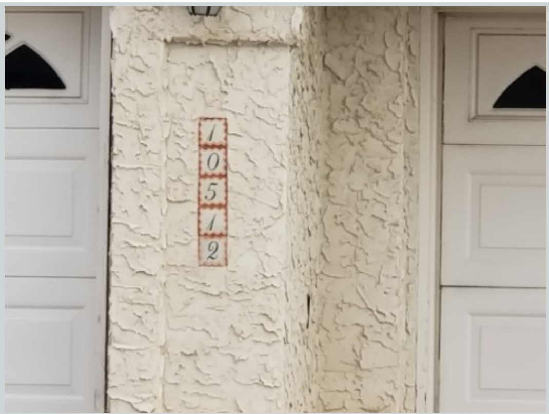
Subject 10512 Espira Ct Nw