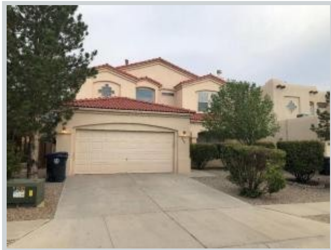
Listing Comp 3 4020 Arapahoe Avenue View Front