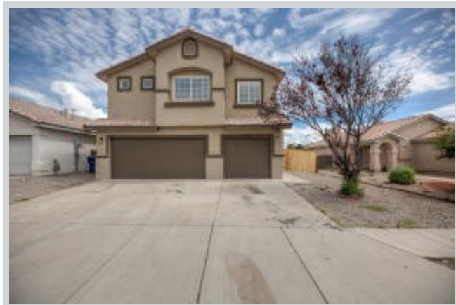
Sold Comp 2 10312 Amatista Street View Front