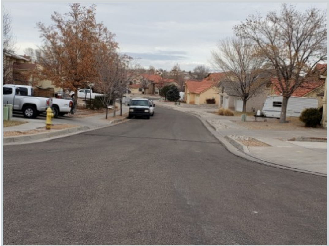
Subject 10512 Espira Ct Nw