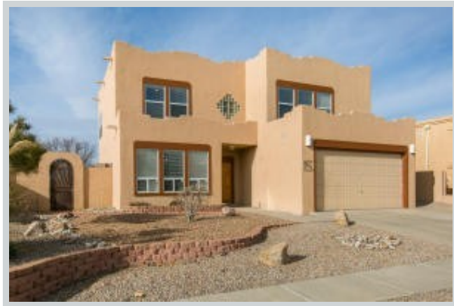
Sold Comp 1 4005 Rayado Place View Front