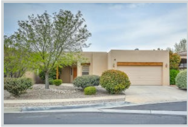
Sold Comp 3 4116 Whistler Avenue View Front