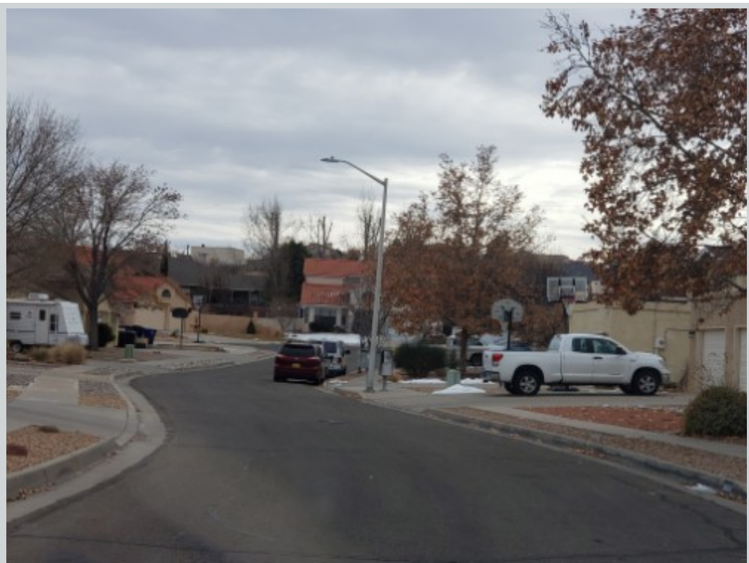
Subject 10512 Espira Ct Nw