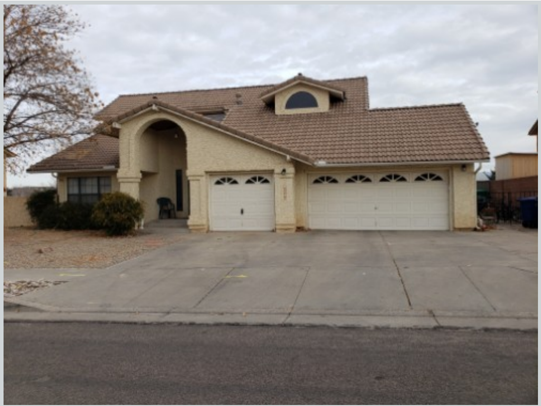
Subject 10512 Espira Ct Nw