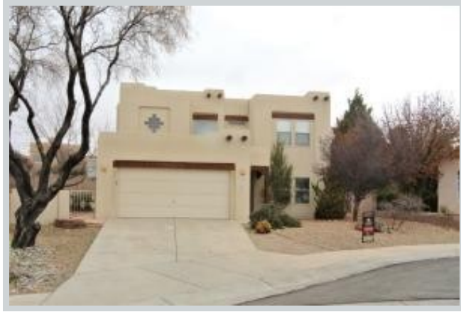
Listing Comp 2 4401 Campo De Maiz Road View Front