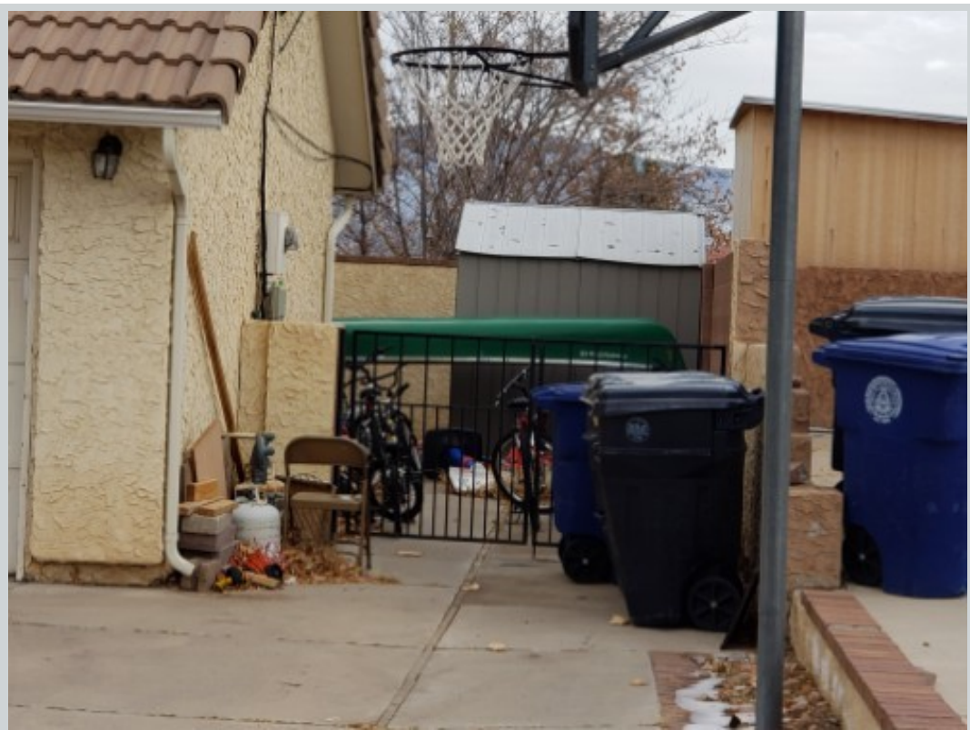
Subject 10512 Espira Ct Nw

Address 10512 Espira Court Nw, Albuquerque, NM 87114 Loan Number 36844 Suggested List $245,000 Suggested Repaired $245,000 Sale $240,000