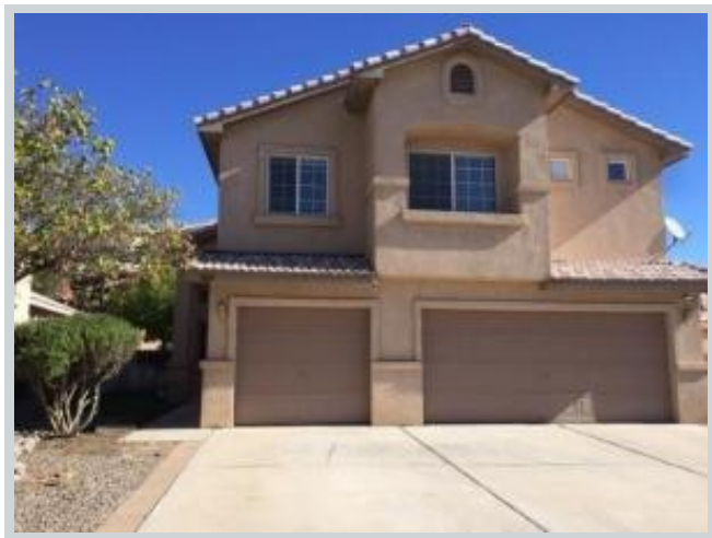
Listing Comp 1 4401 Barrett Avenue