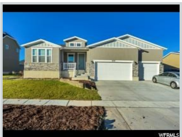
Sold Comp 3 6037 Elizabeth View Other

Address 5520 Windsor Way, Stansbury Park, UT 84074 Loan Number 36847 Suggested List $330,000 Suggested Repaired $330,000 Sale $330,000