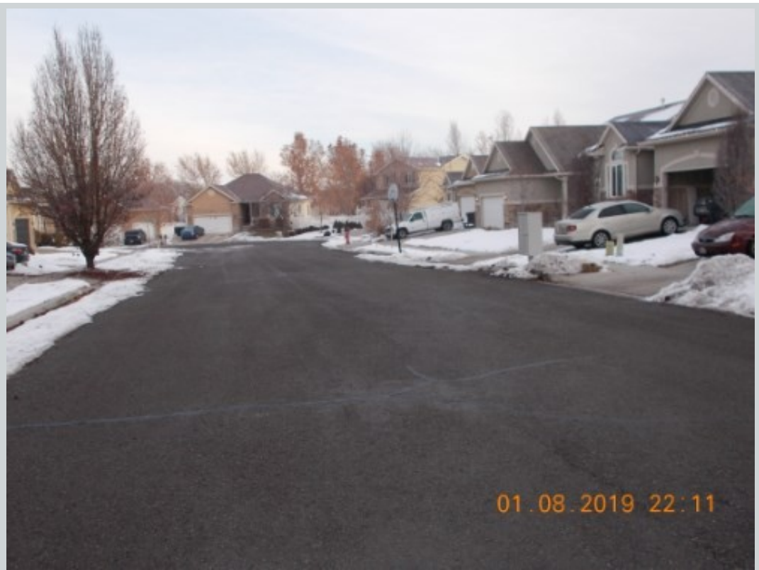
Subject 5520 Windsor Way