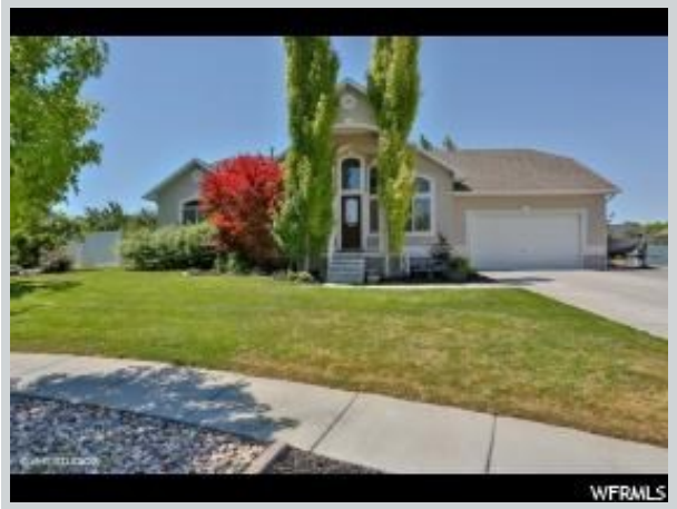
Sold Comp 1 6041 Windlass View Other