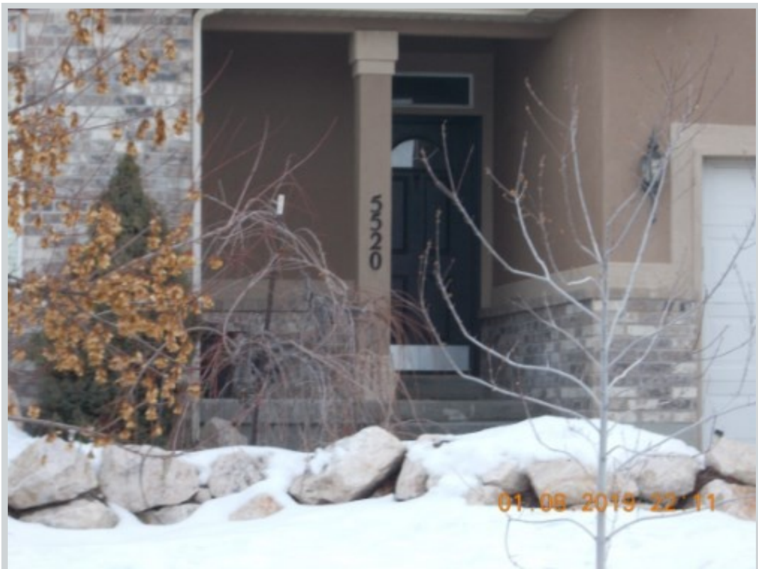
Subject 5520 Windsor Way