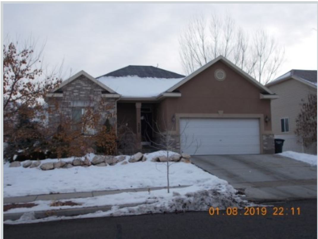
Subject 5520 Windsor Way