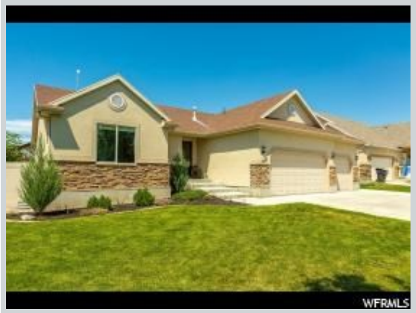
Sold Comp 2 313 Warley View Other