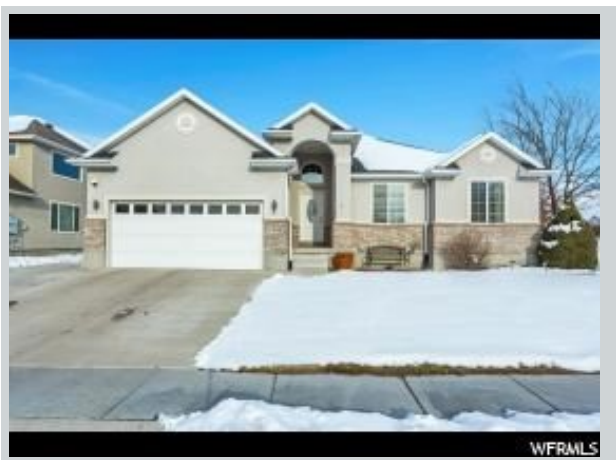
Listing Comp 3 5770 Lighthouse View Other