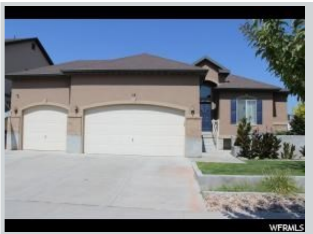
Listing Comp 2 15 Clearwater View Other

Address 5520 Windsor Way, Stansbury Park, UT 84074 Loan Number 36847 Suggested List $330,000 Suggested Repaired $330,000 Sale $330,000