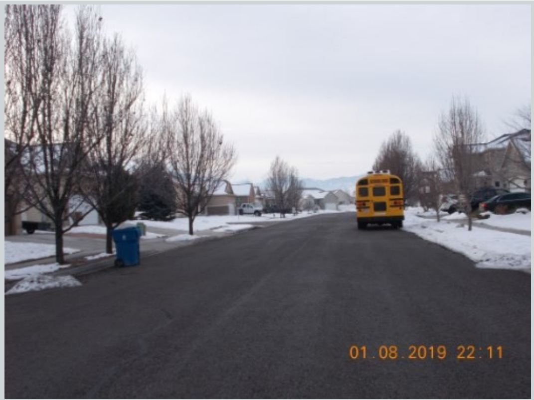
Subject 5520 Windsor Way