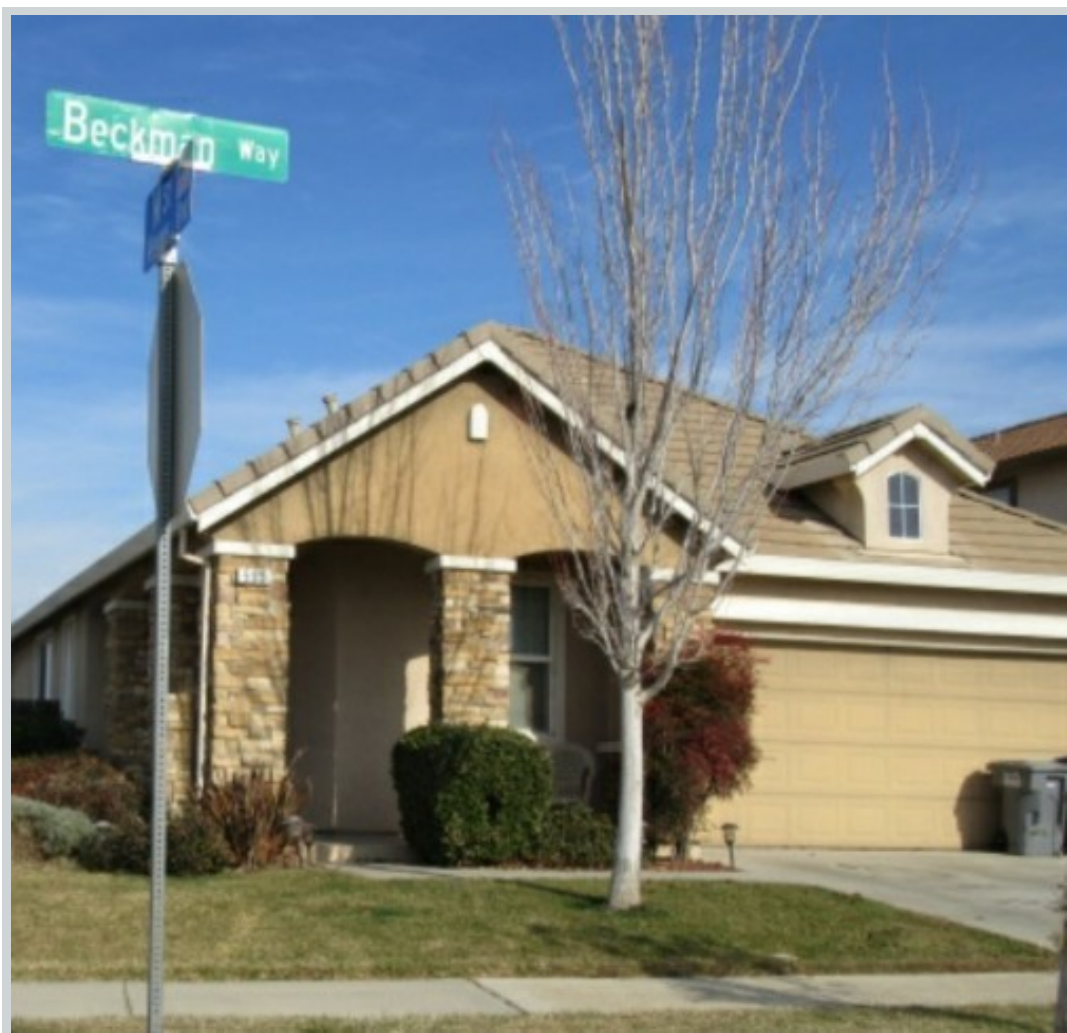
Subject 595 Beckman Way