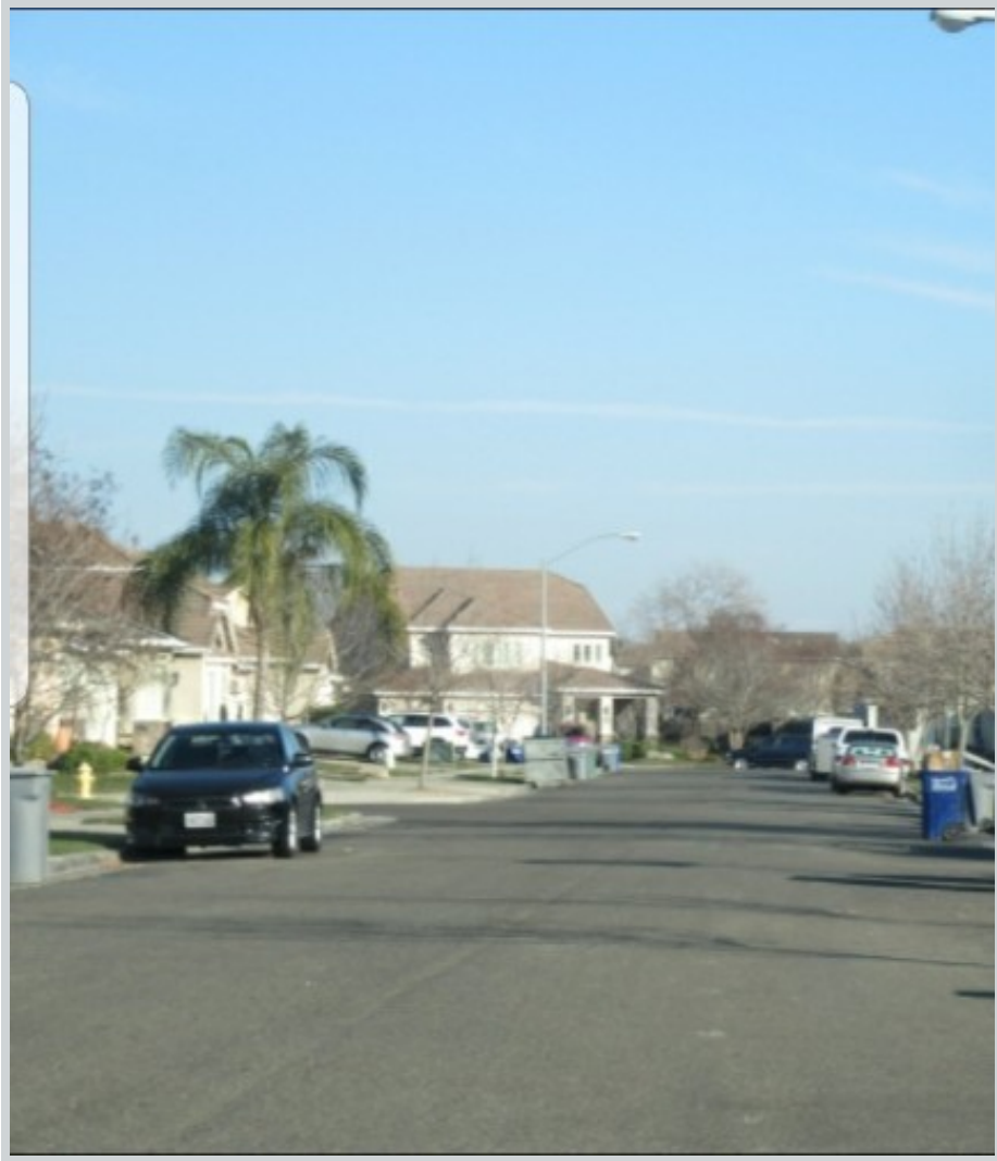
Subject 595 Beckman Way