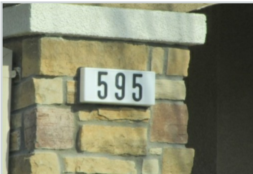
Subject 595 Beckman Way