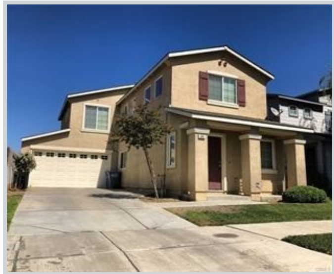
Listing Comp 1