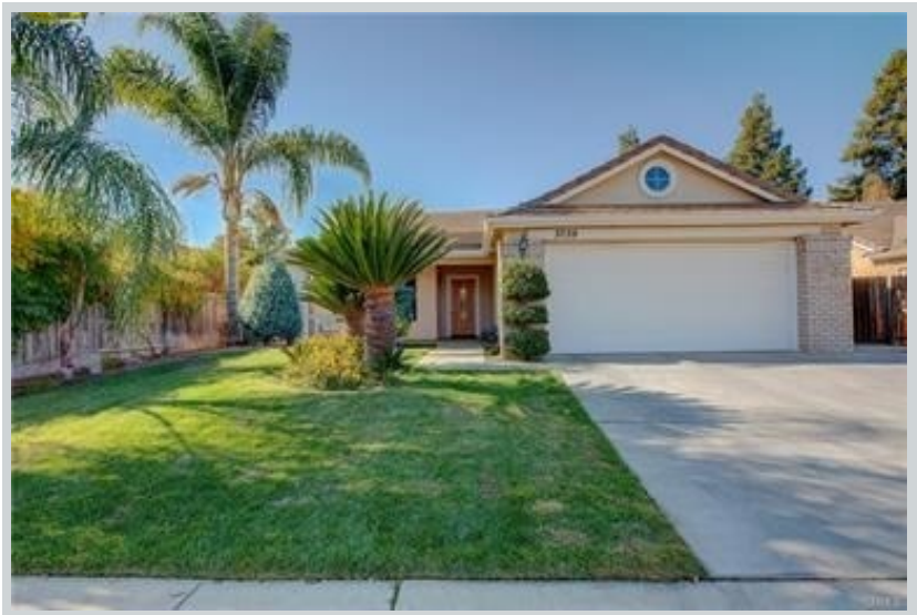
Listing Comp 3