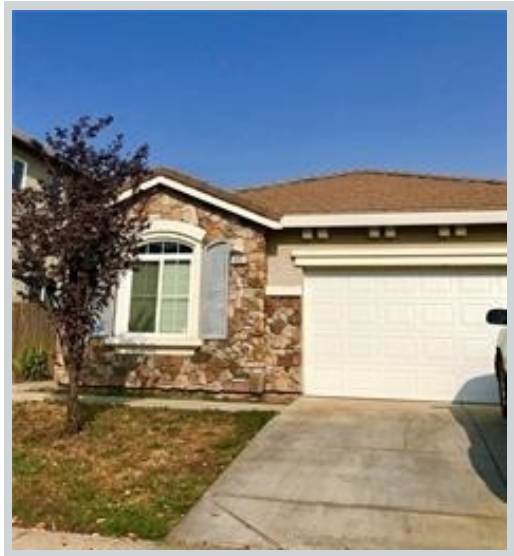
Listing Comp 2