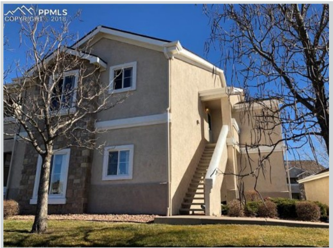
Sold Comp 3 3650 Strawberry Field Grove F View Front