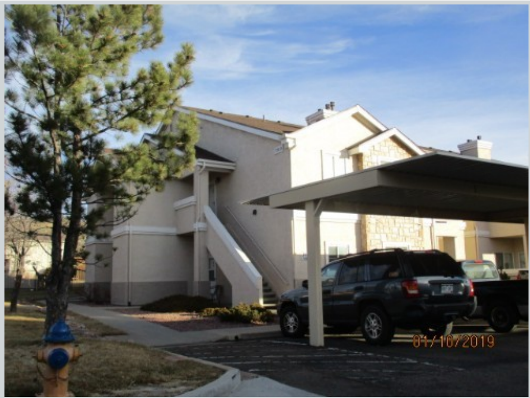
Subject 3910 Strawberry Field Grv Apt C

Address 3910 Strawberry Field Grove C, Colorado Springs, COLORADO 80906 Loan Number 36863 Suggested List $215,000 Suggested Repaired $215,000 Sale $205,000