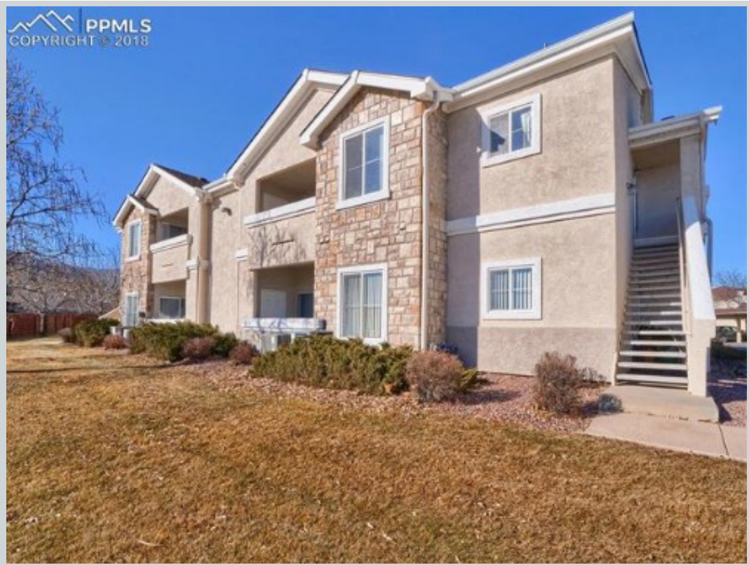
Listing Comp 3 3750 Strawberry Field Grove F

Address 3910 Strawberry Field Grove C, Colorado Springs, COLORADO 80906 Loan Number 36863 Suggested List $215,000 Suggested Repaired $215,000 Sale $205,000