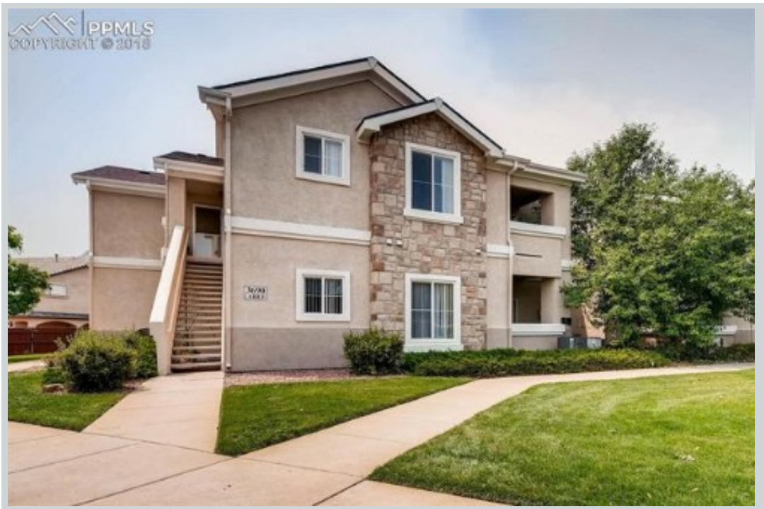
Sold Comp 2 3690 Strawberry Field Grove F View Front

Address 3910 Strawberry Field Grove C, Colorado Springs, COLORADO 80906 Loan Number 36863 Suggested List $215,000 Suggested Repaired $215,000 Sale $205,000