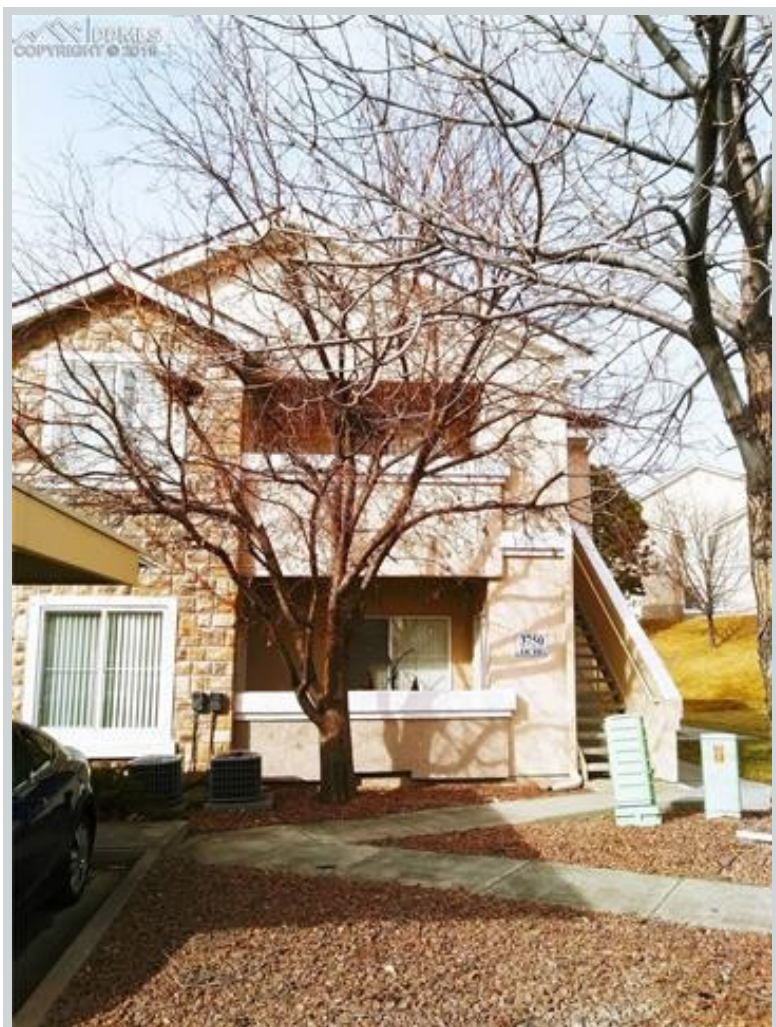
Listing Comp 1 3750 Penny Point Dr View Front

Address 3910 Strawberry Field Grove C, Colorado Springs, COLORADO 80906 Loan Number 36863 Suggested List $215,000 Suggested Repaired $215,000 Sale $205,000