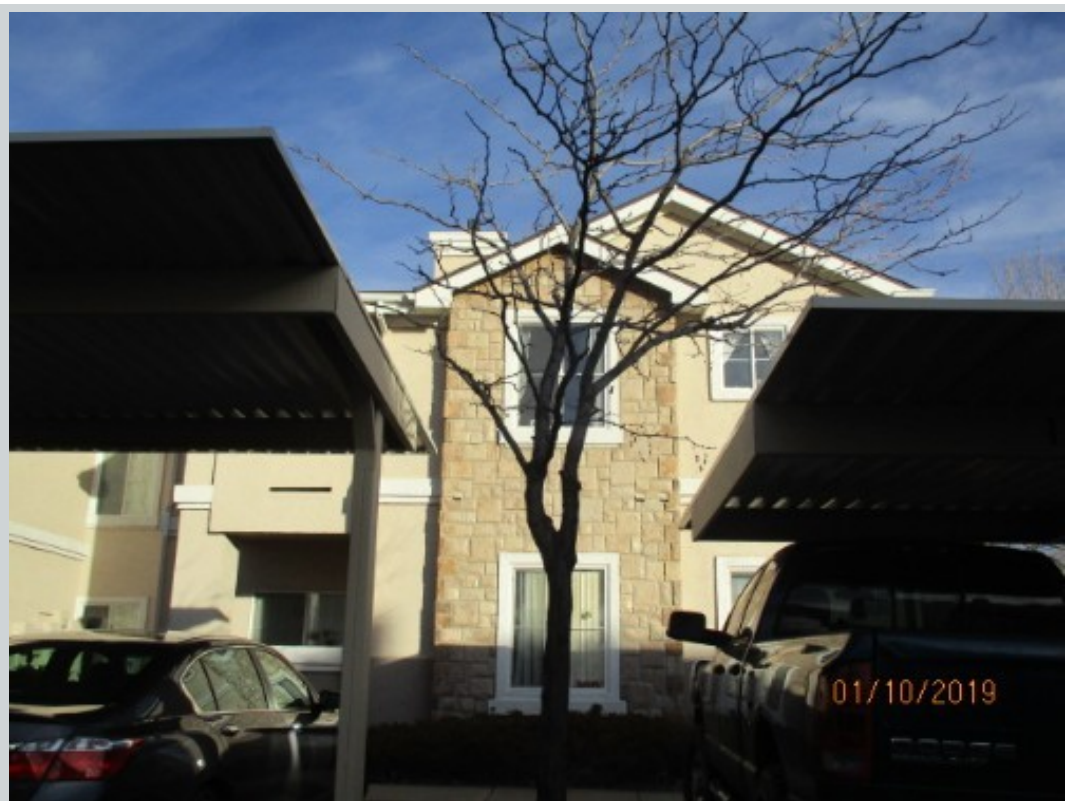
Subject 3910 Strawberry Field Grv Apt C View Front

Address 3910 Strawberry Field Grove C, Colorado Springs, COLORADO 80906 Loan Number 36863 Suggested List $215,000 Suggested Repaired $215,000 Sale $205,000