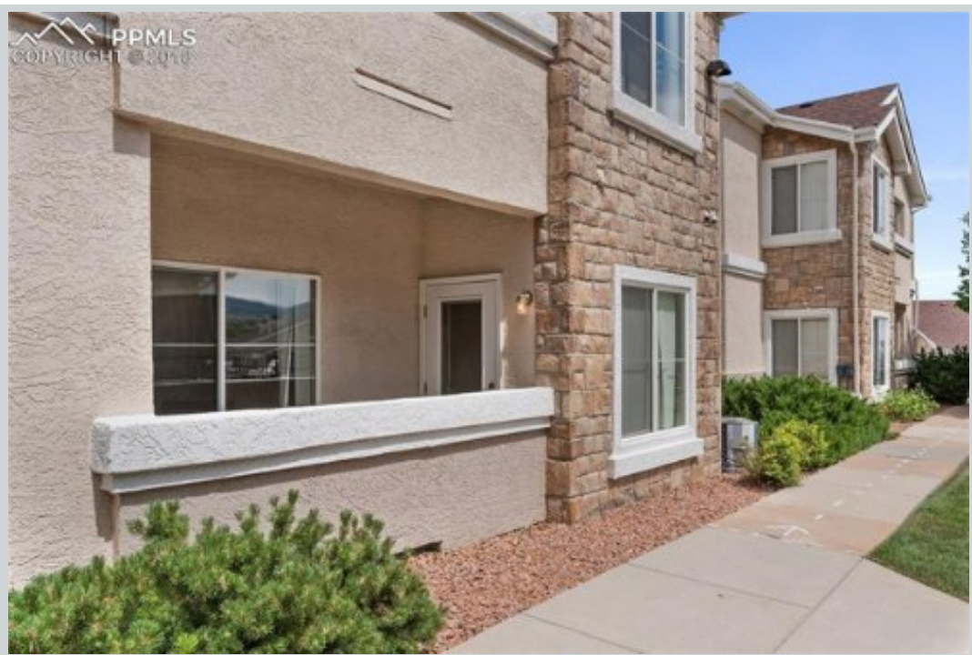
Sold Comp 1 3895 Strawberry Field Grove A