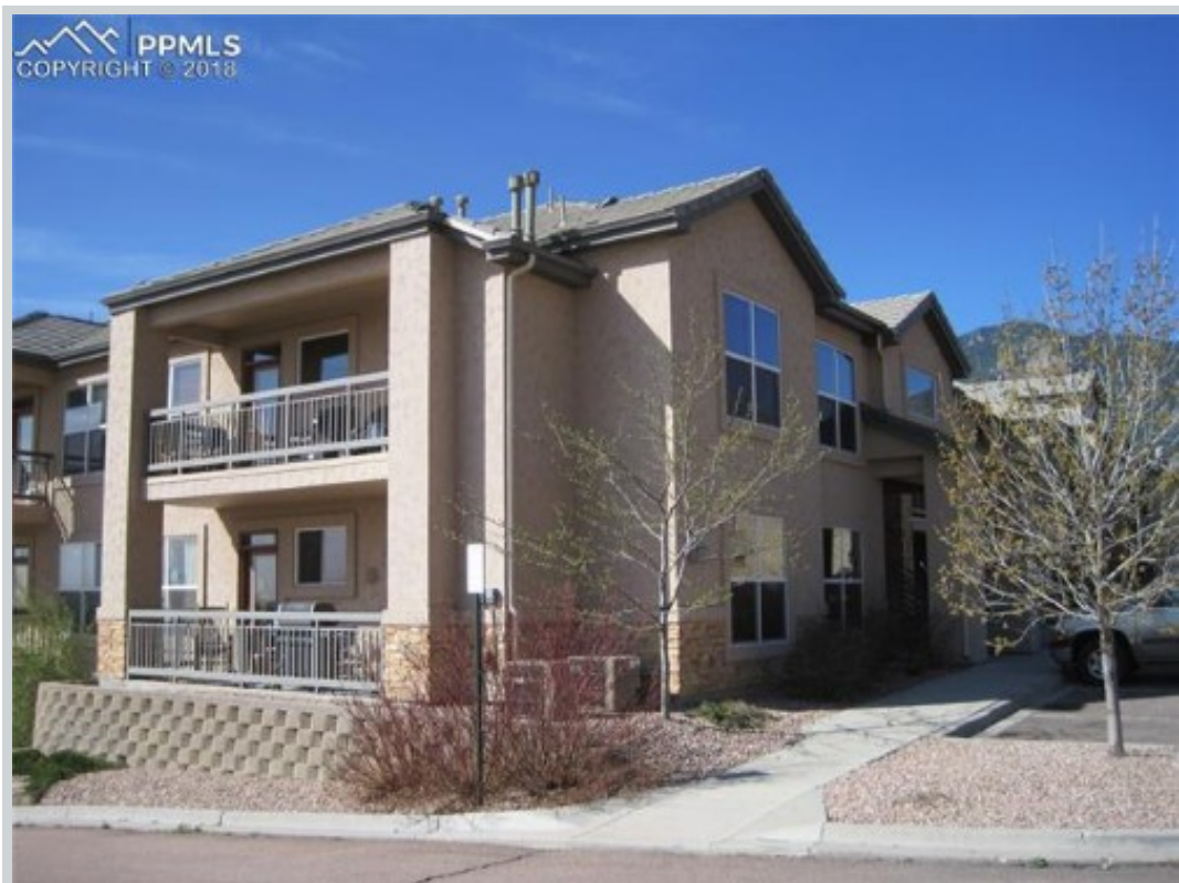
Listing Comp 2 605 Cougar Bluff Point 109 View Front