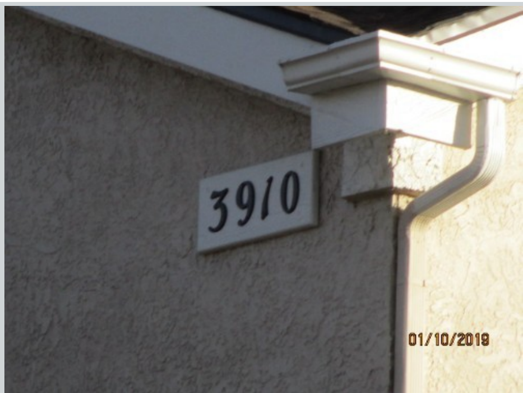
Subject 3910 Strawberry Field Grv Apt C View Address Verification