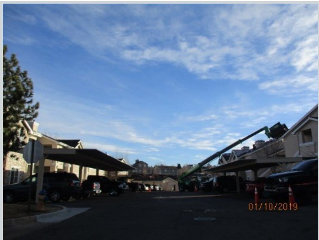
Subject 3910 Strawberry Field Grv Apt C