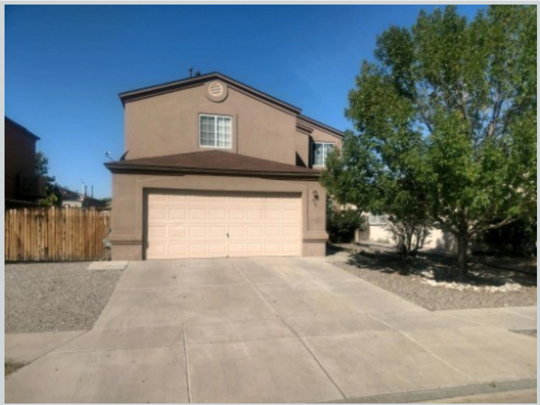
Listing Comp 3 519 Whispering St Sw