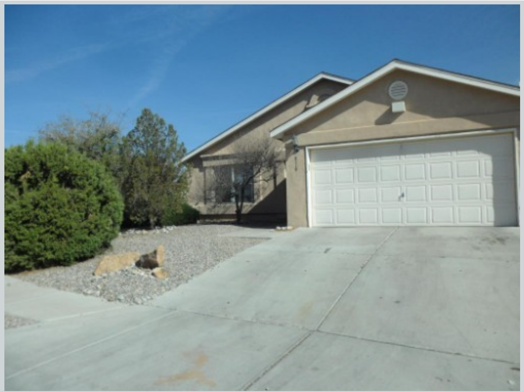
Sold Comp 3 9119 Schooner Rd Nw