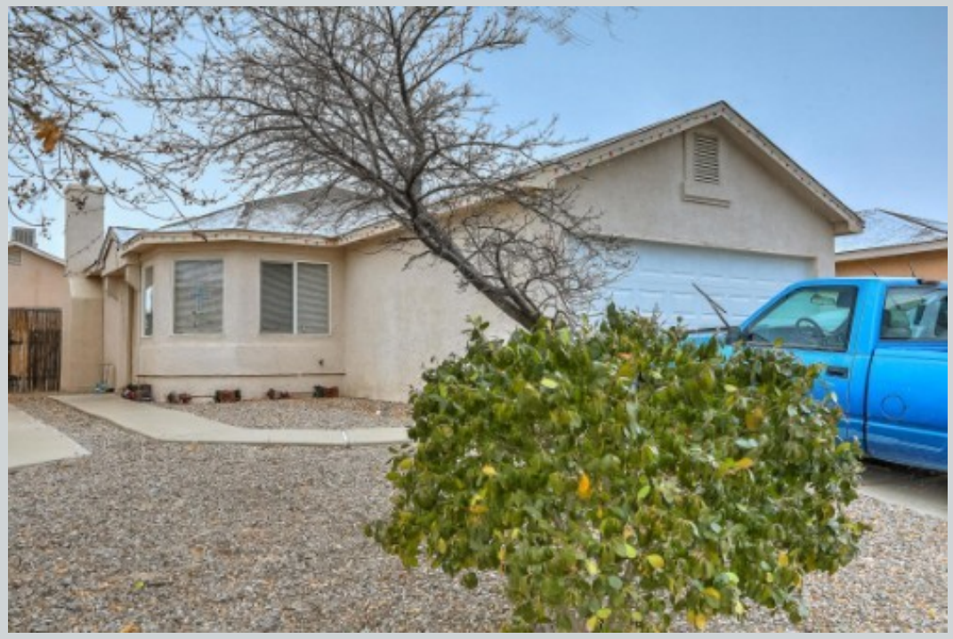
Listing Comp 2 223 San Tomas Ln Sw