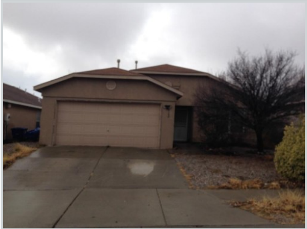
Subject 9100 Seaside Rd Nw