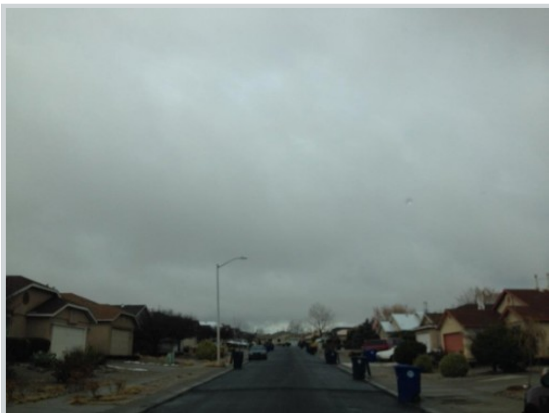
Subject 9100 Seaside Rd Nw