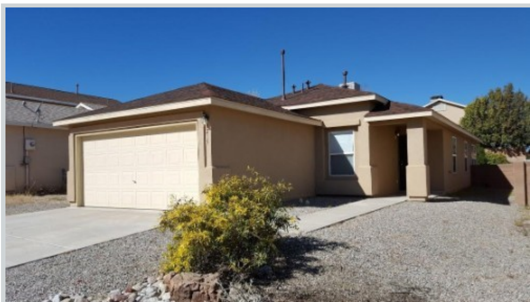
Listing Comp 1 8215 Crimson Ave Nw