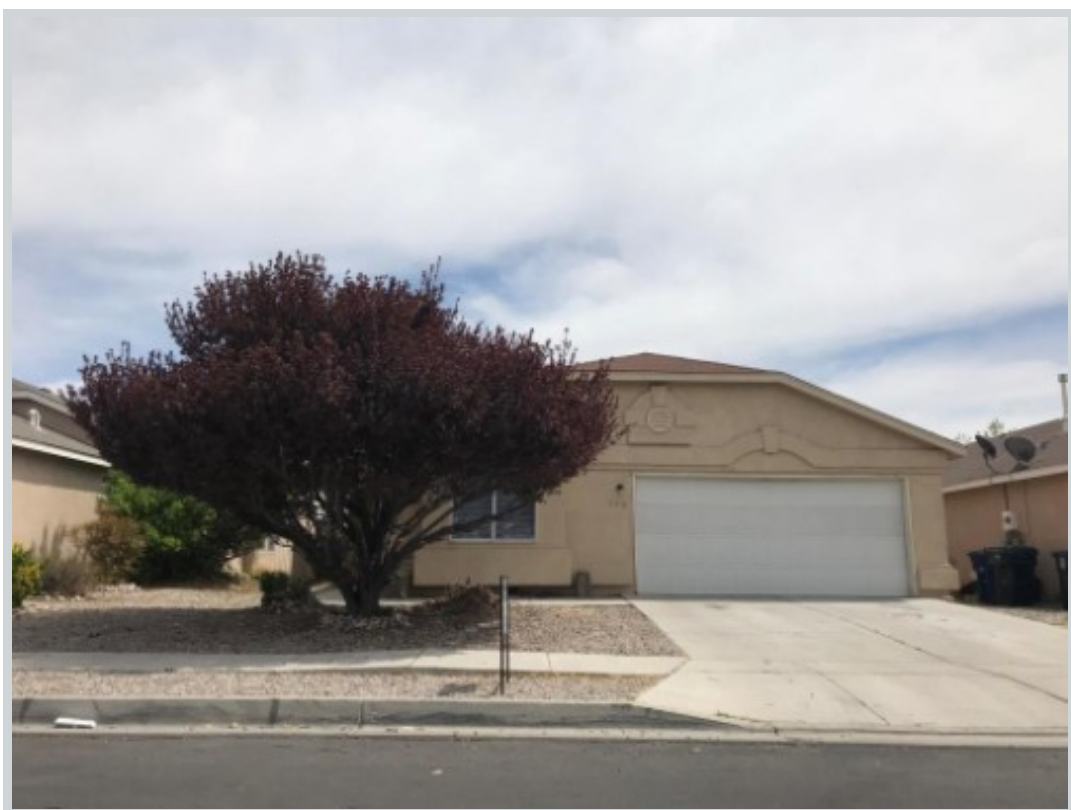
Sold Comp 2 420 Spinnaker Dr Nw