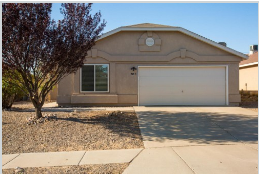
Sold Comp 1 9108 Anacapa Ave Nw