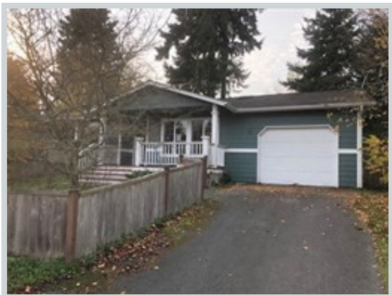
Listing Comp 2 26413 Ne Barrett Rd View Front