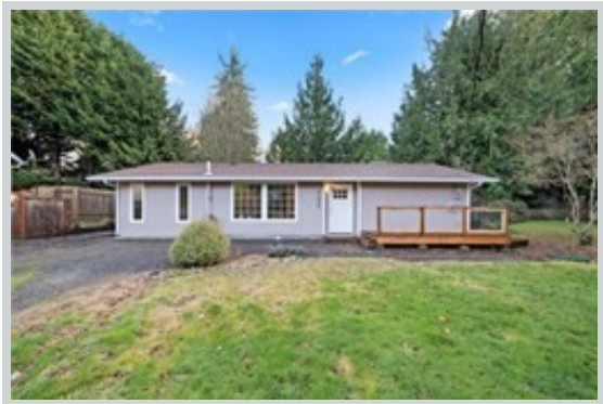
Listing Comp 1 21950 Apollo Dr View Front

Address 26406 Ne Barrett Road, Kingston, WA 98346 Loan Number 36879 Suggested List $305,000 Suggested Repaired $305,000 Sale $291,000