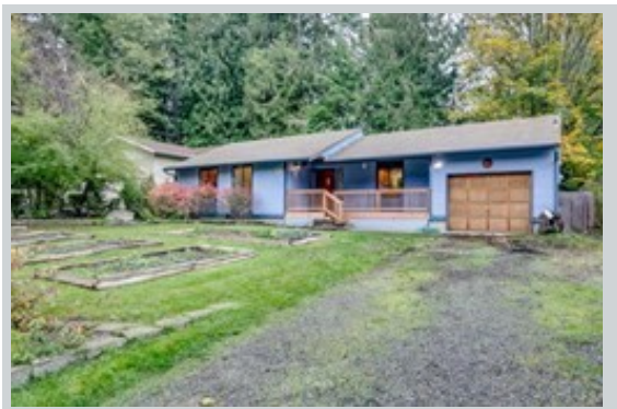
Sold Comp 1 21968 Wavecrest Ave Ne View Front