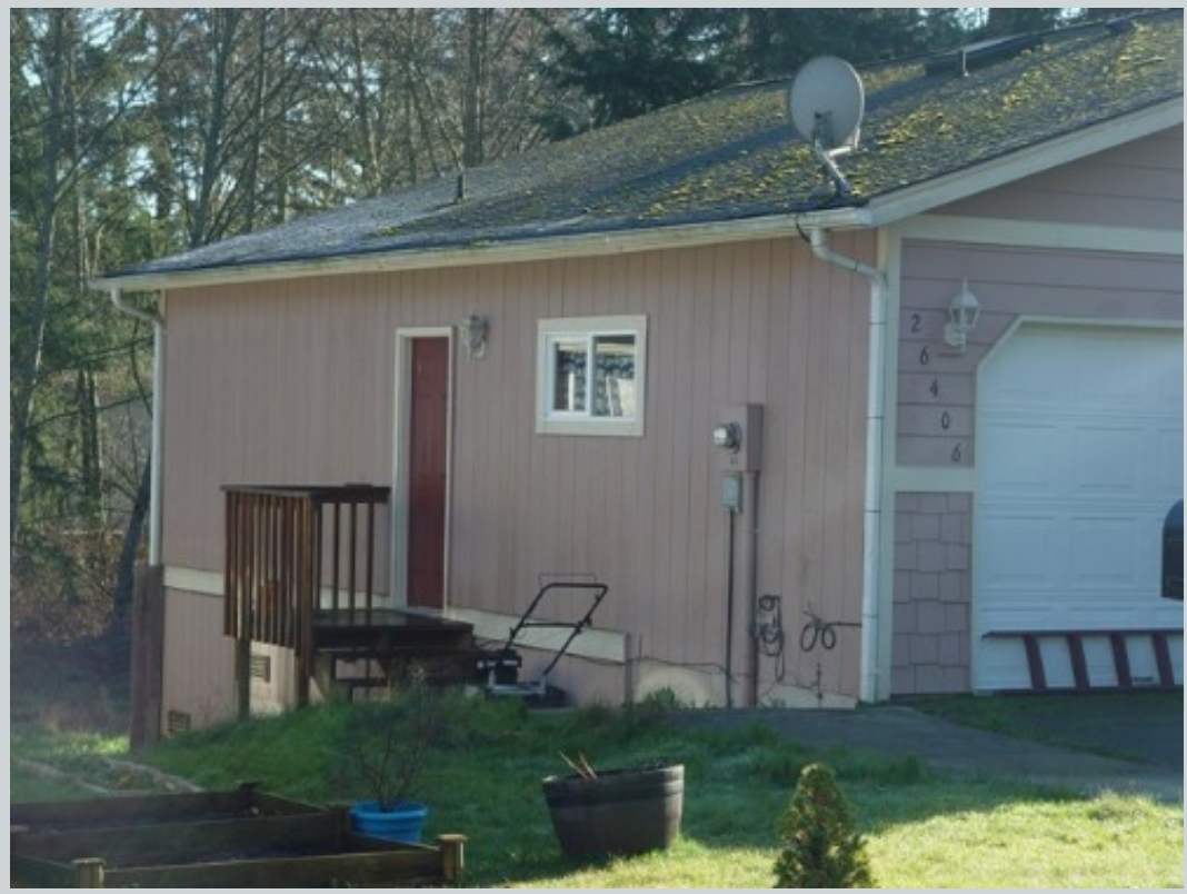
Subject 26406 Barrett Rd Ne