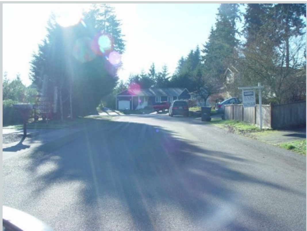
Subject 26406 Barrett Rd Ne