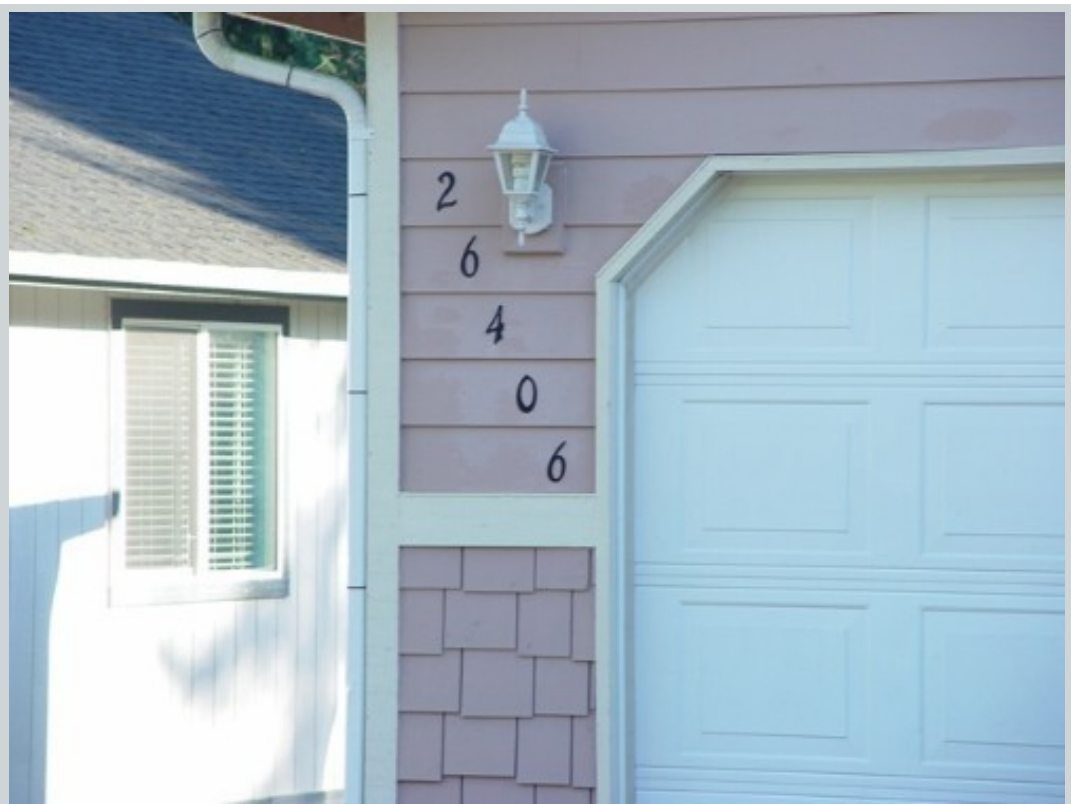
Subject 26406 Barrett Rd Ne