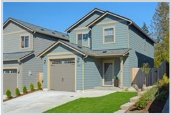
Sold Comp 3 375 Ne OHenry Ct View Front