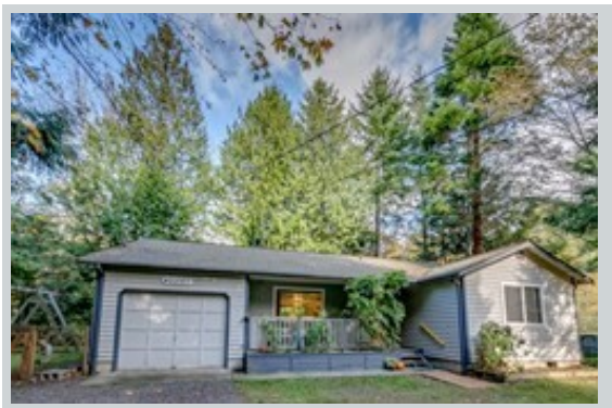
Listing Comp 3 22187 Ne Wavecrest Place View Front

Address 26406 Ne Barrett Road, Kingston, WA 98346 Loan Number 36879 Suggested List $305,000 Suggested Repaired $305,000 Sale $291,000