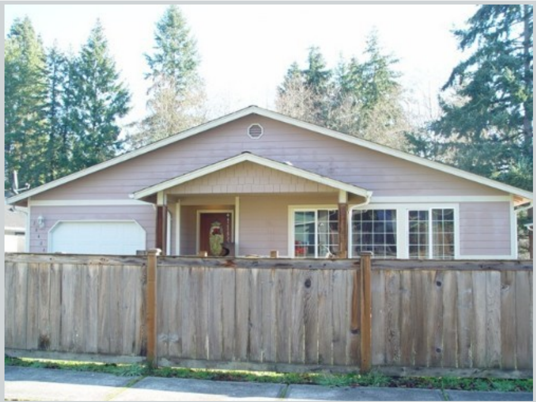
Subject 26406 Barrett Rd Ne