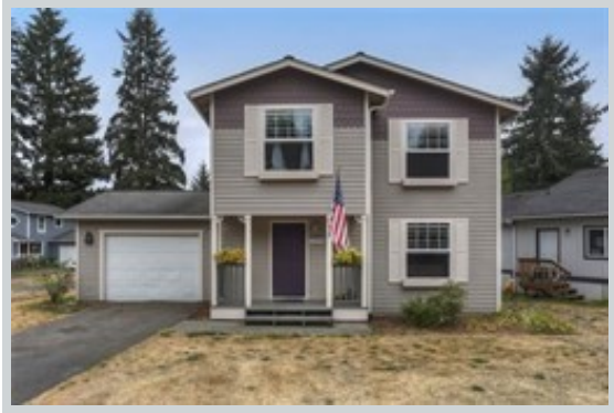
Sold Comp 2 26394 Ne Barrett View Front