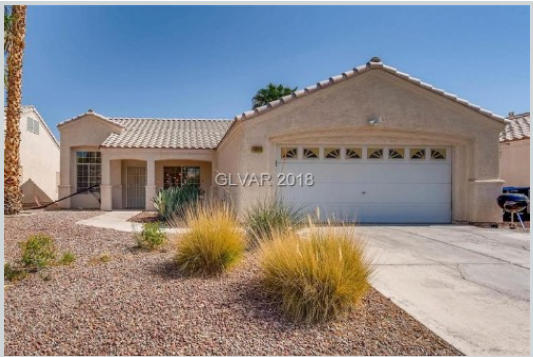
Sold Comp 2 1840 Panther Pl