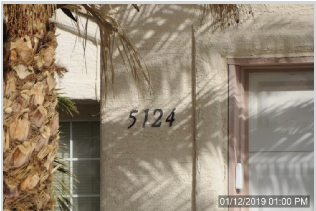
Subject 5124 Palo Pinto Ln