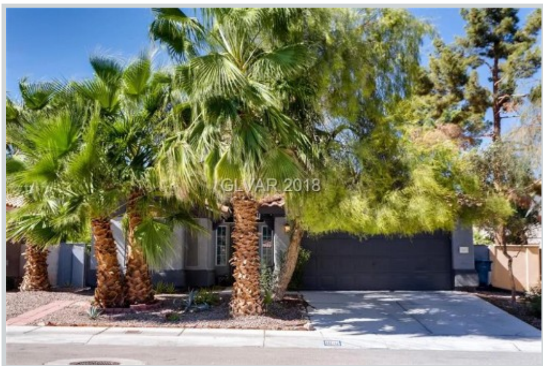
Sold Comp 3 1616 Rio Bravo Dr