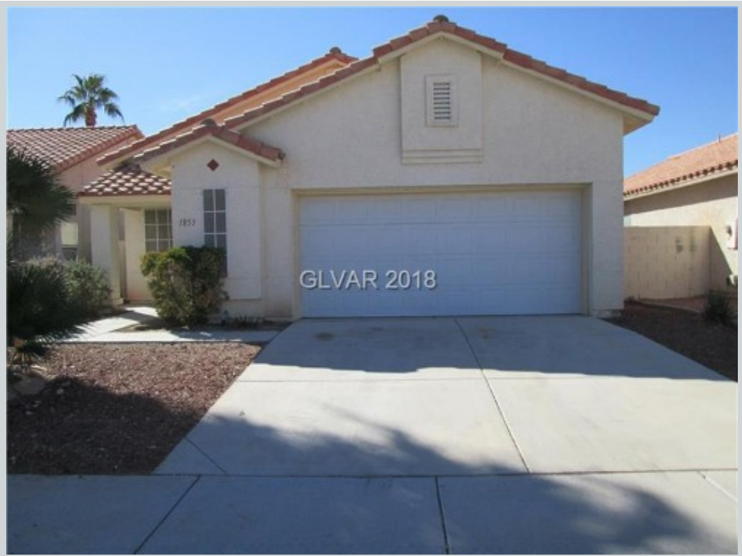
Sold Comp 1 1853 Casa Verde Dr