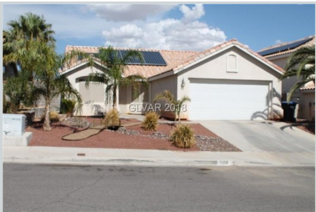
Listing Comp 3 5108 High Creek Dr