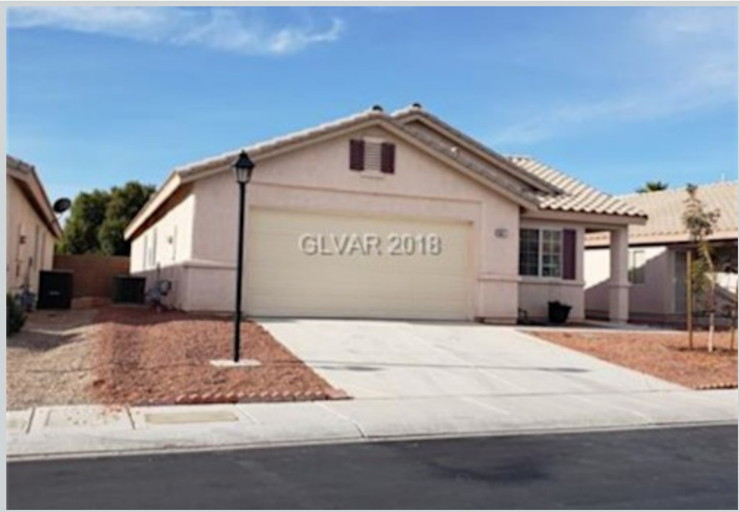
Listing Comp 2 5017 Paradise Harbor Pl