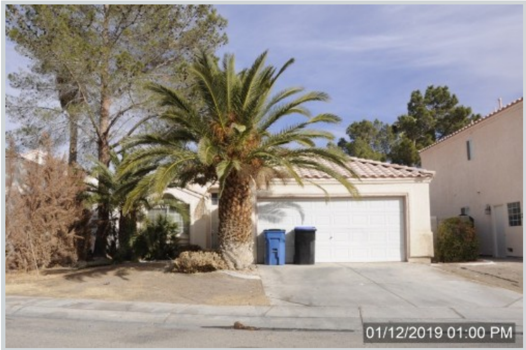
Subject 5124 Palo Pinto Ln