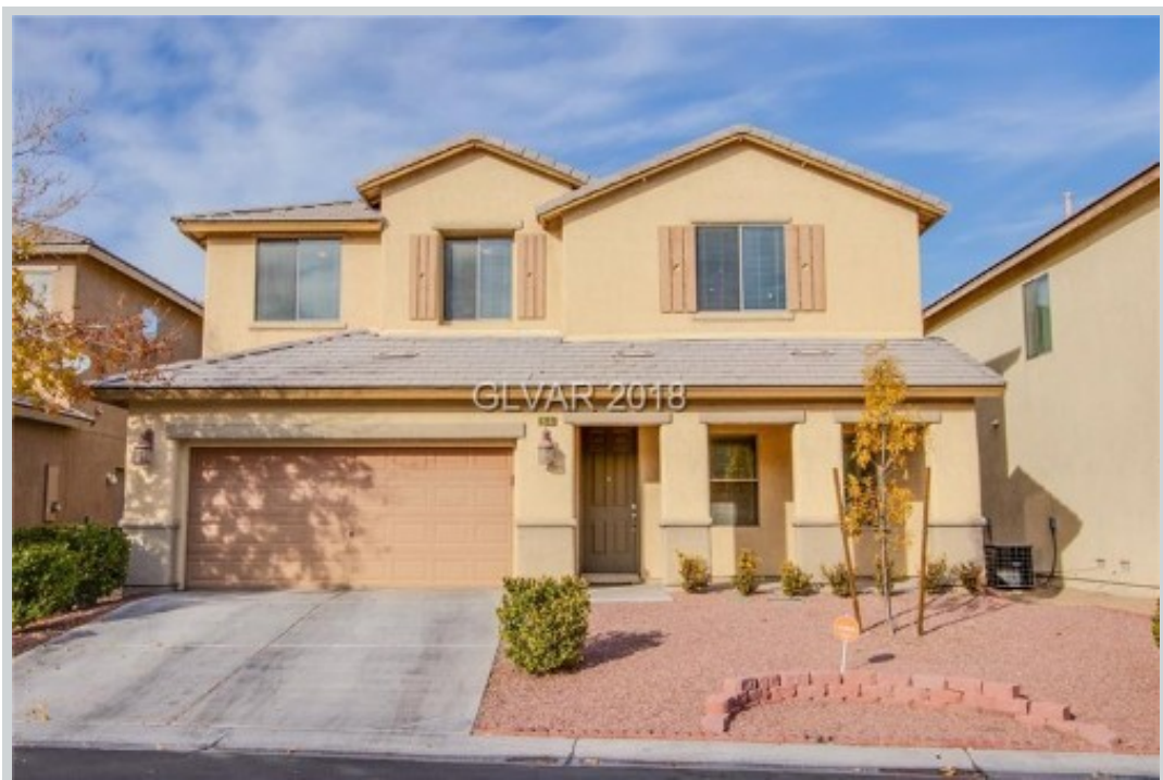
Listing Comp 3 6360 Maratea Av