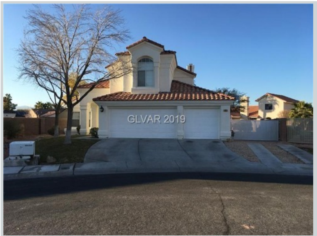
Listing Comp 1 4625 Mancilla St