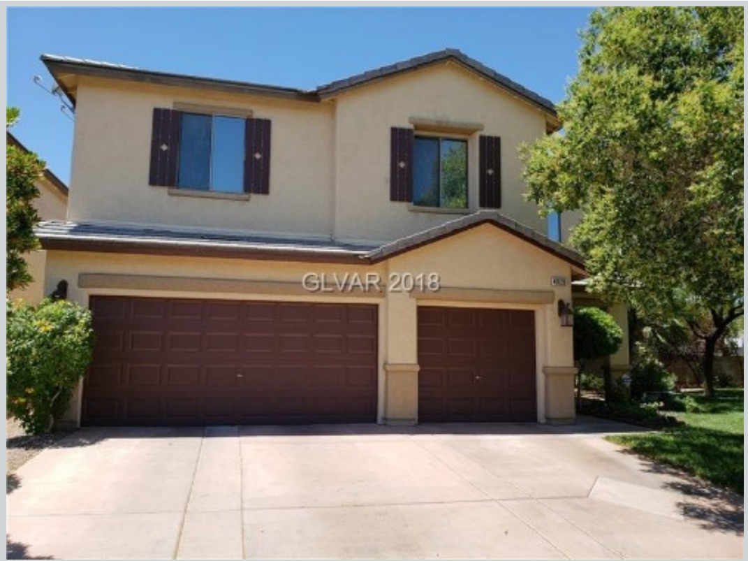
Sold Comp 1 4929 Capo Gallo St