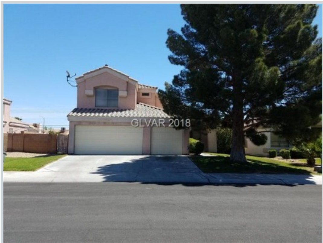
Listing Comp 2 5516 Galena Point St