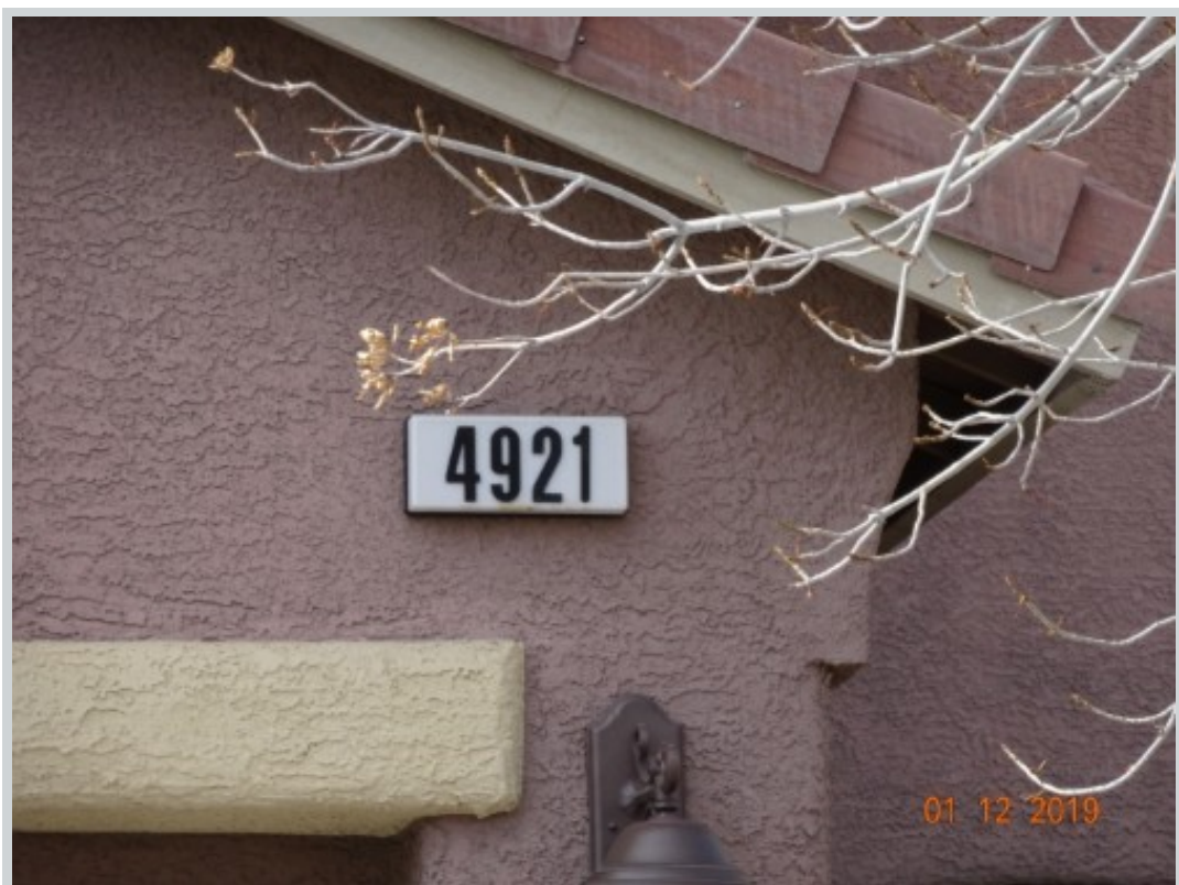
Subject 4921 Tindari St