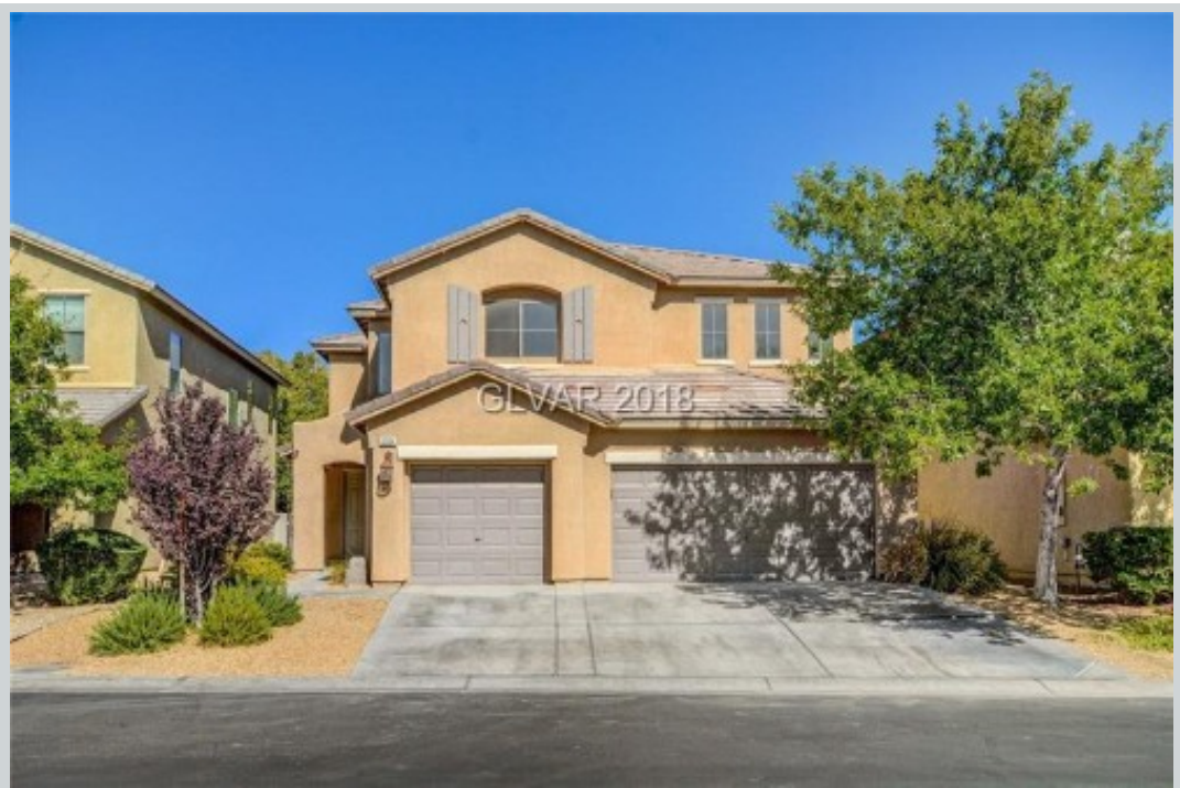
Sold Comp 2 6364 Maratea Av