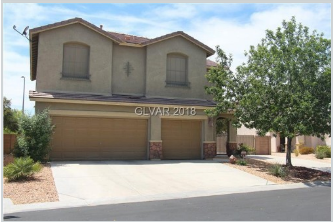
Sold Comp 3 5321 Rizari Ct