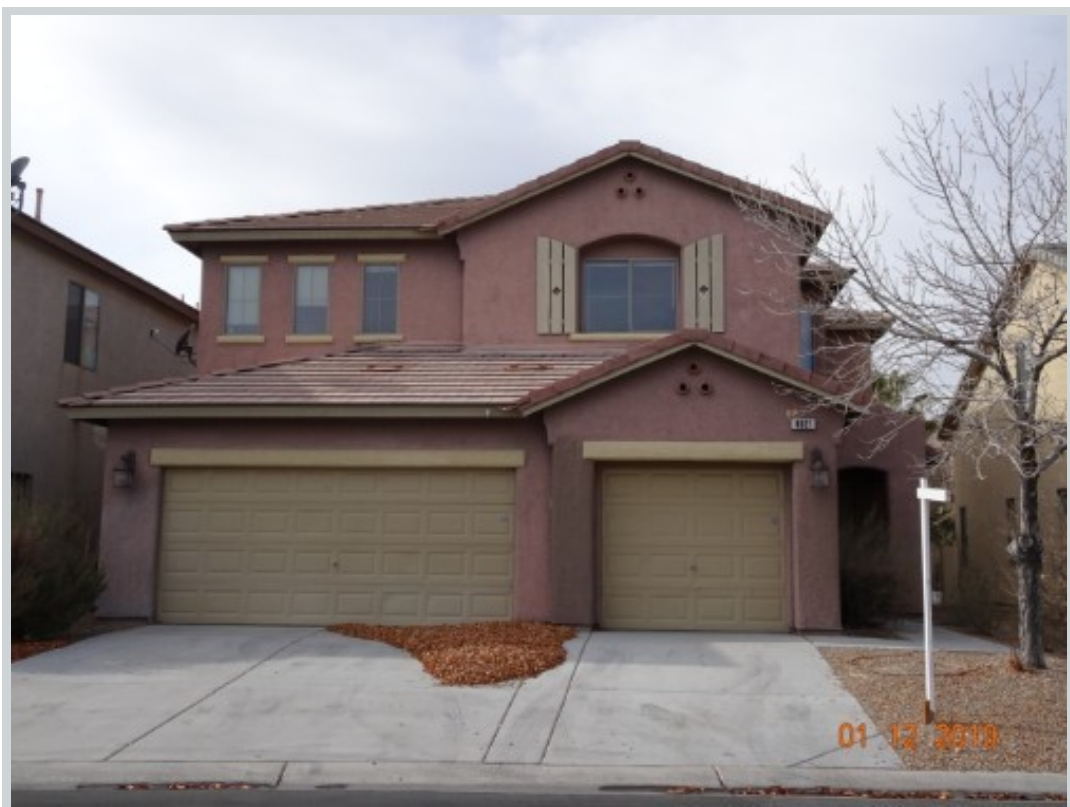
Subject 4921 Tindari St