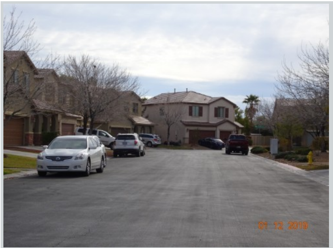
Subject 4921 Tindari St

Address 4921 Tindari Street, Las Vegas, NV 89130 Loan Number 36882 Suggested List $335,000 Suggested Repaired $335,000 Sale $325,000