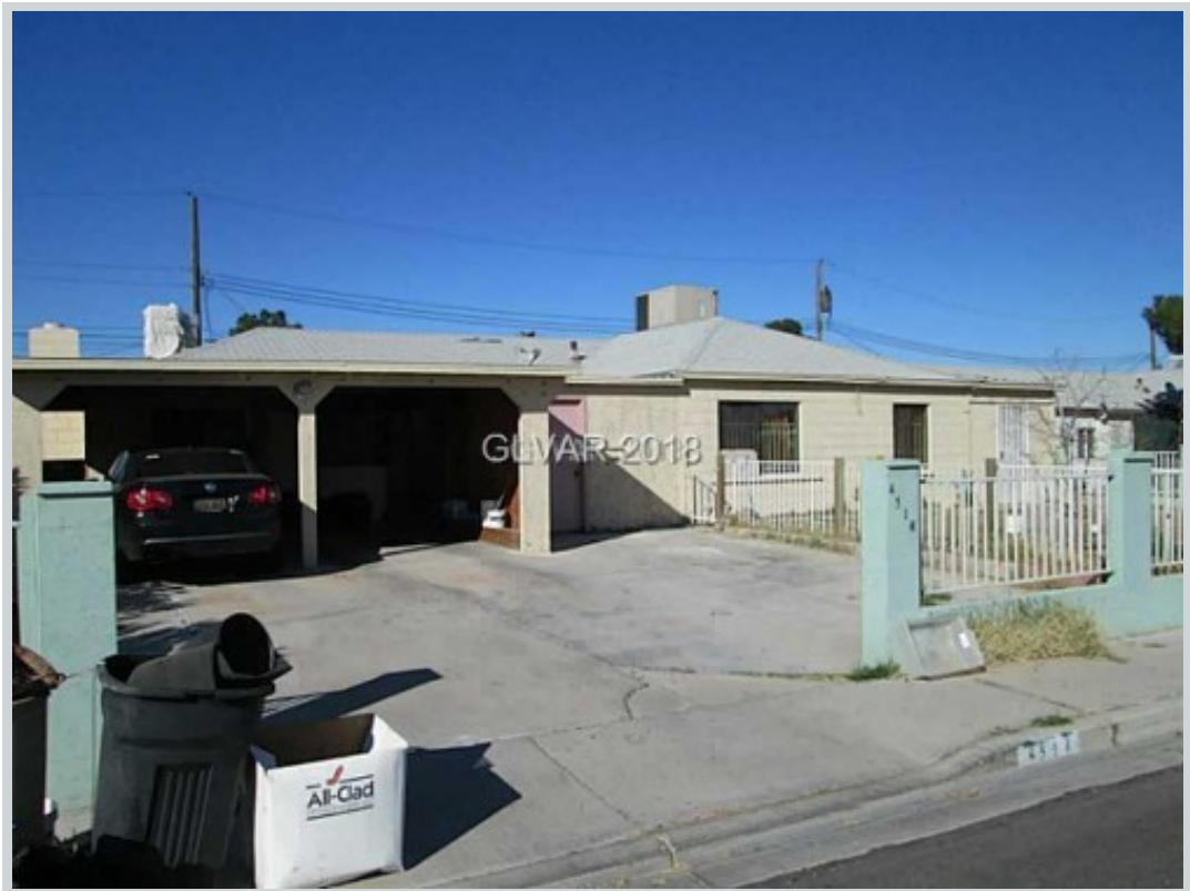
Listing Comp 3 4518 Baxter Pl