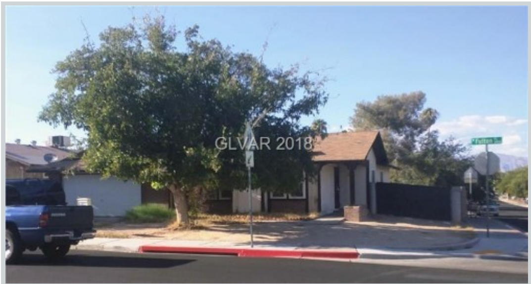
Sold Comp 2 3900 Fulton Pl