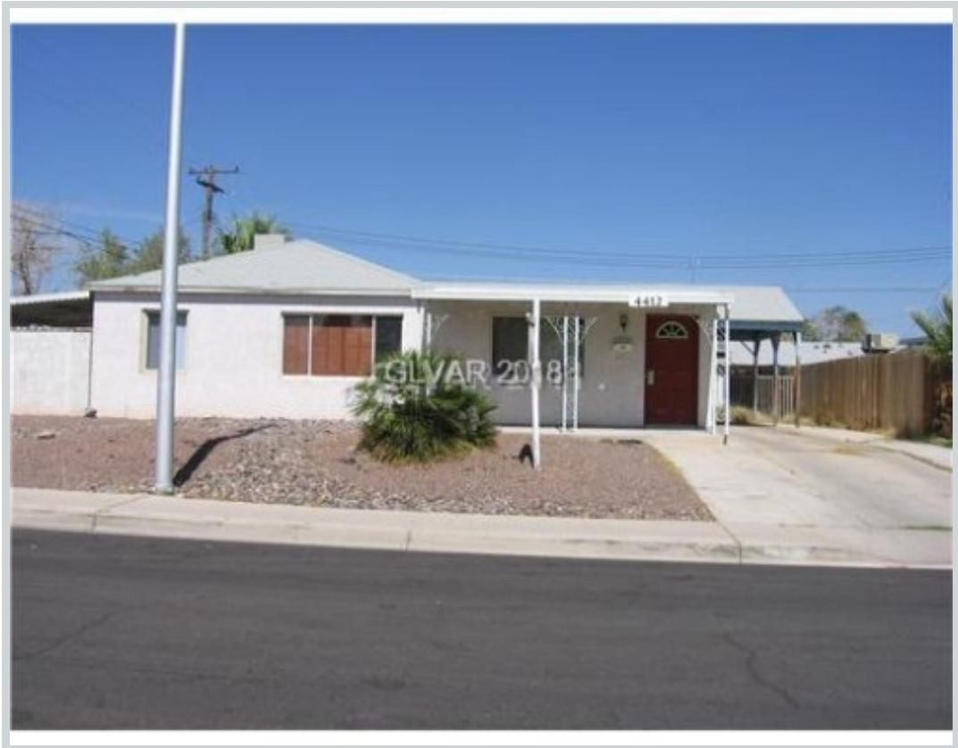
Listing Comp 2 4412 Kay Pl