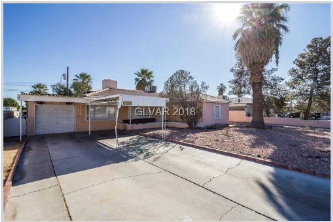
Listing Comp 1 1001 Essex West Dr