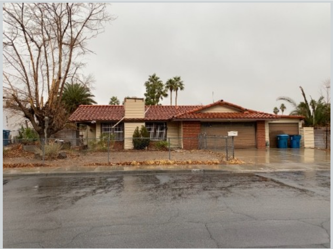
Subject 4000 Stormcrest Dr