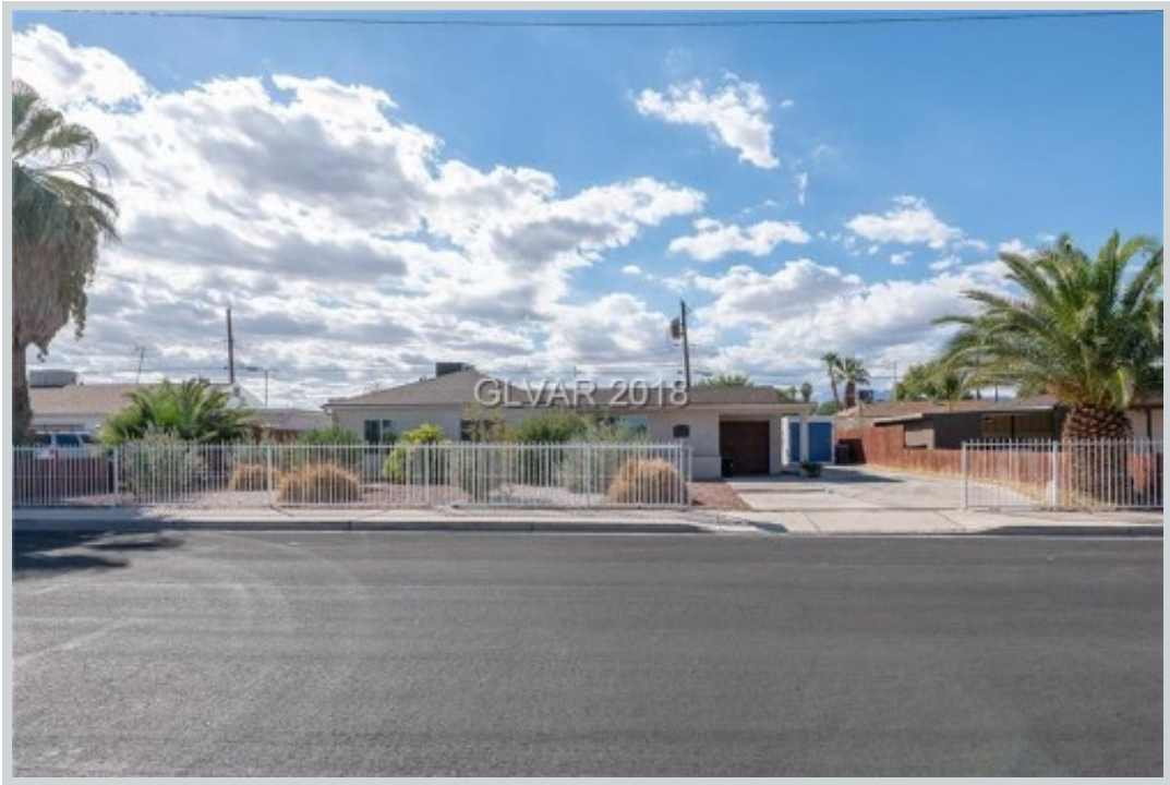
Sold Comp 3 912 Essex East Dr