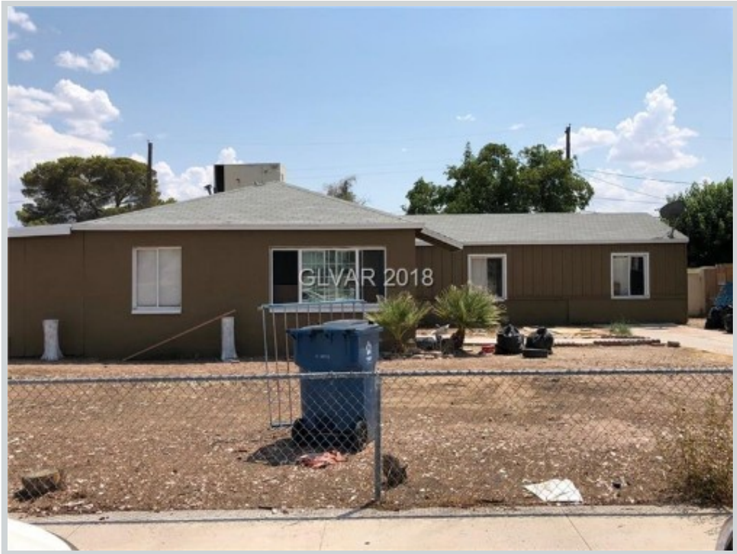
Sold Comp 1 4219 Garden Pl