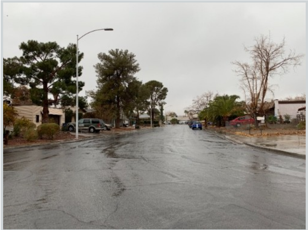
Subject 4000 Stormcrest Dr