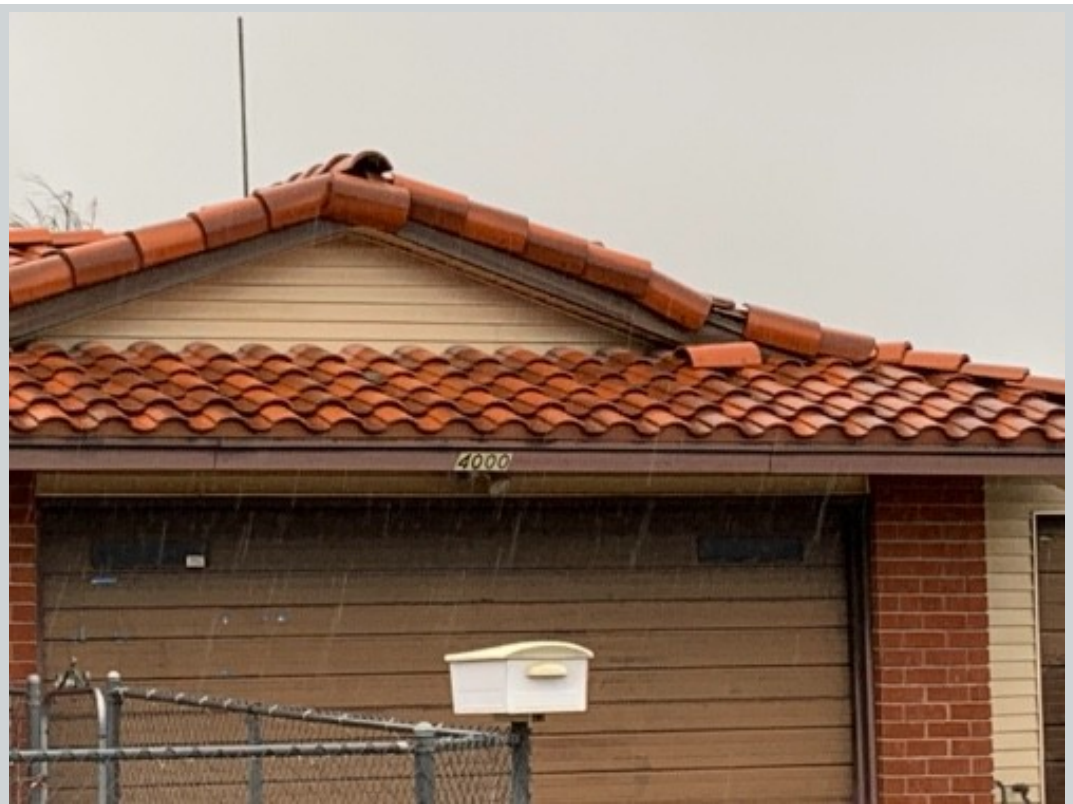
Subject 4000 Stormcrest Dr