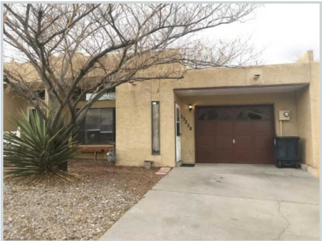
Listing Comp 3 13228 Panorama Loop Ne