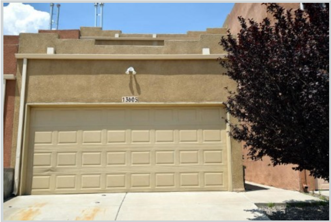
Sold Comp 3 13605 Shaffer Ct Se

Address 13646 Keesha Jo Avenue Se, Albuquerque, NM 87123 Loan Number 36896 Suggested List $155,000 Suggested Repaired $155,000 Sale $150,000