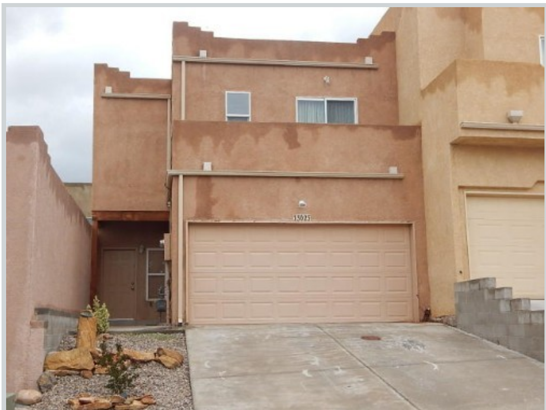
Sold Comp 2 13625 Keesha Jo Ave Se View Front