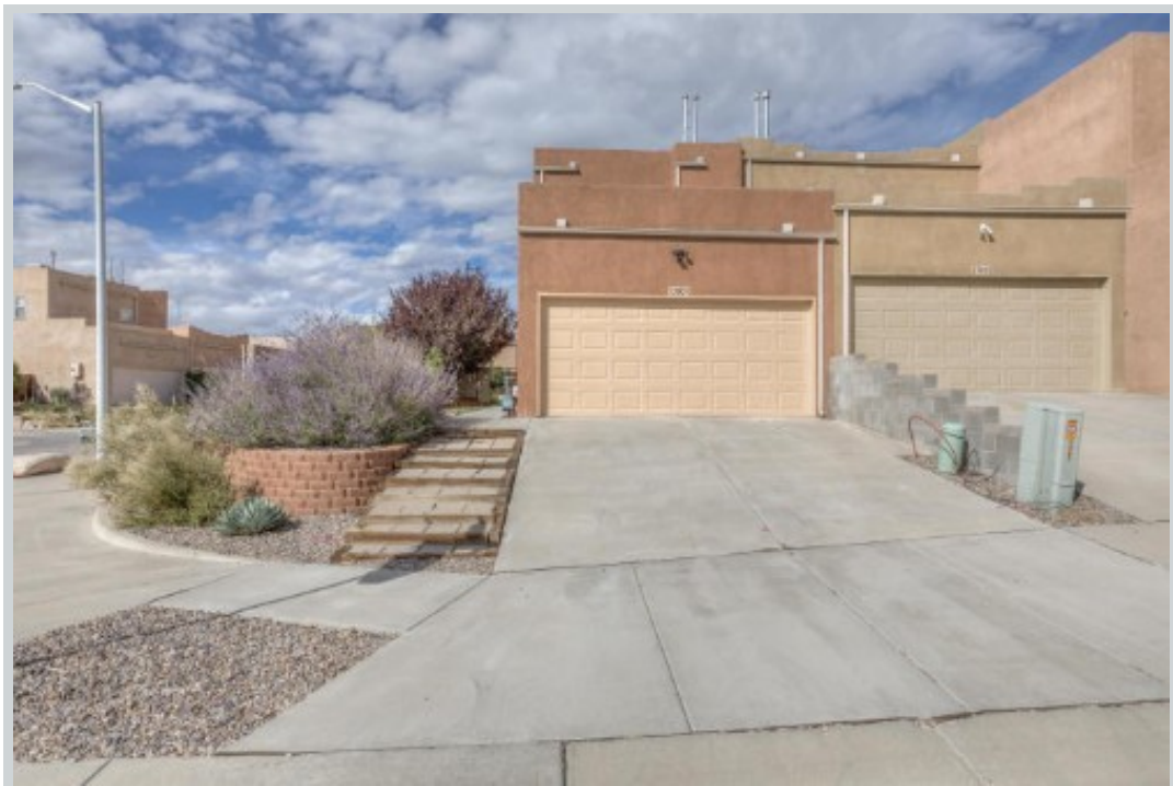
Sold Comp 1 13601 Shaffer Ct Se View Front

Address 13646 Keesha Jo Avenue Se, Albuquerque, NM 87123 Loan Number 36896 Suggested List $155,000 Suggested Repaired $155,000 Sale $150,000