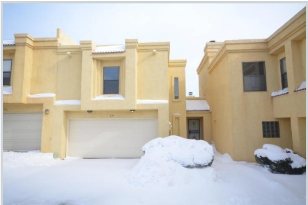
Listing Comp 1 554 Pinon Creek Rd Se