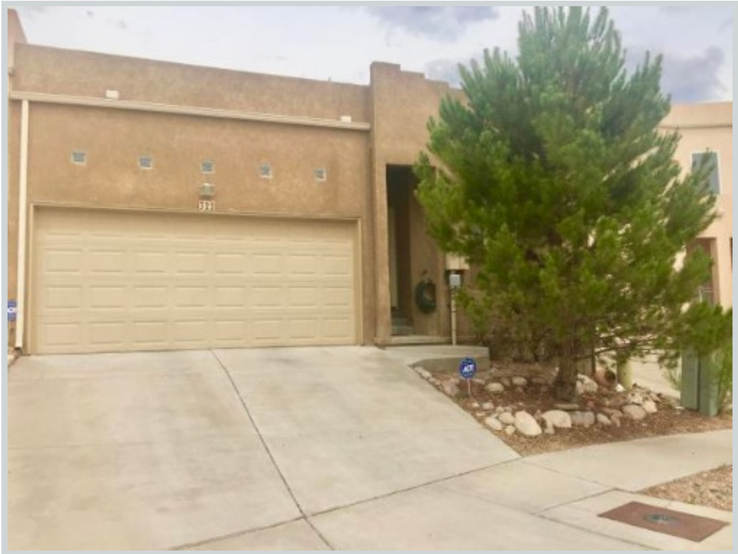
Listing Comp 2 322 Kaylyn Dr Se