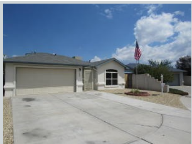
Listing Comp 3 7105 Marigot Ct View Front