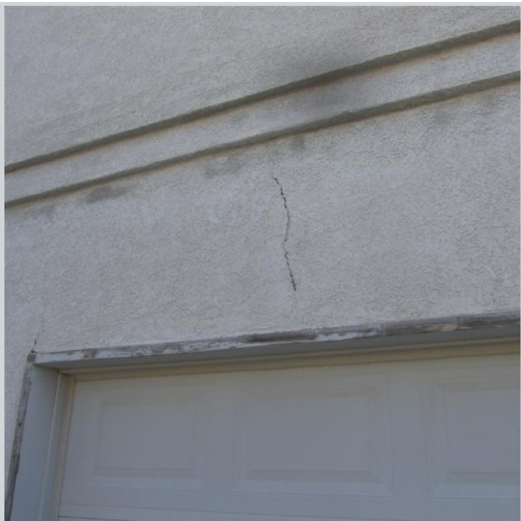
Subject 2324 Kafka Pl Nw