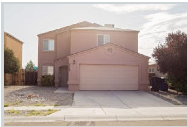
Sold Comp 3 2112 Sea Foam St View Front