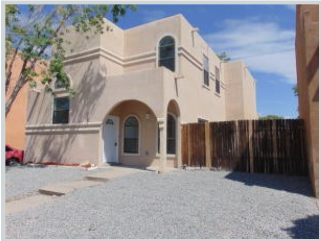
Listing Comp 1 7709 Sandelewood Dr View Front