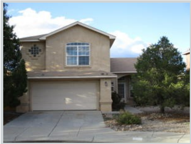
Sold Comp 2 6409 Summerwood Ct View Front