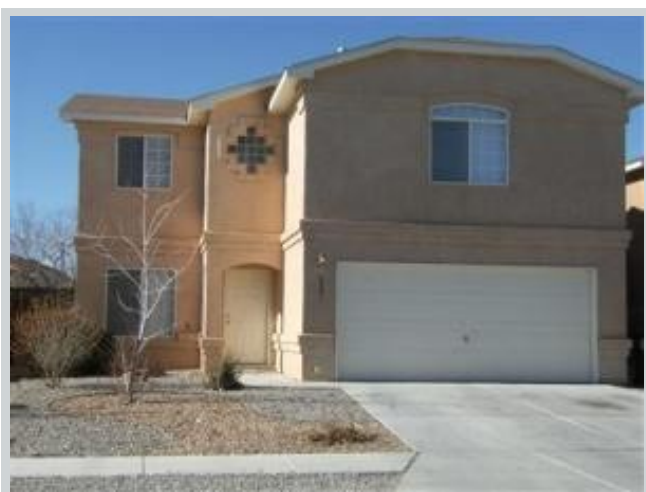
Sold Comp 1 2431 Red Polard Ct View Front