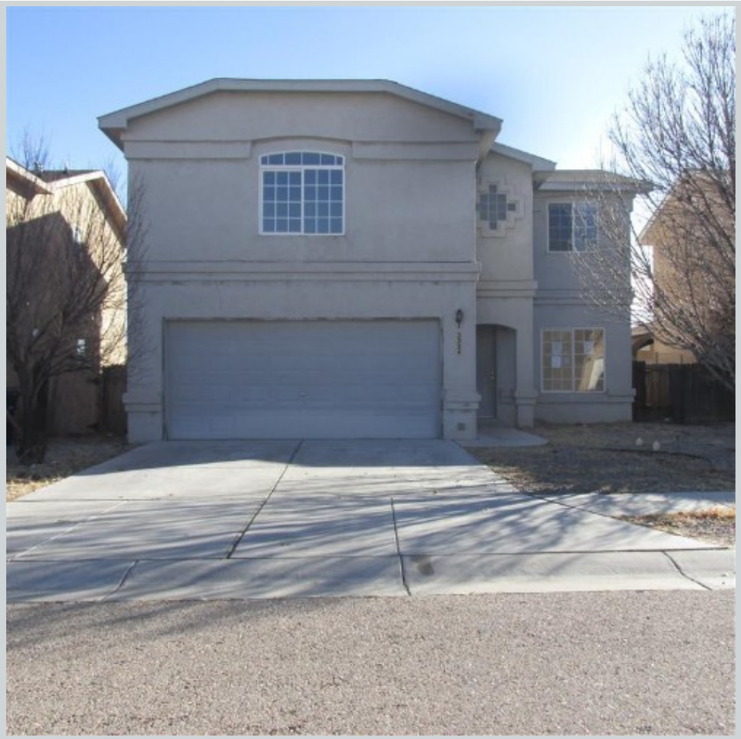
Subject 2324 Kafka Pl Nw