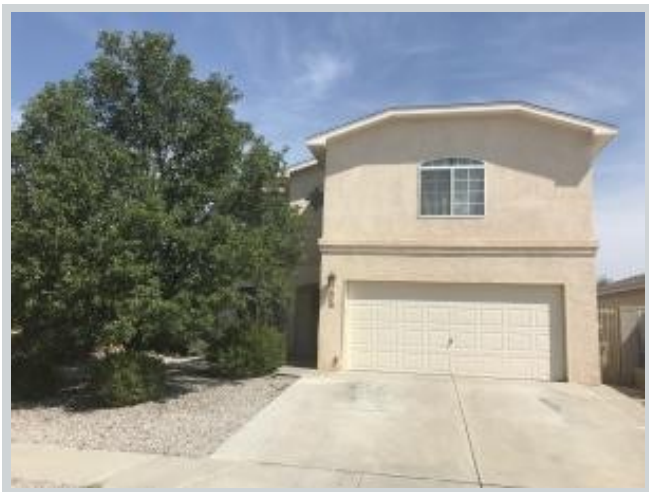
Listing Comp 2 6515 Keswick Rd View Front