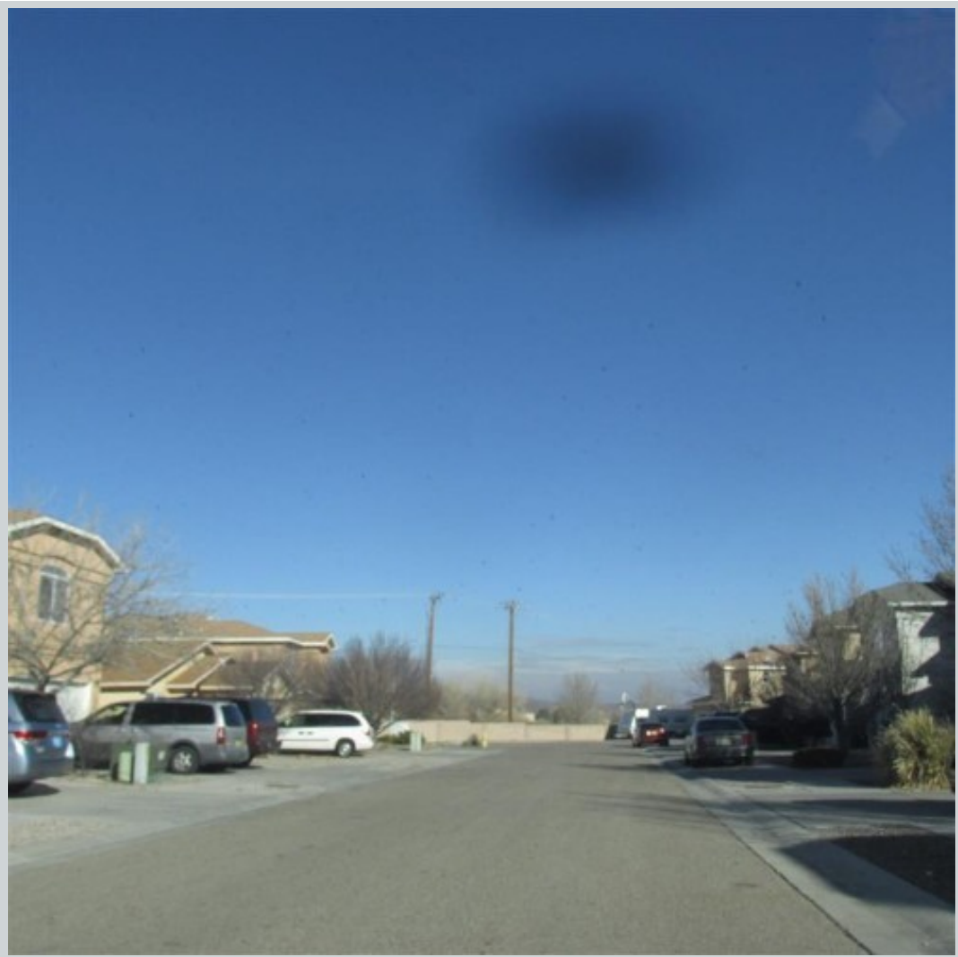
Subject 2324 Kafka Pl Nw