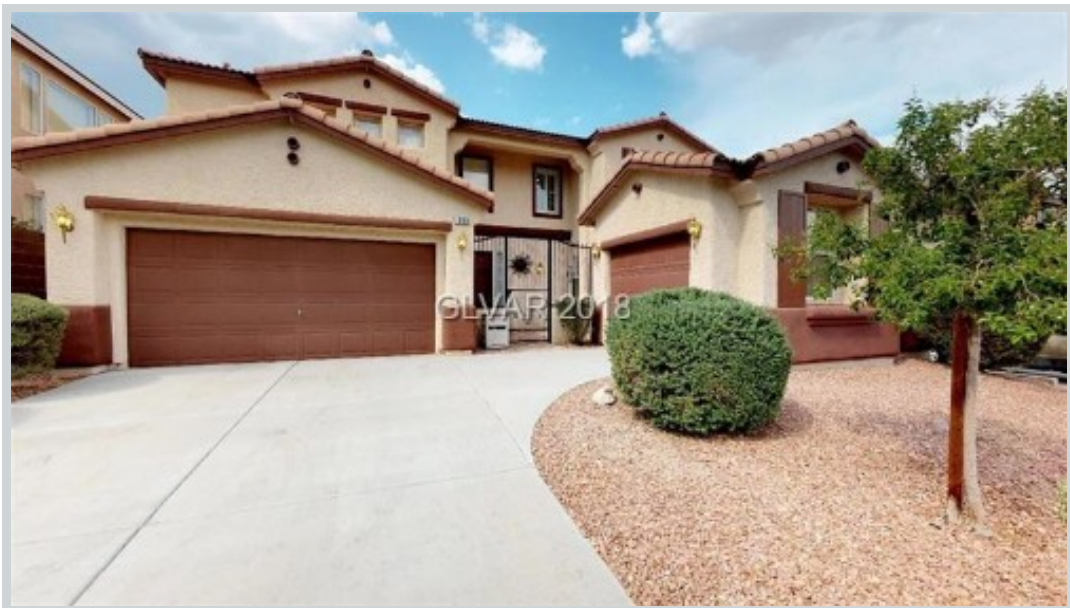
Sold Comp 1 10104 Coluter Pine Av