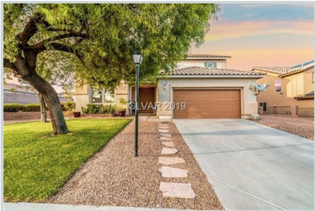
Listing Comp 1 10428 Snowden Flat Ct