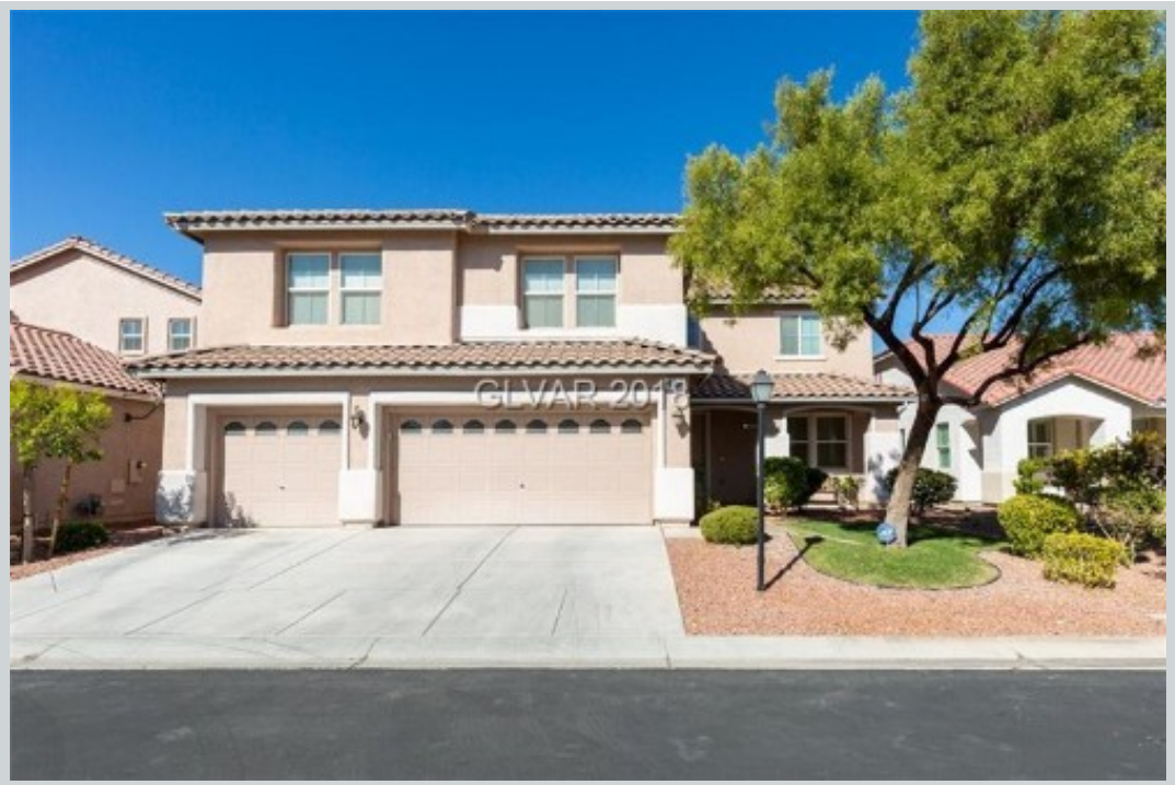
Sold Comp 3 4317 Terrapin Mountain Dr