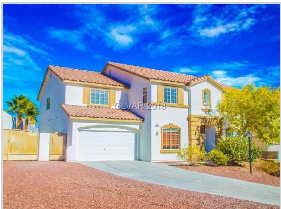
Listing Comp 3 10662 Early Dawn Ct View Front