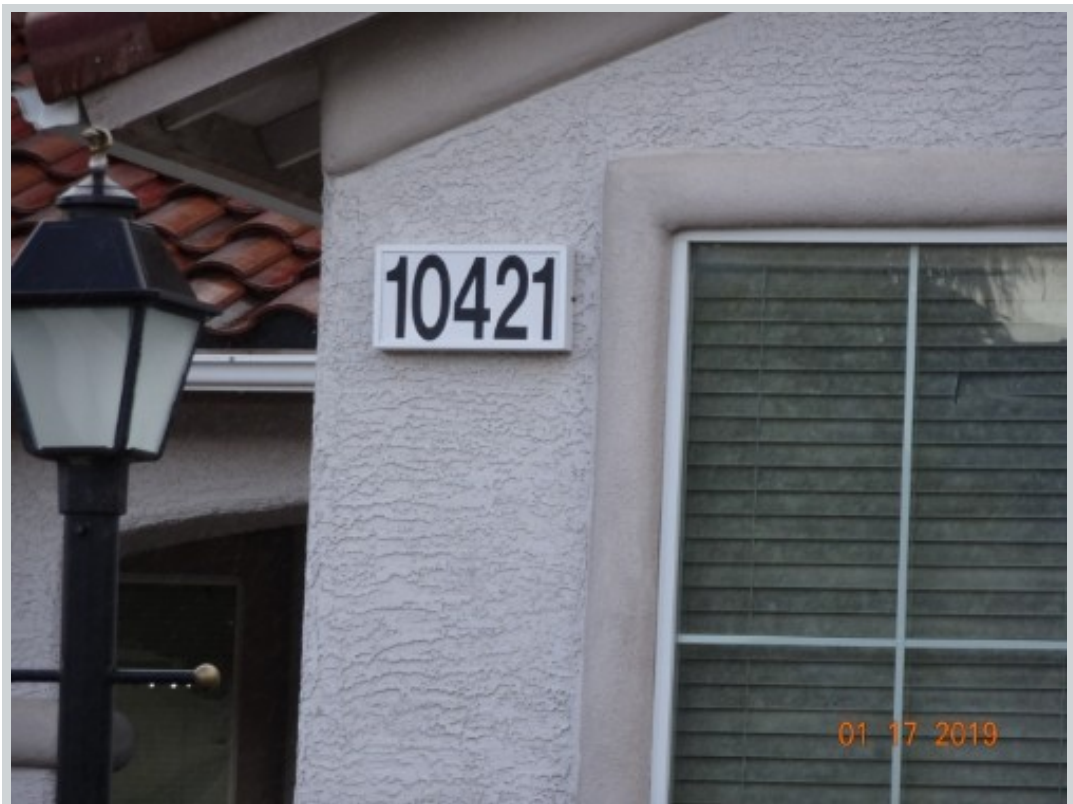
Subject 10421 Snowdon Flat Ct