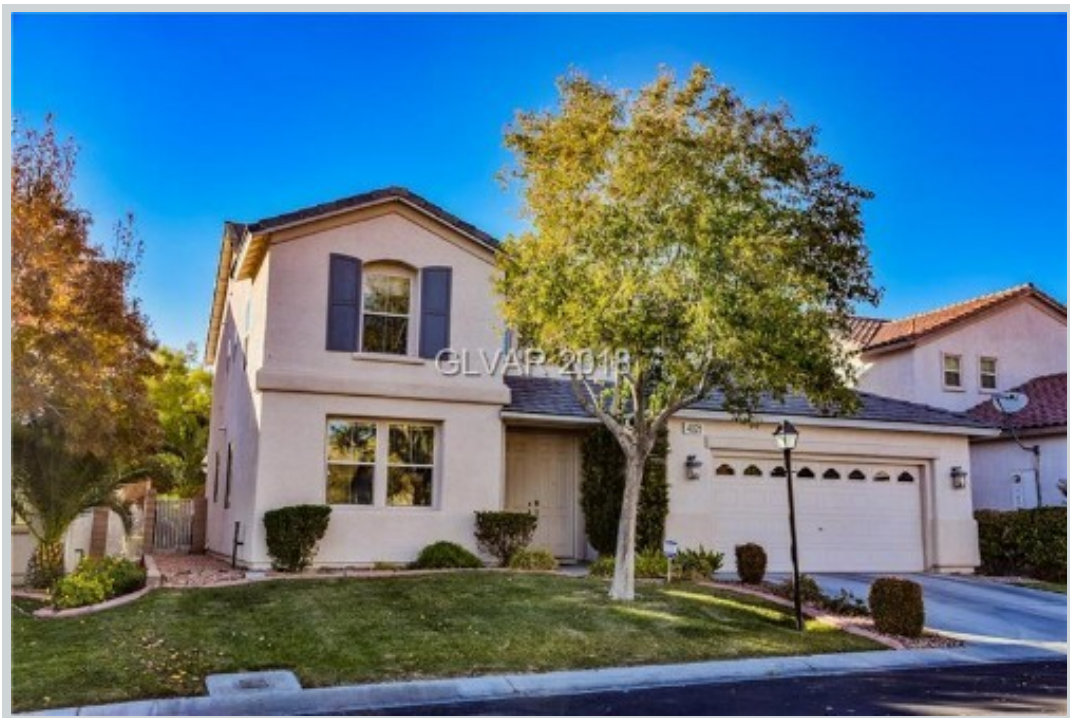
Listing Comp 2 4021 Laurel Flat Ct View Front

Address 10421 Snowden Flat Court, Las Vegas, NV 89129 Loan Number 36901 Suggested List $450,000 Suggested Repaired $450,000 Sale $445,000