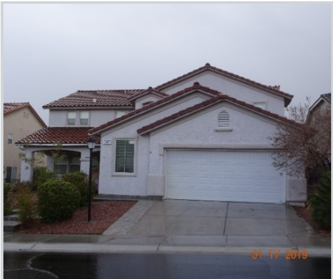
Subject 10421 Snowdon Flat Ct