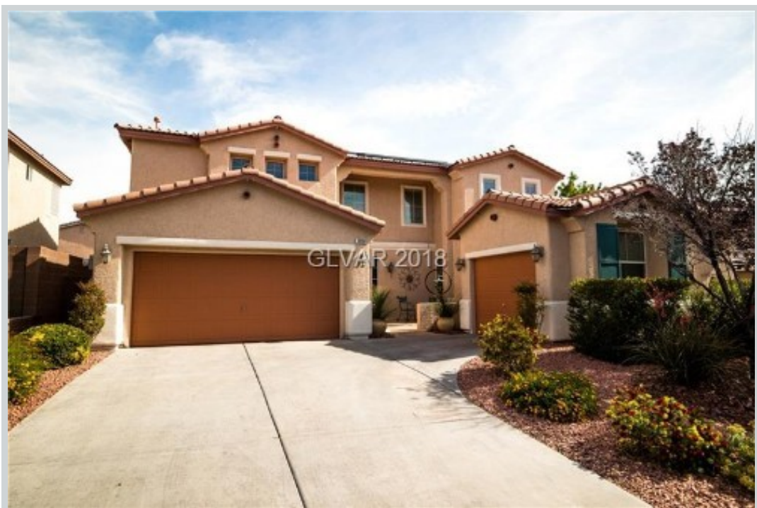
Sold Comp 2 10108 Dryfork Av