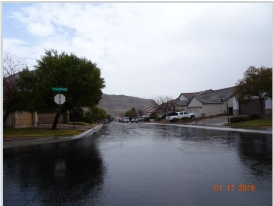
Subject 10421 Snowden Flat Ct