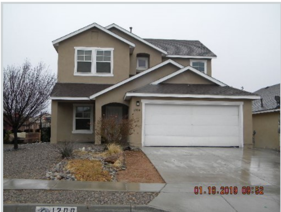
Subject 1200 Reynosa Loop Se