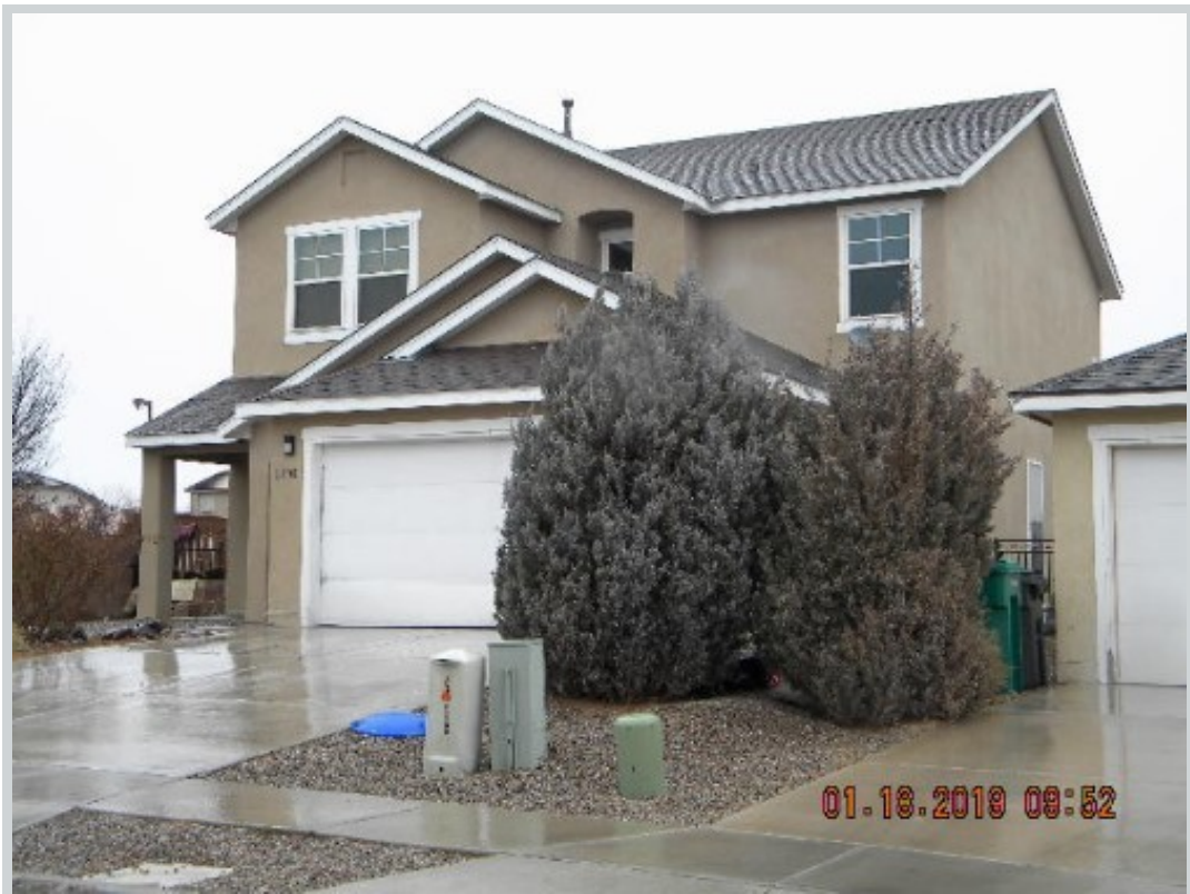
Subject 1200 Reynosa Loop Se View Side Comment "Right side"

Address 1200 Reynosa Loop, Rio Rancho, NM 87124 Loan Number 36904 Suggested List $225,000 Suggested Repaired $225,000 Sale $220,000