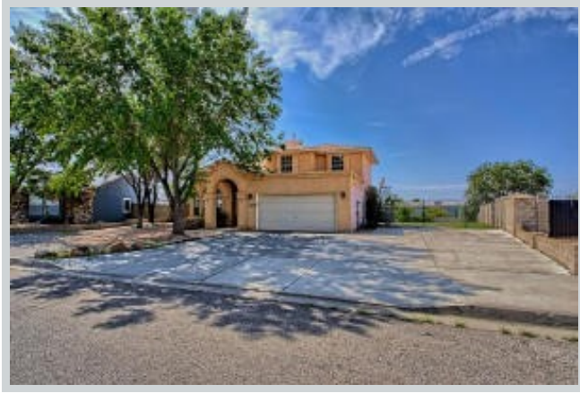
Listing Comp 3 2157 Conestoga Rd Se View Front