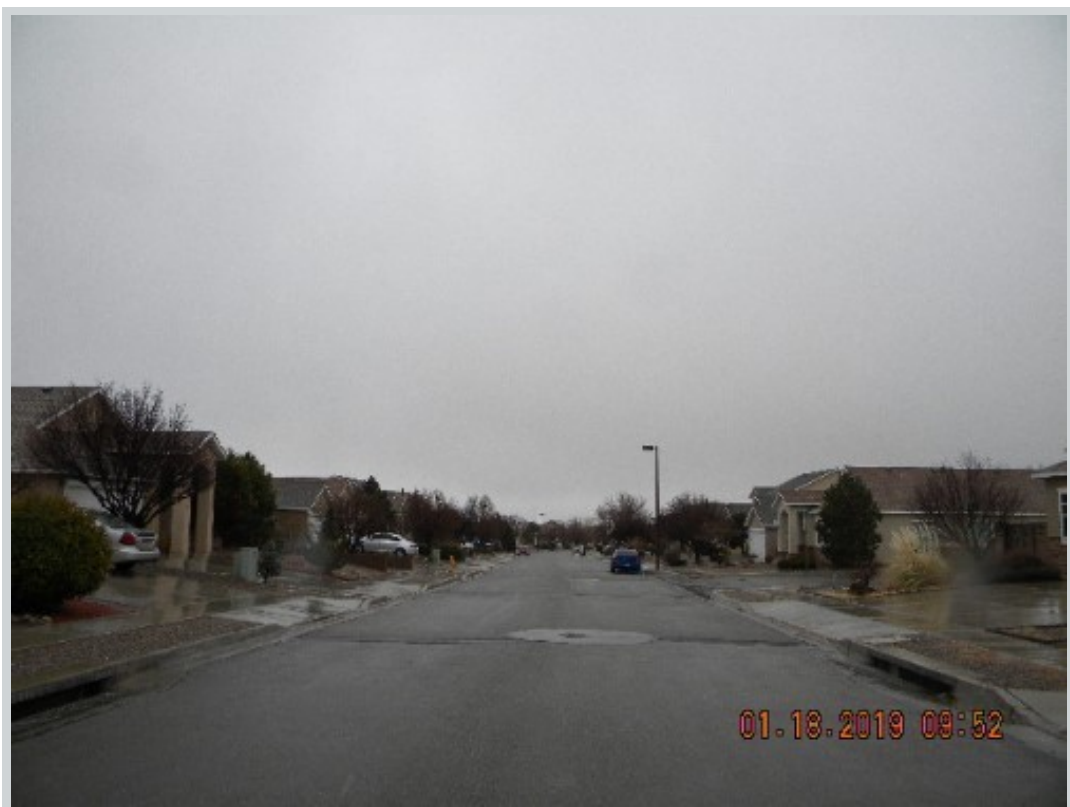
Subject 1200 Reynosa Loop Se Comment "Street - South"

Address 1200 Reynosa Loop, Rio Rancho, NM 87124 Loan Number 36904 Suggested List $225,000 Suggested Repaired $225,000 Sale $220,000