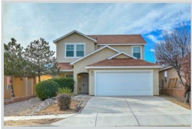
Listing Comp 1 1468 Reynosa Loop Se View Front