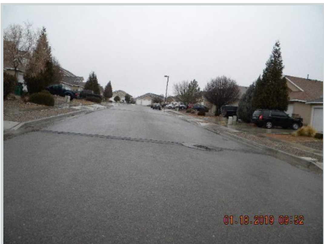
Subject 1200 Reynosa Loop Se Comment "Street - North"