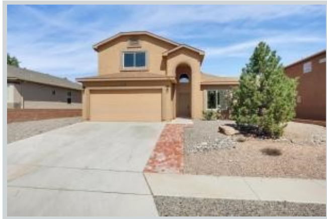
Sold Comp 3 2037 N Ensenada Cir Se