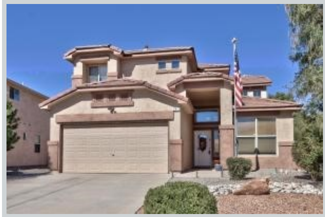
Listing Comp 2 2413 Anitori Rd Se View Front