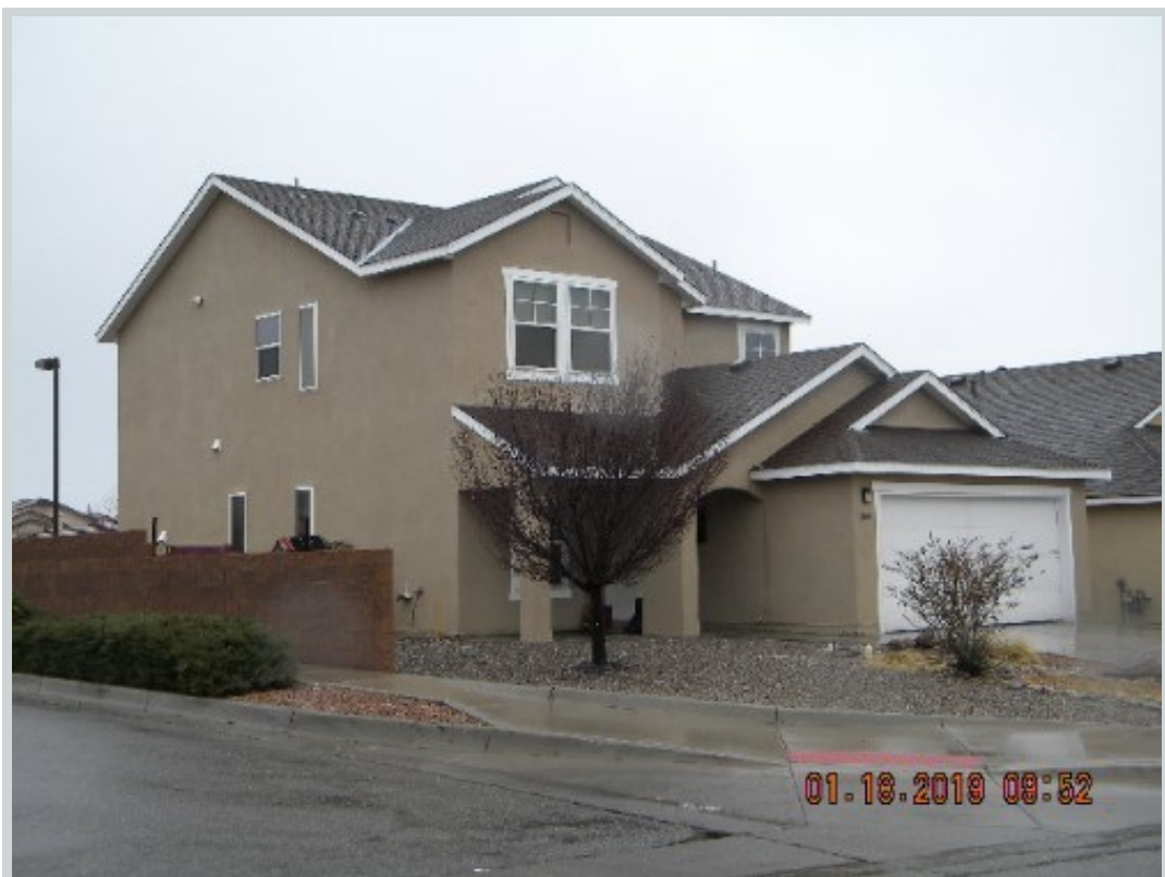
Subject 1200 Reynosa Loop Se View Side Comment "Left side"