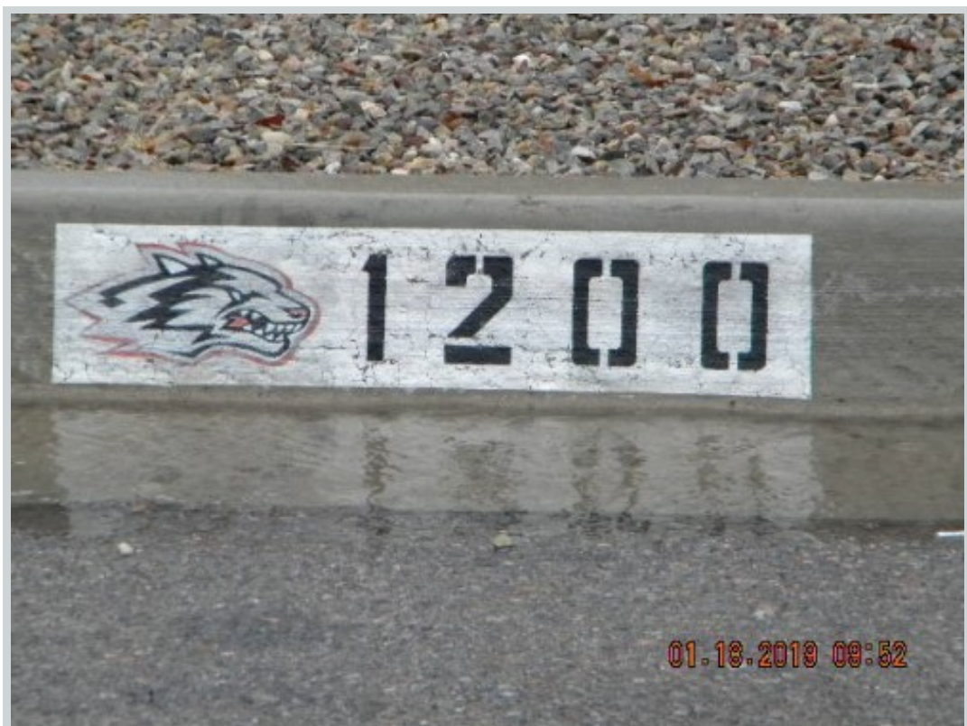
Subject 1200 Reynosa Loop Se