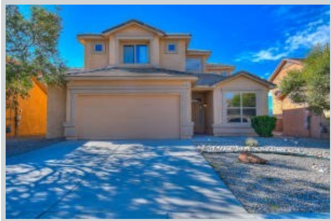
Sold Comp 1 2404 Falesco Rd Se View Front