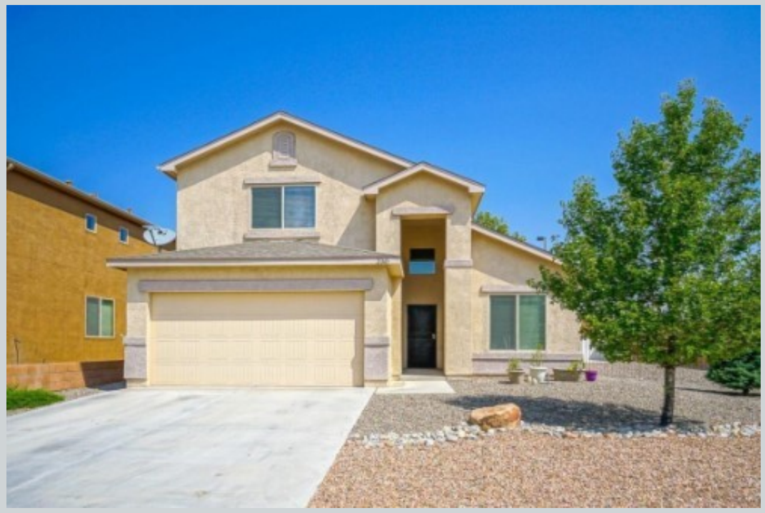
Sold Comp 2 2045 N Ensenada Cir Se