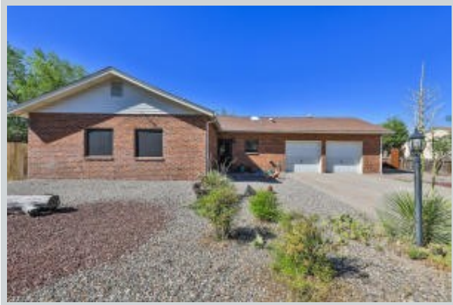
Sold Comp 1 4708 Pepe Ortiz Rd Se View Front