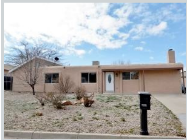
Sold Comp 2 4108 Las Casas Ct Se View Front