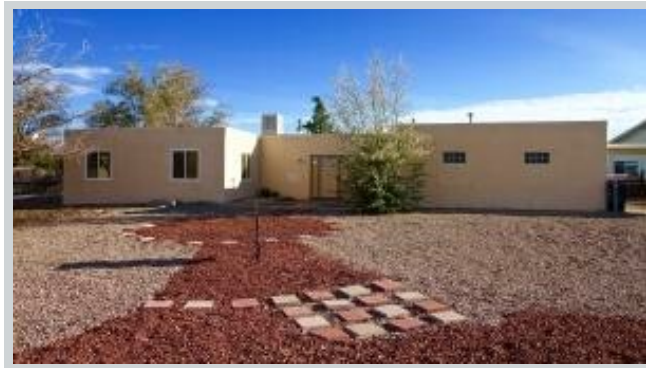
Listing Comp 2 400 Oreja De Oro Dr Se