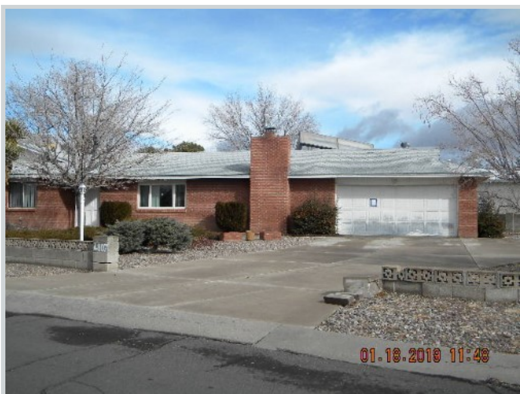
Subject 4807 Sombrerete Rd Se