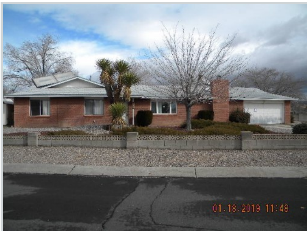
Subject 4807 Sombrerete Rd Se