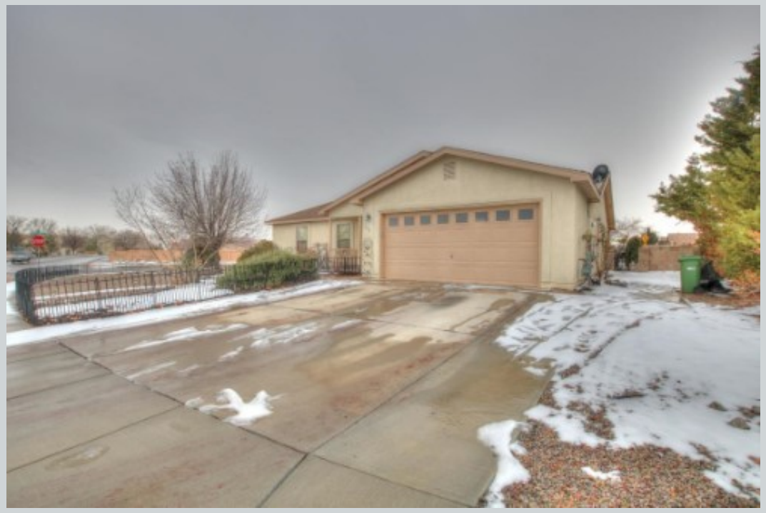
Listing Comp 1 912 Verde Pl Se