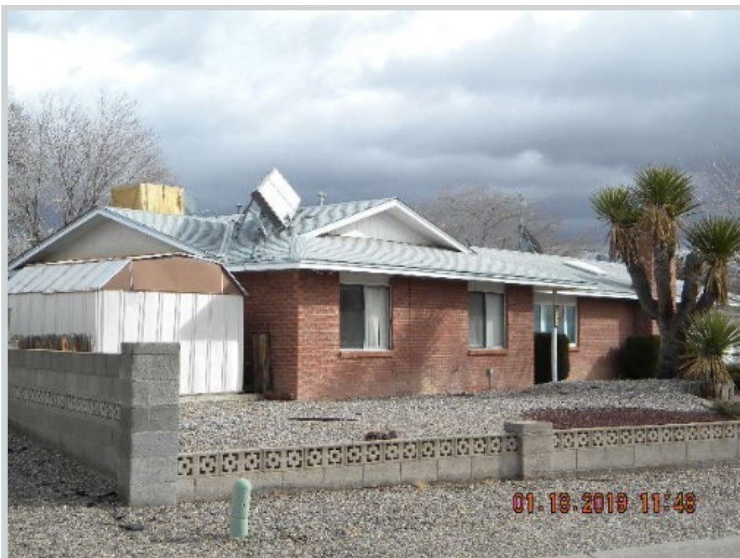
Subject 4807 Sombrerete Rd Se