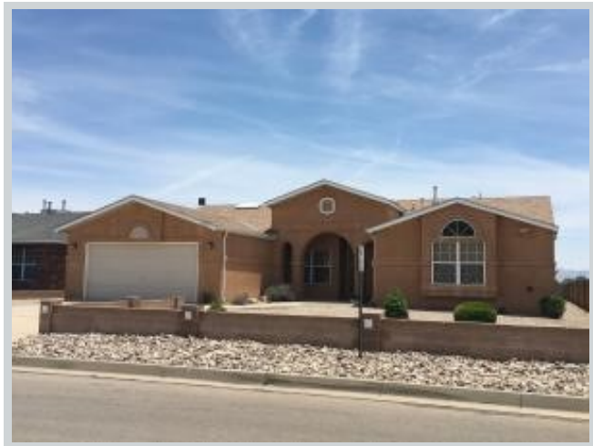
Sold Comp 3 4181 Foxwood Trl Se View Front