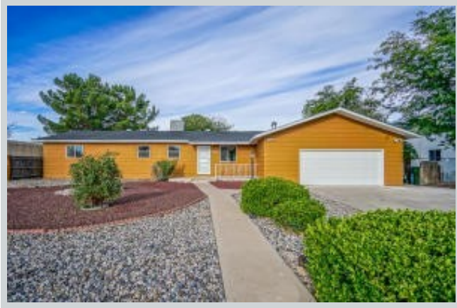
Listing Comp 3 303 Las Marias Dr Se View Front