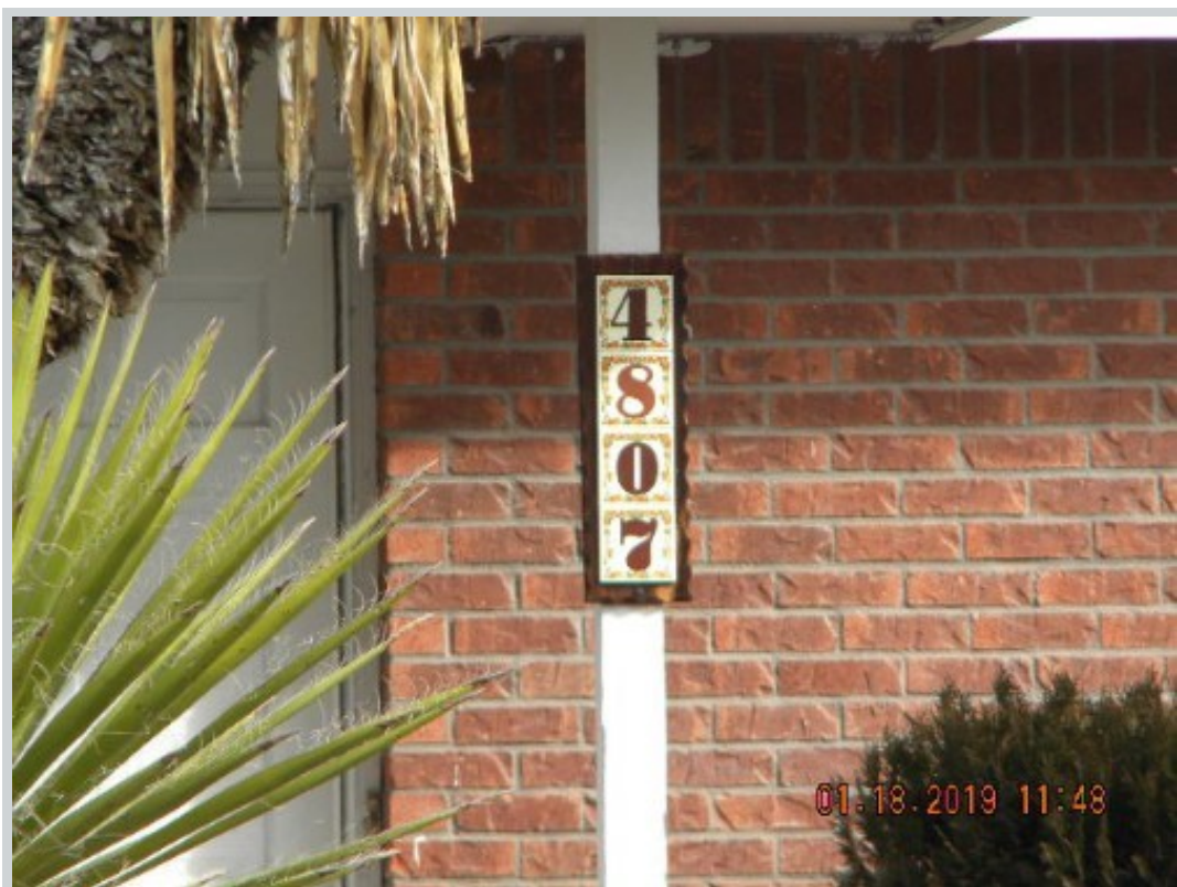
Subject 4807 Sombrerete Rd Se