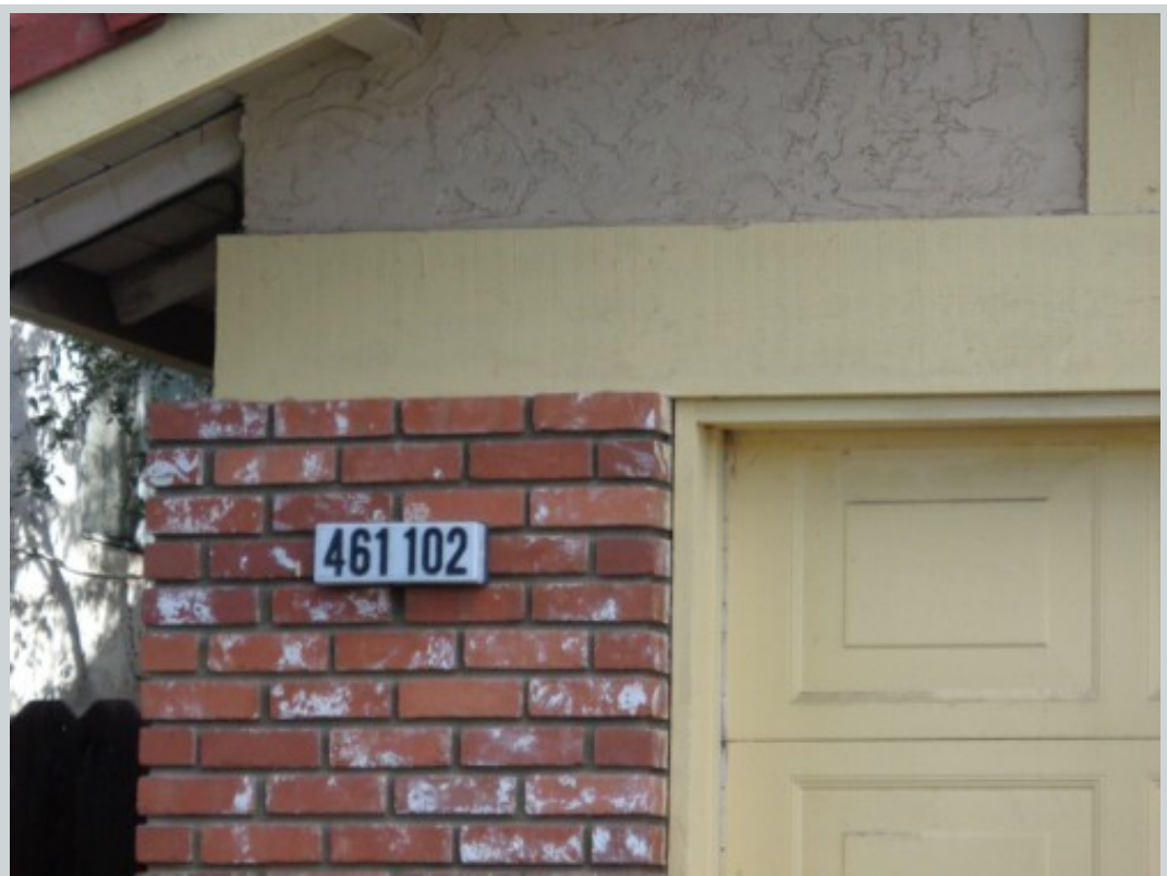
Subject 461 E Alluvial Ave Unit 102