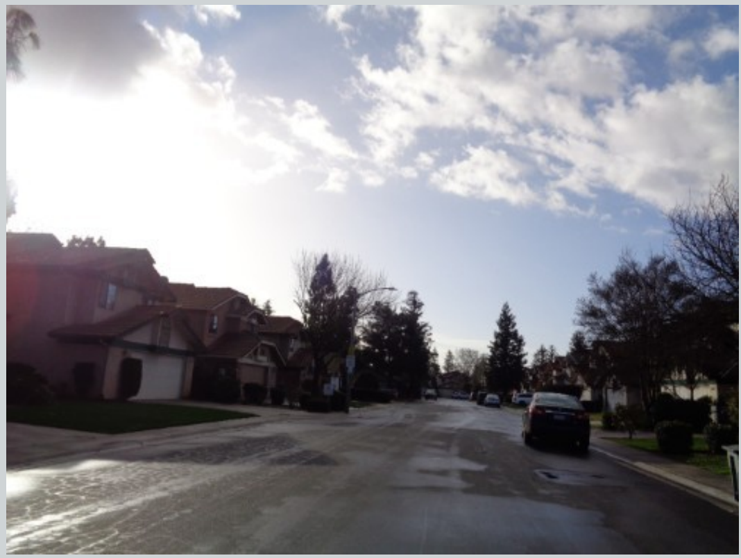
Subject 461 E Alluvial Ave Unit 102