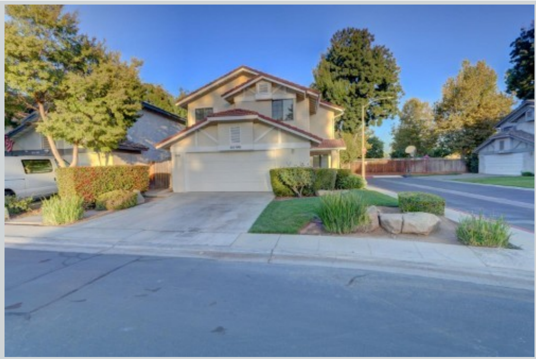
Sold Comp 1 503 E Alluvial #106