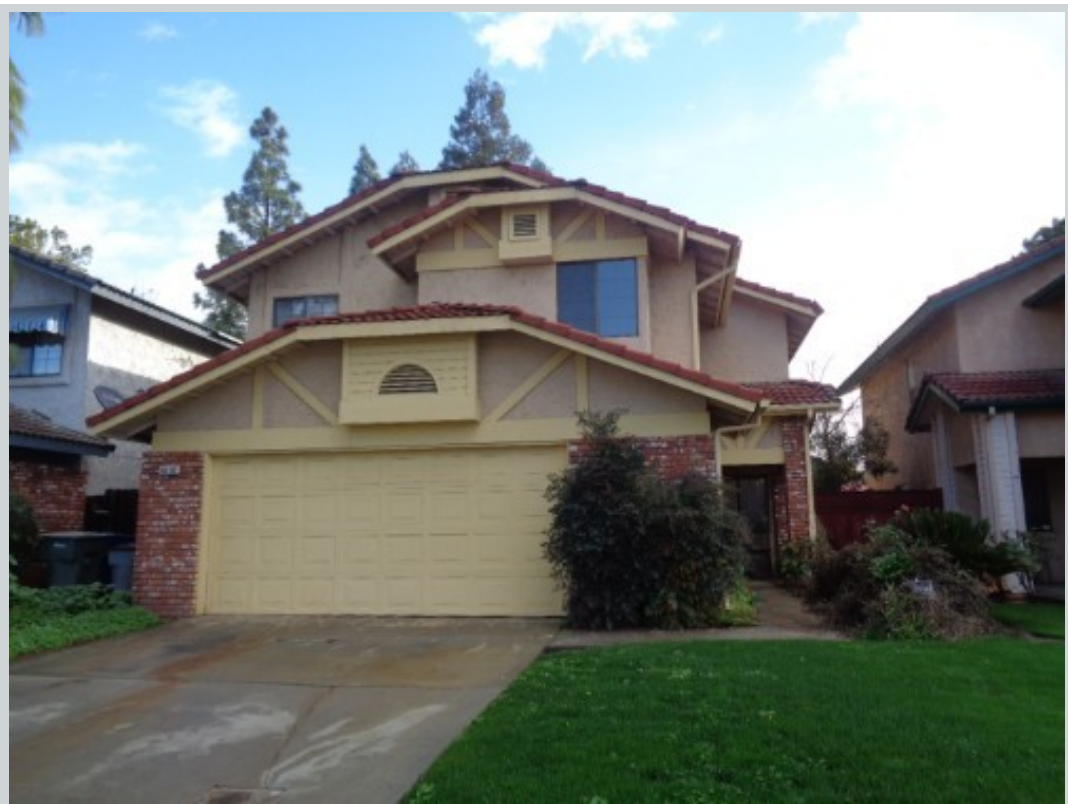
Subject 461 E Alluvial Ave Unit 102