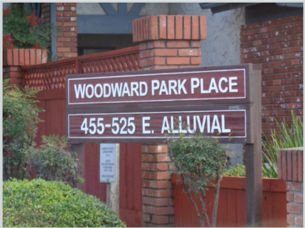
Subject 461 E Alluvial Ave Unit 102