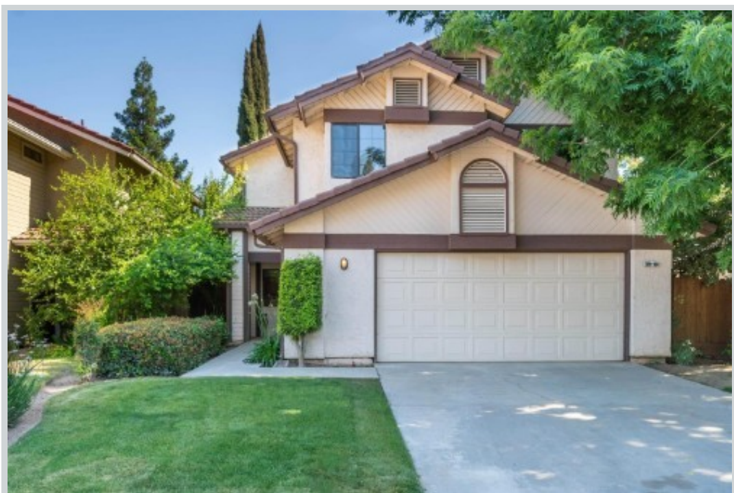
Sold Comp 3 509 E Alluvial #104