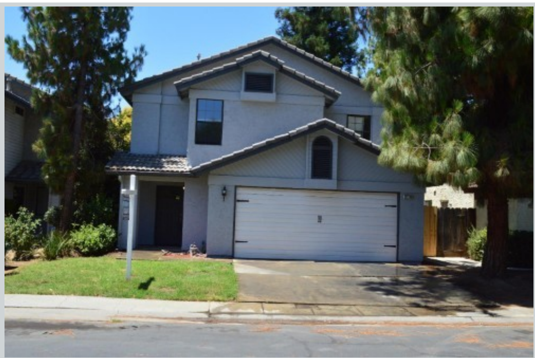
Sold Comp 2 521 E Alluvial #102