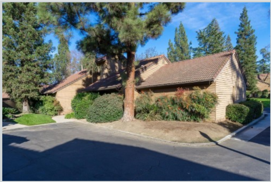
Listing Comp 2 2123 W Barstow