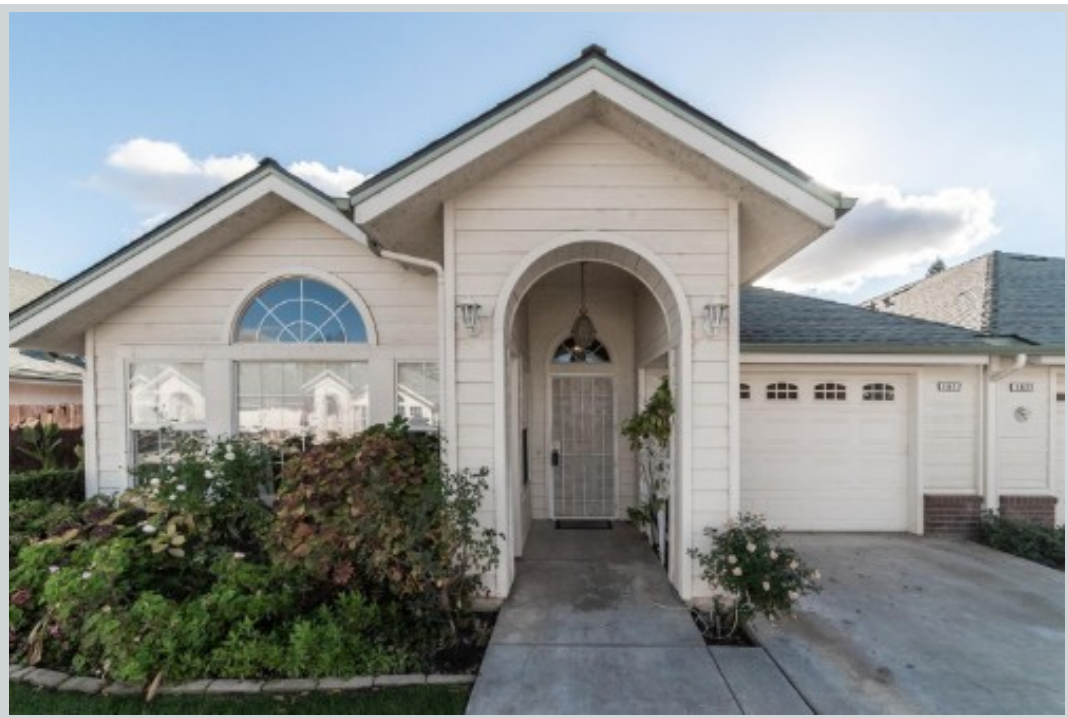
Listing Comp 3 1677 E Morningstar