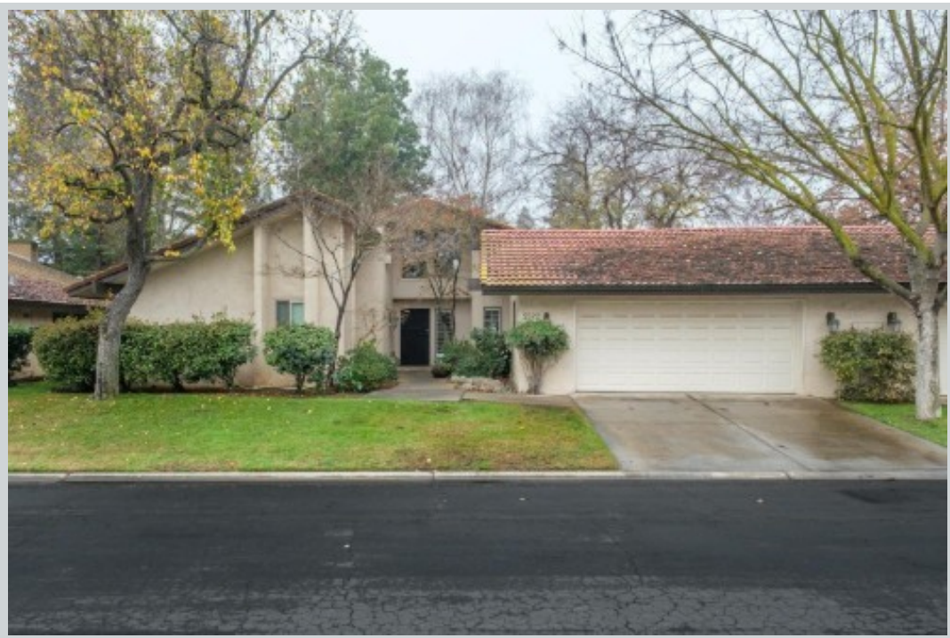
Listing Comp 1 5522 N El Adobe