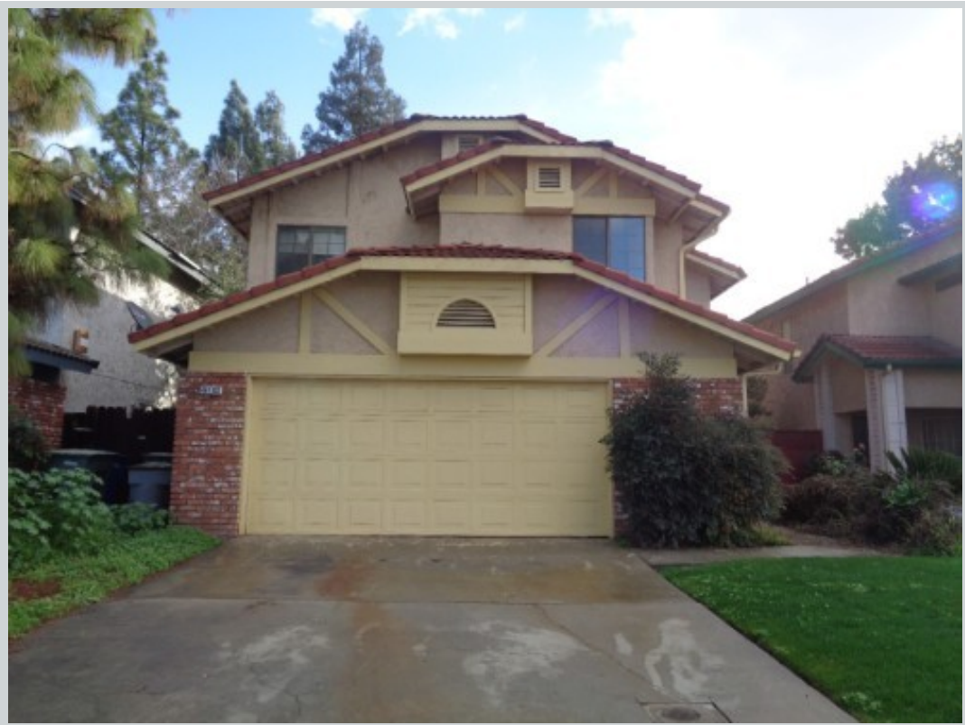
Subject 461 E Alluvial Ave Unit 102