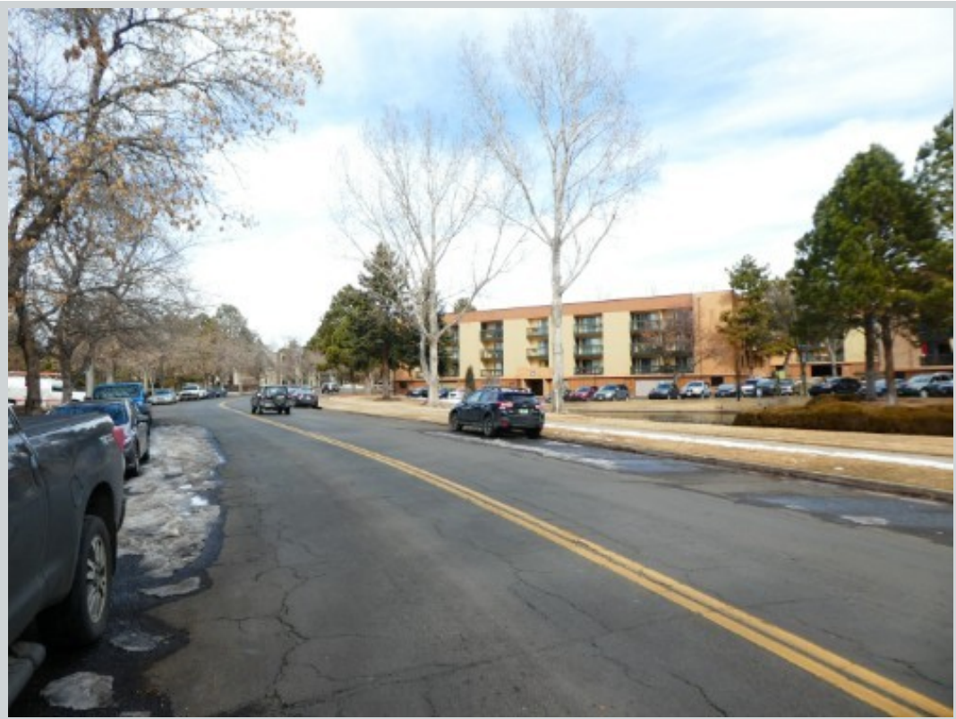
Subject 2525 S Dayton Way Apt 2304