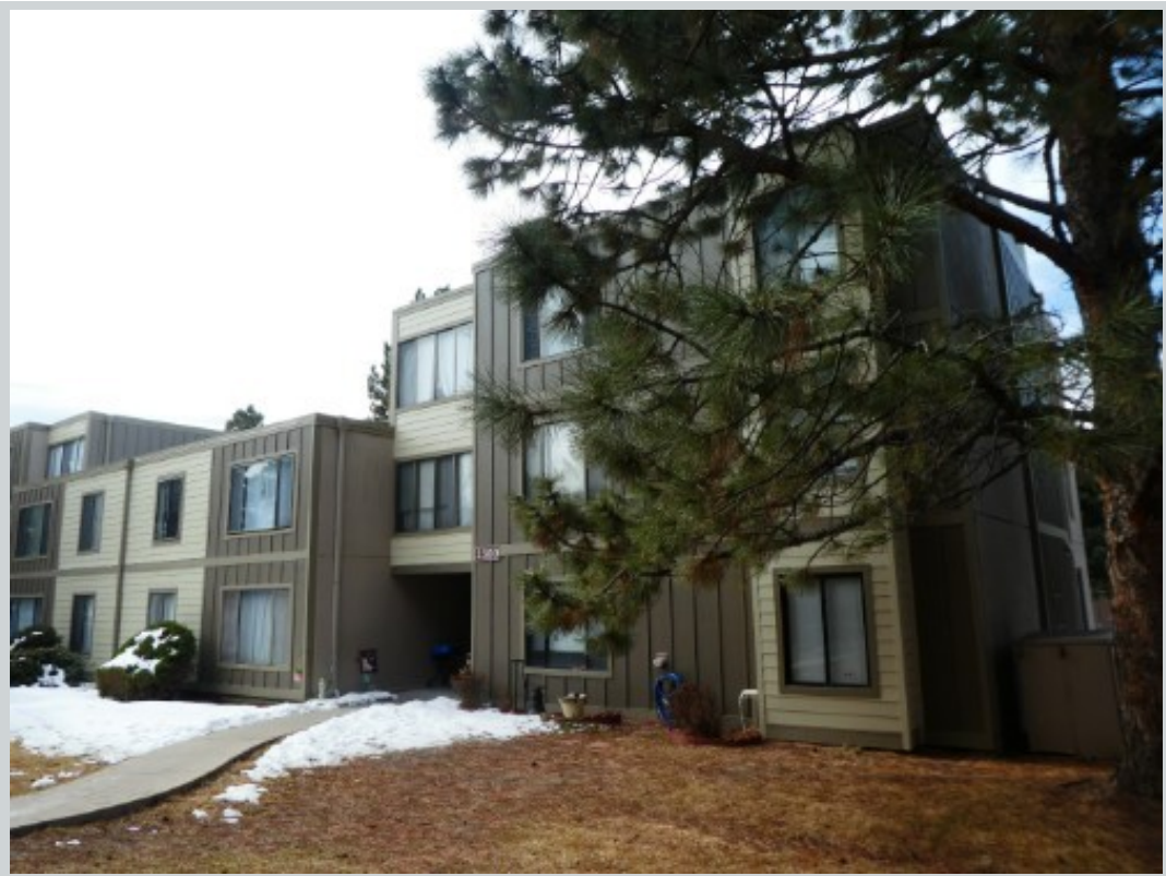
Subject 2525 S Dayton Way Apt 2304