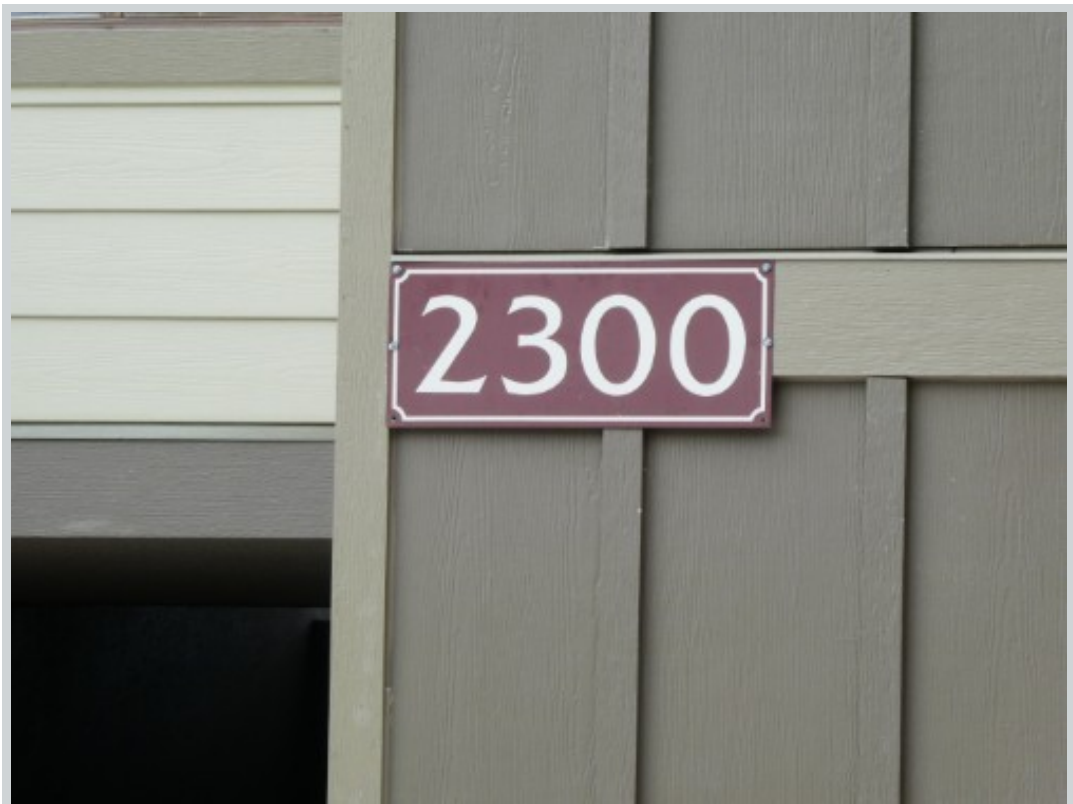
Subject 2525 S Dayton Way Apt 2304