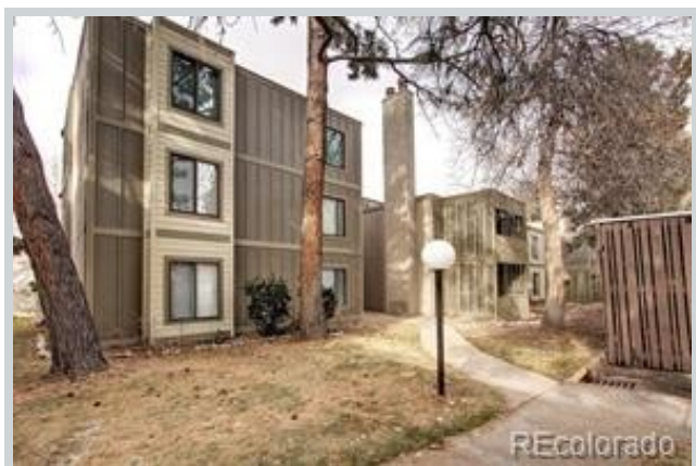
Listing Comp 1 2525 S Dayton Way Unit 1501 View Front