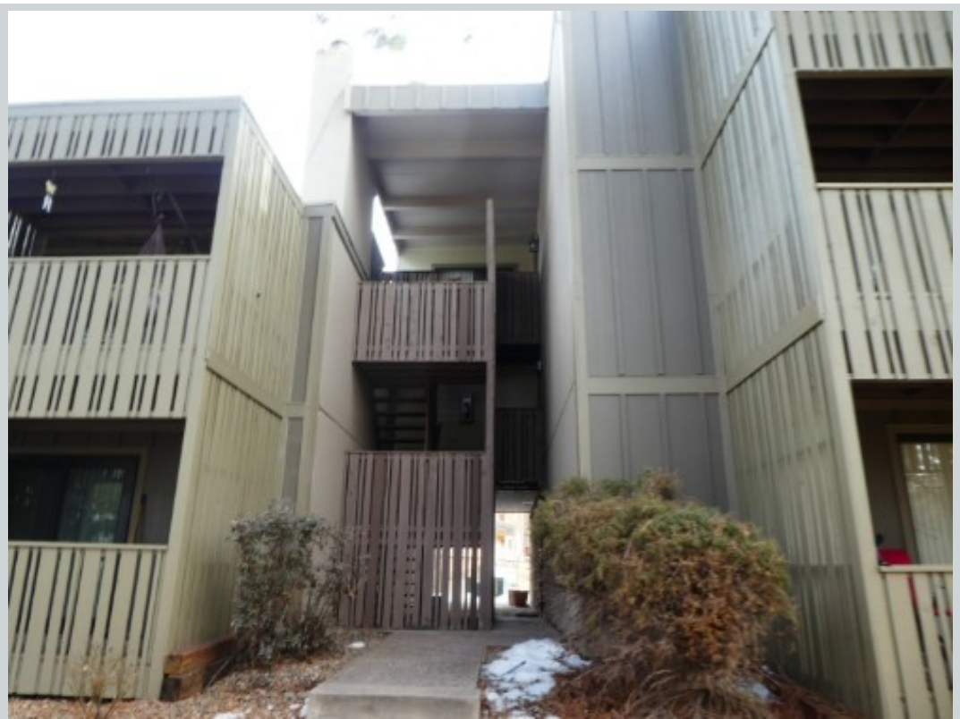
Subject 2525 S Dayton Way Apt 2304