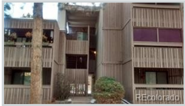
Listing Comp 2 2525 S Dayton Way Unit 2010 View Front