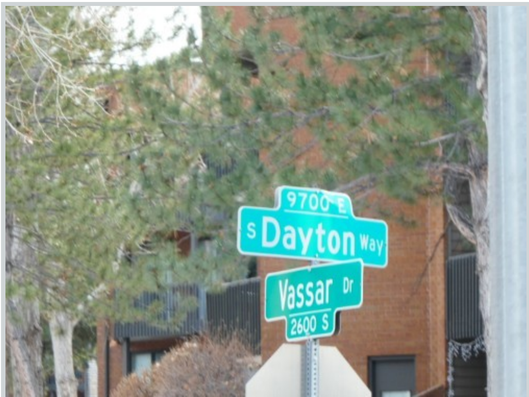
Subject 2525 S Dayton Way Apt 2304 View Other Comment "street sign"

Address 2525 S Dayton Way 2304, Denver, CO 80231 Loan Number 36911 Suggested List $220,000 Suggested Repaired $220,000 Sale $215,000