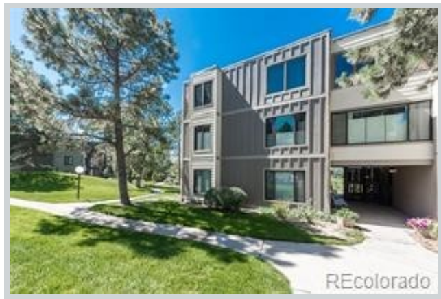
Sold Comp 3 2525 S Dayton Way Unit 1605 View Front