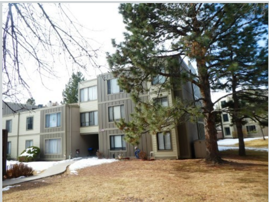
Subject 2525 S Dayton Way Apt 2304