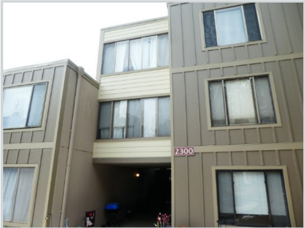
Subject 2525 S Dayton Way Apt 2304