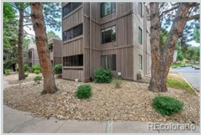
Sold Comp 2 2525 S Dayton Way Unit 2204 View Front