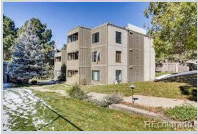
Sold Comp 1 2525 S Dayton Way Unit 1610 View Front