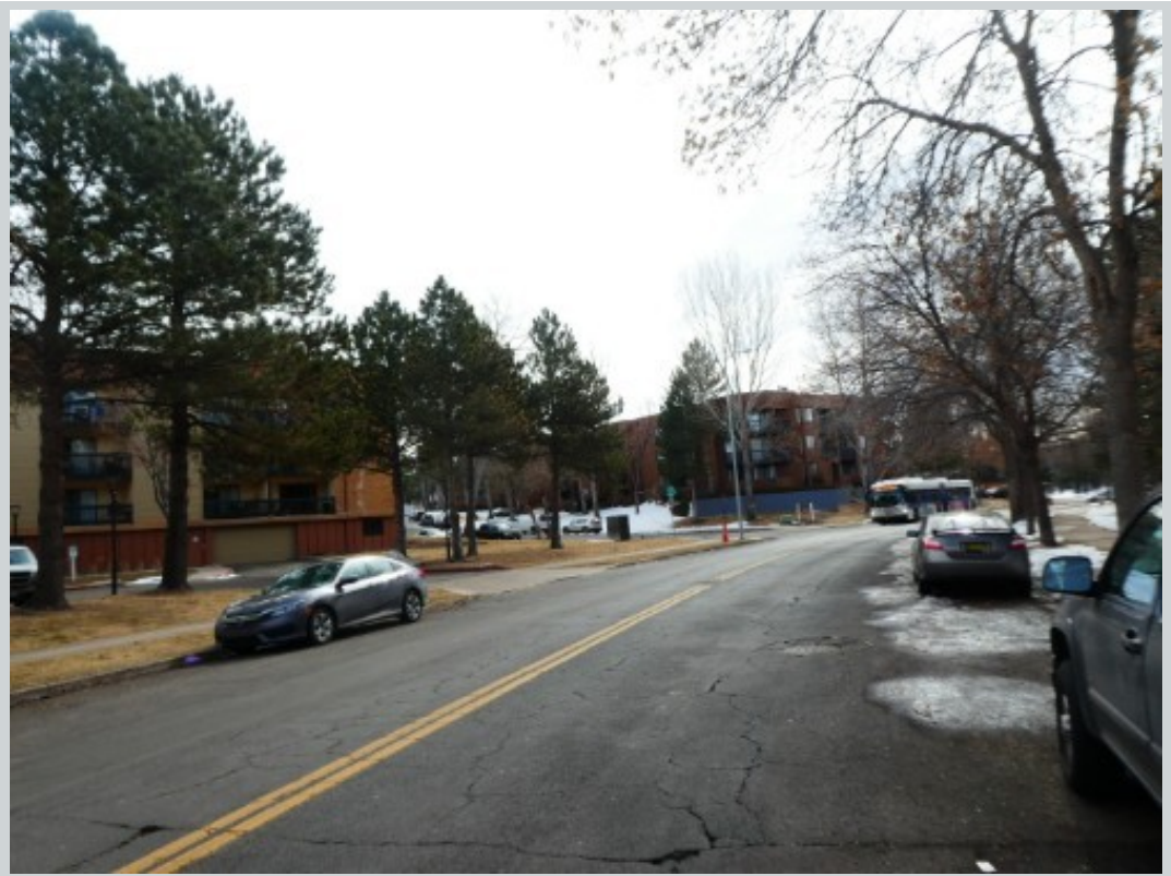
Subject 2525 S Dayton Way Apt 2304