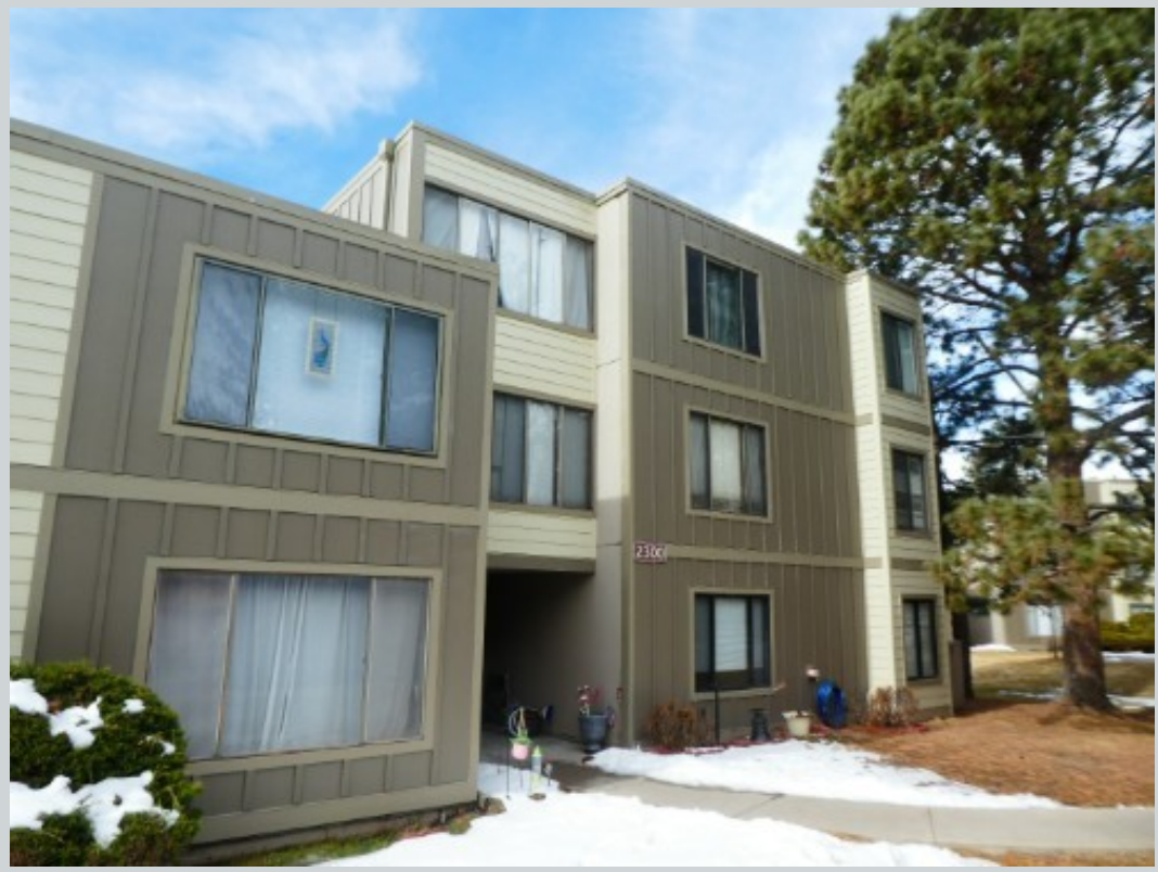
Subject 2525 S Dayton Way Apt 2304