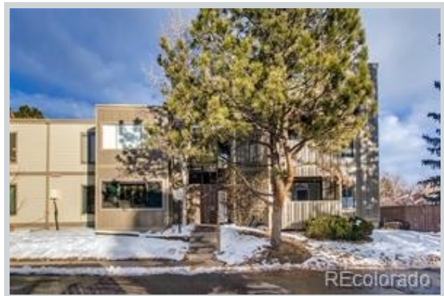
Listing Comp 3 2525 S Dayton Way Unit 2004 View Front