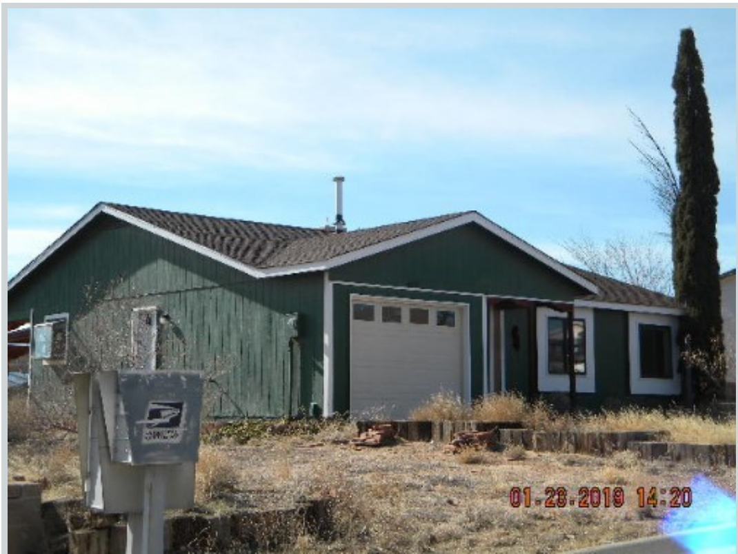
Subject 4692 Platinum Dr Ne View Side Comment "Left side"

Address 4692 Platinum Drive Ne, Rio Rancho, NM 87124 Loan Number 36925 Suggested List $128,000 Suggested Repaired $130,000 Sale $125,000