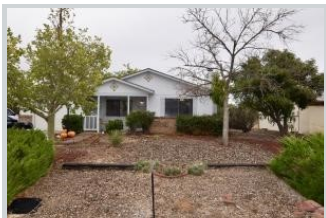
Listing Comp 1 395 Bermuda Dr View Front