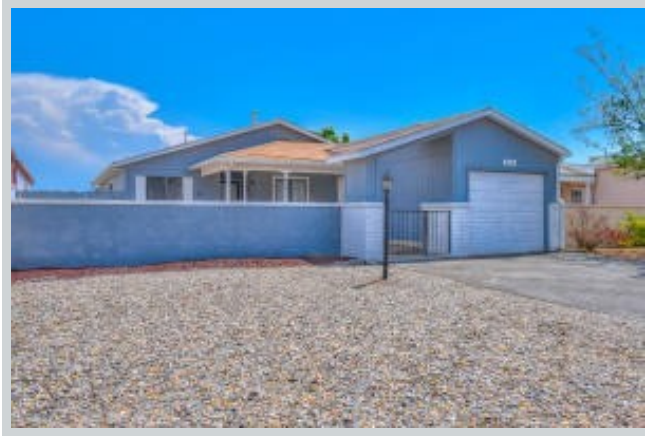
Sold Comp 1 160 Pearl Dr Ne View Front