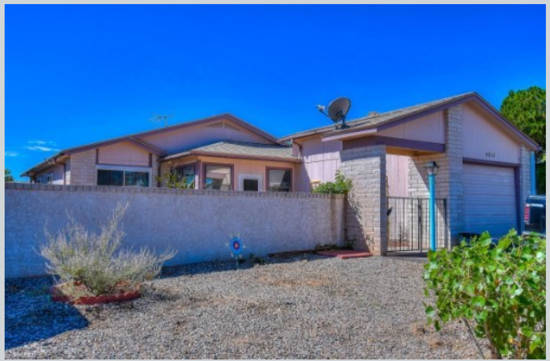
Sold Comp 2 4882 Nickel Dr Ne View Front