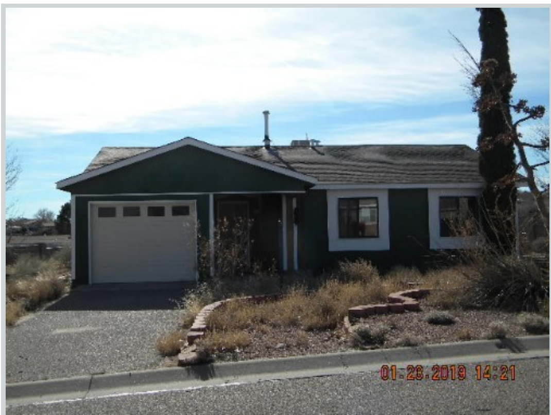
Subject 4692 Platinum Dr Ne