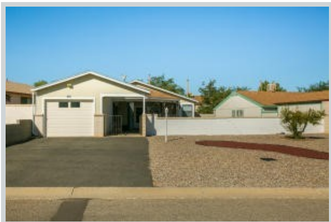
Sold Comp 3 4761 Platinum Dr Ne View Front