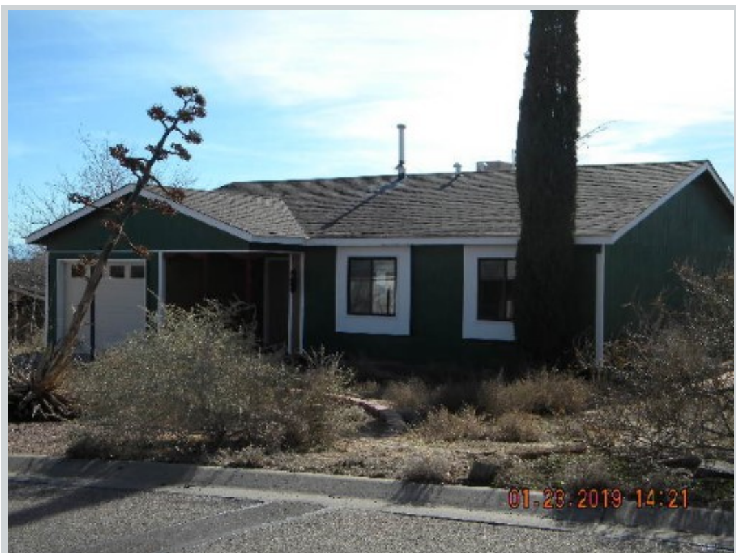
Subject 4692 Platinum Dr Ne View Side Comment "Right side"