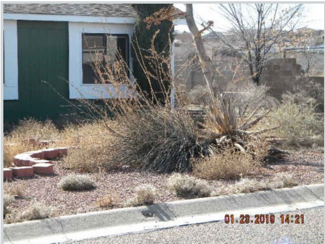
Subject 4692 Platinum Dr Ne View Other Comment "Landscape clean-up"

Address 4692 Platinum Drive Ne, Rio Rancho, NM 87124 Loan Number 36925 Suggested List $128,000 Suggested Repaired $130,000 Sale $125,000