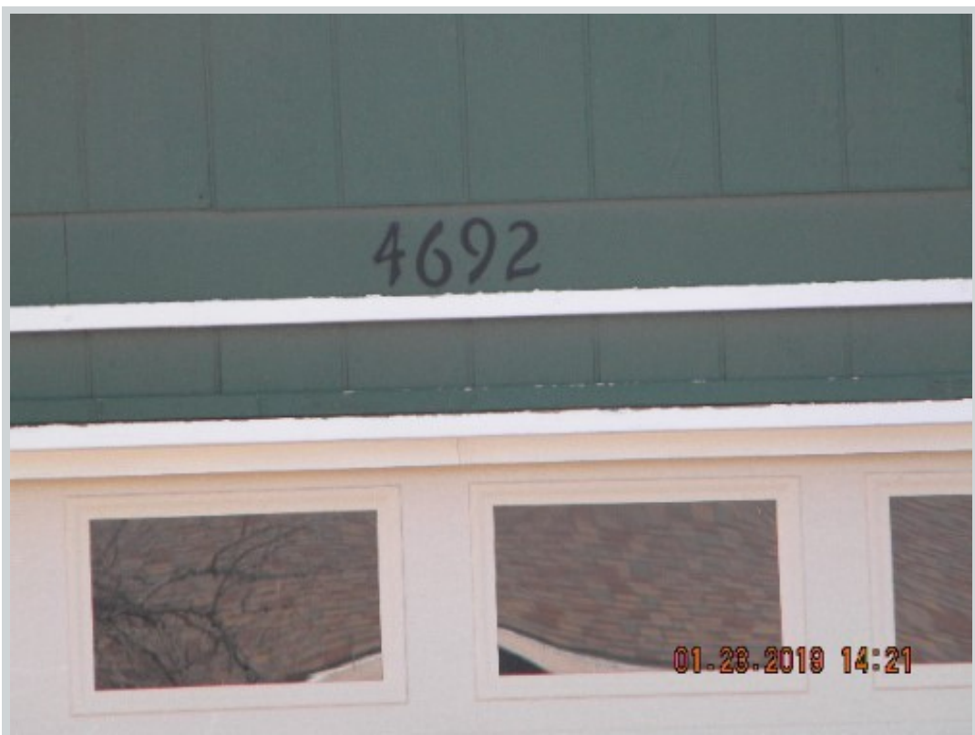
Subject 4692 Platinum Dr Ne