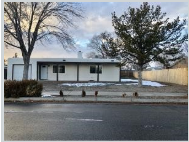
Listing Comp 3 303 San Juan De Rio Dr Se View Front