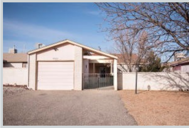
Listing Comp 2 4909 Turquoise Dr Ne View Front