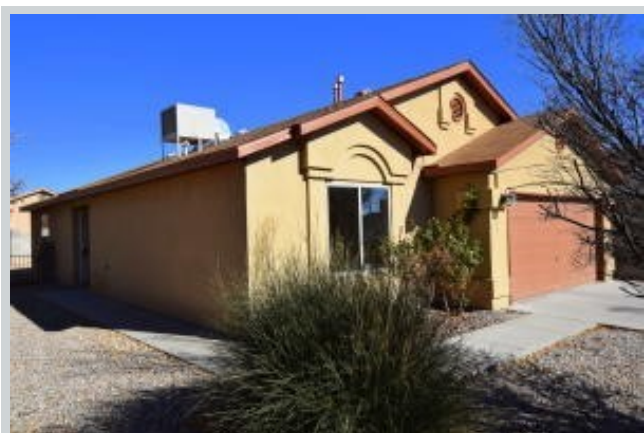
Sold Comp 1 7711 Saltbrush Rd Sw View Front