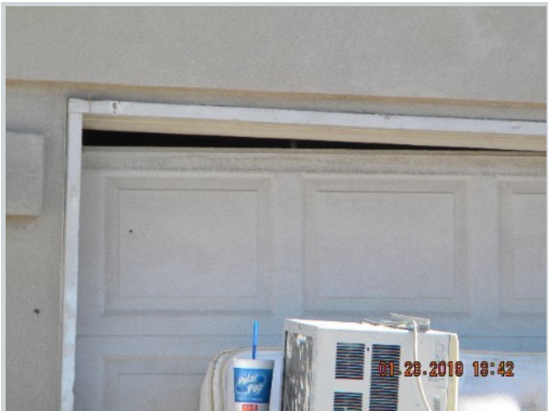
Subject 1940 Desert Breeze Dr Sw View Other Comment "Damaged garage door"

Address 1940 Desert Breeze Drive Sw, Albuquerque, NM 87121 Loan Number 36926 Suggested List $143,000 Suggested Repaired $146,000 Sale $140,000