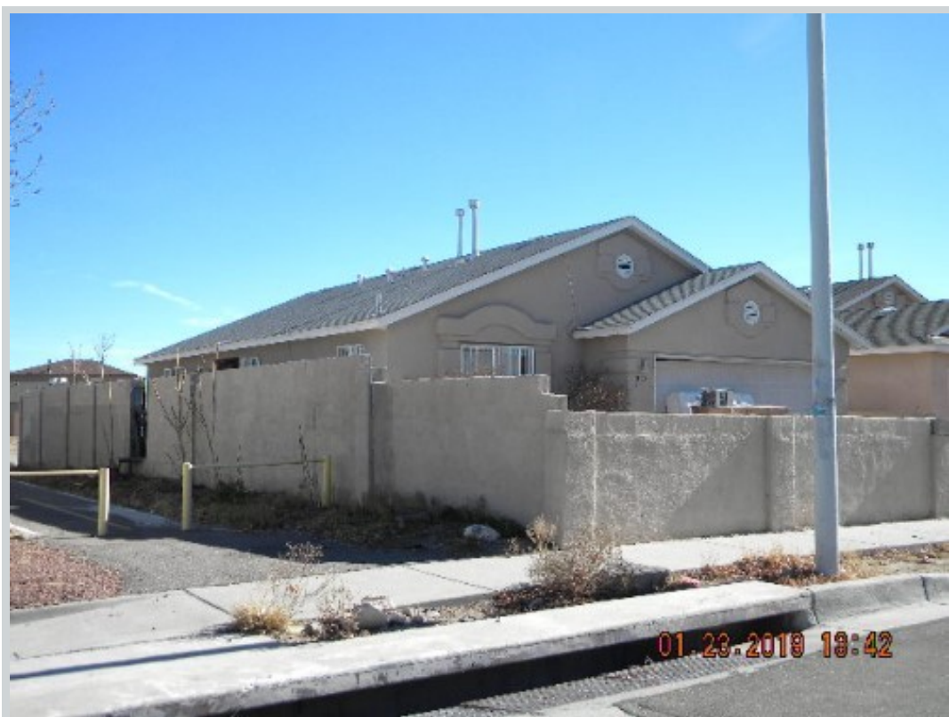
Subject 1940 Desert Breeze Dr Sw View Side Comment "Left side"