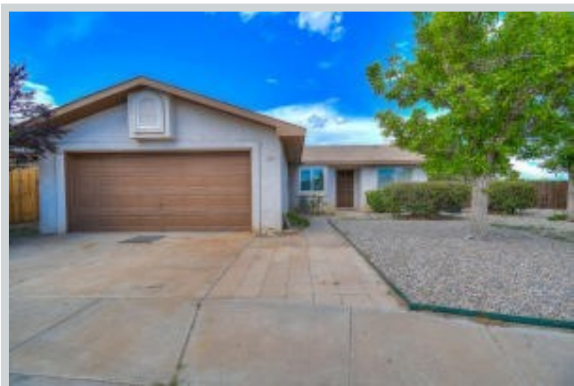
Listing Comp 3 8701 Sunridge Rd Sw View Front

Address 1940 Desert Breeze Drive Sw, Albuquerque, NM 87121 Loan Number 36926 Suggested List $143,000 Suggested Repaired $146,000 Sale $140,000