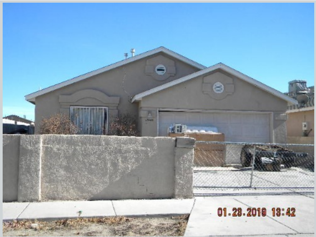
Subject 1940 Desert Breeze Dr Sw