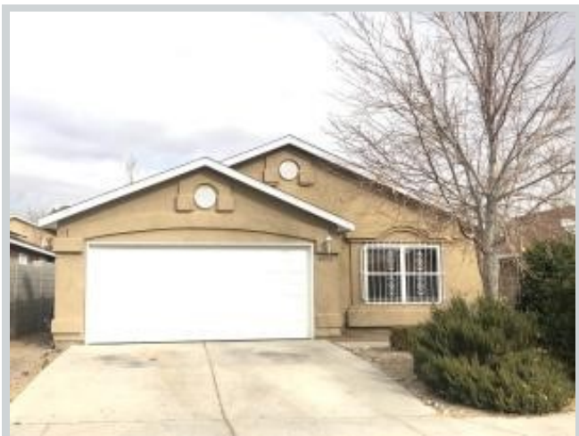
Listing Comp 2 8723 Stony Creek Rd Sw View Front