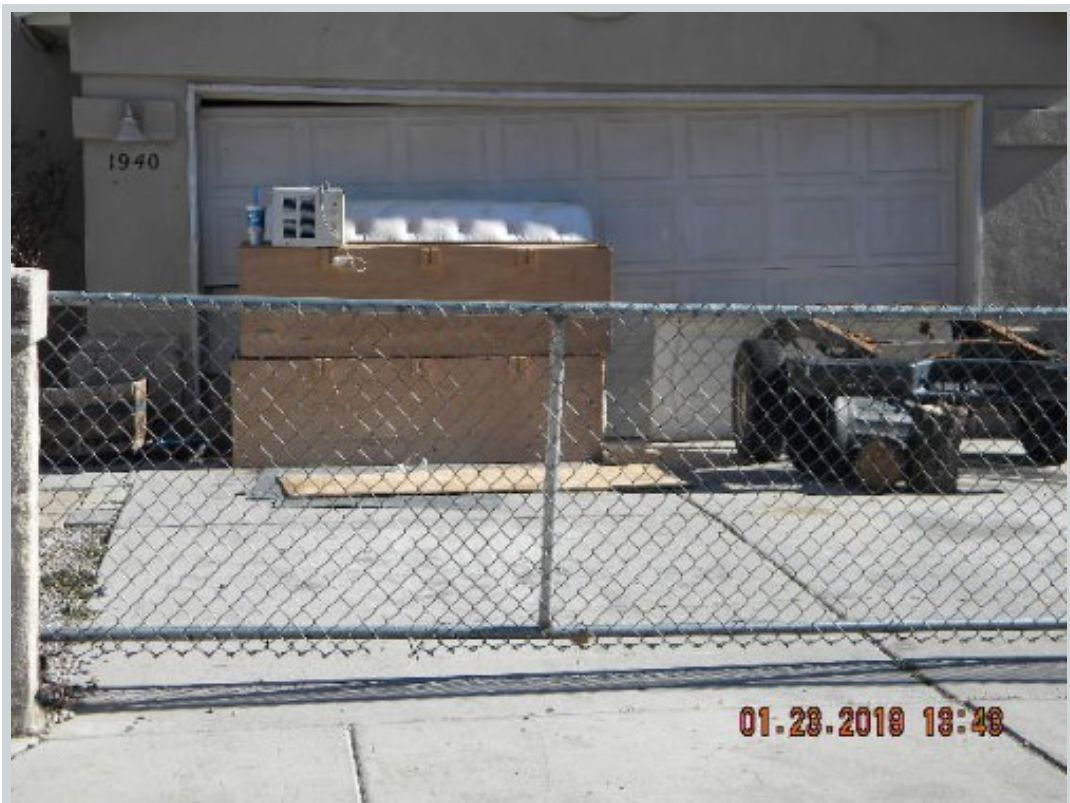
Subject 1940 Desert Breeze Dr Sw View Other Comment "Trash removal"