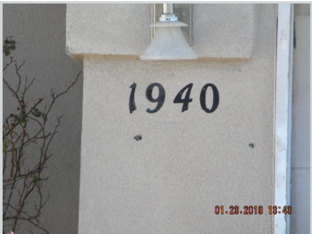
Subject 1940 Desert Breeze Dr Sw