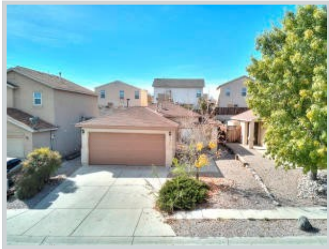
Sold Comp 2 1325 Arroyo Hondo St Sw View Front