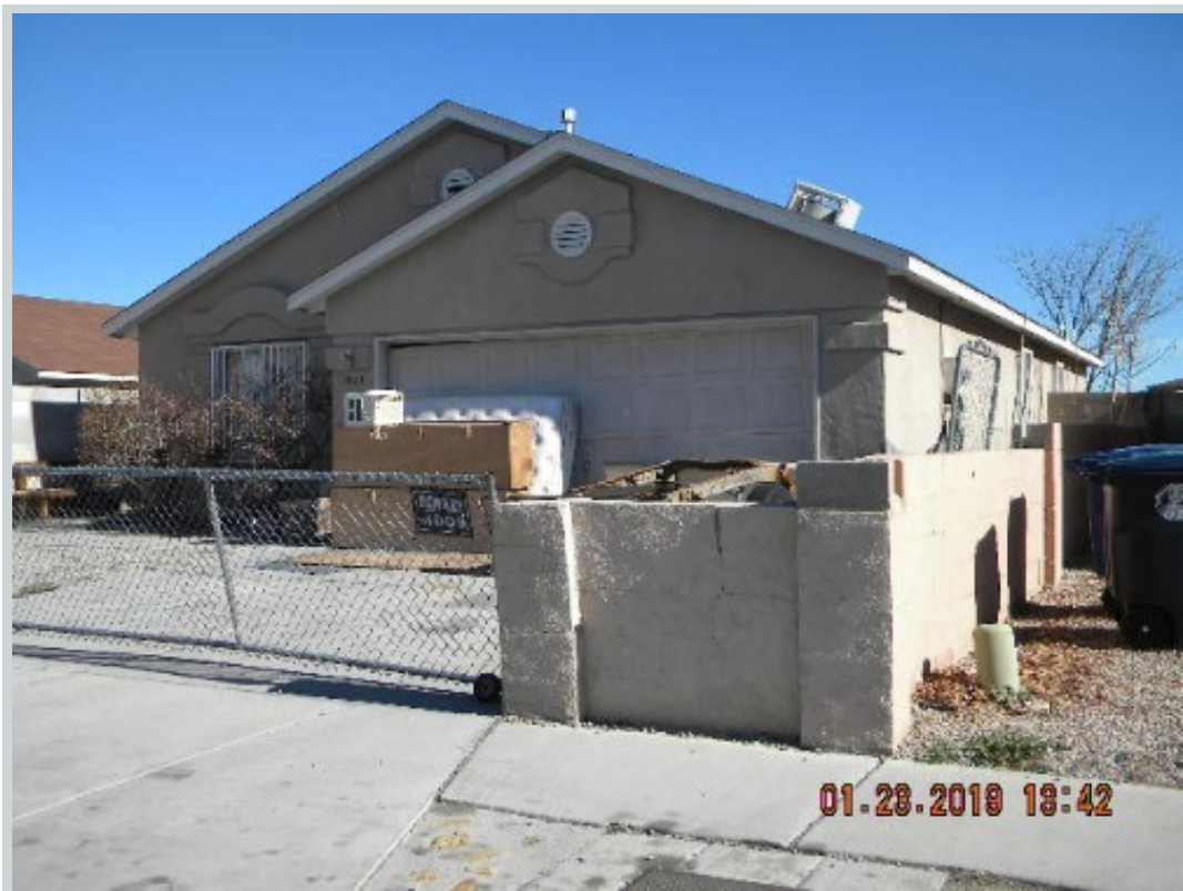
Subject 1940 Desert Breeze Dr Sw View Side Comment "Right side"

Address 1940 Desert Breeze Drive Sw, Albuquerque, NM 87121 Loan Number 36926 Suggested List $143,000 Suggested Repaired $146,000 Sale $140,000