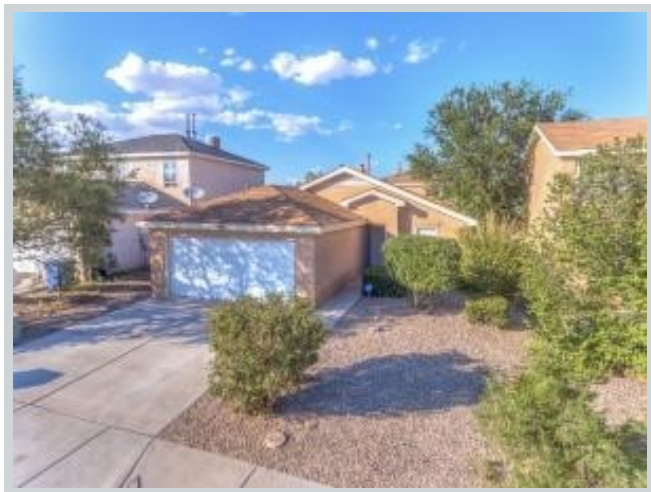
Sold Comp 3 7809 Desert Canyon Pl Sw View Front