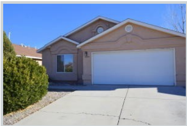
Listing Comp 1 2204 Desert Breeze Dr Sw View Front

Address 1940 Desert Breeze Drive Sw, Albuquerque, NM 87121 Loan Number 36926 Suggested List $143,000 Suggested Repaired $146,000 Sale $140,000