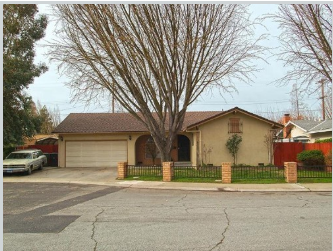
Listing Comp 1 2605 Jennifer Dr