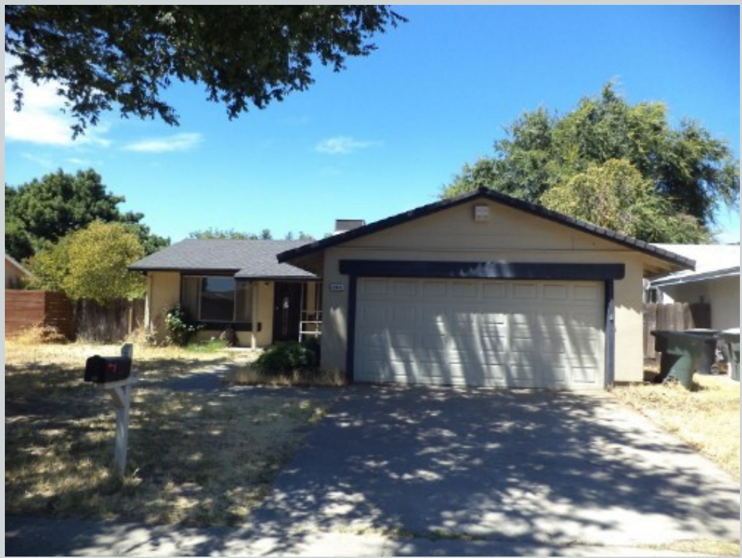
Sold Comp 1 1925 Mather Dr