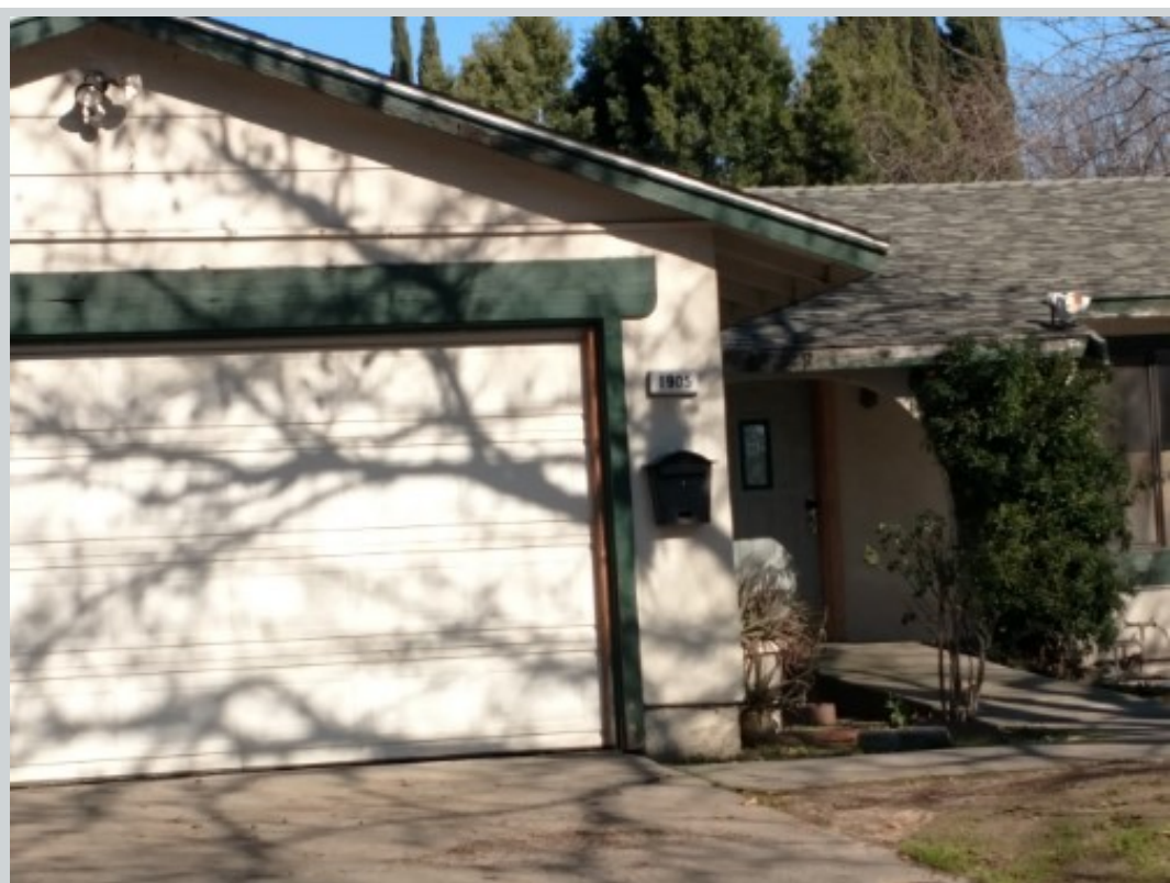
Subject 1905 Mather Dr