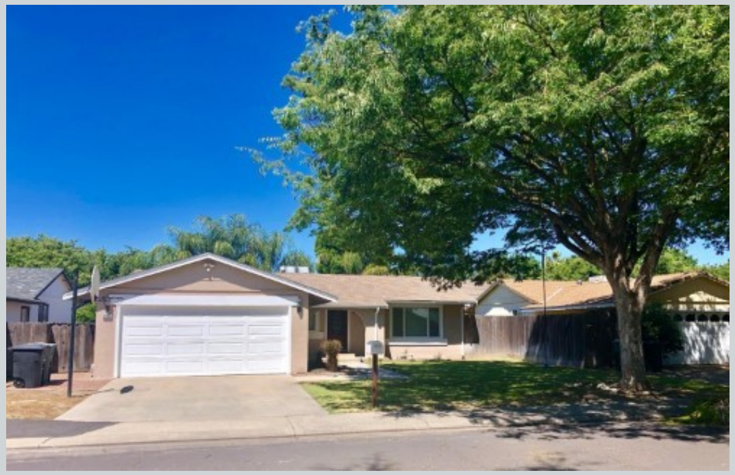
Sold Comp 3 3105 Wyatt Way