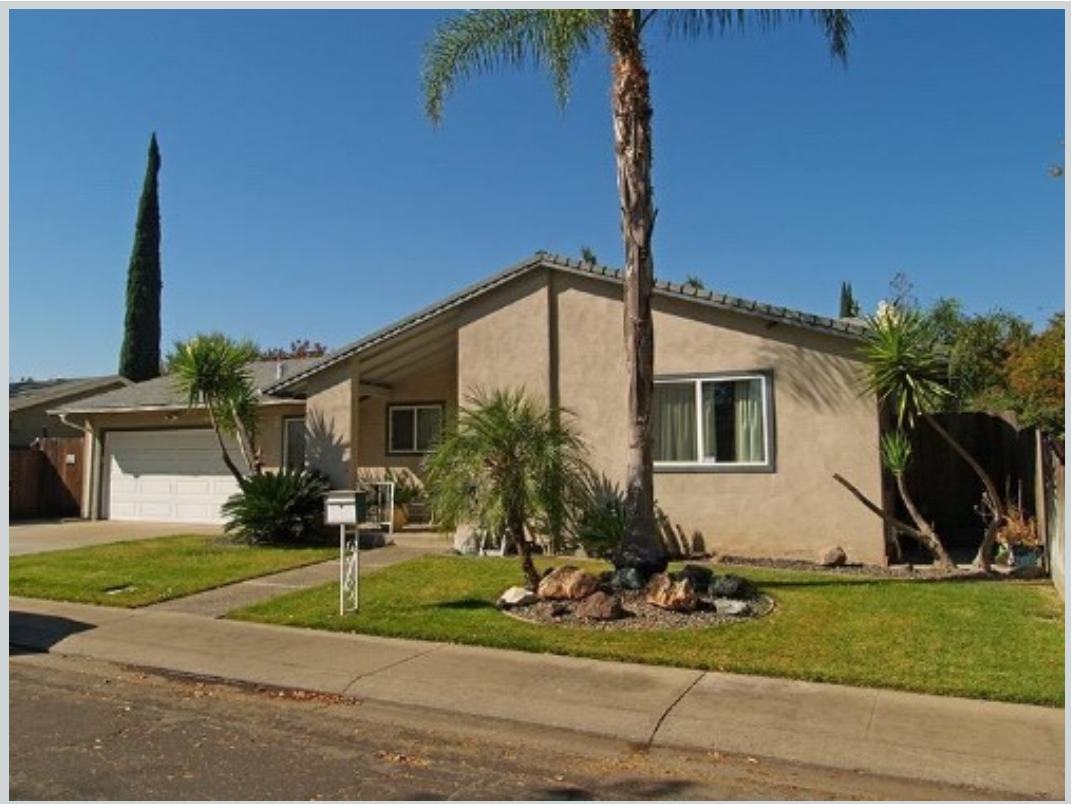
Listing Comp 3 3017 Wyatt