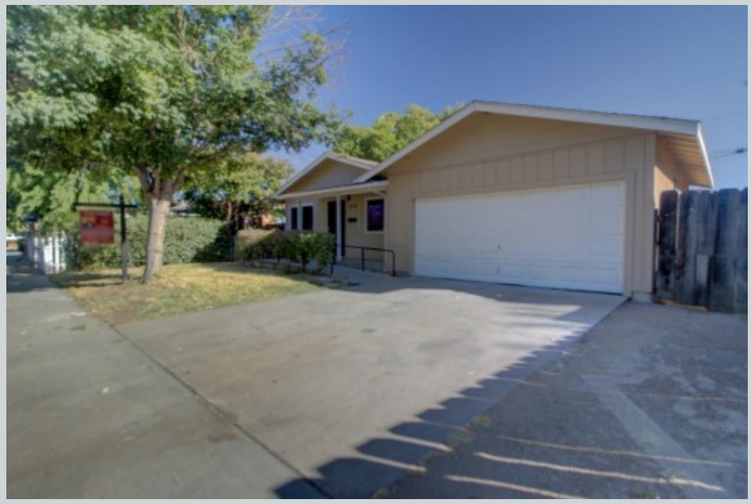
Listing Comp 2 1912 Hunt Ave