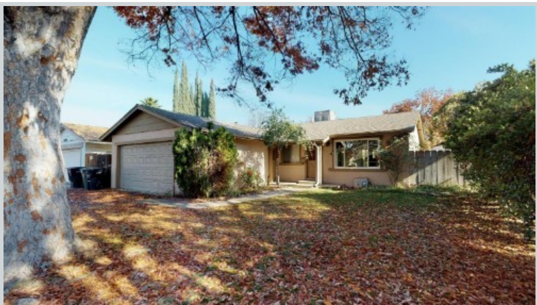
Sold Comp 2 3108 Wilton Pl