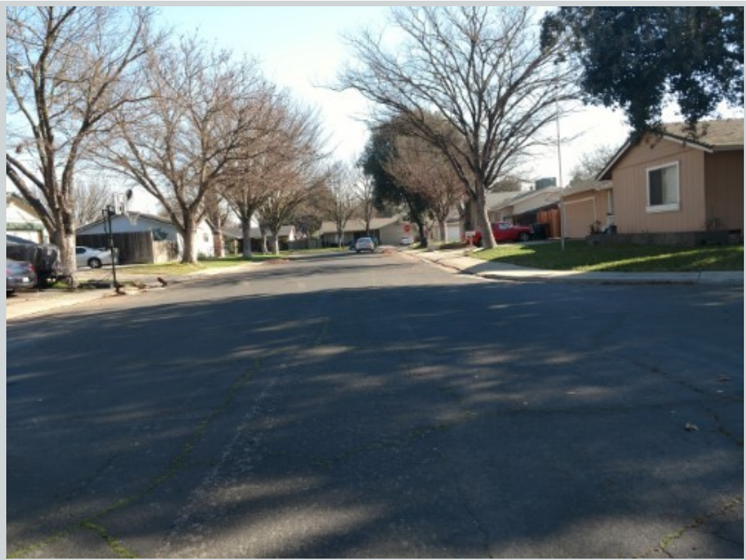
Subject 1905 Mather Dr