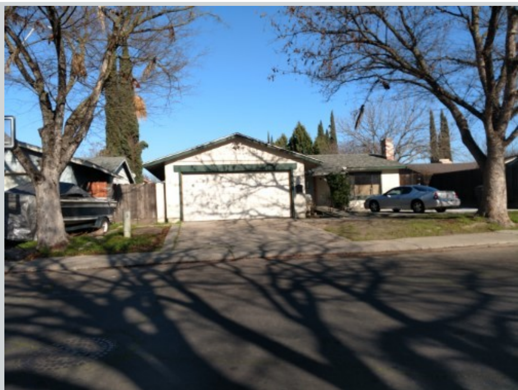
Subject 1905 Mather Dr