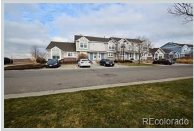
Listing Comp 3 5890 Ceylon St Unit B101 View Front