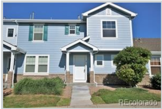
Sold Comp 3 5758 Danube St Unit E View Front