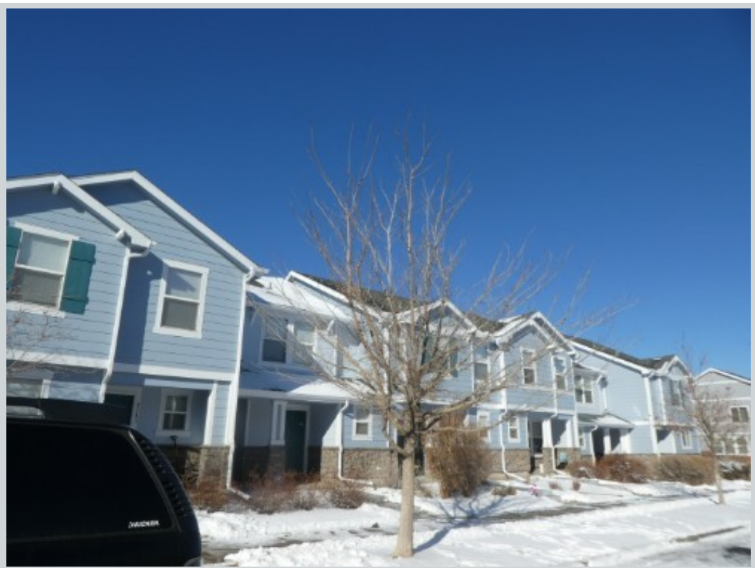
Subject 5783 Ceylon St