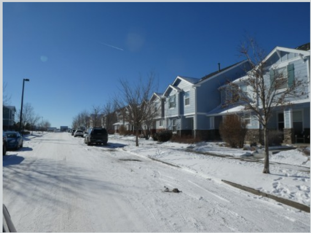
Subject 5783 Ceylon St