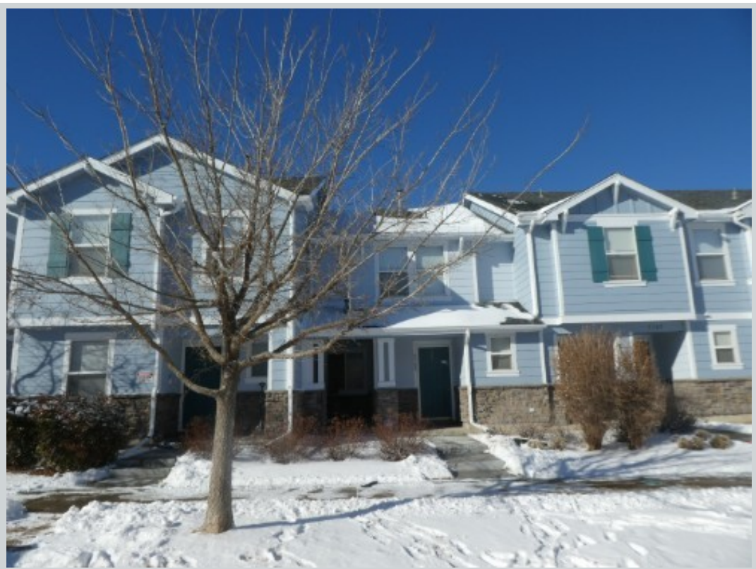
Subject 5783 Ceylon St