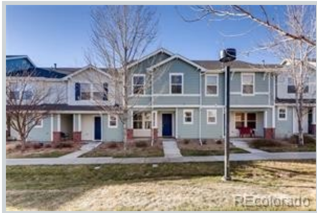
Sold Comp 1 19013 E 58th Ave View Front