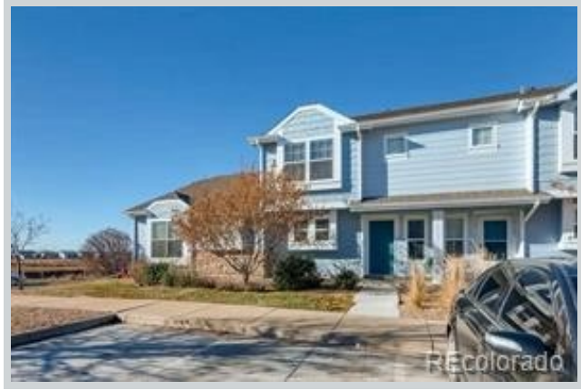
Sold Comp 2 18986 E 57th Pl Unit B View Front