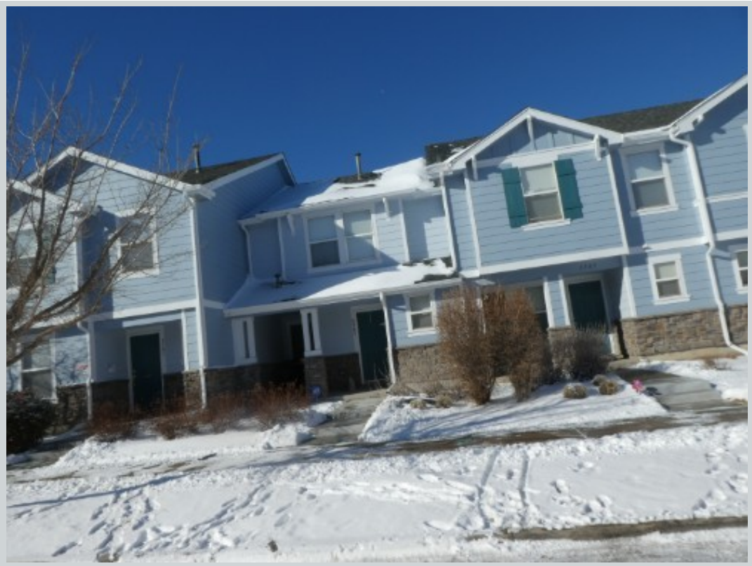
Subject 5783 Ceylon St