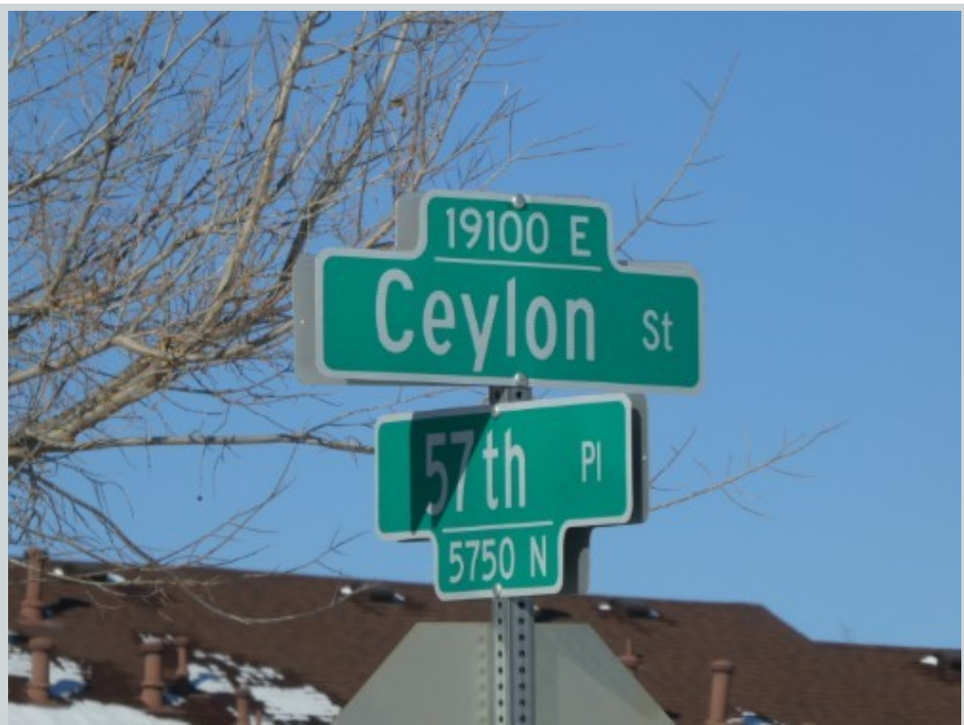
Subject 5783 Ceylon St