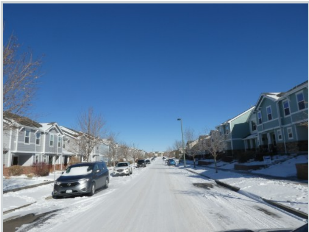
Subject 5783 Ceylon St