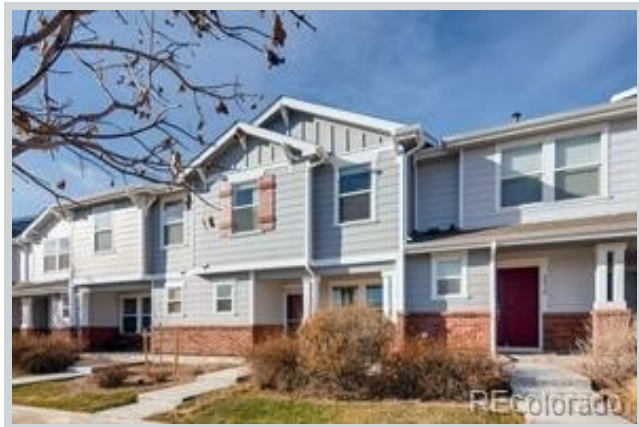
Listing Comp 2 5813 Ceylon St View Front