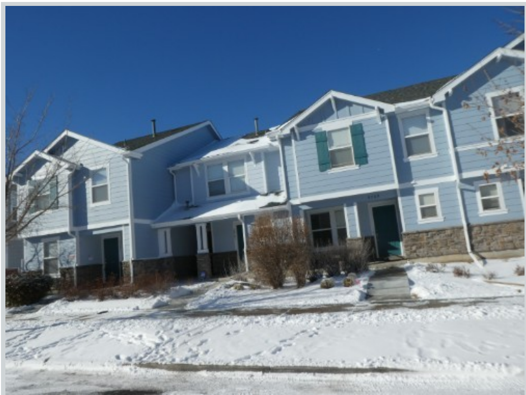
Subject 5783 Ceylon St

Address 5783 Ceylon Street, Denver, CO 80249 Loan Number 36942 Suggested List $267,000 Suggested Repaired $267,000 Sale $263,000