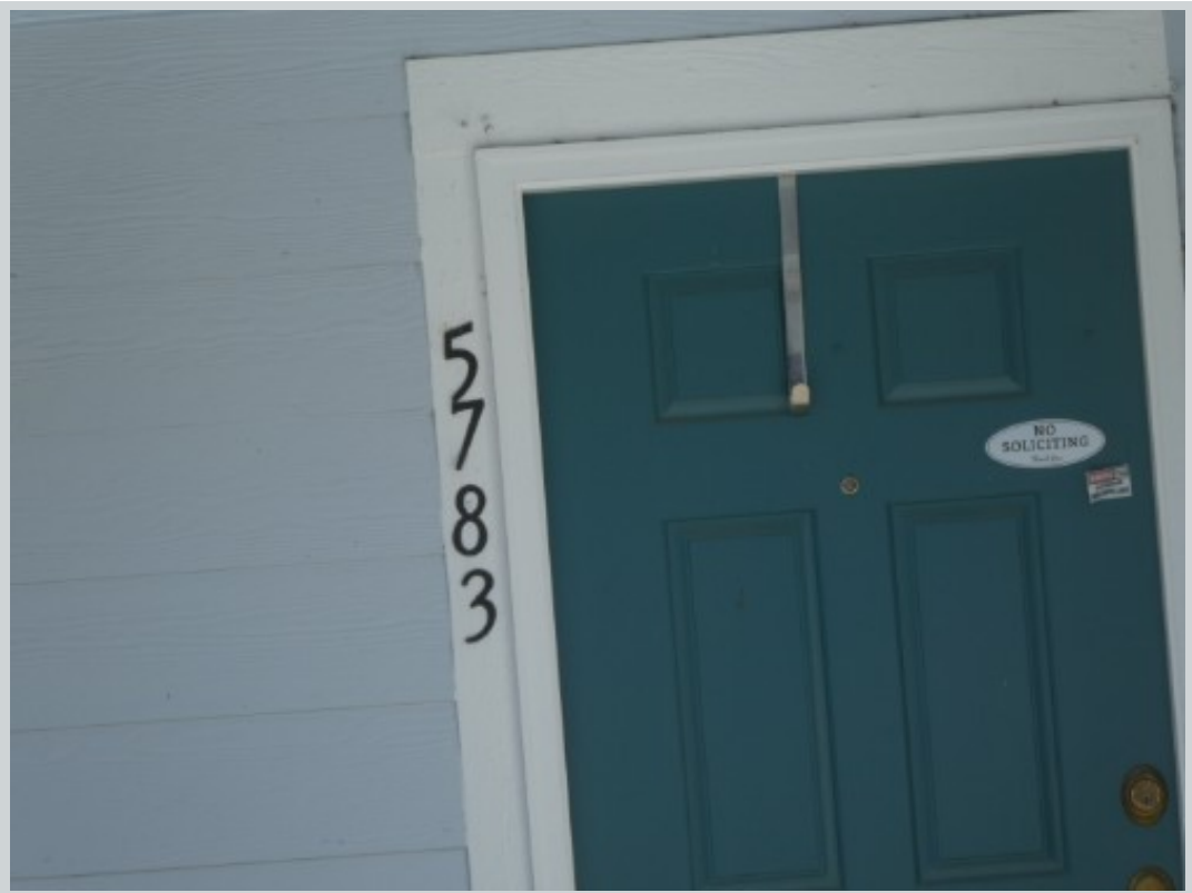
Subject 5783 Ceylon St