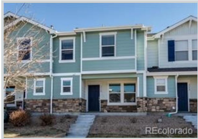
Listing Comp 1 5760 Ceylon St View Front