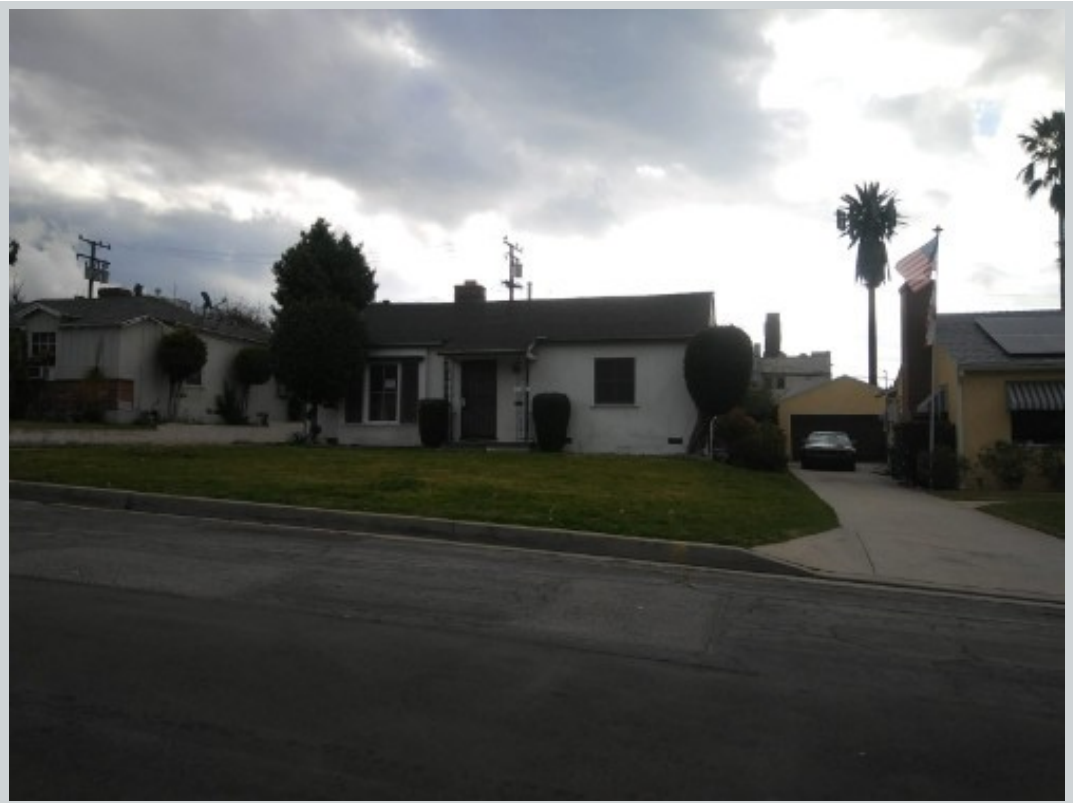
Subject 2548 La Fiesta Ave