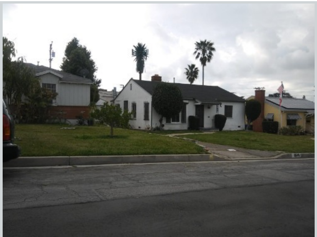
Subject 2548 La Fiesta Ave