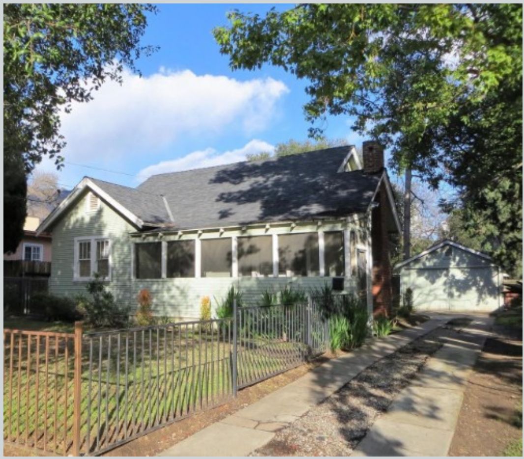
Listing Comp 1 1948 Juanita Ave