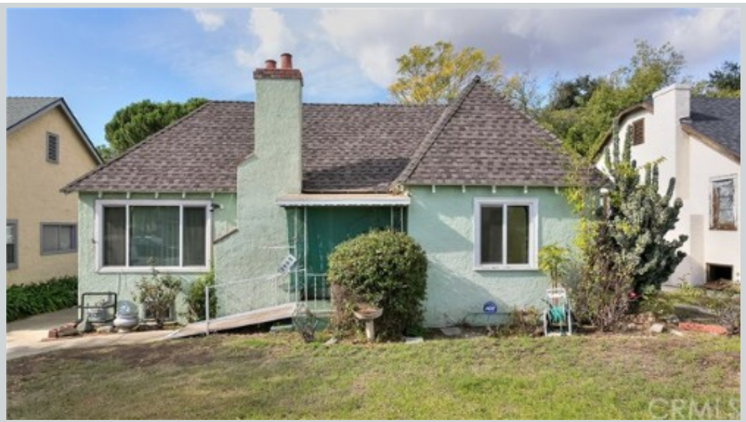
Sold Comp 3 2665 Glenrose Ave