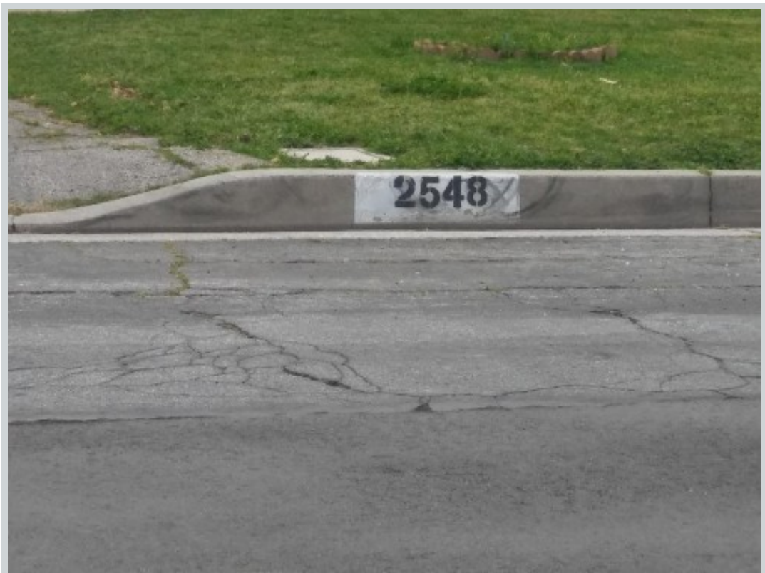
Subject 2548 La Fiesta Ave