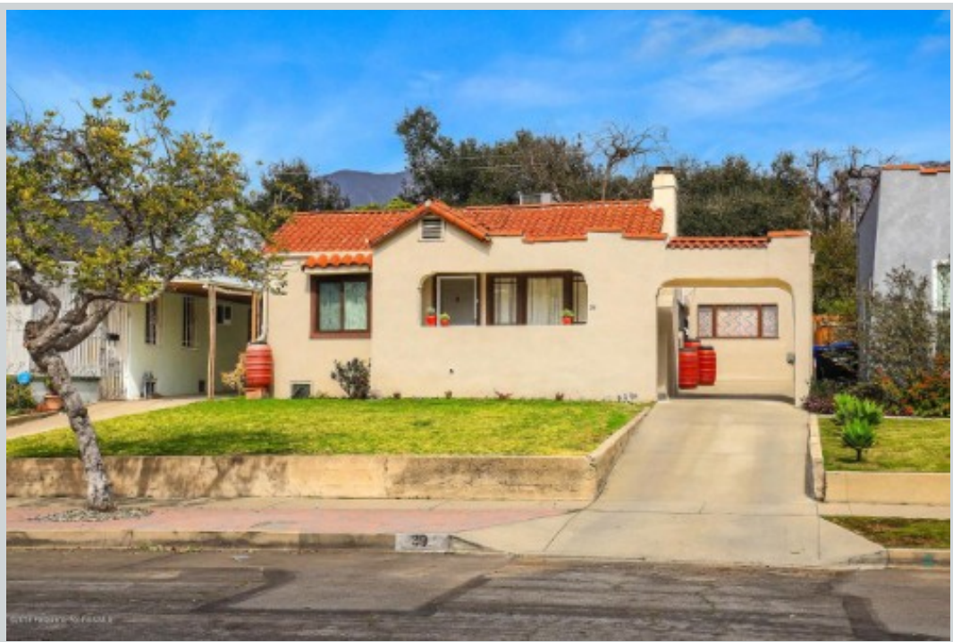
Listing Comp 2 39 W Mendocino St