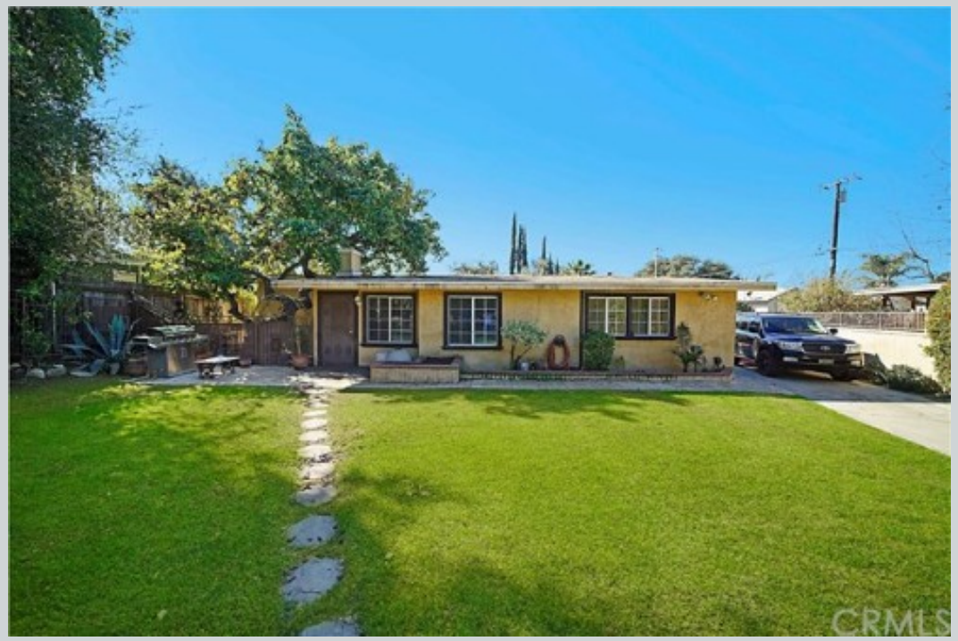
Listing Comp 3 2263 Navarro Ave