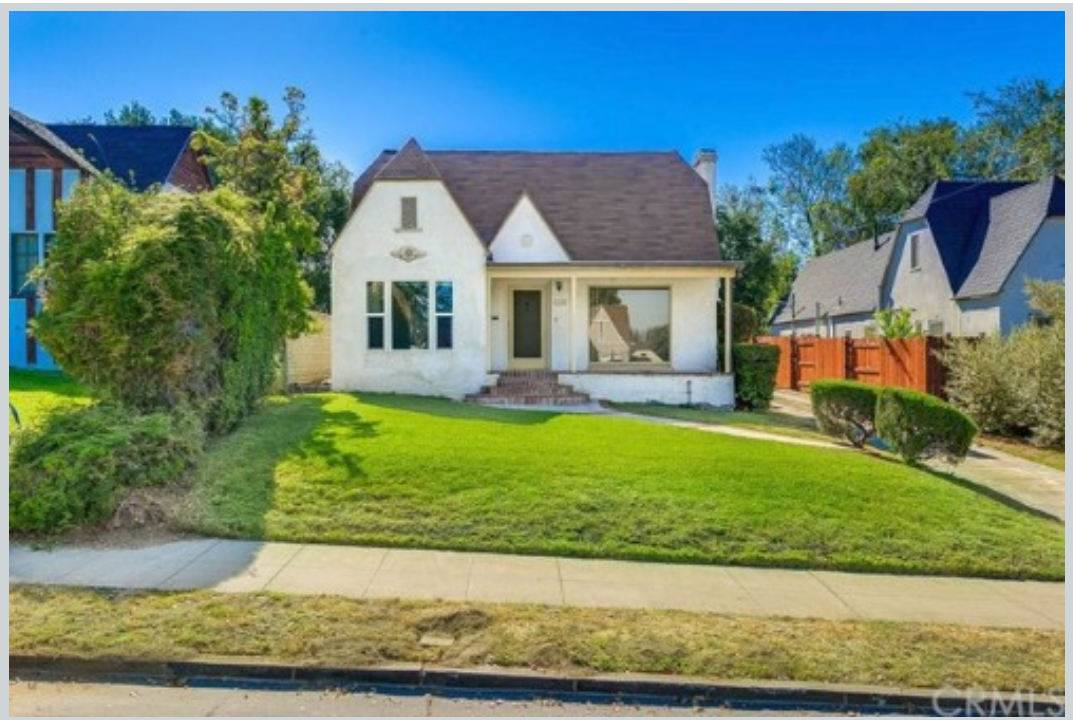
Sold Comp 1 3232 Grandeur Ave