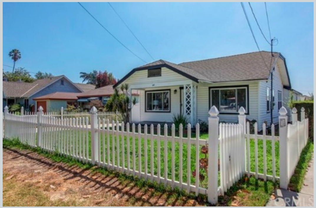
Sold Comp 2 494 Crosby St