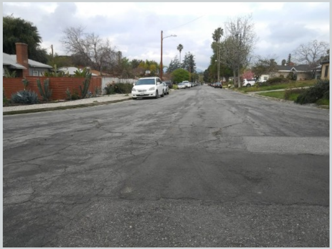
Subject 2548 La Fiesta Ave