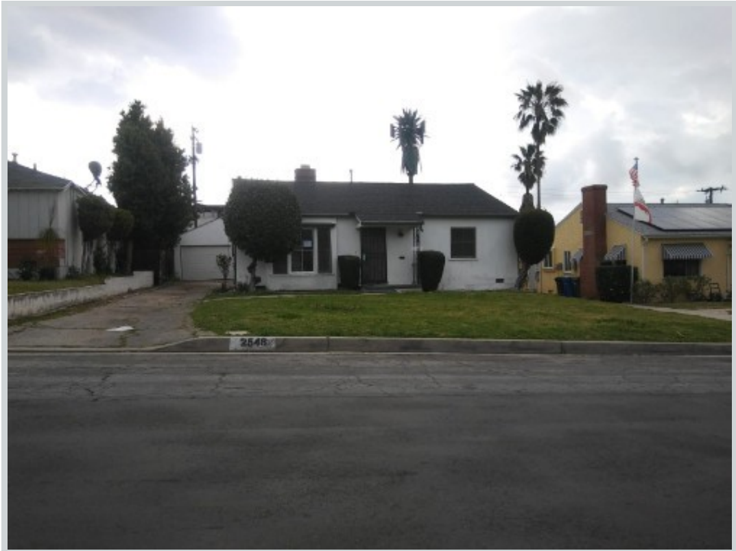
Subject 2548 La Fiesta Ave