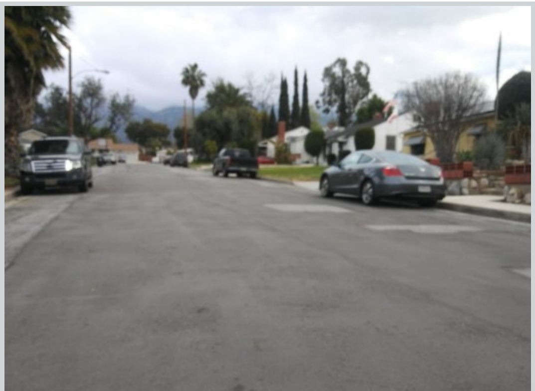
Subject 2548 La Fiesta Ave