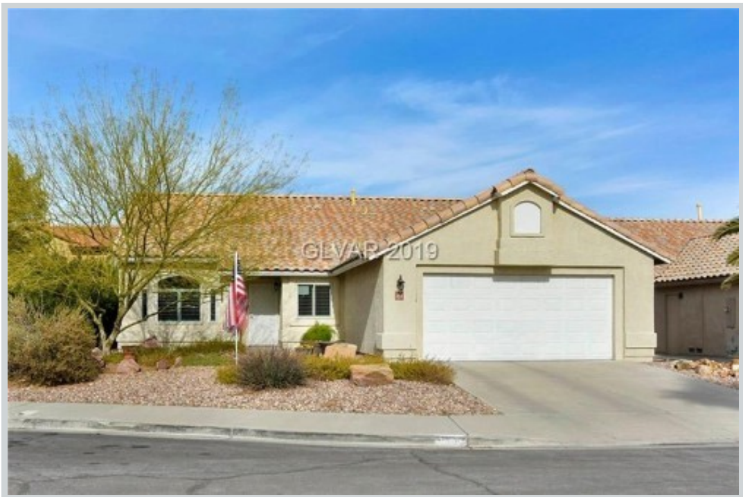
Listing Comp 3 1844 Dawn Ridge Ave