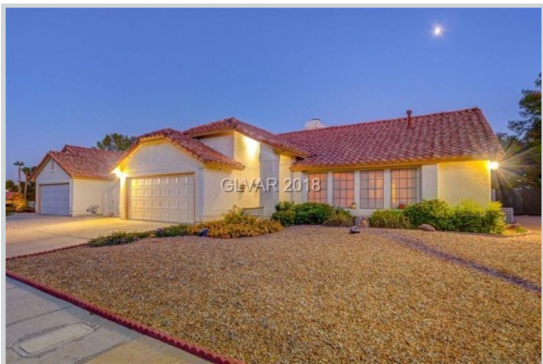
Sold Comp 2 236 Broken Arrow Ct