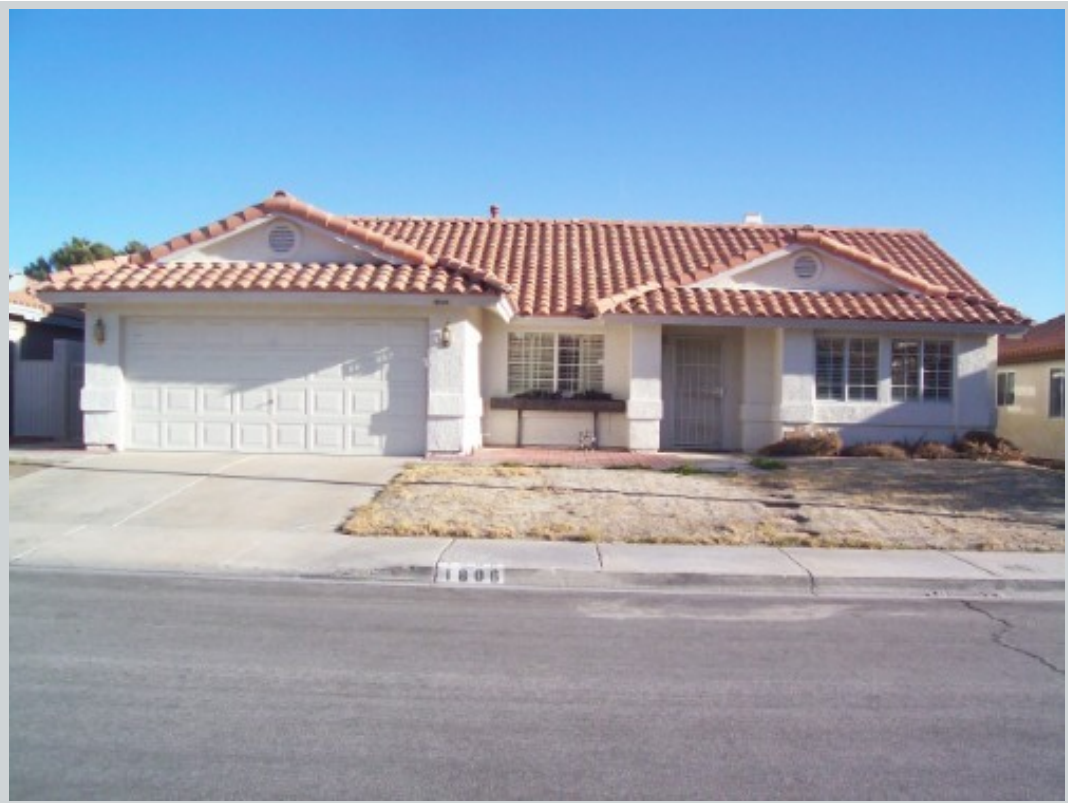
Subject 1806 Escondido Ter