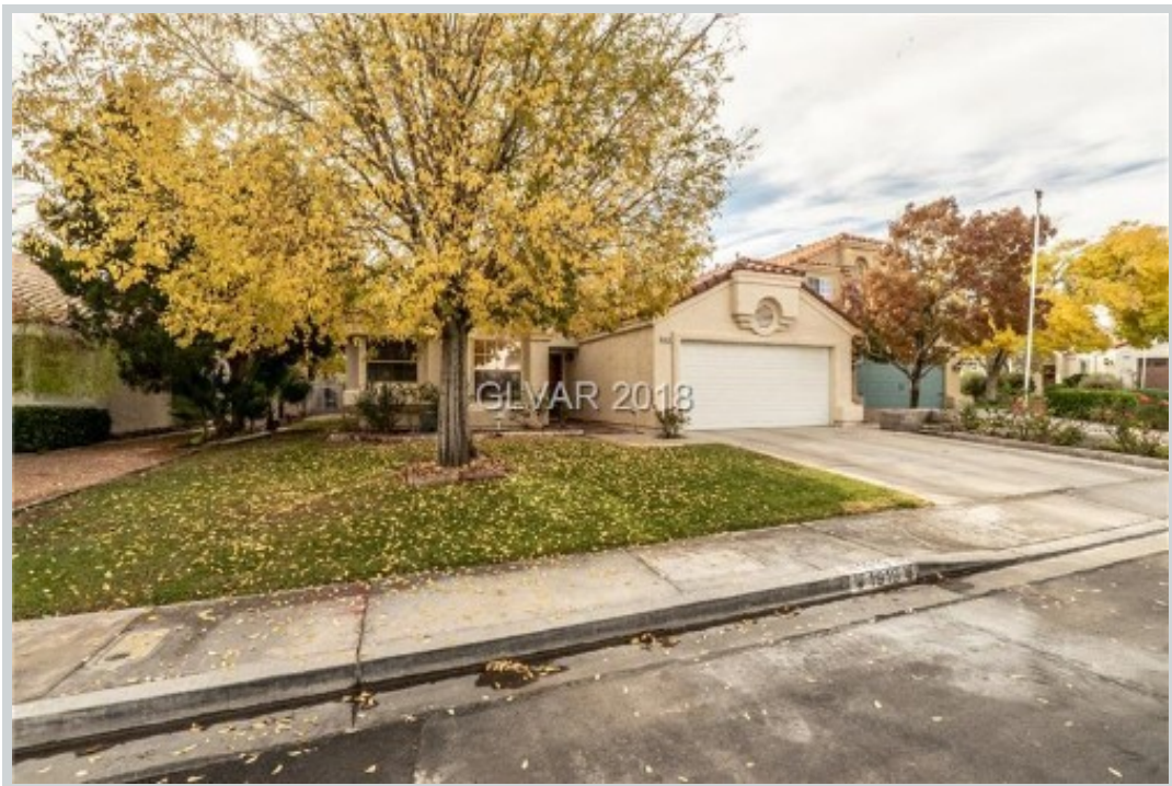
Sold Comp 1 1919 Kransten Dr

Address 1806 Escondido Terrace, Henderson, NV 89074 Loan Number 36951 Suggested List $309,000 Suggested Repaired $310,000 Sale $307,000