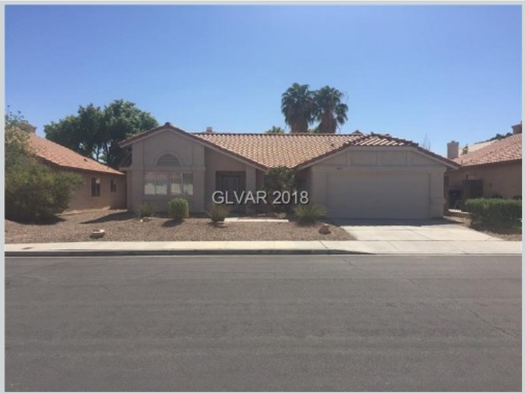
Sold Comp 3 1817 Adonis Ave