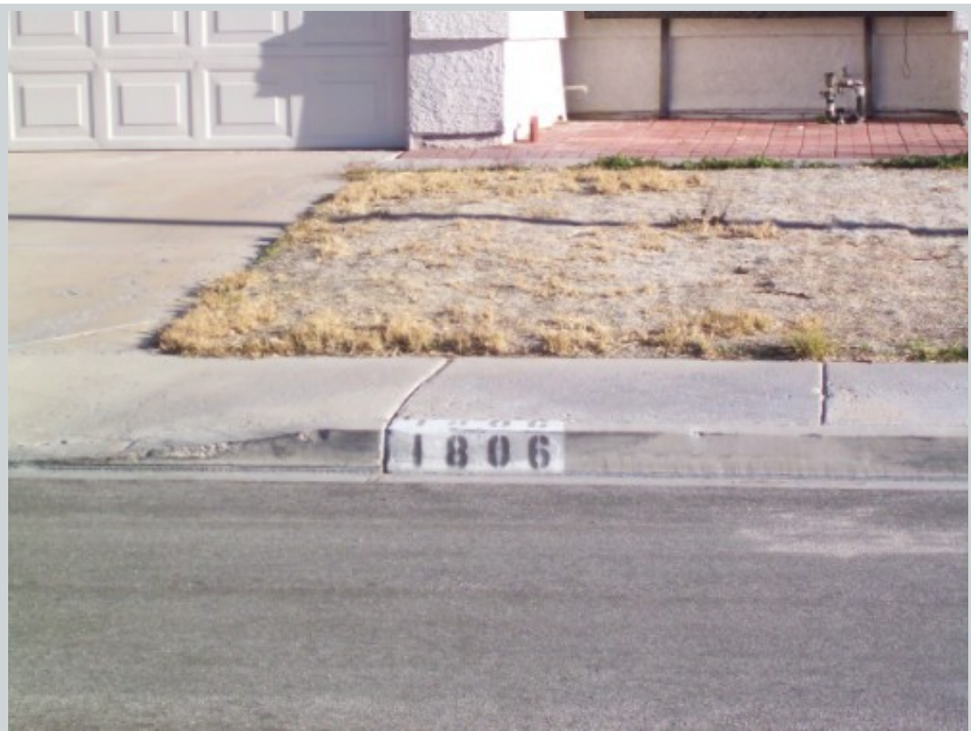
Subject 1806 Escondido Ter