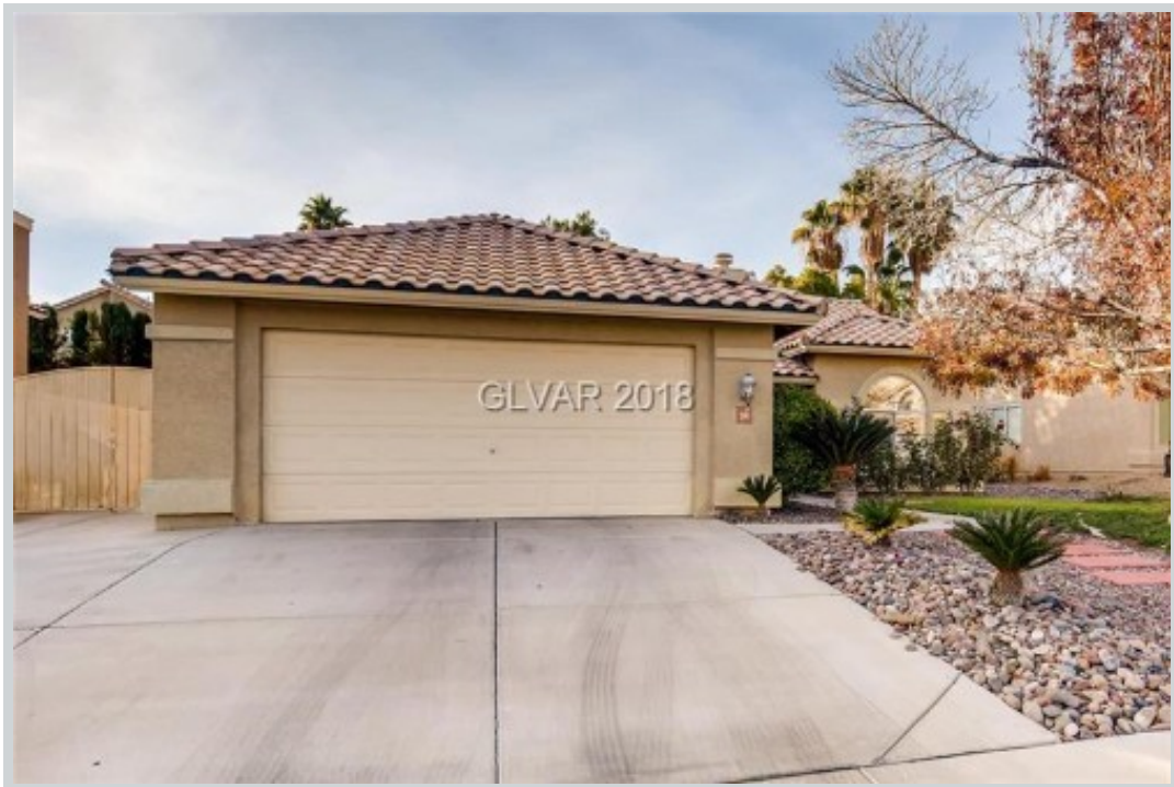
Listing Comp 1 241 Baring Cross St