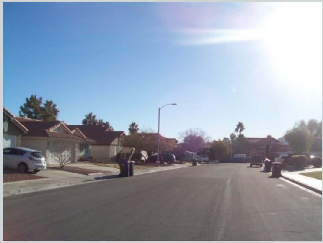
Subject 1806 Escondido Ter