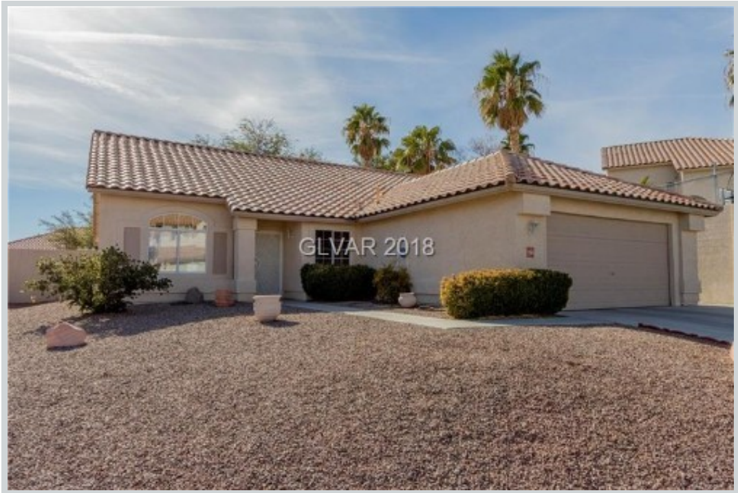
Listing Comp 2 1709 Flat Ridge Rd