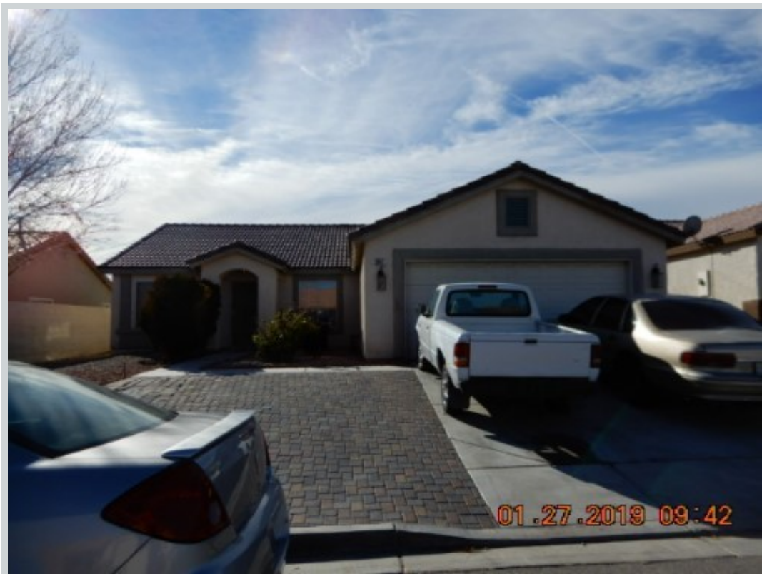
Subject 2917 Evening Storm Ct