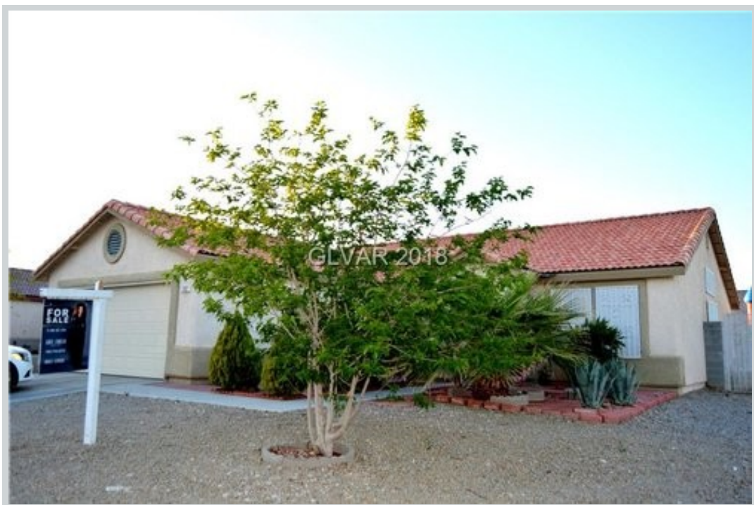
Sold Comp 1 2922 Ferret Fall Ave