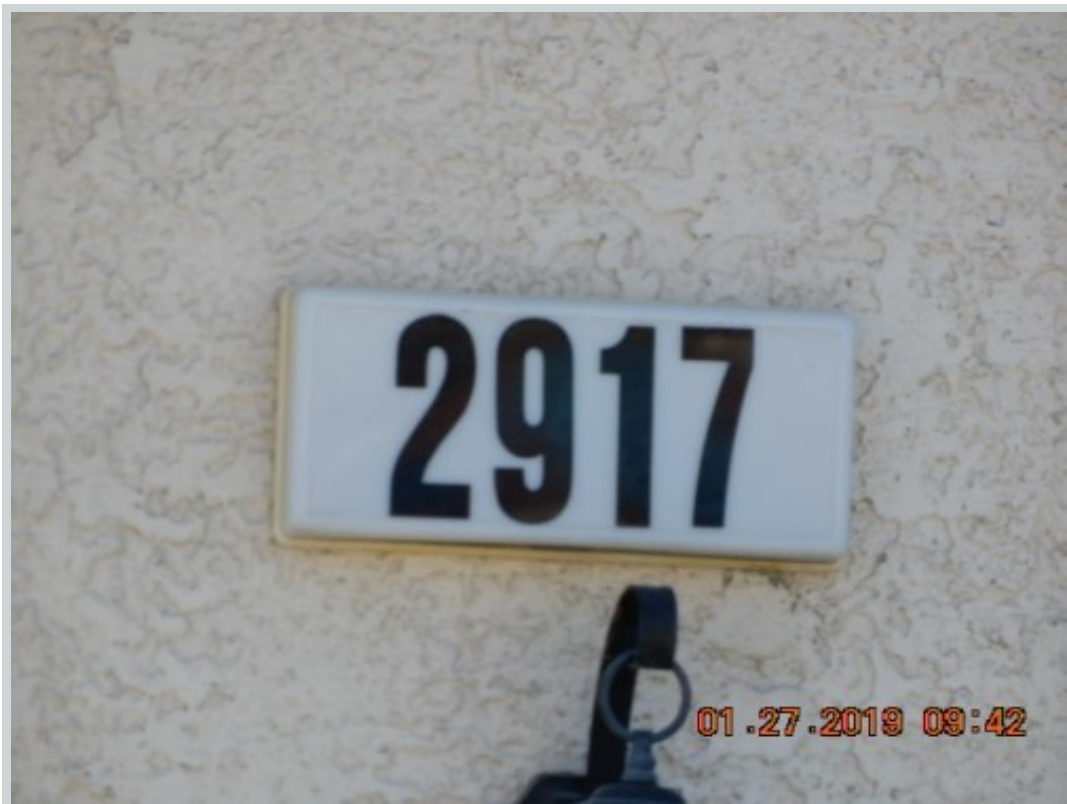
Subject 2917 Evening Storm Ct