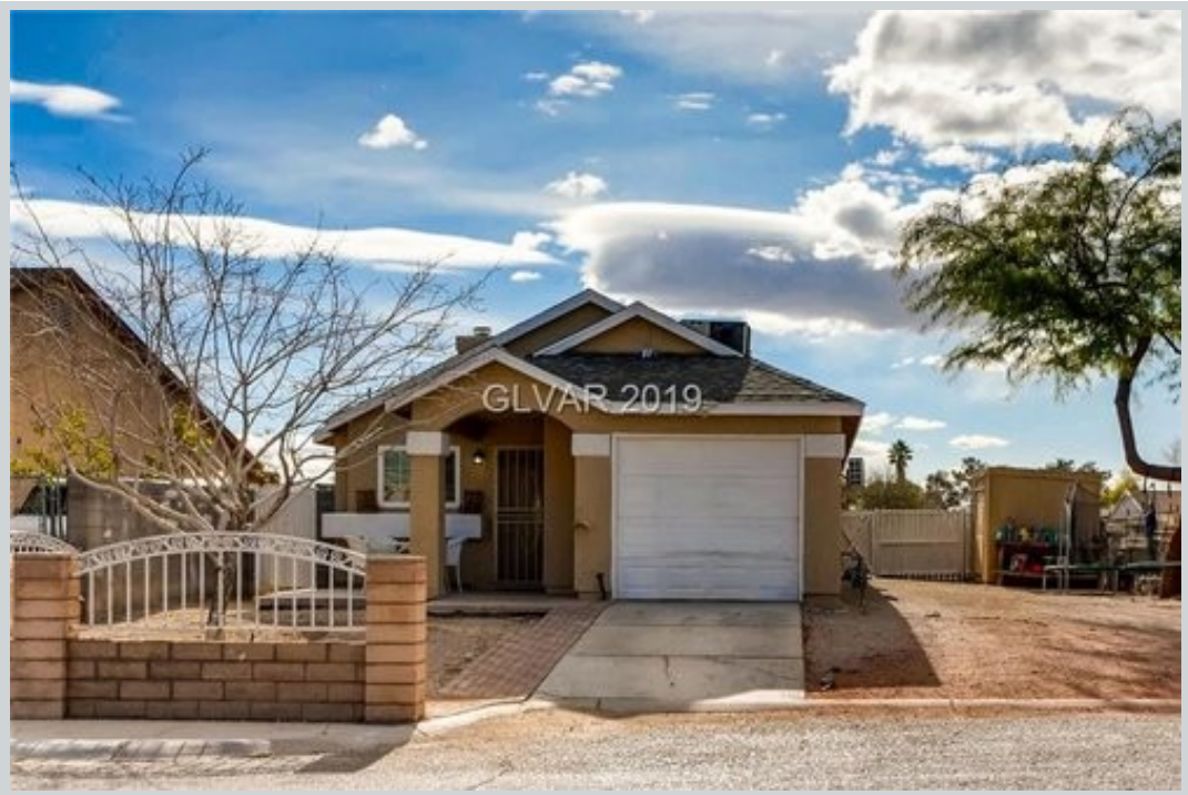
Listing Comp 2 3603 Lake Shore Ct