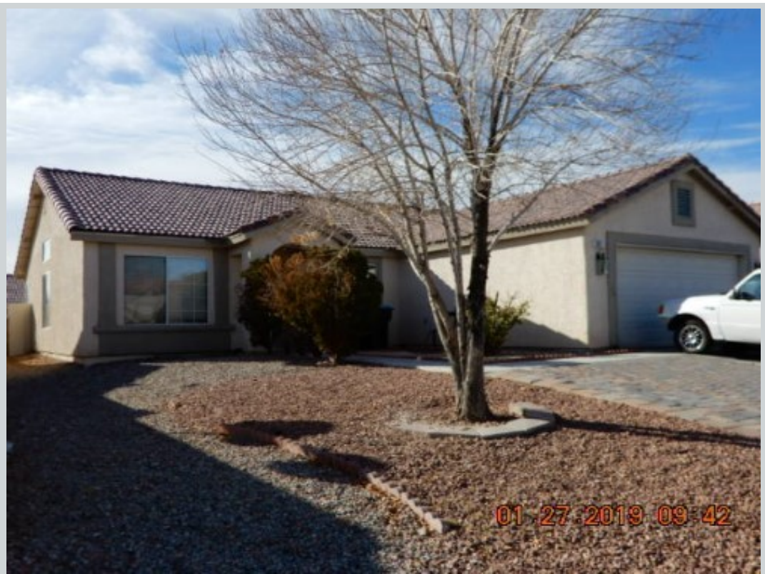
Subject 2917 Evening Storm Ct