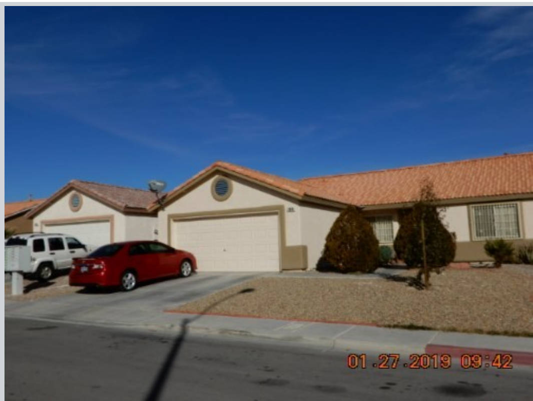
Subject 2917 Evening Storm Ct View Other Comment "View from property. "

Address 2917 Evening Storm Court, North Las Vegas, NV 89030 Loan Number 36952 Suggested List $209,900 Suggested Repaired $209,900 Sale $205,000