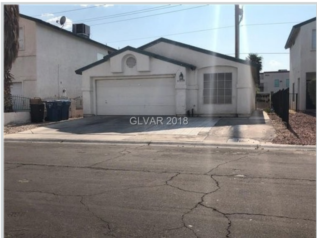
Sold Comp 2 3929 Via Lucia Dr