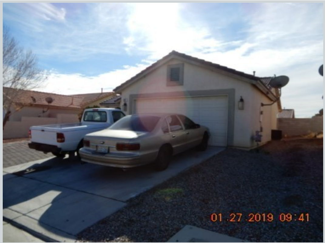
Subject 2917 Evening Storm Ct