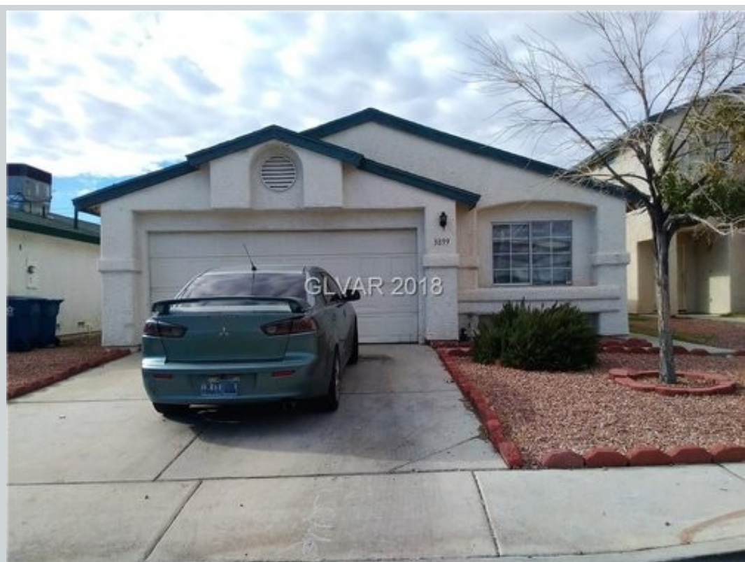
Listing Comp 1 3899 Blue Wave Dr View Front