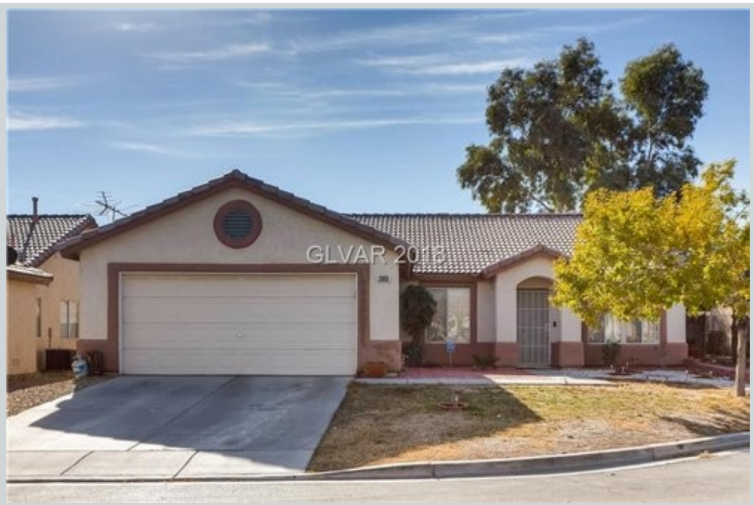
Listing Comp 3 2905 Evening Storm Ct