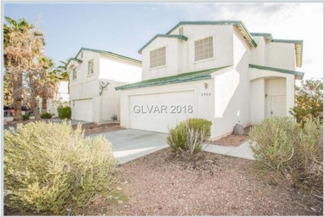
Sold Comp 3 3922 Via Lucia Dr