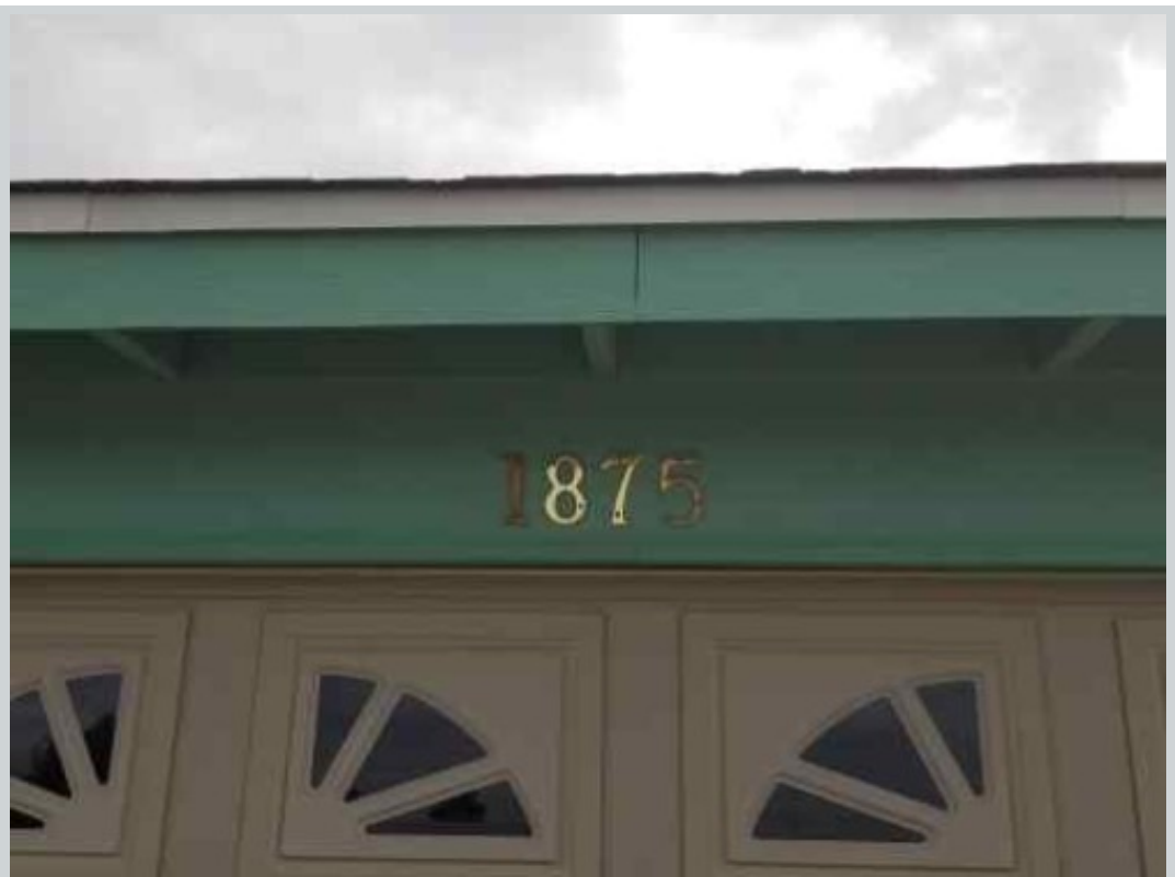
Subject 1875 W 13th Ave