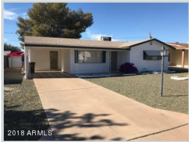
Listing Comp 2 1510 S Lawther Dr View Front