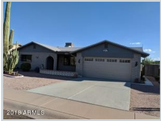
Sold Comp 3 1743 W 15th Ave