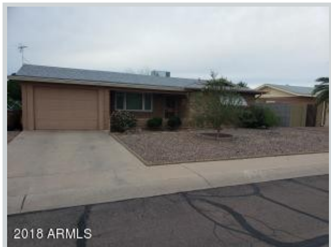
Listing Comp 1 1528 S Palo Verde Dr