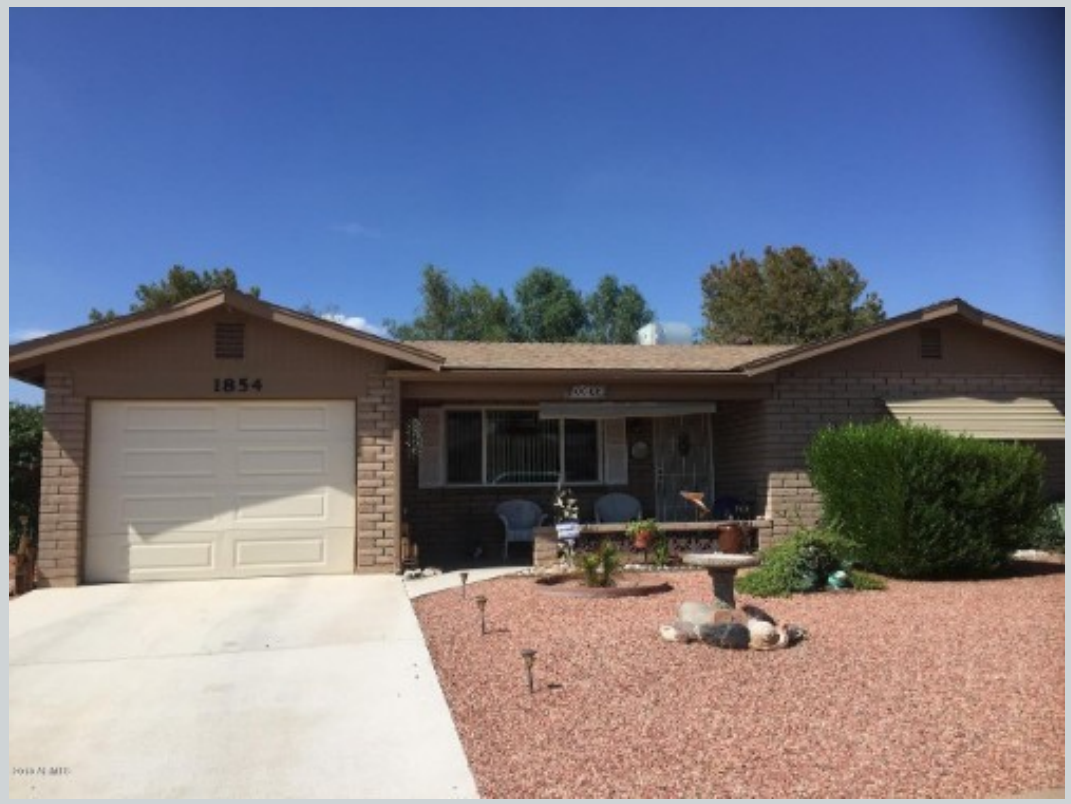
Sold Comp 1 1854 W 13th Ave