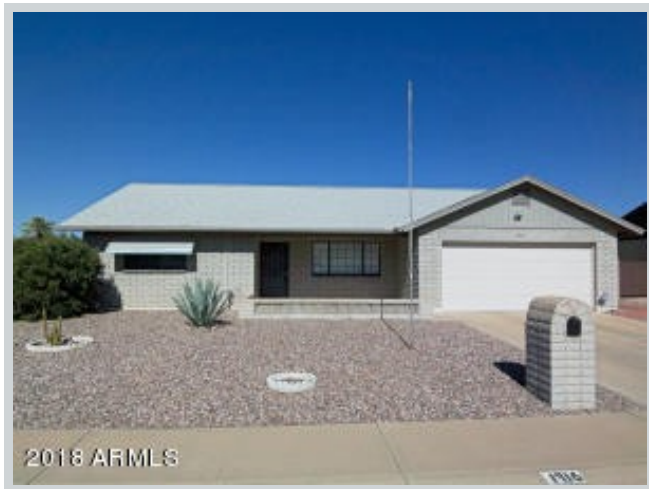
Sold Comp 2 1916 W 15th Ave