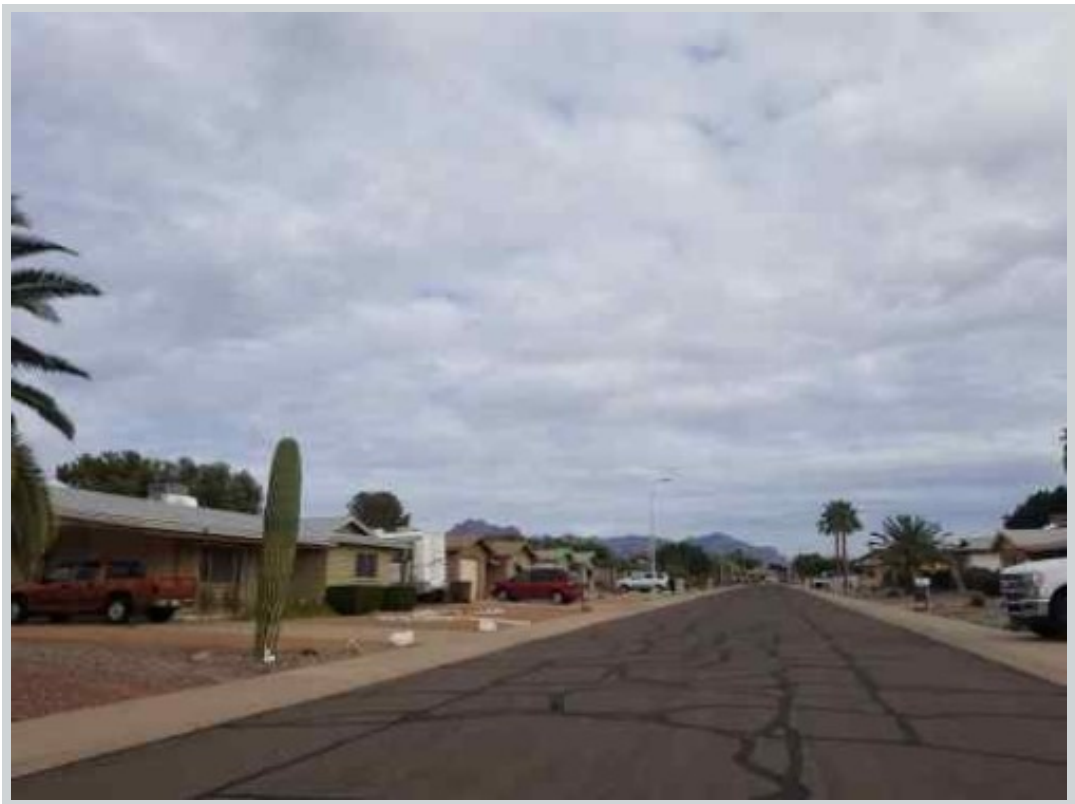
Subject 1875 W 13th Ave