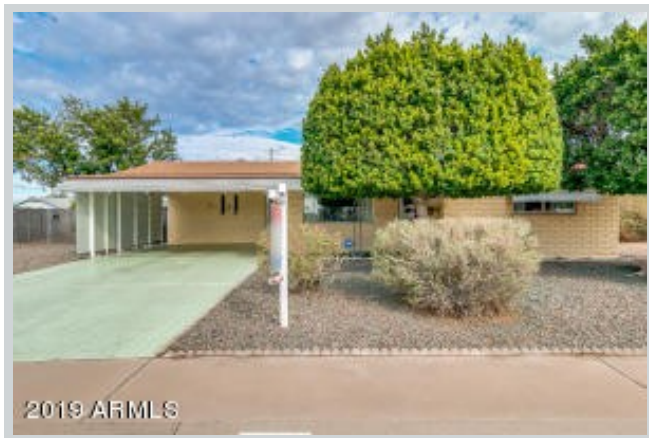
Listing Comp 3 2084 W 9th Ave View Front