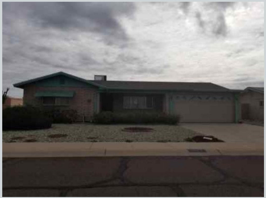
Subject 1875 W 13th Ave