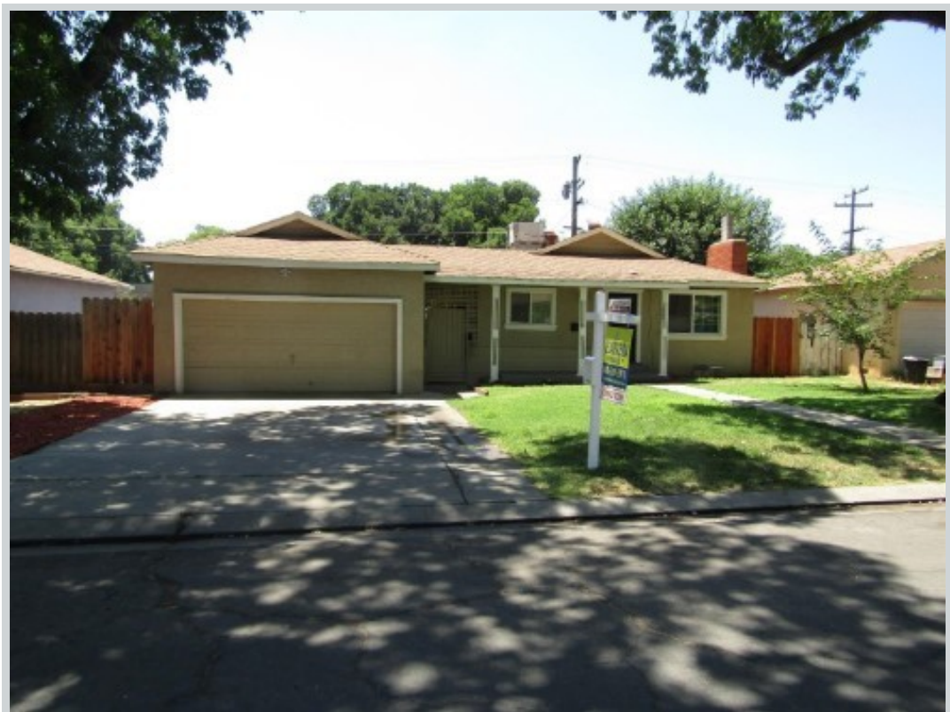
Sold Comp 3 1622 Nian Way View Front Comment "sale 3"