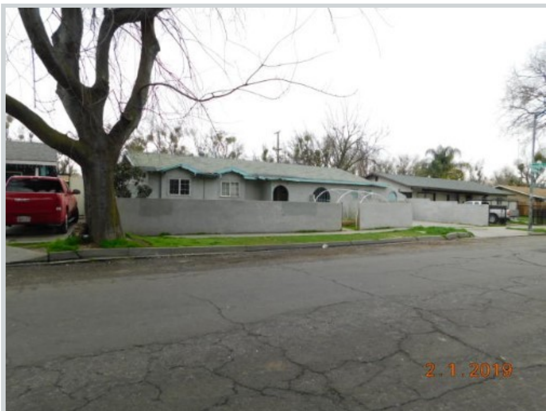
Subject 1613 Pelton Ave

Address 1613 Pelton Avenue, Modesto, CA 95351 Loan Number 36987 Suggested List $235,000 Suggested Repaired $235,000 Sale $225,000