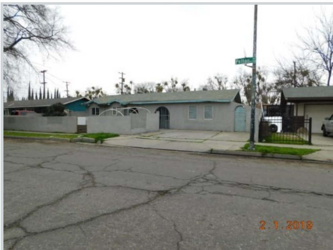
Subject 1613 Pelton Ave