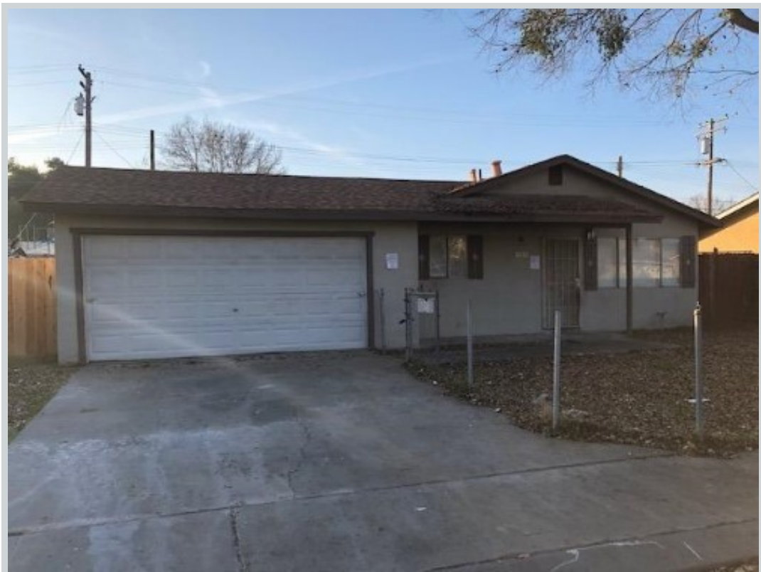
Listing Comp 3 1125 Toulon Dr View Front Comment "list 3"

Address 1613 Pelton Avenue, Modesto, CA 95351 Loan Number 36987 Suggested List $235,000 Suggested Repaired $235,000 Sale $225,000