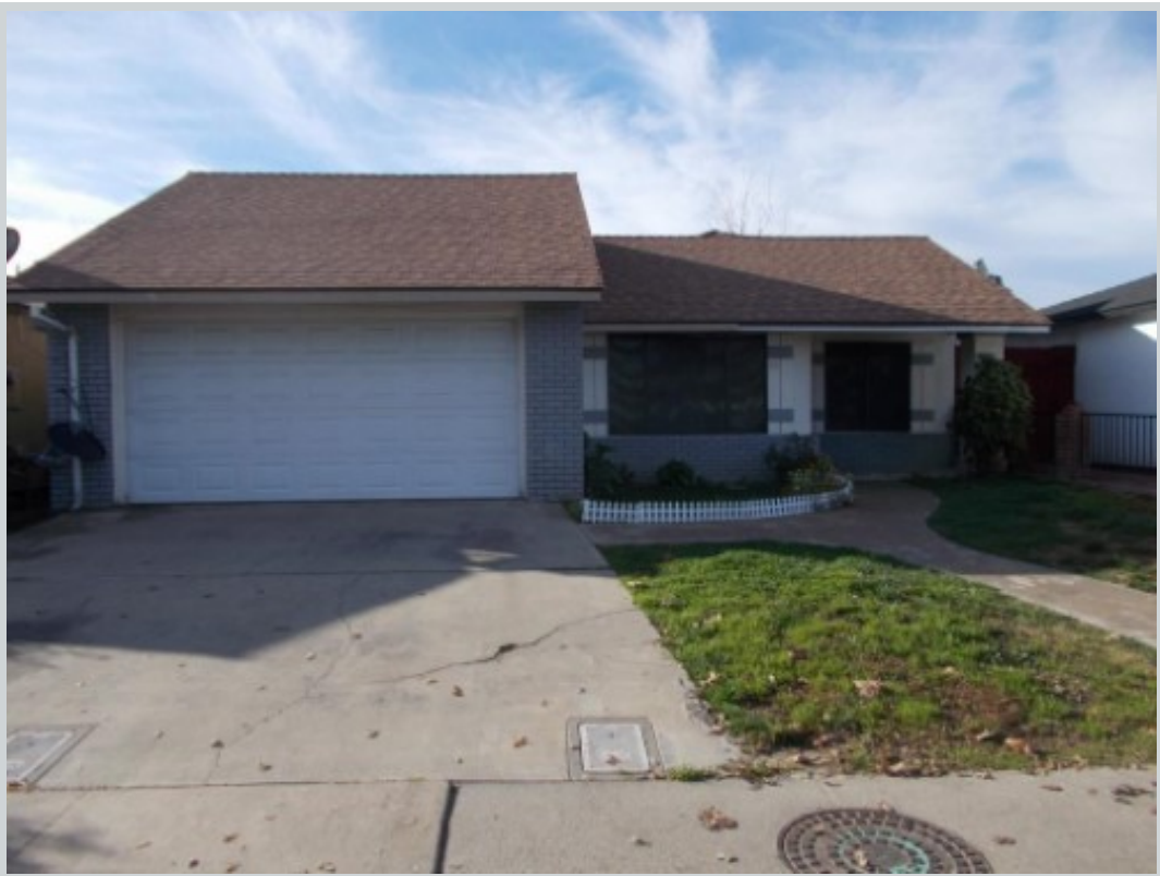
Listing Comp 2 917 Crippen Ave