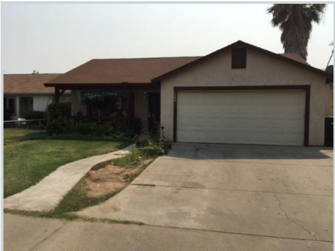
Sold Comp 2 1200 Pine Tree Lane View Front Comment "sale 2"

Address 1613 Pelton Avenue, Modesto, CA 95351 Loan Number 36987 Suggested List $235,000 Suggested Repaired $235,000 Sale $225,000