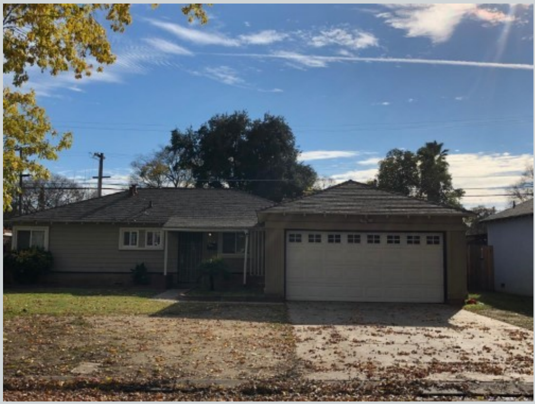
Listing Comp 1 1510 Nian Way