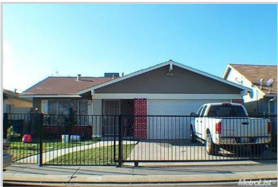
Sold Comp 1 921 Crippen Ave View Front Comment "sale 1"