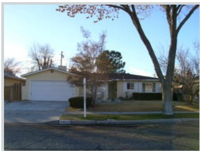
Listing Comp 1 44945 Harlas Ave