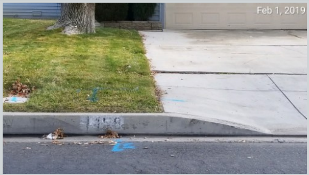
Subject 1458 Kerrick St