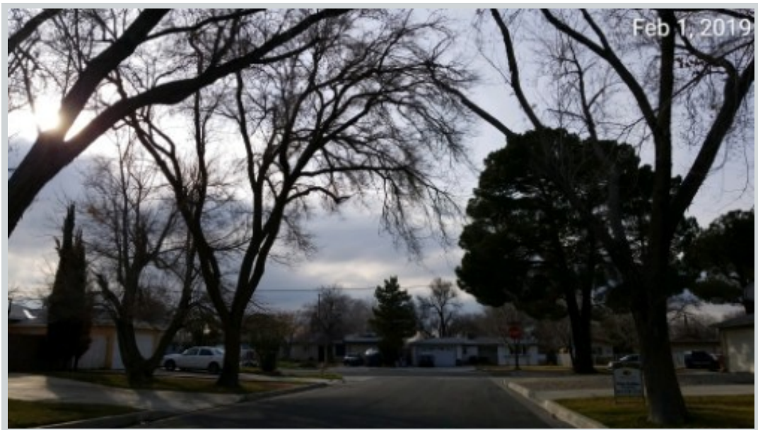
Subject 1458 Kerrick St

Address 1458 Kerrick Street, Lancaster, CA 93534 Loan Number 36988 Suggested List $245,000 Suggested Repaired $245,000 Sale $243,000