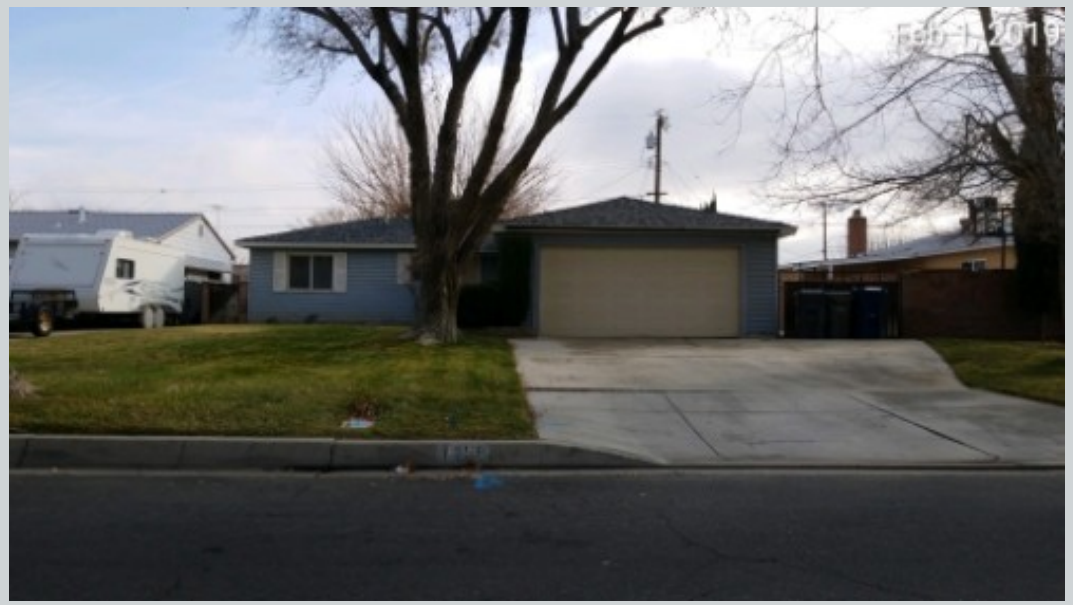
Subject 1458 Kerrick St