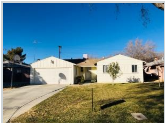
Listing Comp 3 1459 Kerrick St View Front