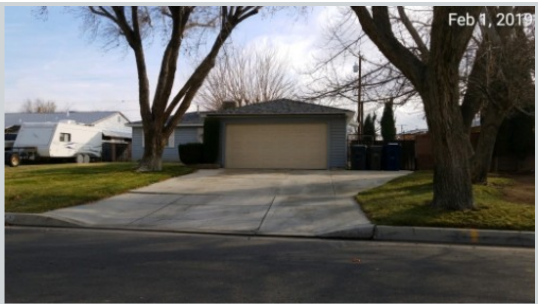
Subject 1458 Kerrick St