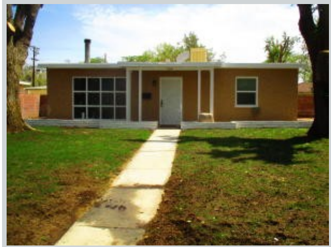
Sold Comp 2 1214 W Ivyton St View Front