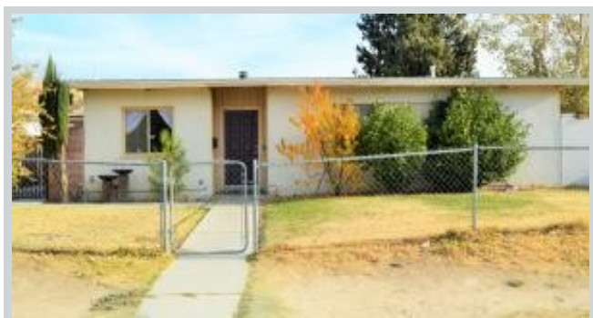
Listing Comp 2 45240 Kingtree Ave View Front