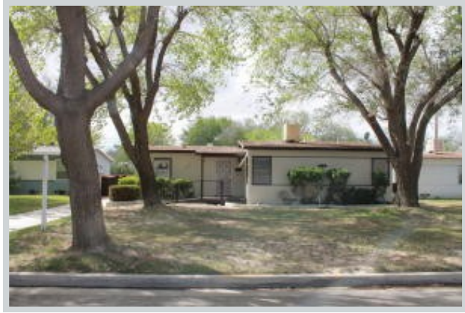
Sold Comp 1 1420 W Ivesbrook Street View Front