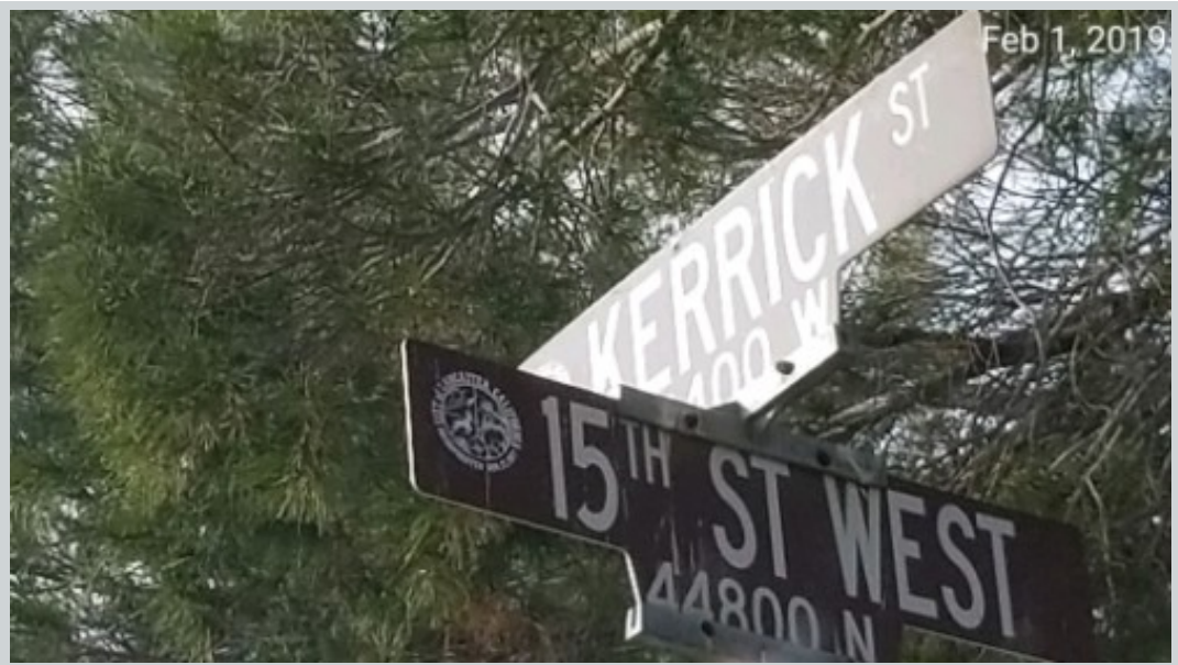
Subject 1458 Kerrick St