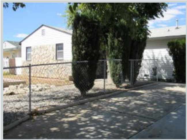
Sold Comp 3 1411 W Kettering St