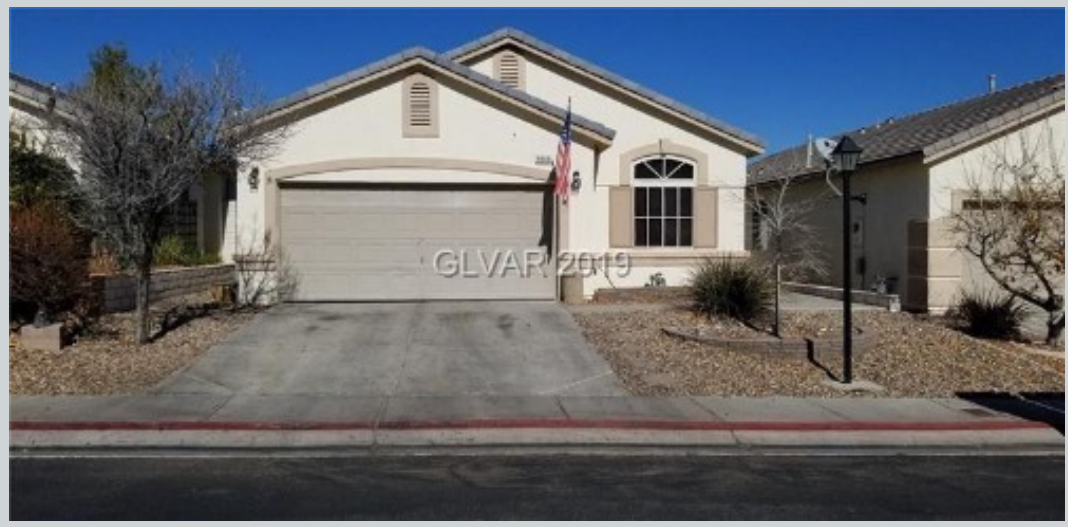
Listing Comp 1