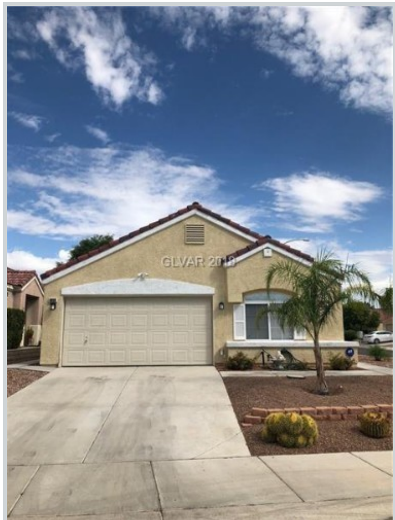
Sold Comp 1