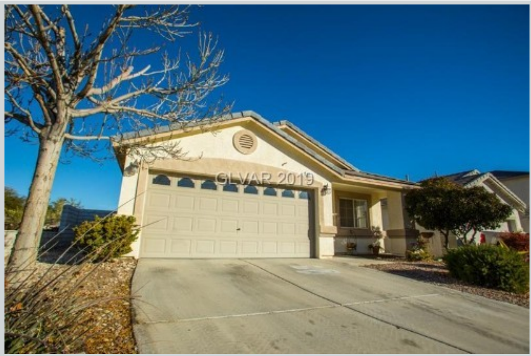
Listing Comp 3