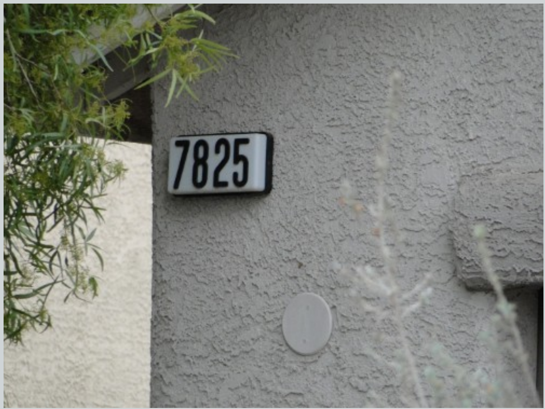
Subject 7825 Lovely Pine Pl