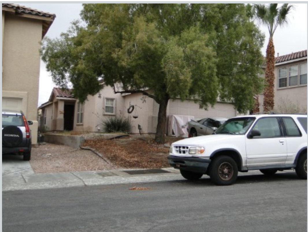
Subject 7825 Lovely Pine Pl