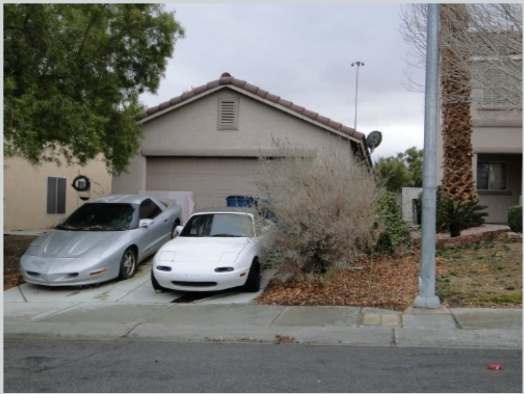
Subject 7825 Lovely Pine Pl