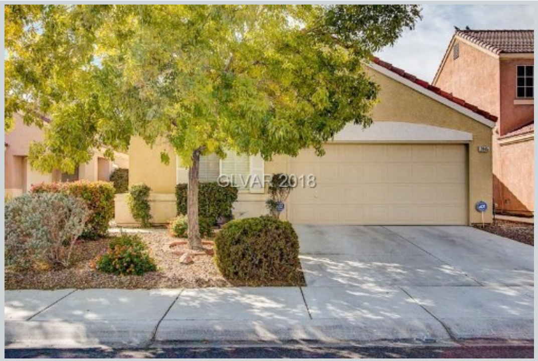
Sold Comp 2