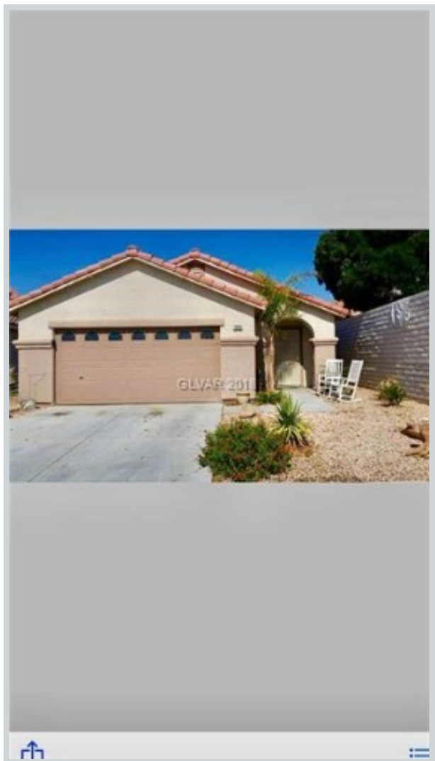
Sold Comp 3