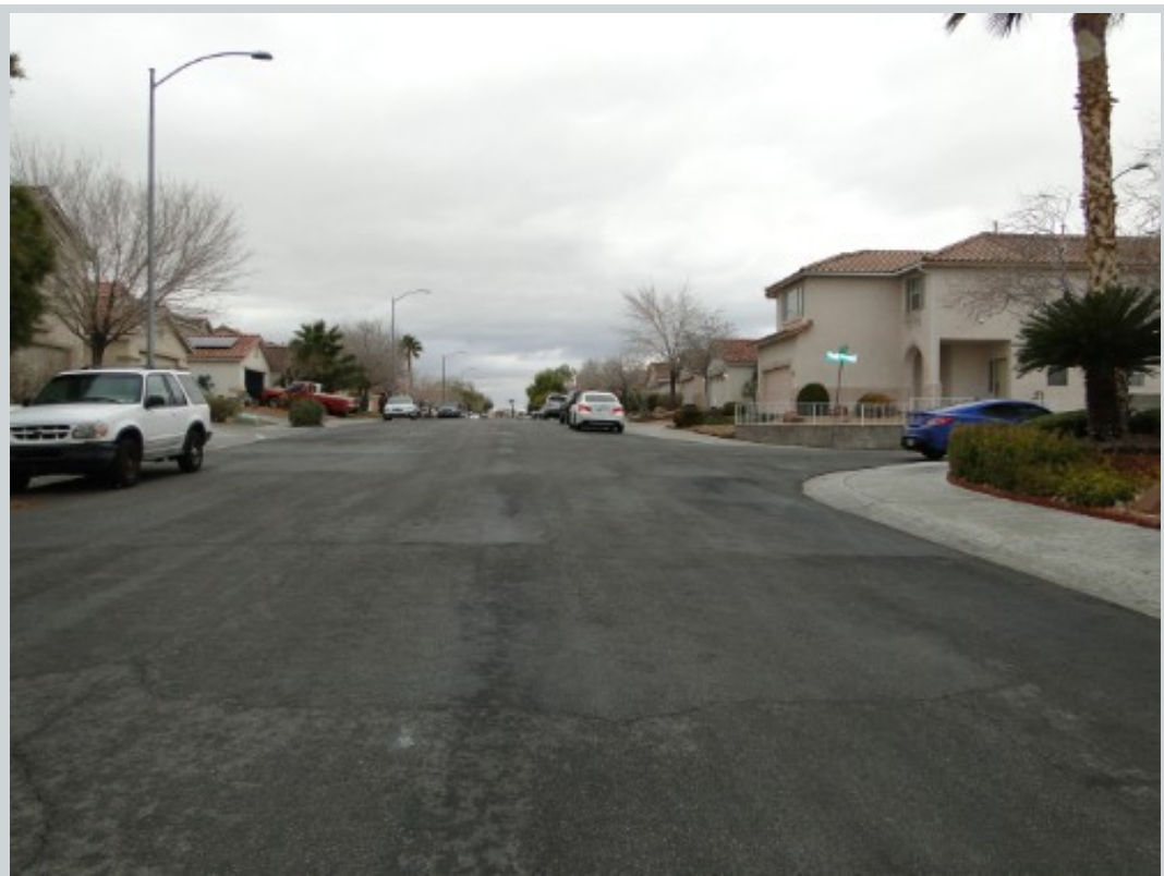
Subject 7825 Lovely Pine Pl