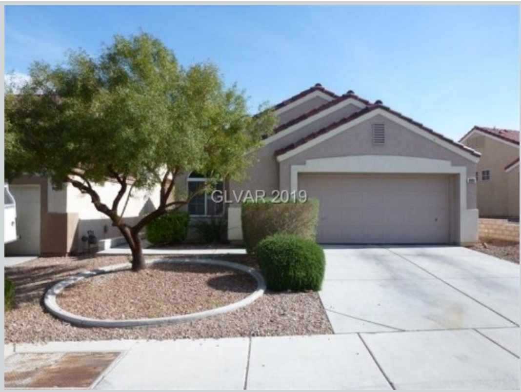
Listing Comp 2