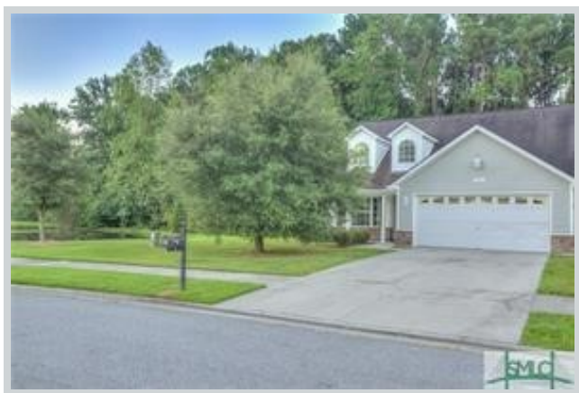
Sold Comp 3 2 Raintree Way