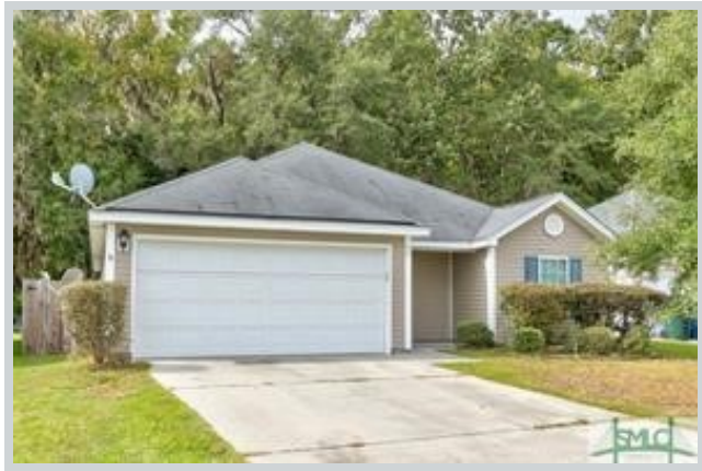
Sold Comp 2 59 Corsair Cr View Front