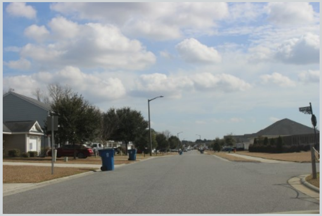
Subject 133 Fox Glen Ct