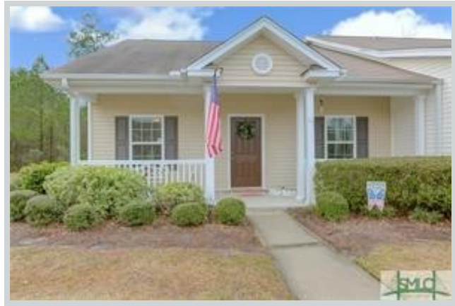
Listing Comp 1 23 Faulkland Ave