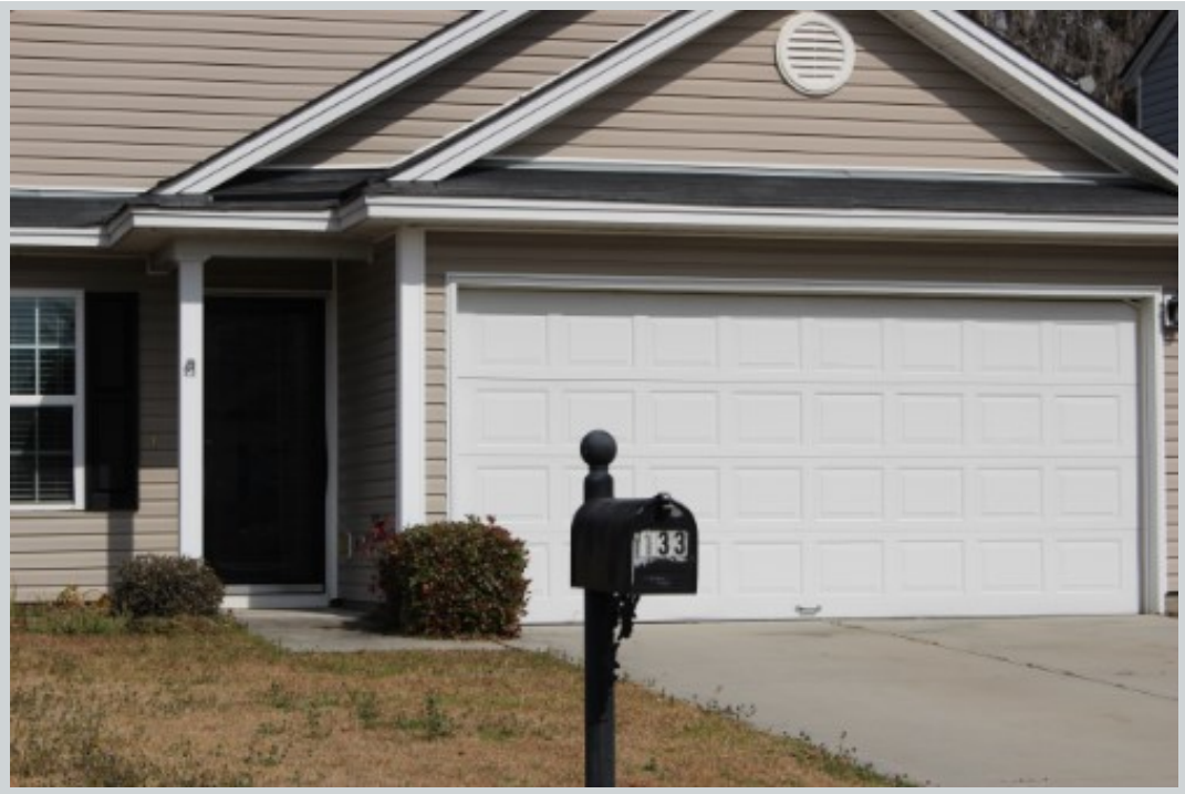
Subject 133 Fox Glen Ct