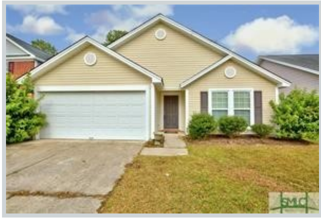
Listing Comp 2 8 Peppermill Ct View Front