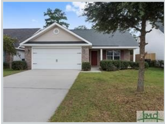
Sold Comp 1 16 Fox Glen Ct View Front