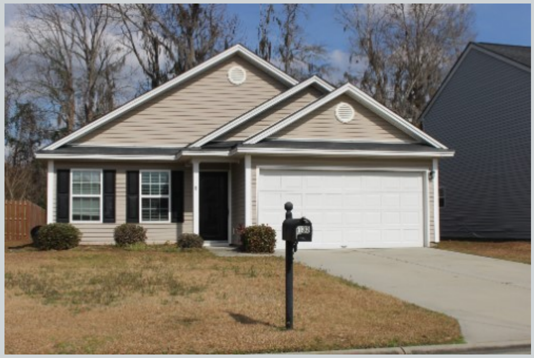
Subject 133 Fox Glen Ct