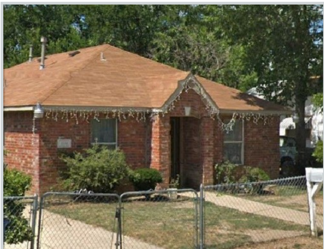
Listing Comp 1 3333 Toronto St