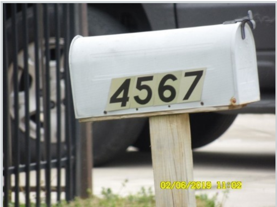
Subject 4567 Mexicana Rd