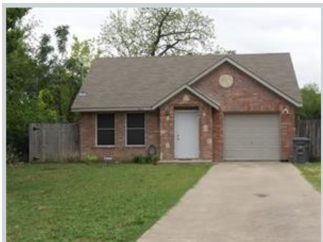
Listing Comp 3 5810 Bernal Dr