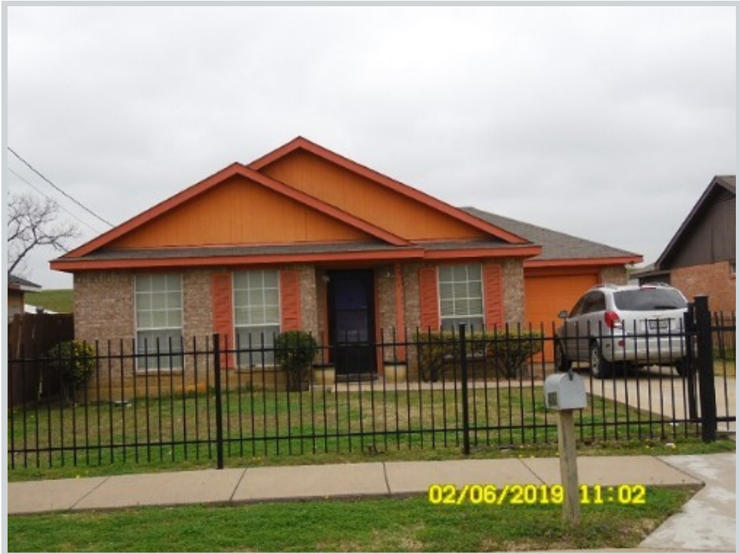
Subject 4567 Mexicana Rd