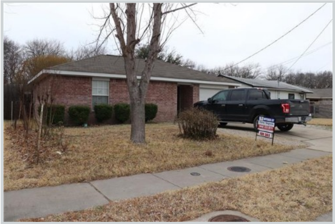
Sold Comp 3 4558 Mexicana Rd