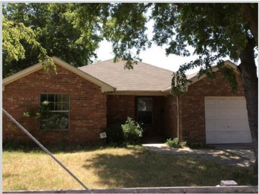
Sold Comp 2 4135 Aransas St