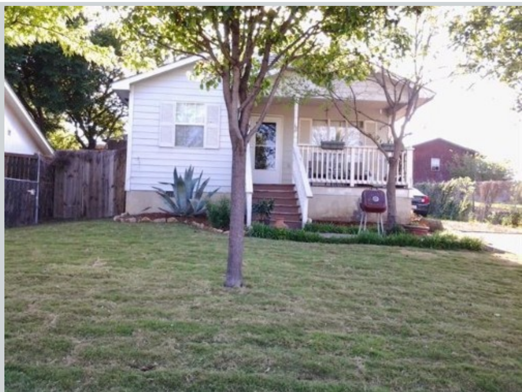
Listing Comp 2 1013 N Dwight Ave