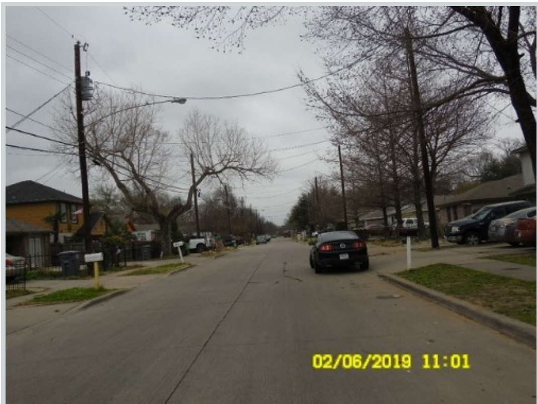
Subject 4567 Mexicana Rd