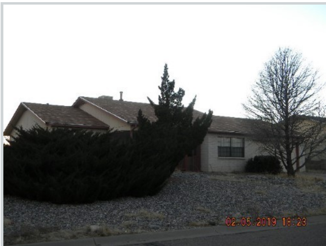
Subject 2400 Lema Rd Se View Side Comment "Left side"