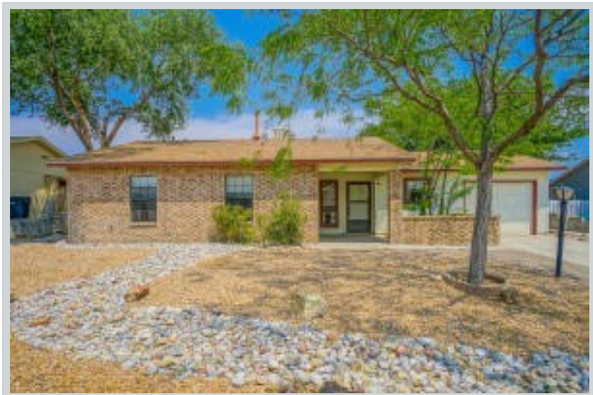
Sold Comp 1 864 Stagecoach Rd Se View Front