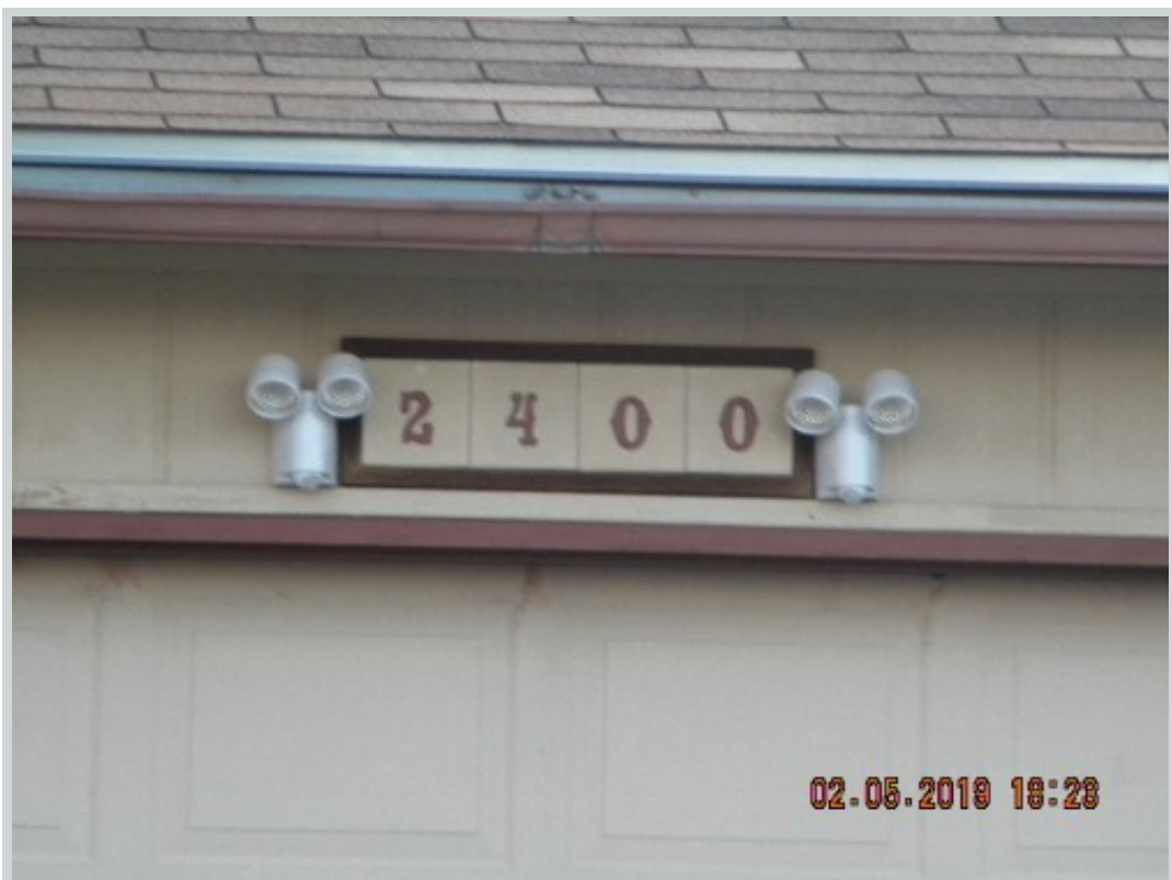
Subject 2400 Lema Rd Se