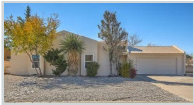
Sold Comp 3 2382 Lema Rd Se