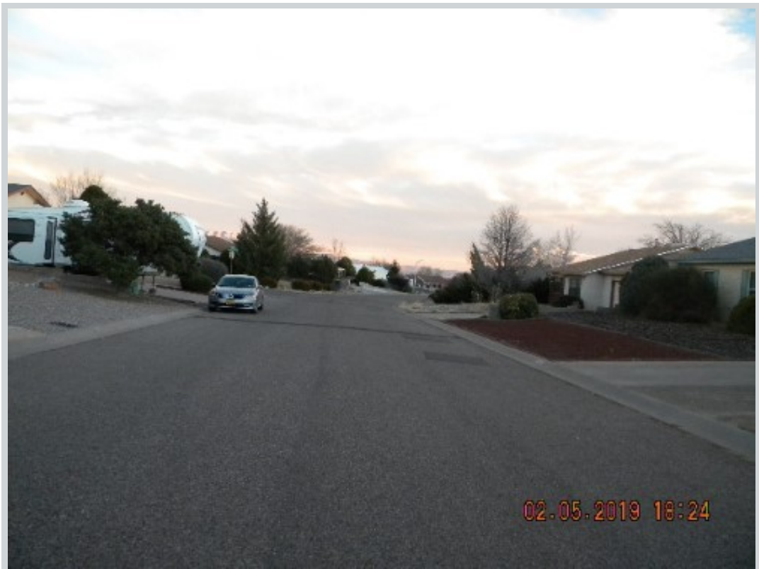
Subject 2400 Lema Rd Se Comment "Street – East"

Address 2400 Lema Road, Rio Rancho, NM 87124 Loan Number 37005 Suggested List $165,000 Suggested Repaired $165,000 Sale $160,000