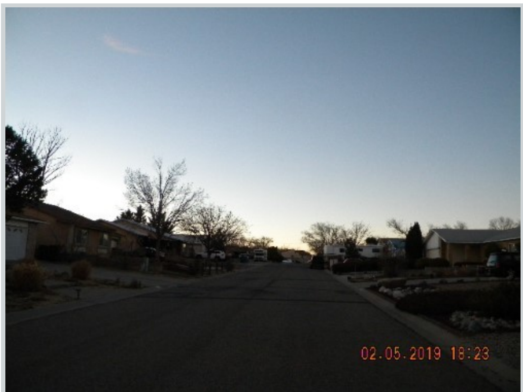
Subject 2400 Lema Rd Se Comment "Street – West"