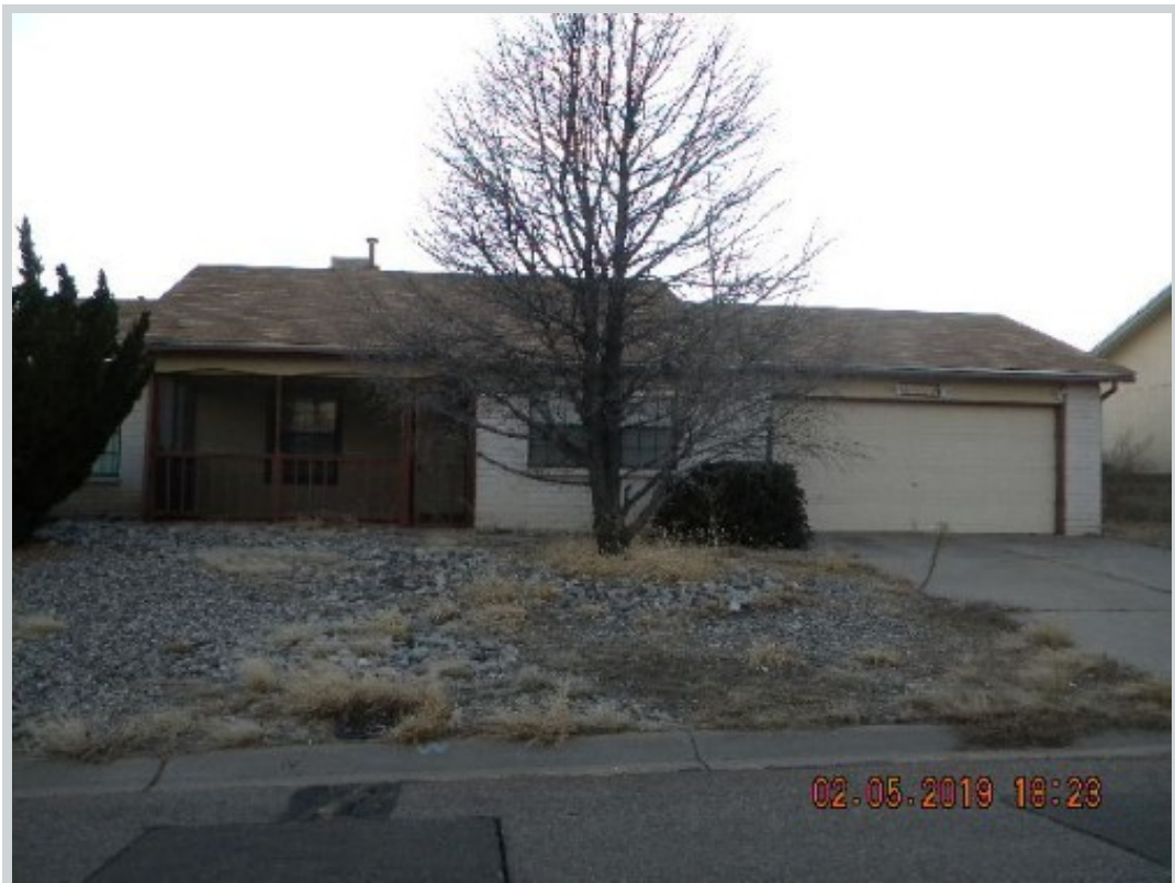
Subject 2400 Lema Rd Se