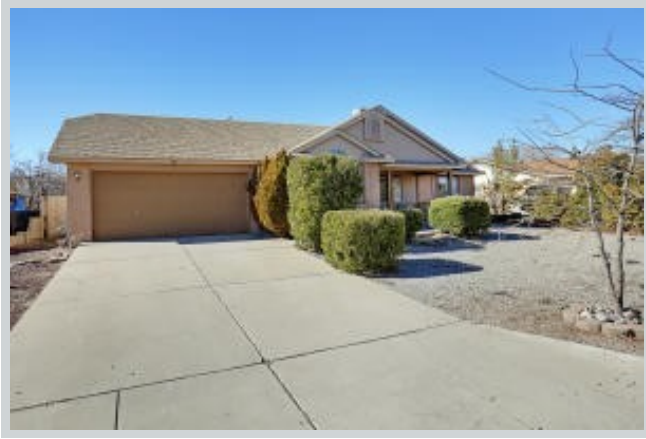
Listing Comp 1 911 Chuckwagon Rd Se View Front