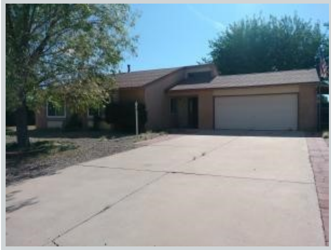
Listing Comp 3 781 Littler Dr Se View Front