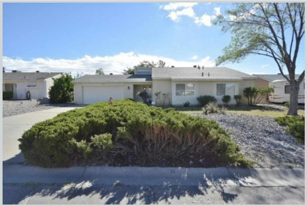
Sold Comp 2 100 Arizona Sunset Rd Ne