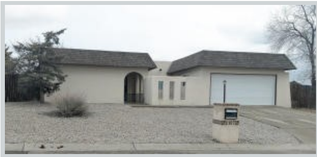
Listing Comp 2 2107 Forest Trail Rd Se View Front