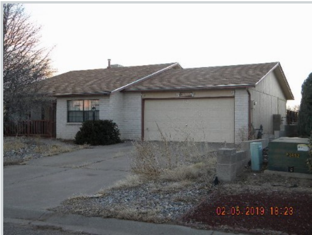
Subject 2400 Lema Rd Se View Side Comment "Right side"

Address 2400 Lema Road, Rio Rancho, NM 87124 Loan Number 37005 Suggested List $165,000 Suggested Repaired $165,000 Sale $160,000