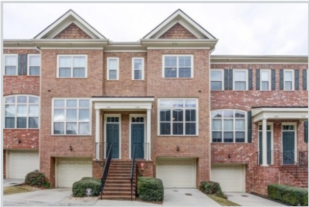
Listing Comp 3 1604 Mosaic Way