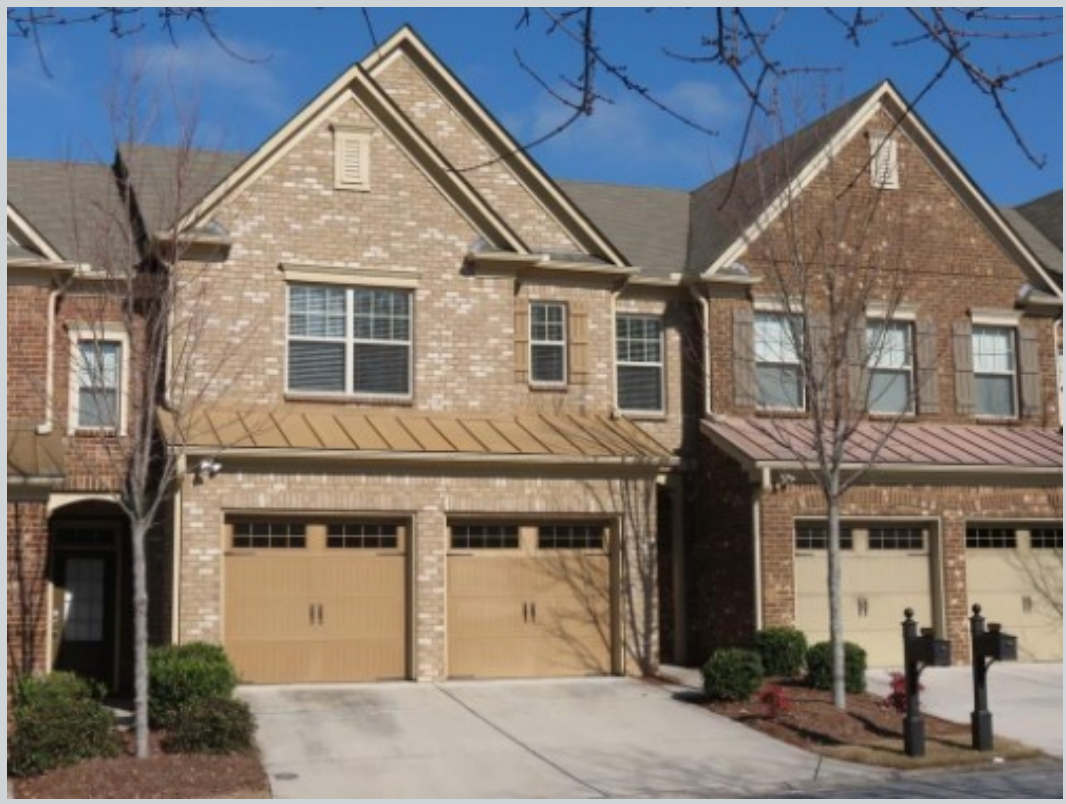
Listing Comp 2 2121 Caswell Cir