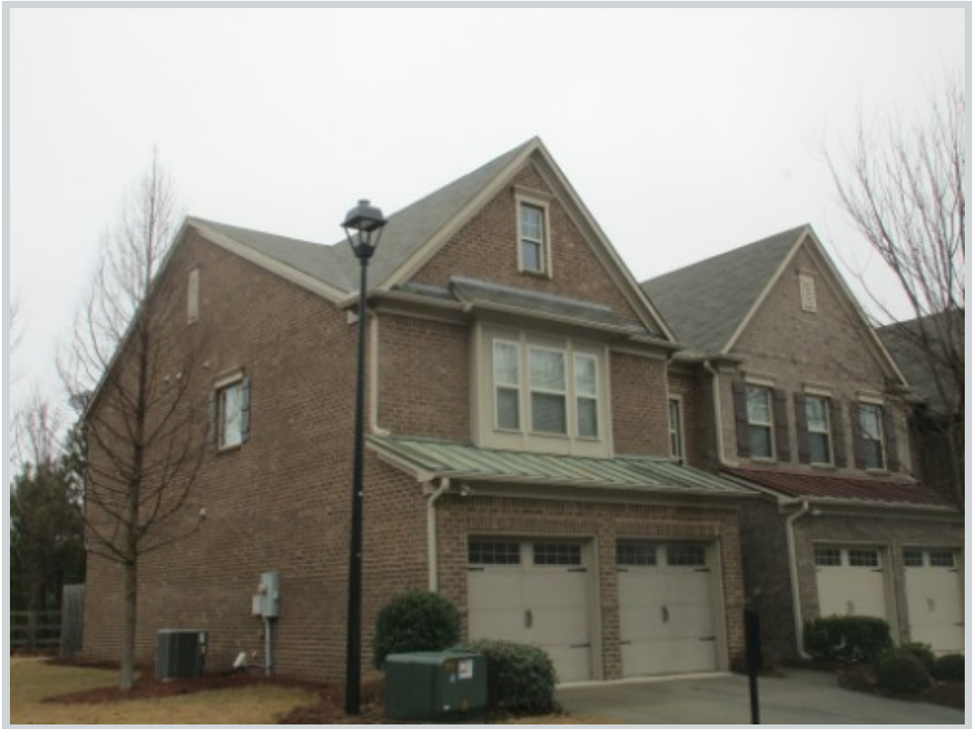
Subject 1921 Brightleaf Way # 68