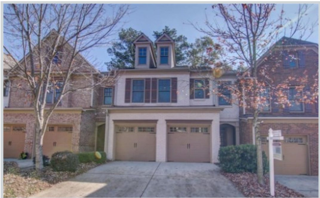
Sold Comp 1 1645 Caswell Pkwy # 221

Address 1921 Brightleaf Way 68, Marietta, GA 30060 Loan Number 37006 Suggested List $279,900 Suggested Repaired $279,900 Sale $274,900