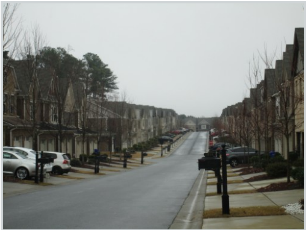
Subject 1921 Brightleaf Way # 68