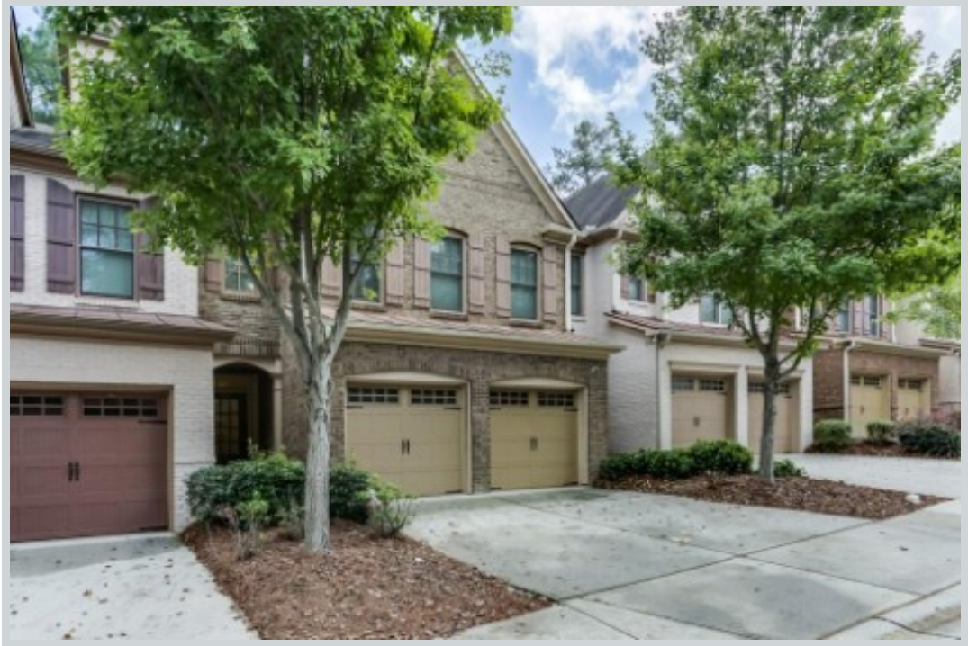
Sold Comp 3 1713 Caswell Pkwy