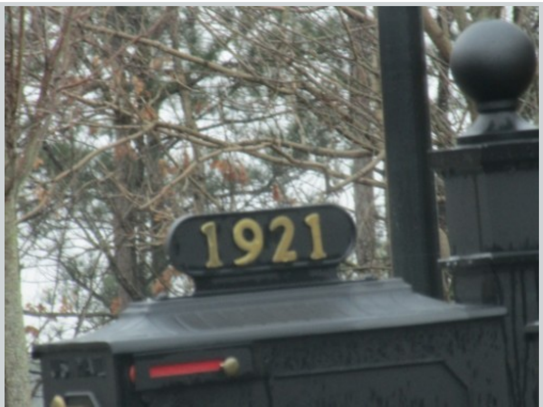
Subject 1921 Brightleaf Way # 68