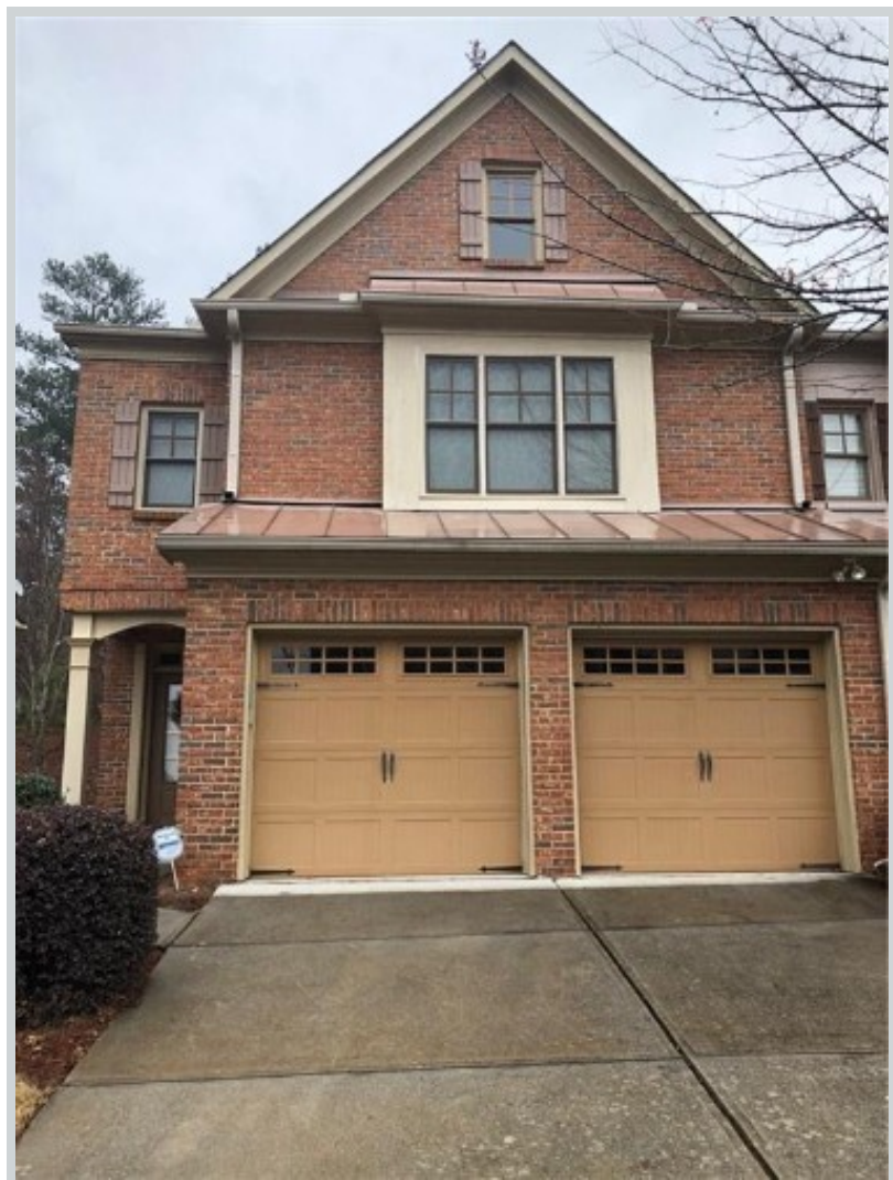
Listing Comp 1 1737 Caswell Pkwy