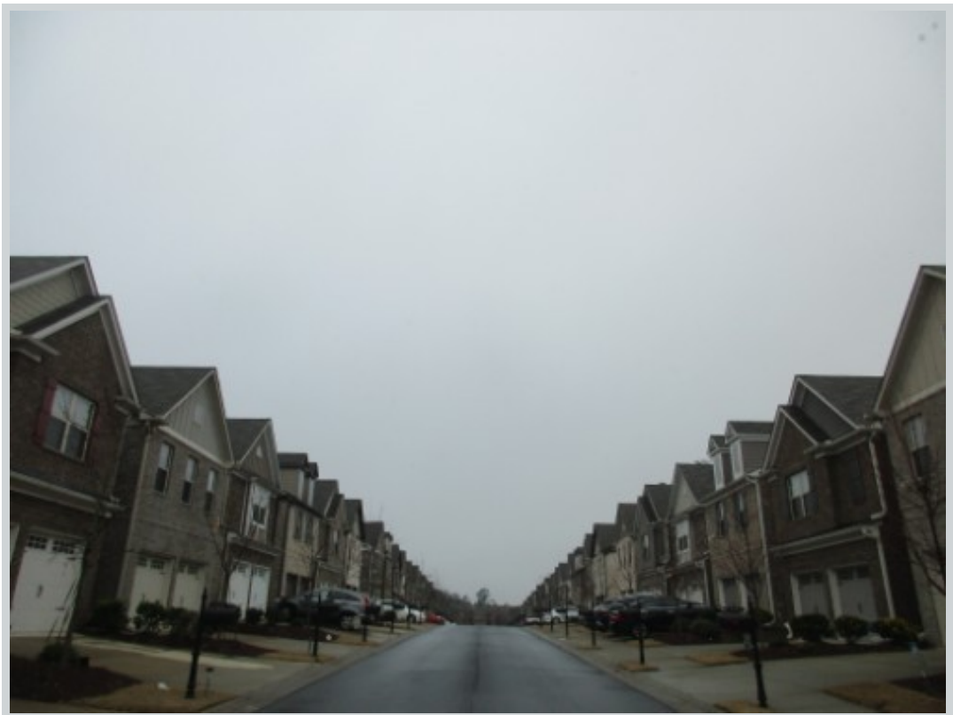
Subject 1921 Brightleaf Way # 68