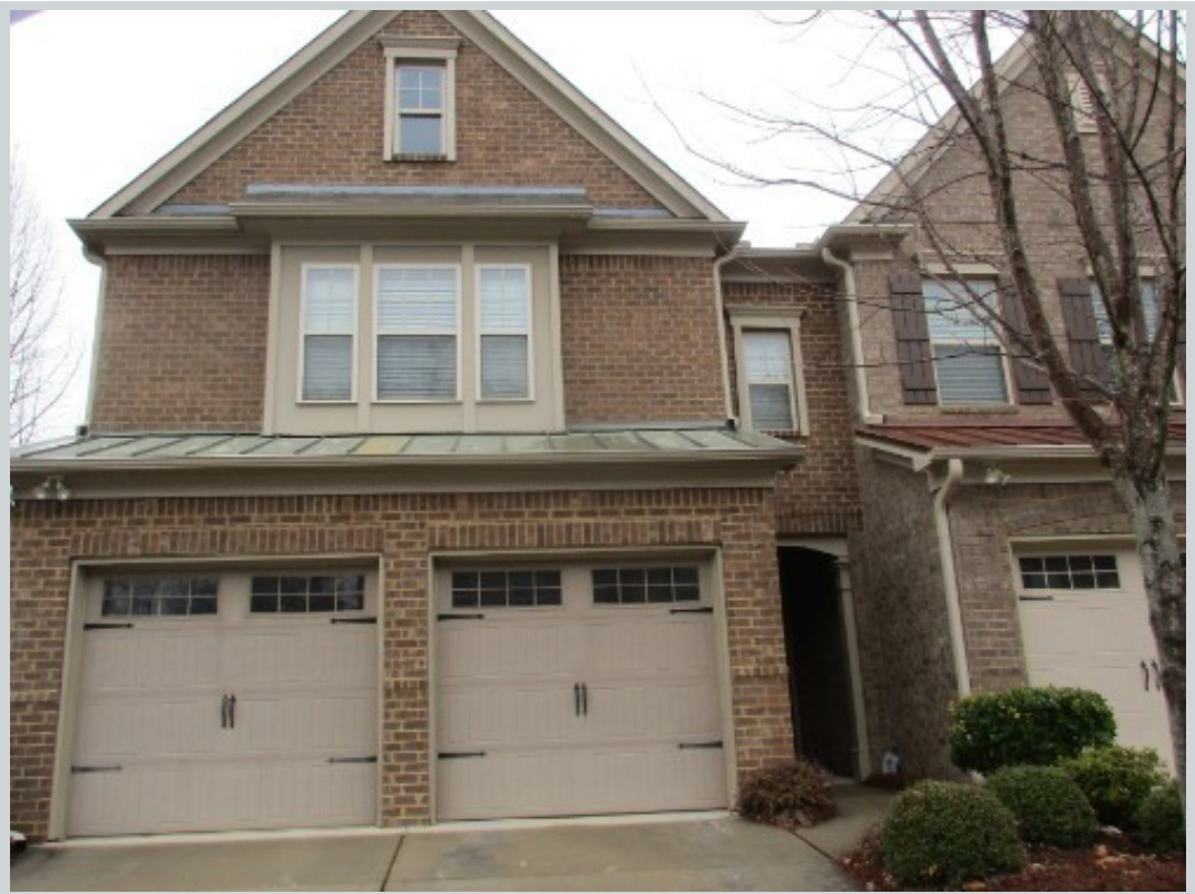
Subject 1921 Brightleaf Way # 68