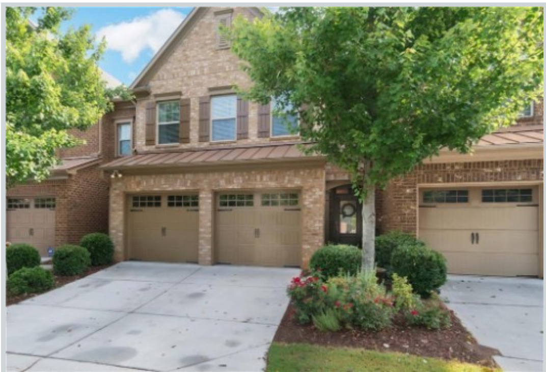
Sold Comp 2 2153 Caswell Cir