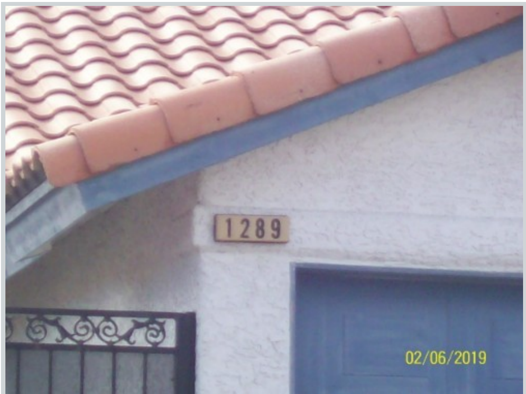
Subject 1289 Recital Way