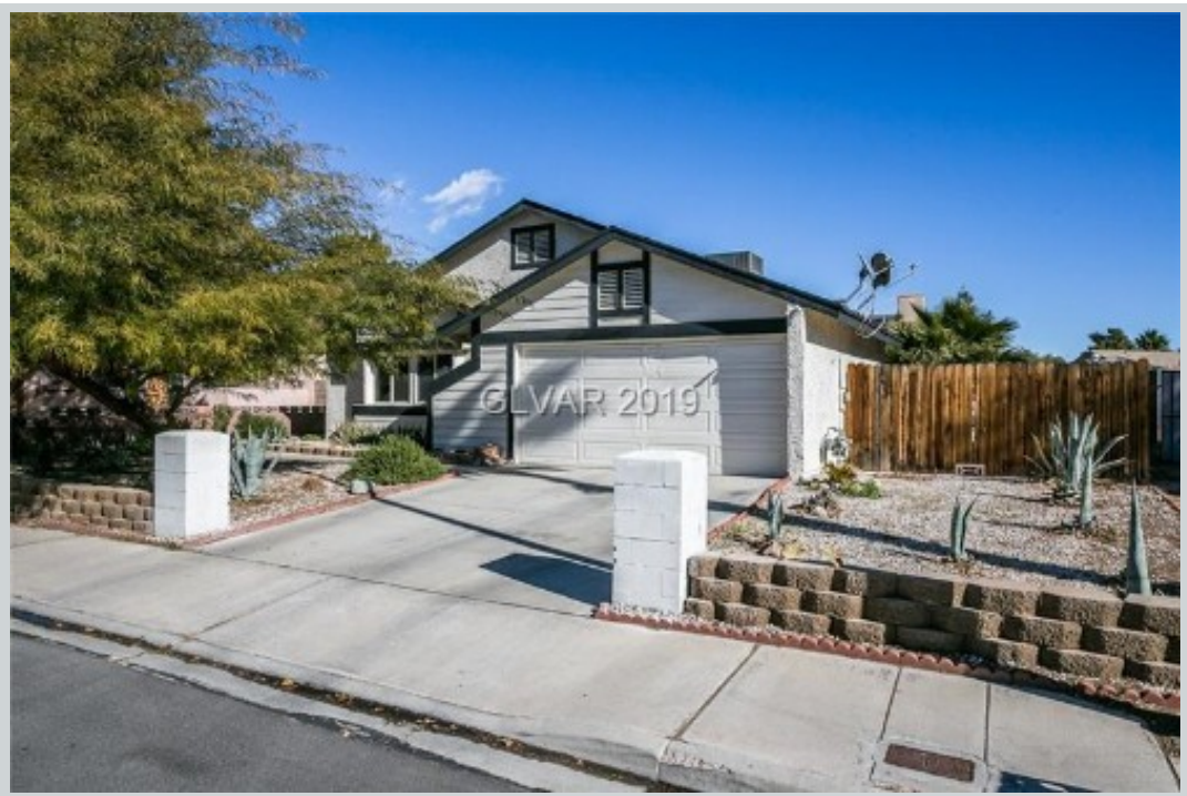
Listing Comp 1 7218 Abbeyville Dr