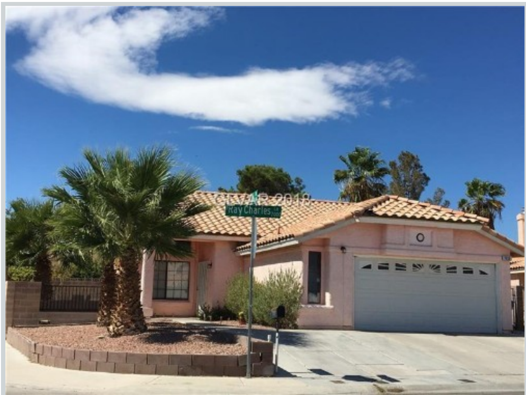
Sold Comp 1 7039 Ray Charles Ln

Address 1289 Recital Way, Las Vegas, NEVADA 89119 Loan Number 37009 Suggested List $269,000 Suggested Repaired $269,000 Sale $265,000