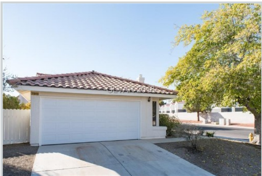
Sold Comp 2 7045 Abbeyville Dr