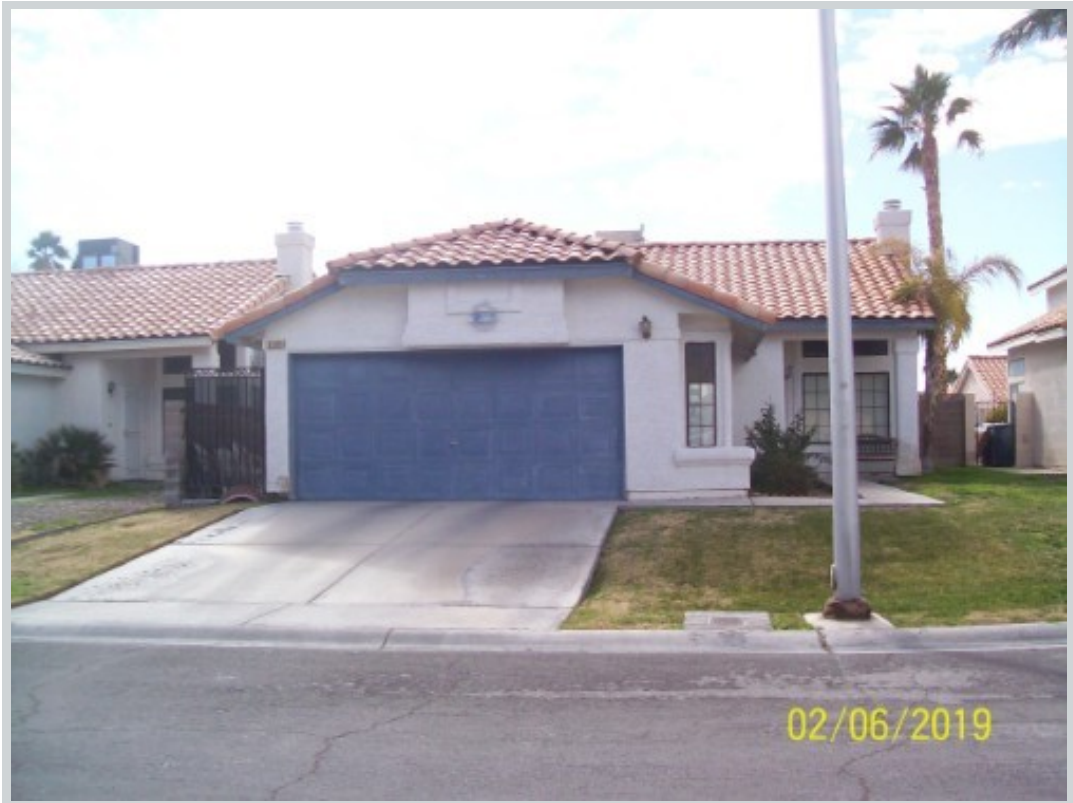
Subject 1289 Recital Way