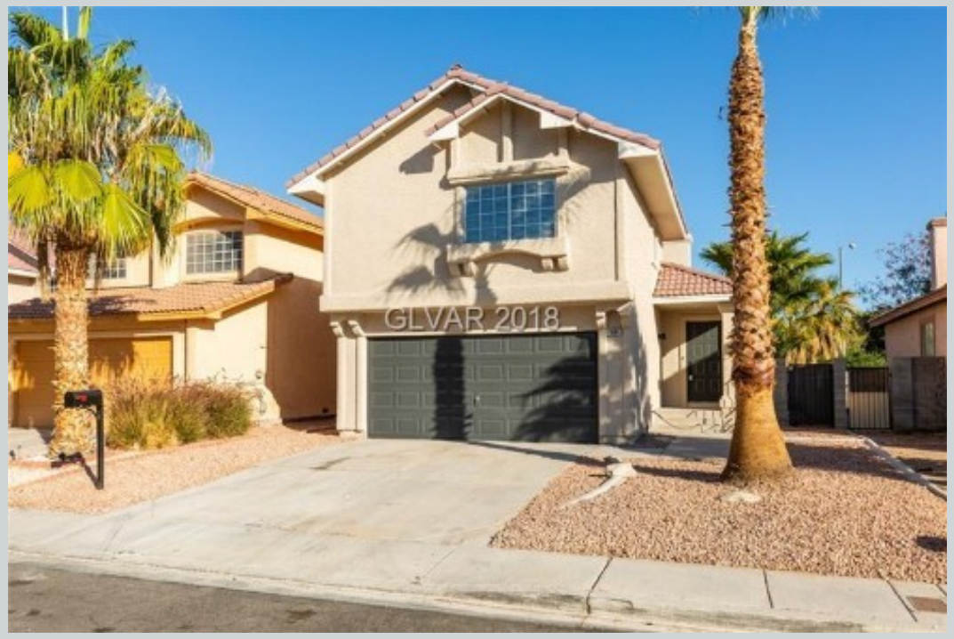
Sold Comp 3 1884 Misty Glade Dr