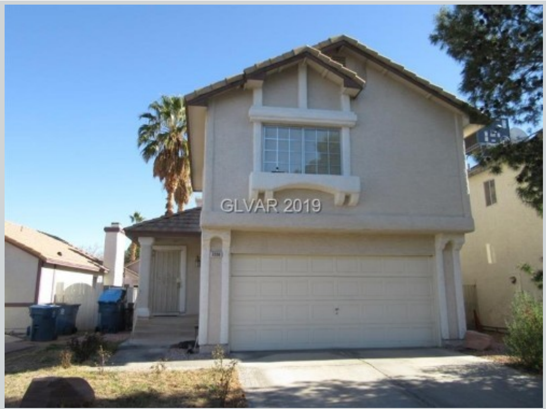
Listing Comp 2 7206 Magic Moment Ln