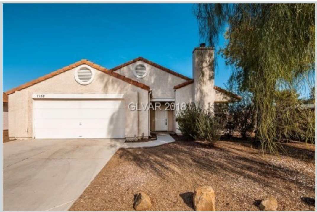
Listing Comp 3 7158 Sixshooter Dr