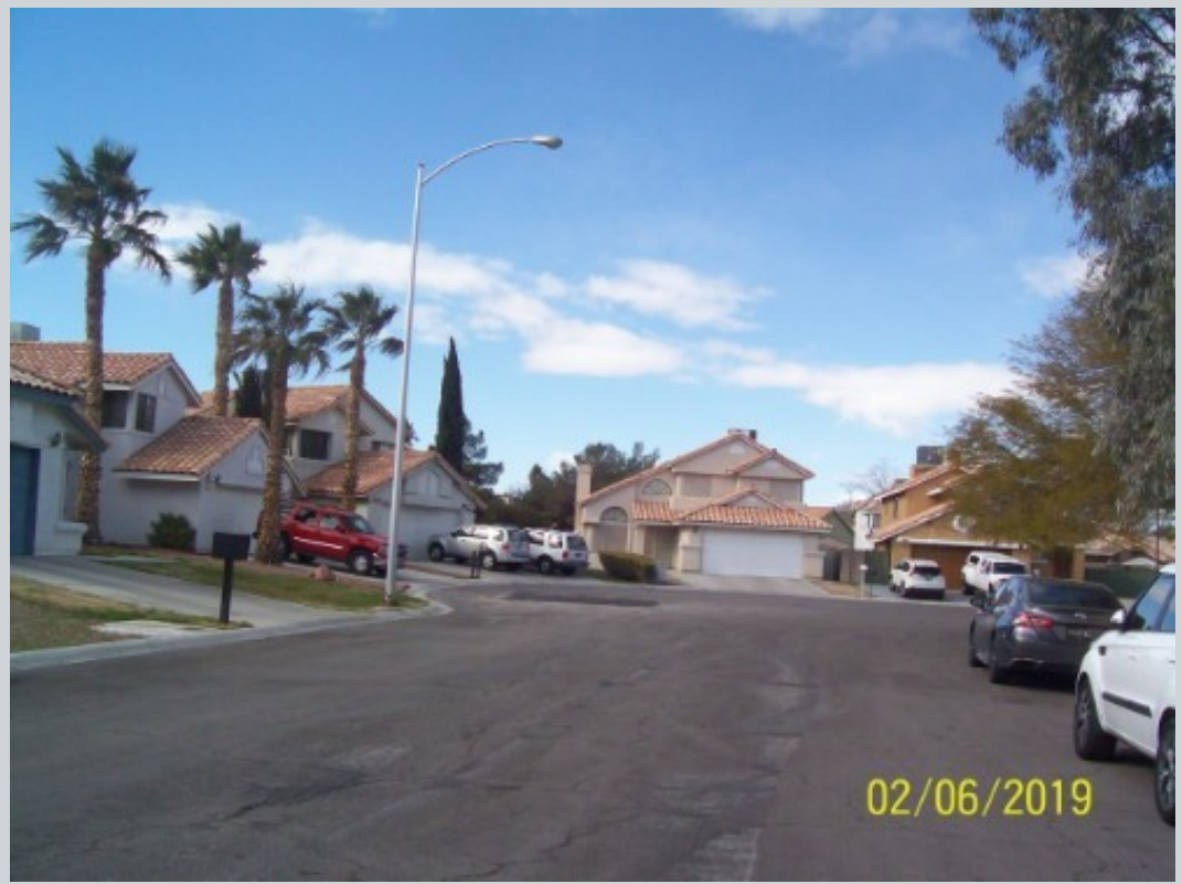
Subject 1289 Recital Way