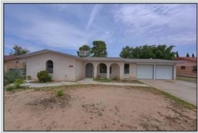
Sold Comp 3 1941 Sea Gull