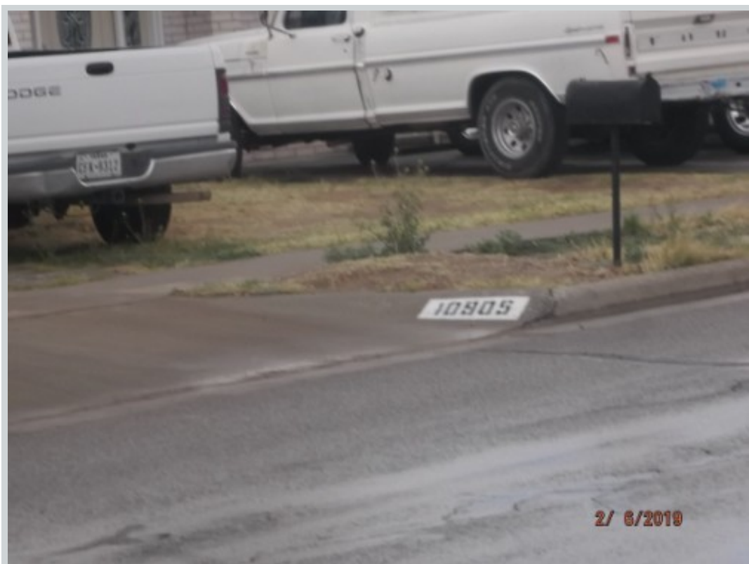
Subject 10905 Sam Snead Dr