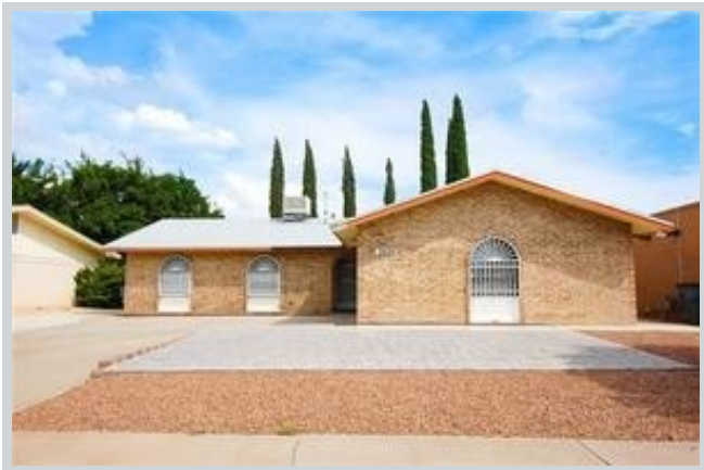
Sold Comp 2 2604 Anise View Front