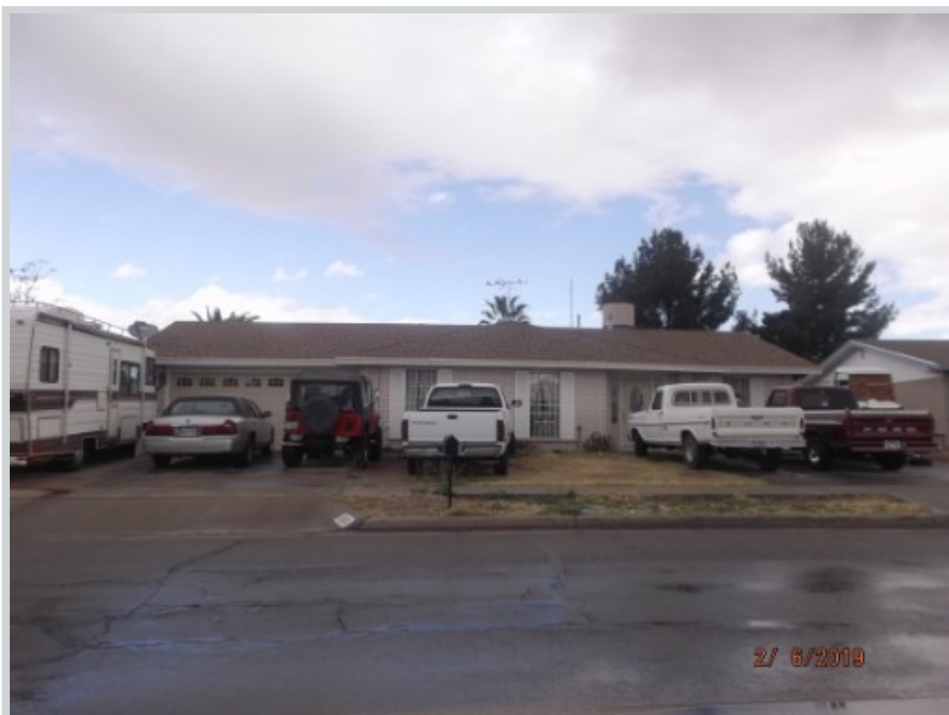
Subject 10905 Sam Snead Dr