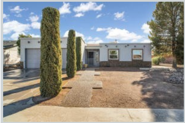
Listing Comp 3 10720 Tony Jacklin View Front