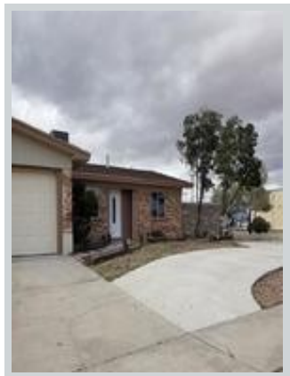
Listing Comp 1 3017 Brian Allin