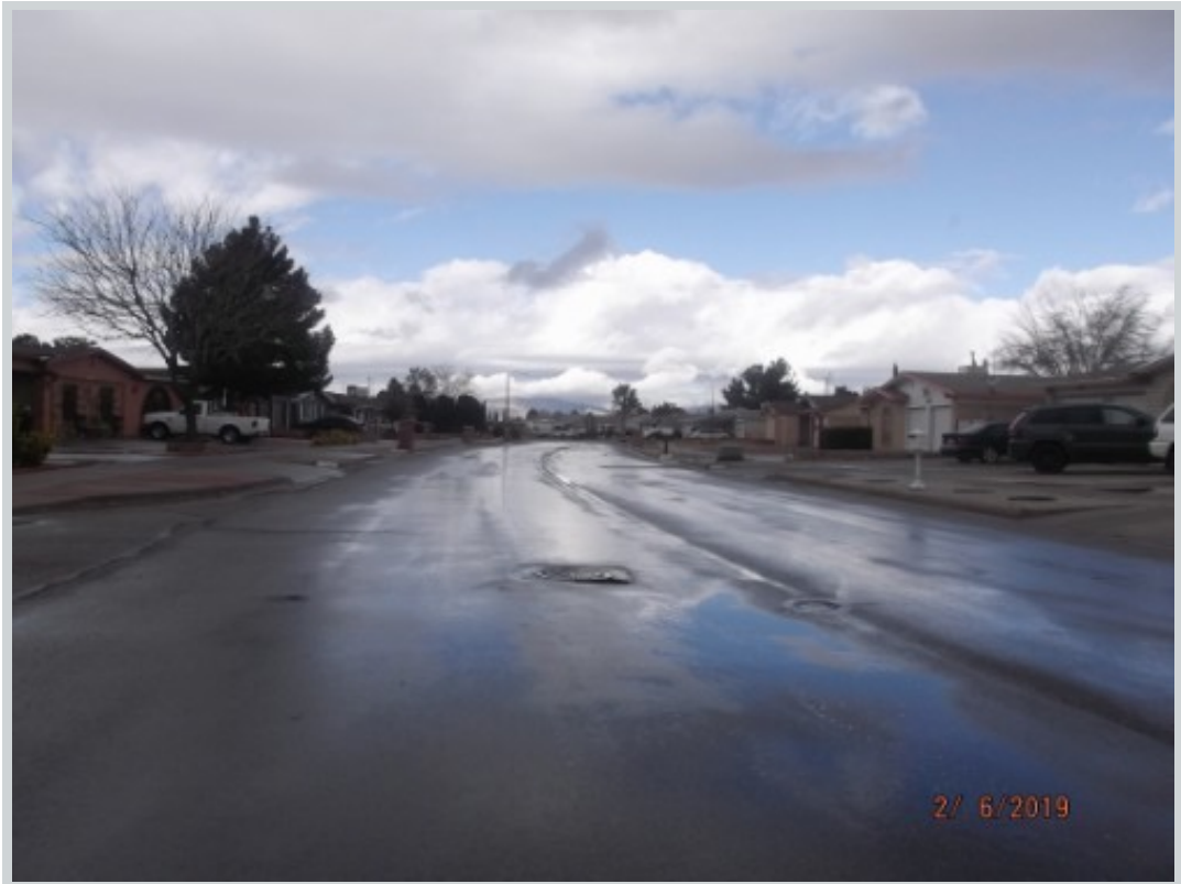
Subject 10905 Sam Snead Dr