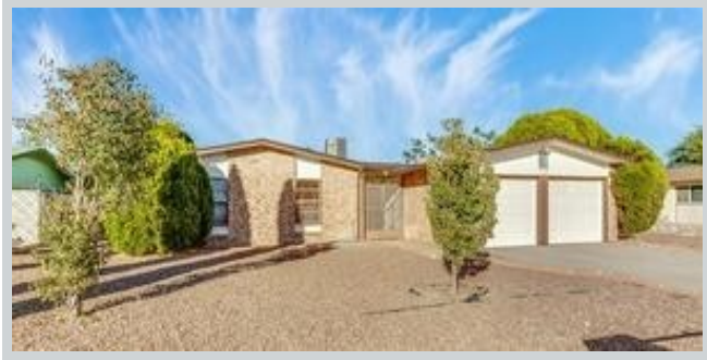
Listing Comp 2 11033 Tom Shaw View Front