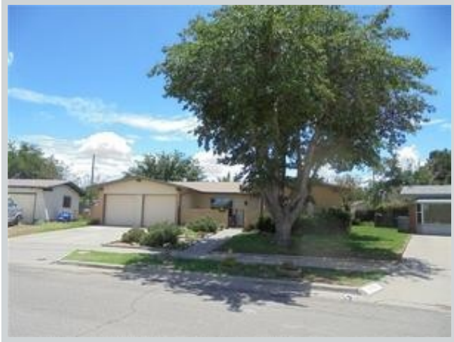
Sold Comp 1 10732 Limas View Front