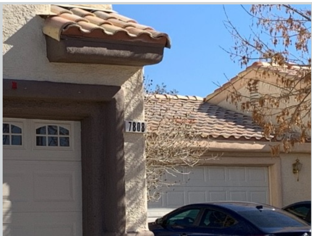
Subject 7808 Smokerise Ct