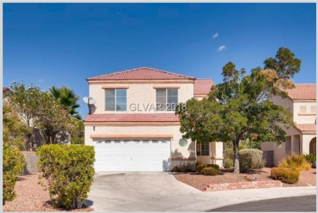
Sold Comp 3 7632 Eclat Ct