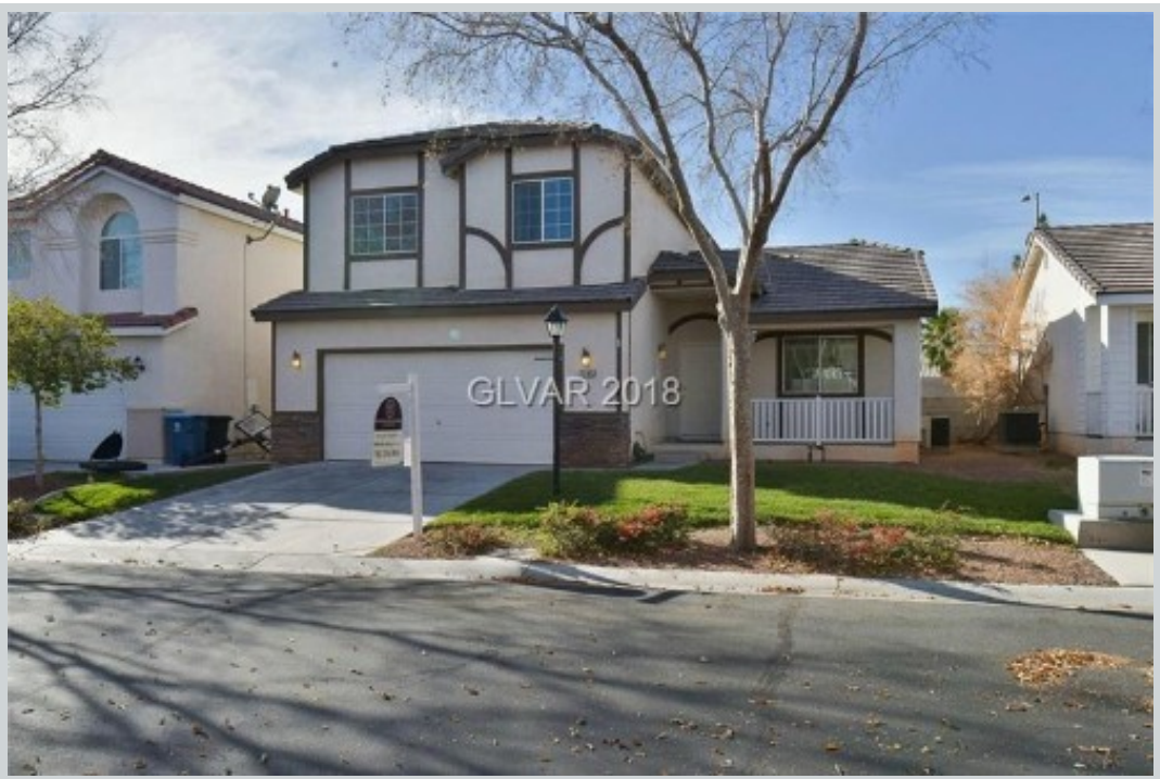
Listing Comp 1 7705 Brilliant Forest St