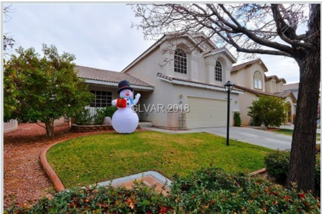
Listing Comp 2 7820 Whispering River St View Front

Address 7808 Smokerise Court, Las Vegas, NV 89131 Loan Number 37028 Suggested List $280,000 Suggested Repaired $280,000 Sale $275,000