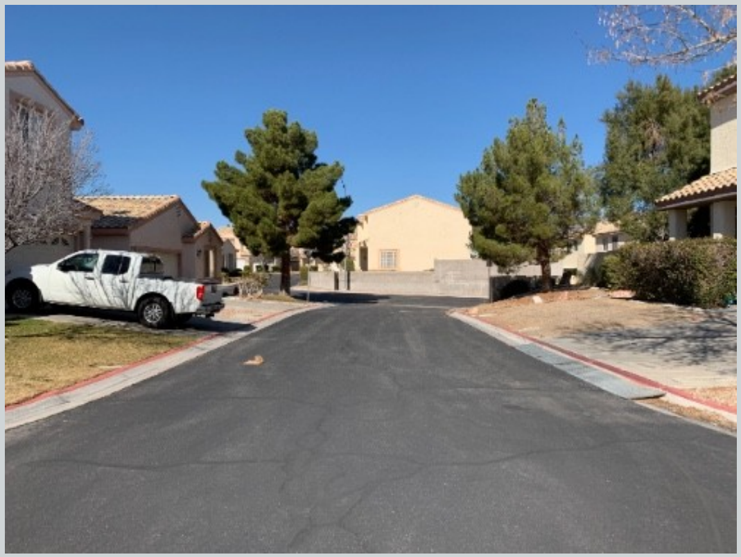
Subject 7808 Smokerise Ct