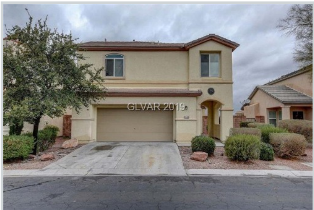
Listing Comp 3 8149 Loma Del Ray St View Front