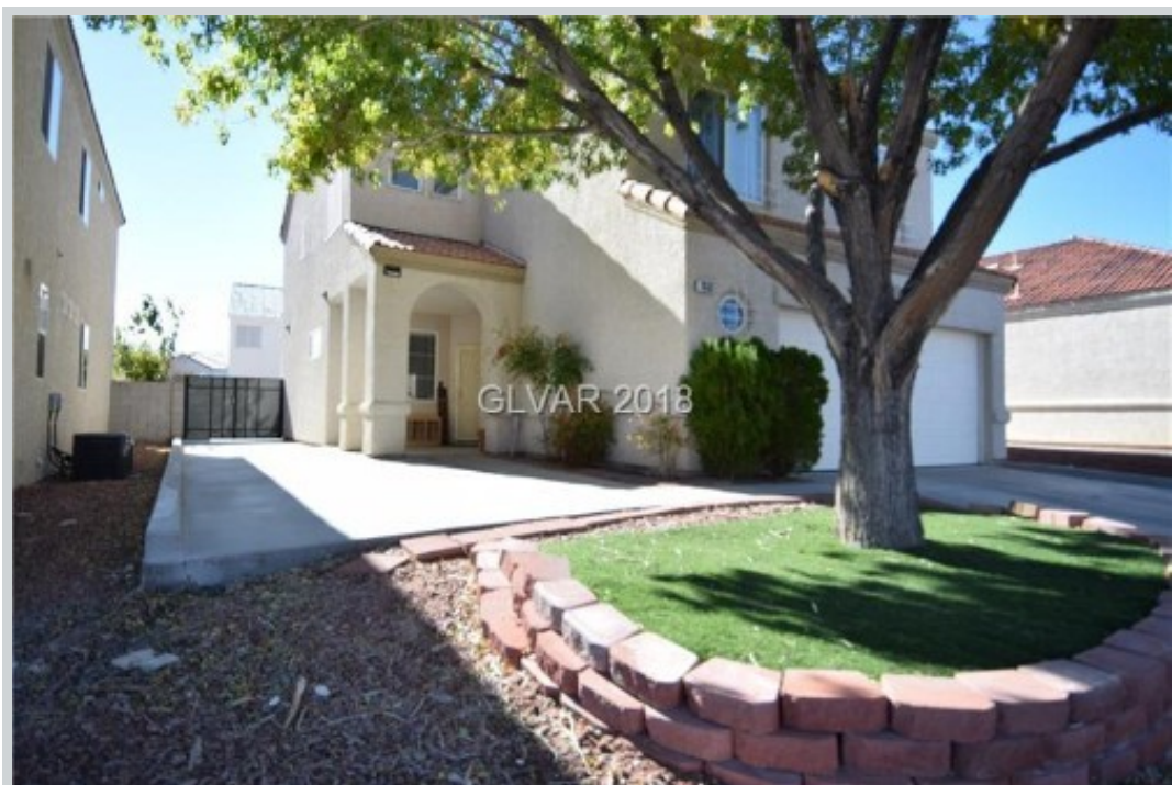
Sold Comp 2 7633 Adornment Ct View Front