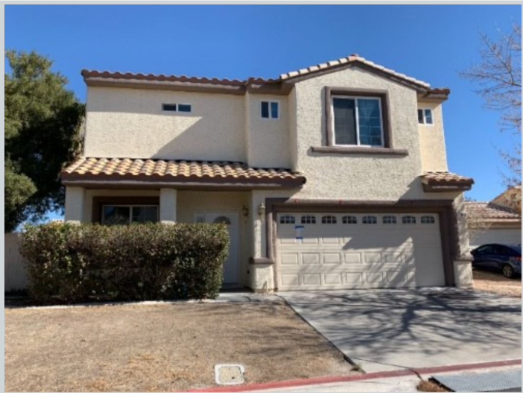
Subject 7808 Smokerise Ct