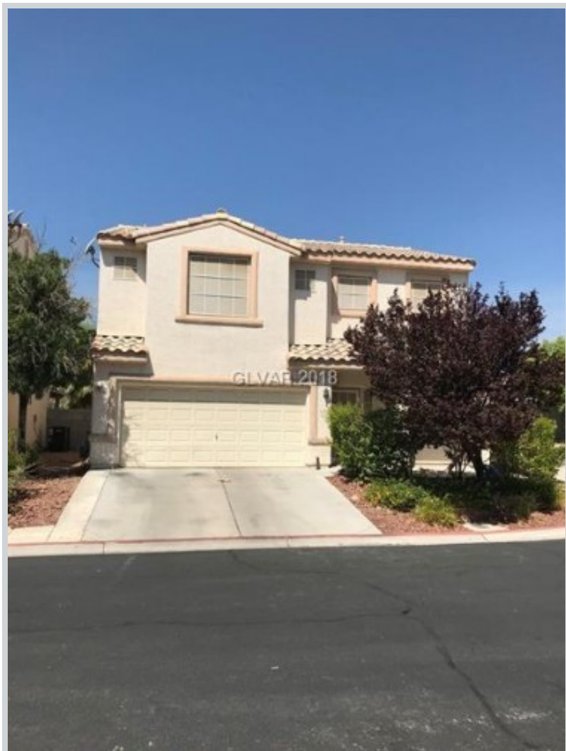
Sold Comp 1 7929 Dana Maple Ct View Front

Address 7808 Smokerise Court, Las Vegas, NV 89131 Loan Number 37028 Suggested List $280,000 Suggested Repaired $280,000 Sale $275,000