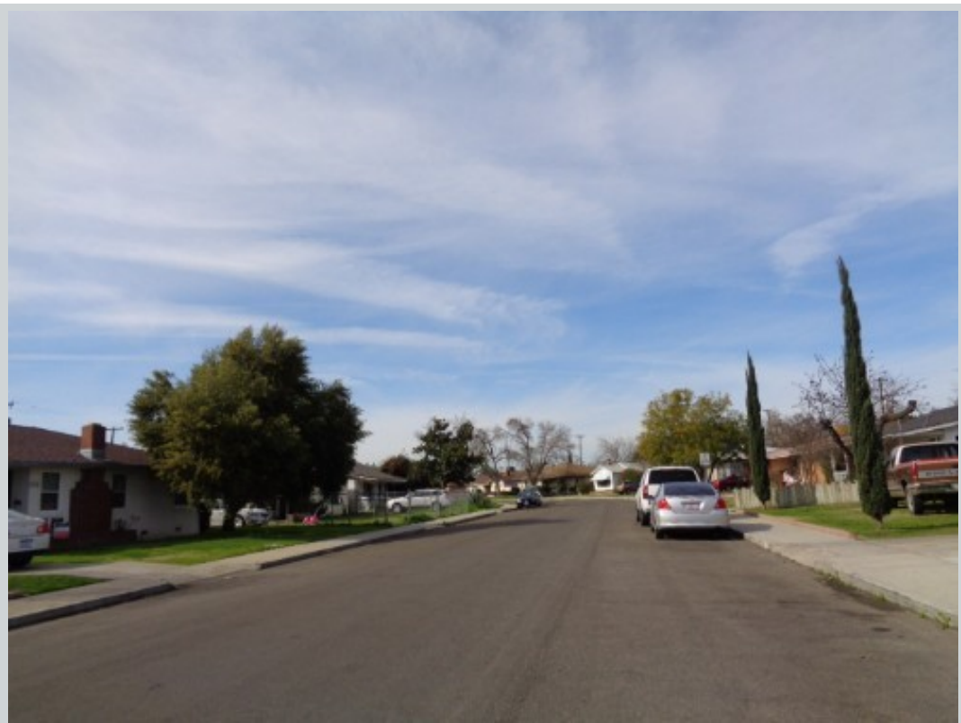
Subject 4146 E Brentwood Ave