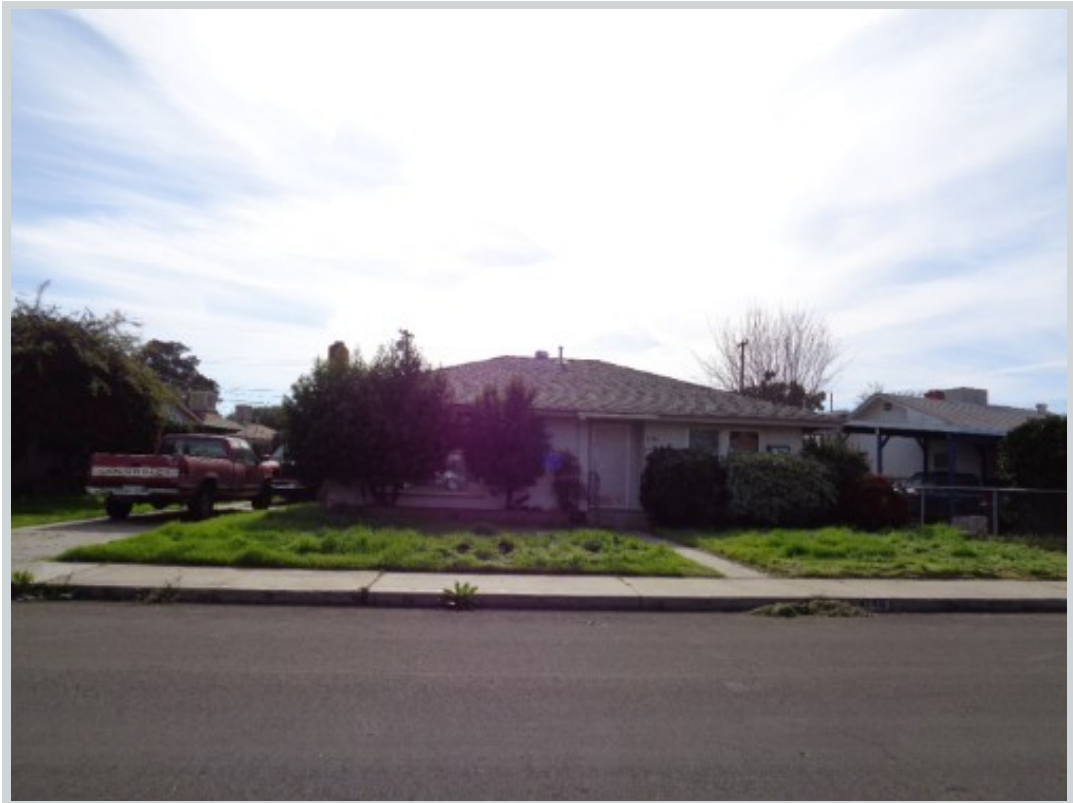
Subject 4146 E Brentwood Ave