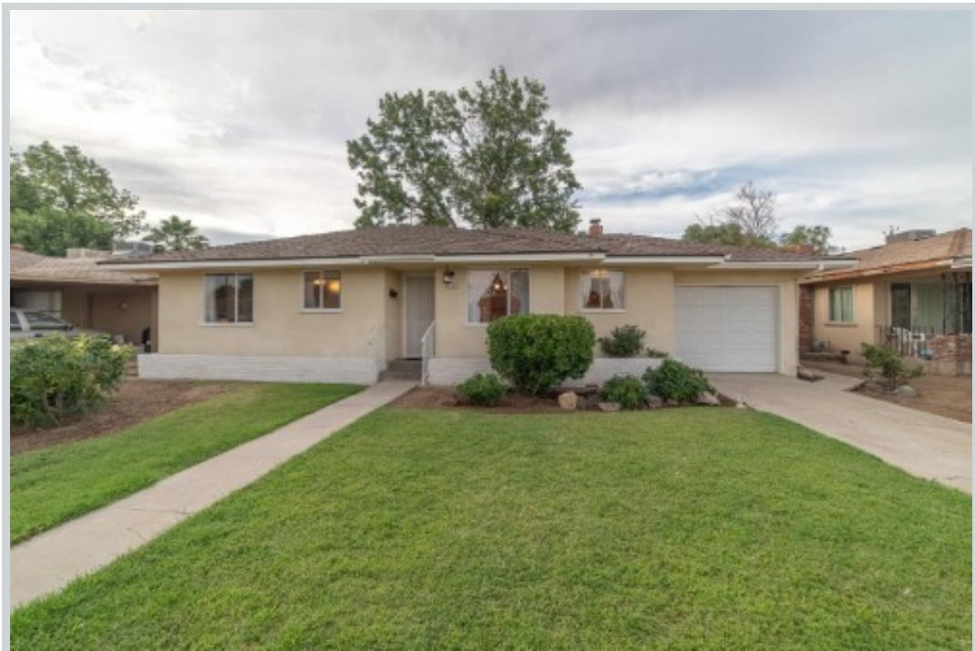
Sold Comp 2 4551 E Cambridge