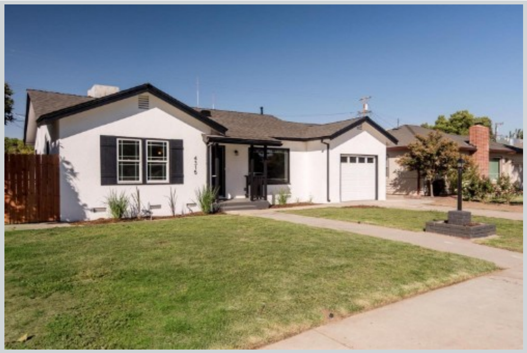
Sold Comp 3 4315 E Brentwood