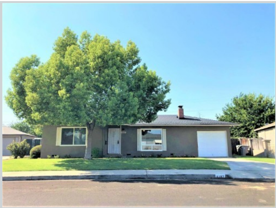
Listing Comp 3 4167 Kenmore Dr S