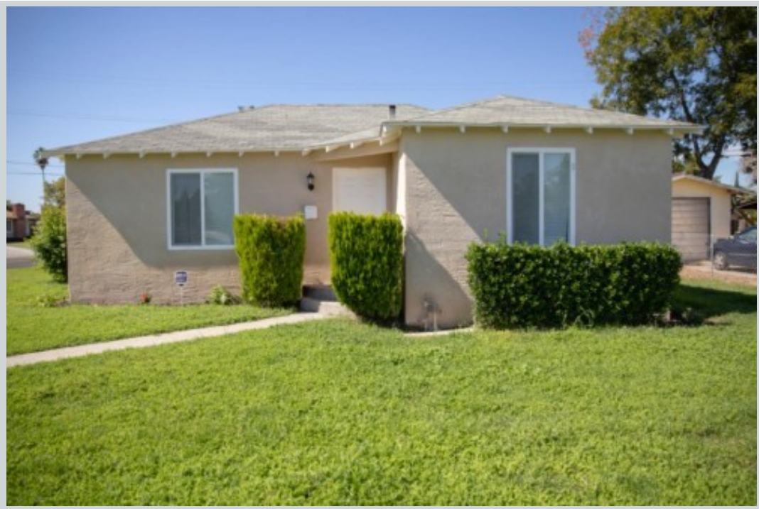
Listing Comp 2 2003 Mayfair Dr E