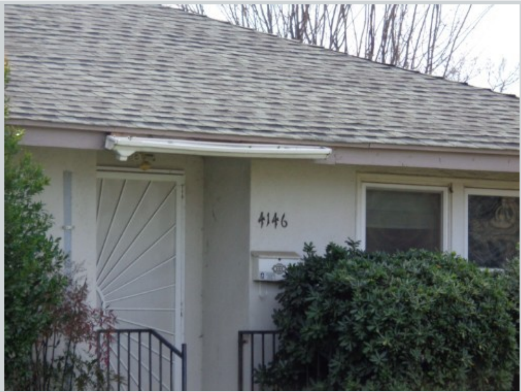
Subject 4146 E Brentwood Ave