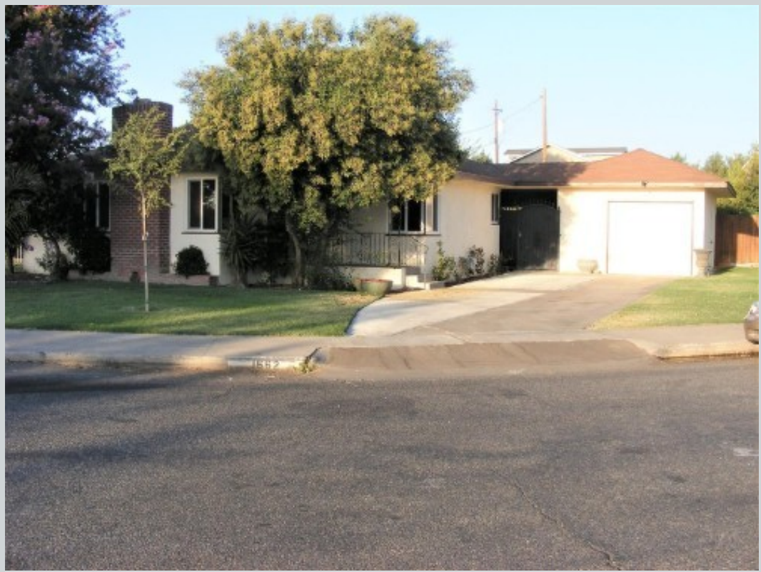
Sold Comp 1 1662 N 6th