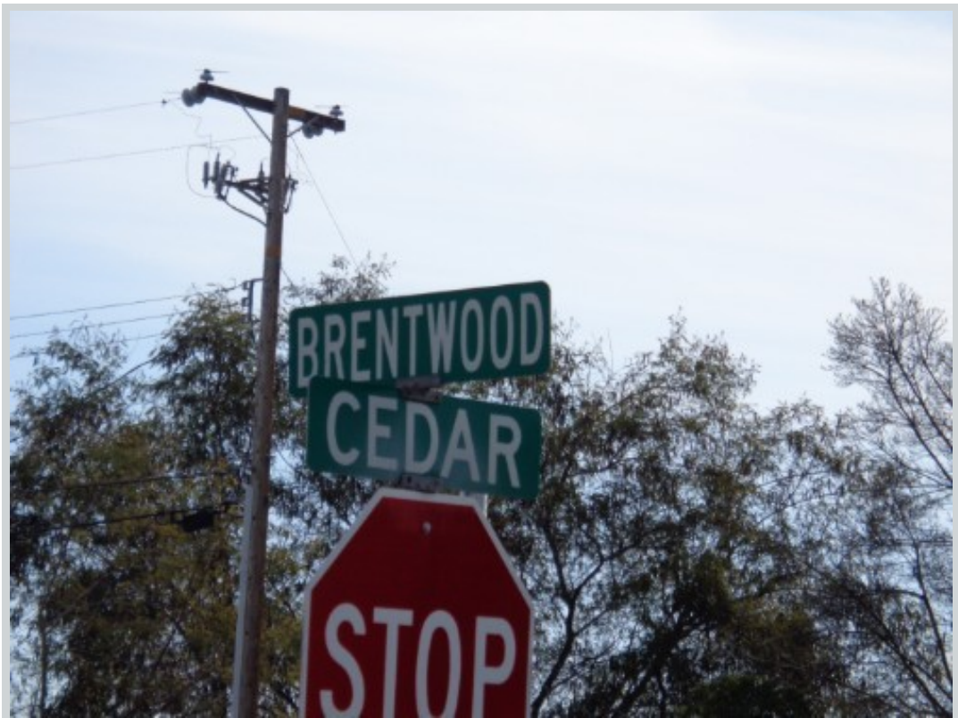
Subject 4146 E Brentwood Ave