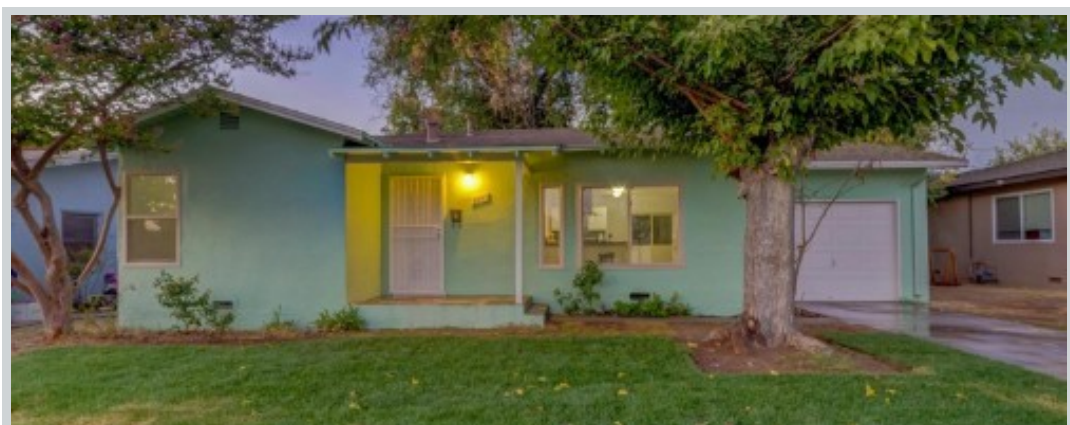
Listing Comp 1 3843 E Clinton View Front