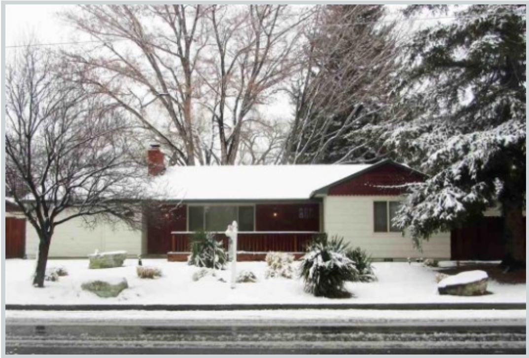
Listing Comp 3 1404 N Division