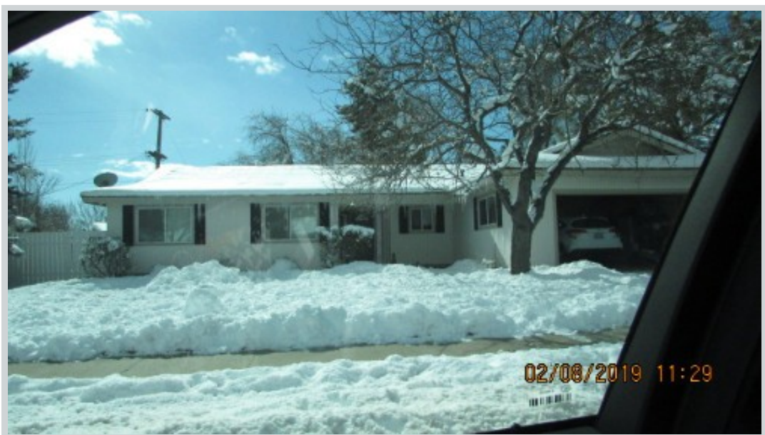
Subject 912 W Winnie Ln