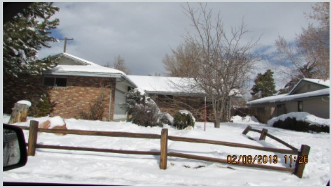
Subject 912 W Winnie Ln