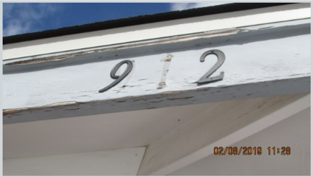
Subject 912 W Winnie Ln