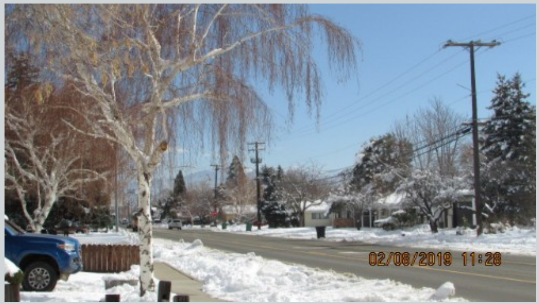
Subject 912 W Winnie Ln