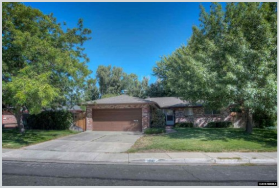
Sold Comp 2 1100 Calavares