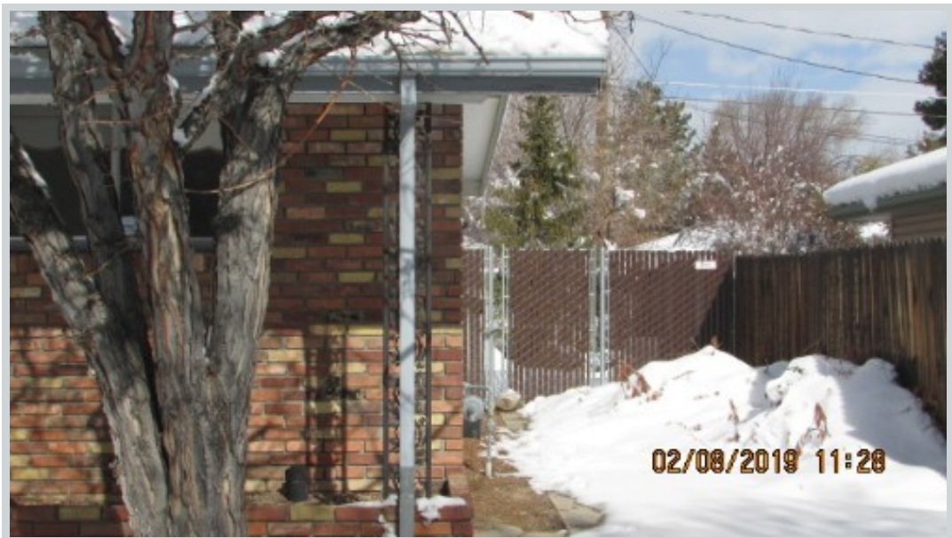
Subject 912 W Winnie Ln