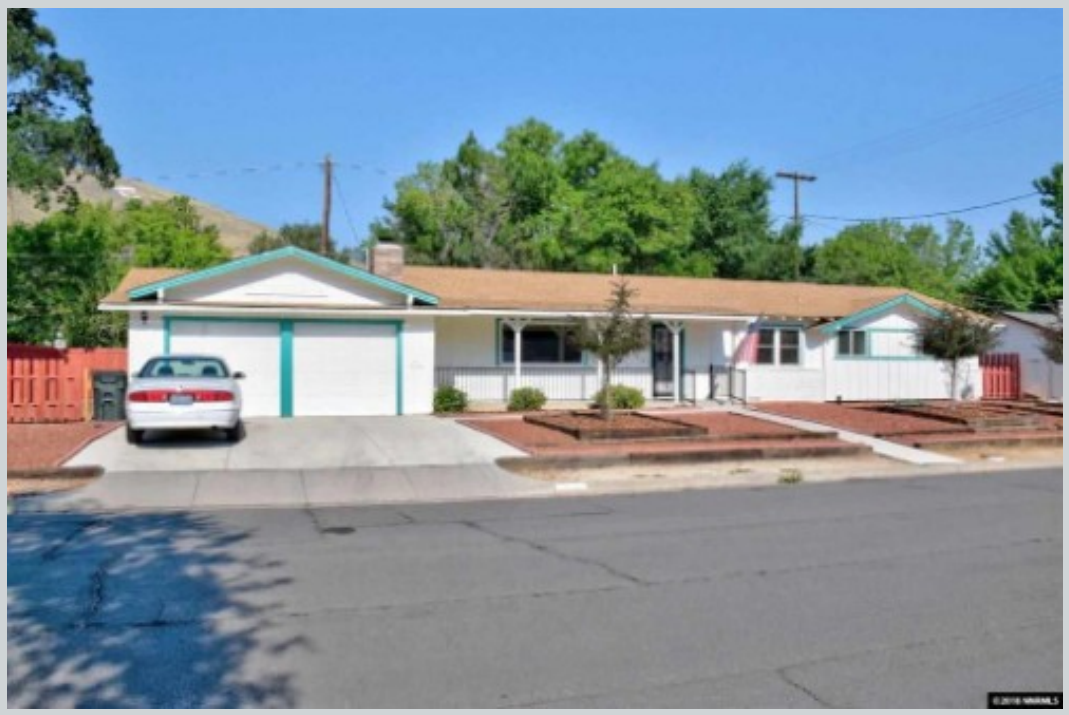
Sold Comp 3 616 Poplar St