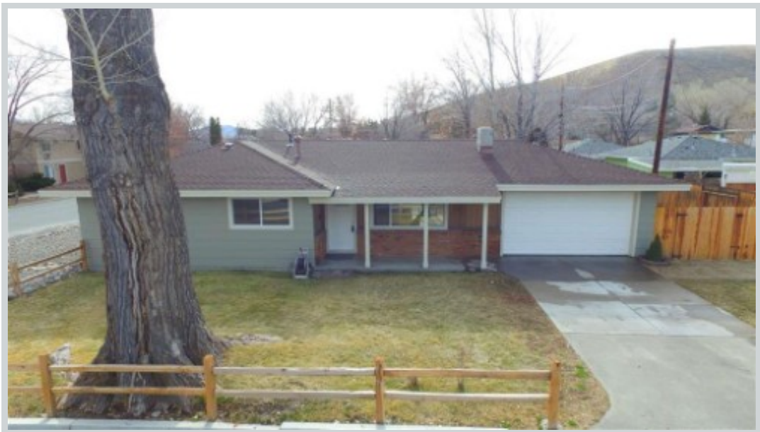
Listing Comp 2 401 W Eighth St