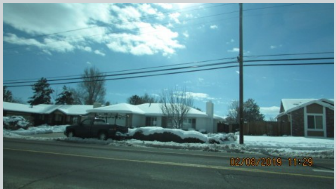
Subject 912 W Winnie Ln