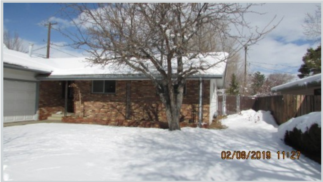
Subject 912 W Winnie Ln