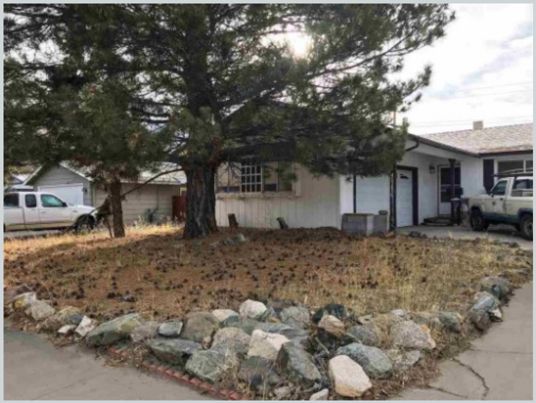
Listing Comp 1 506 Bath