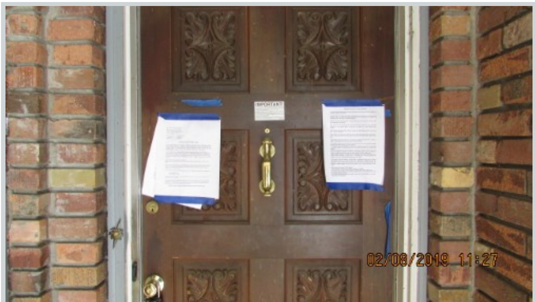
Subject 912 W Winnie Ln

Address 912 W Winnie Lane, Carson City, NV 89703 Loan Number 37036 Suggested List $320,000 Suggested Repaired $320,000 Sale $315,000