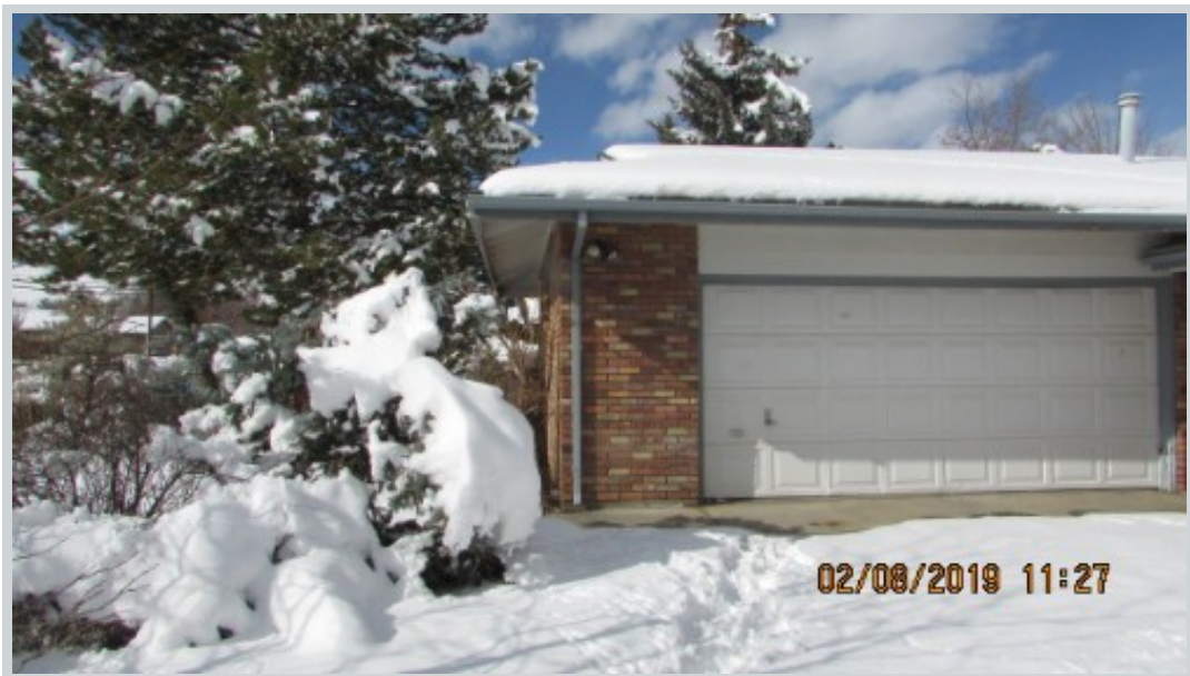
Subject 912 W Winnie Ln

Address 912 W Winnie Lane, Carson City, NV 89703 Loan Number 37036 Suggested List $320,000 Suggested Repaired $320,000 Sale $315,000