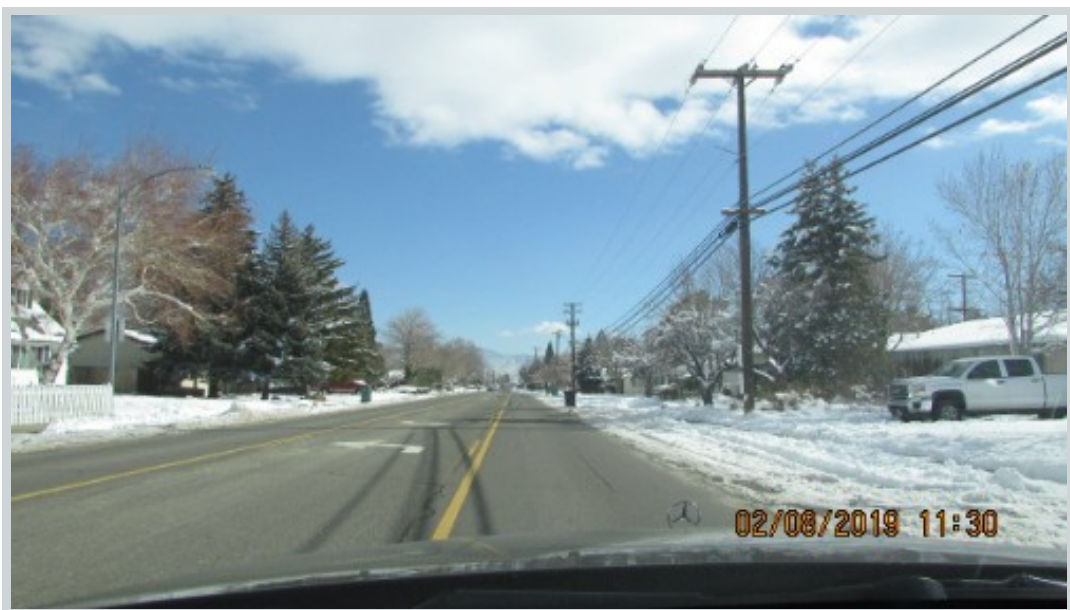
Subject 912 W Winnie Ln