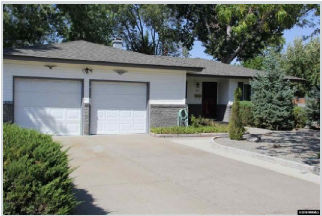
Sold Comp 1 804 W Winnie