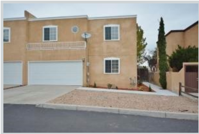
Sold Comp 3 6605 Saint Josephs Ave View Front