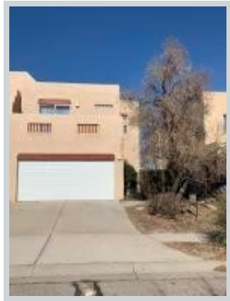
Listing Comp 3 5209 Sugarbear Ct View Front