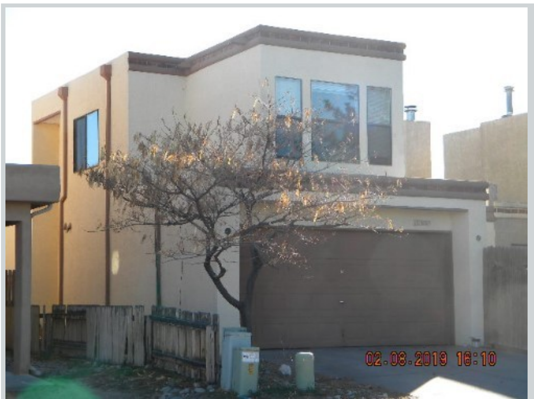
Subject 7108 Cisco Rd Nw View Side Comment "Left side"