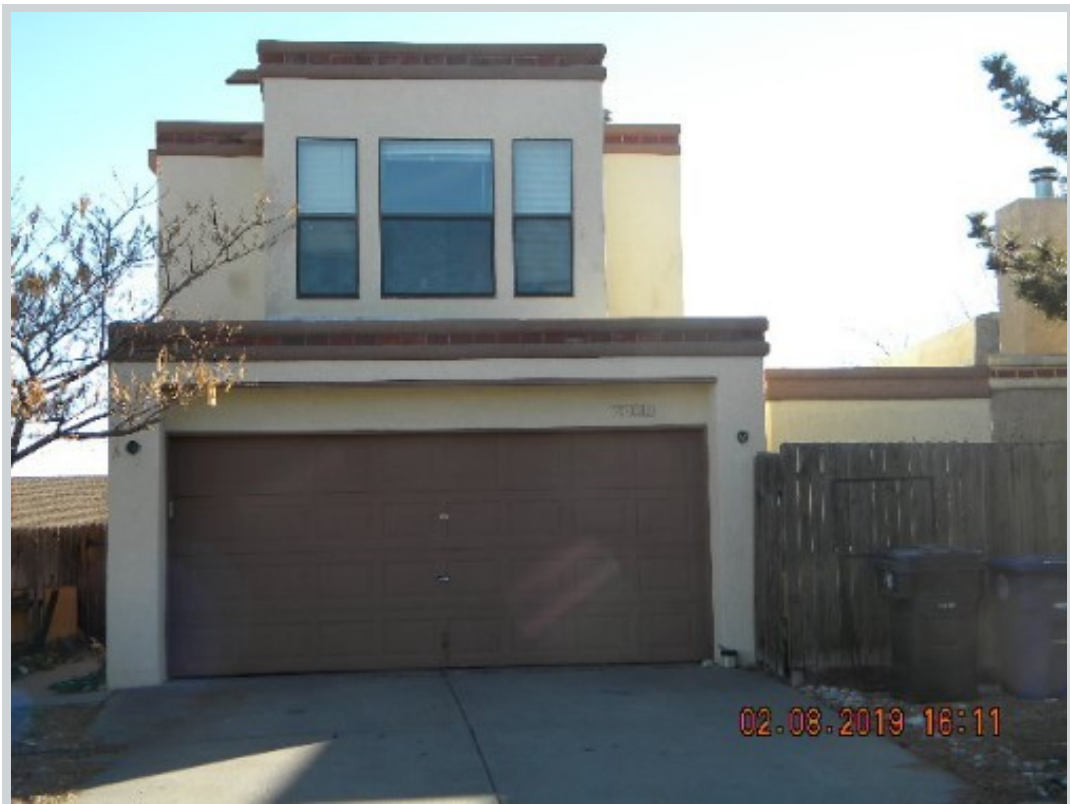
Subject 7108 Cisco Rd Nw

Address 7108 Cisco Road, Albuquerque, NM 87120 Loan Number 37040 Suggested List $159,000 Suggested Repaired $159,000 Sale $155,000