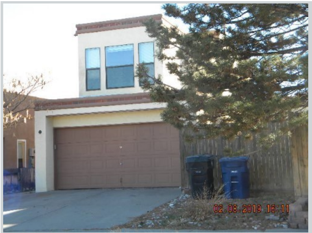
Subject 7108 Cisco Rd Nw View Side Comment "Right side"

Address 7108 Cisco Road, Albuquerque, NM 87120 Loan Number 37040 Suggested List $159,000 Suggested Repaired $159,000 Sale $155,000