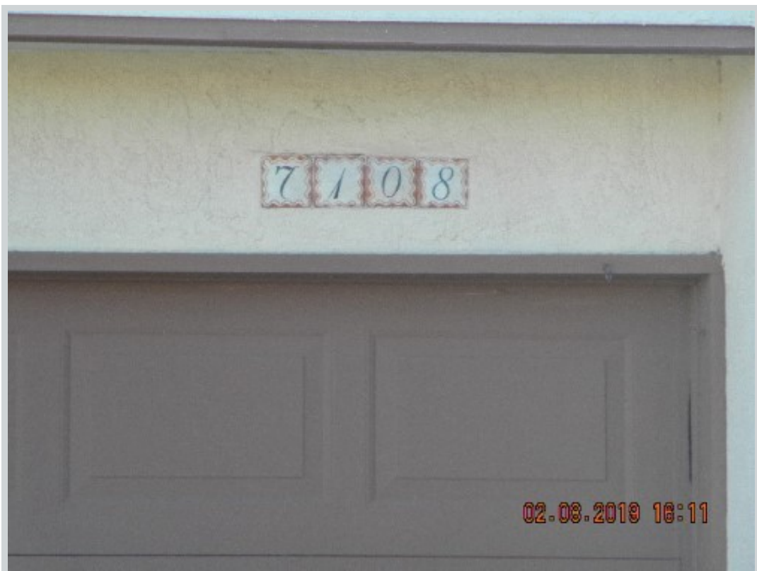
Subject 7108 Cisco Rd Nw