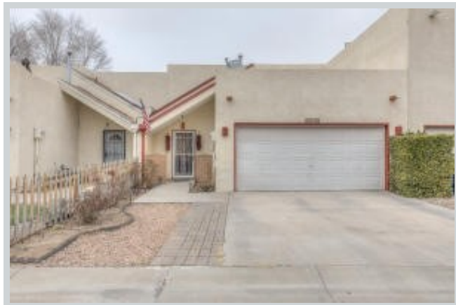
Listing Comp 2 3833 Dancing Star Way