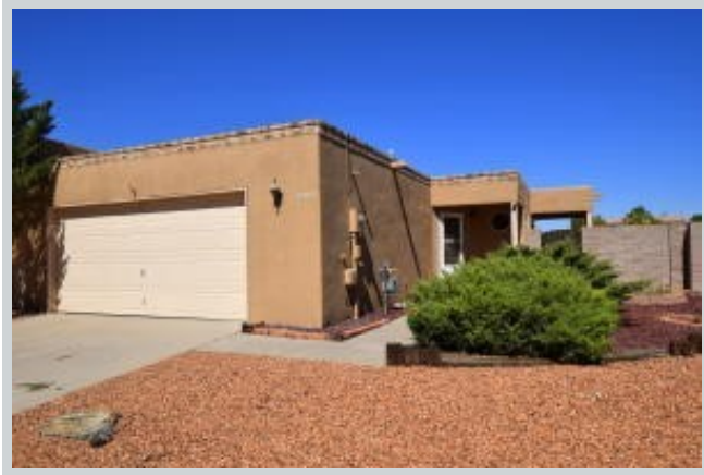
Sold Comp 2 6409 Dona Linda Pl View Front

Address 7108 Cisco Road, Albuquerque, NM 87120 Loan Number 37040 Suggested List $159,000 Suggested Repaired $159,000 Sale $155,000