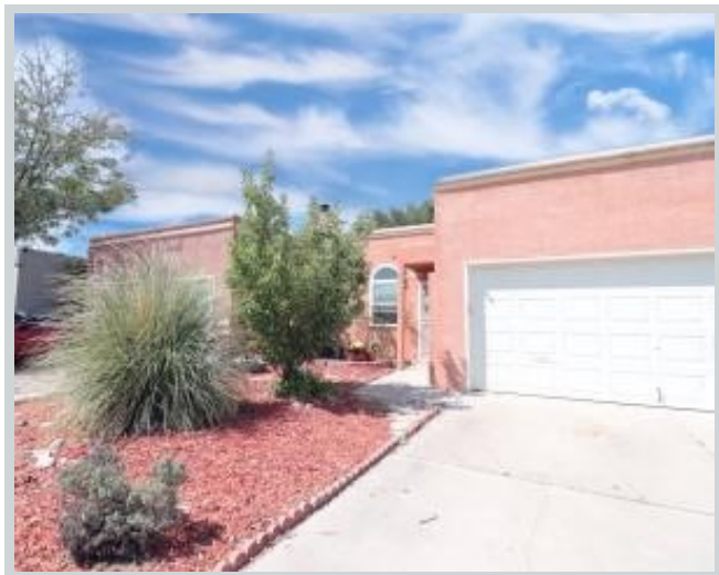
Sold Comp 1 6805 Cleghorn Rd View Front