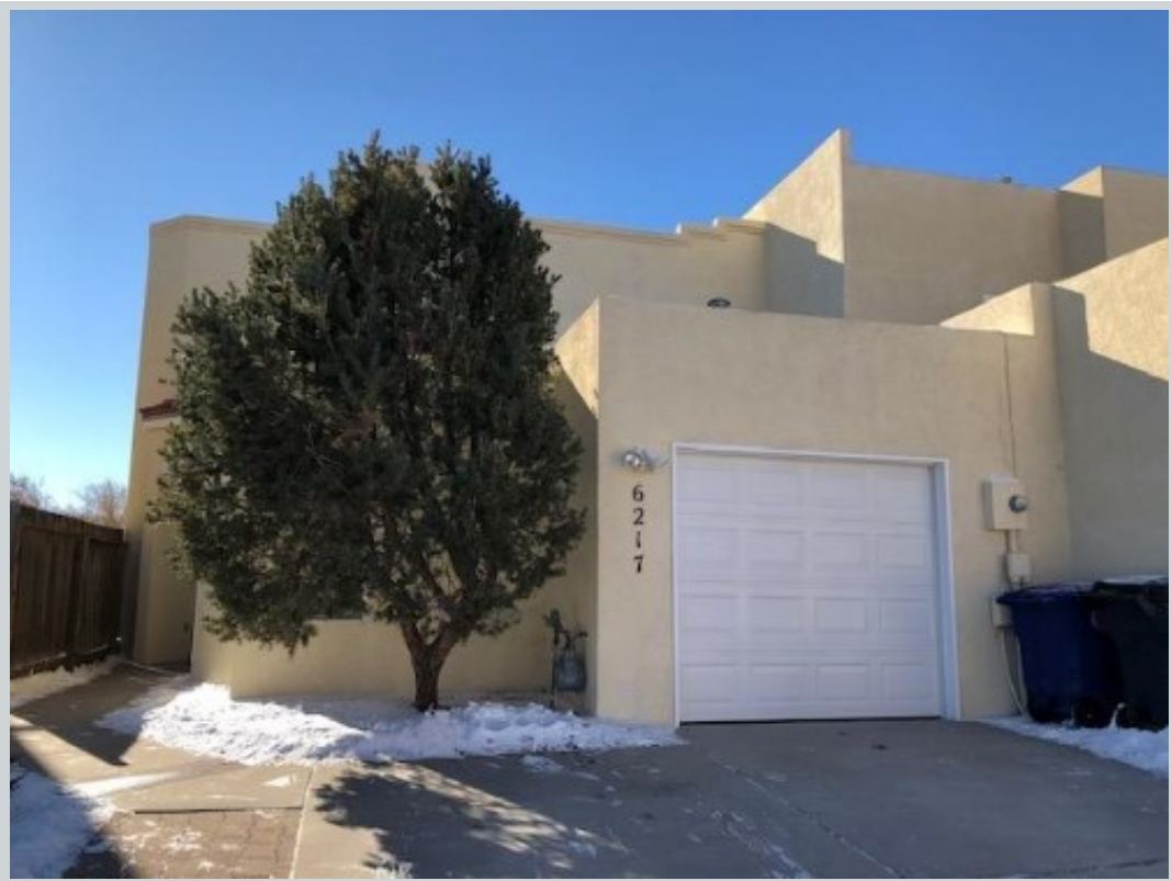
Listing Comp 1 6217 Bent Tree Dr