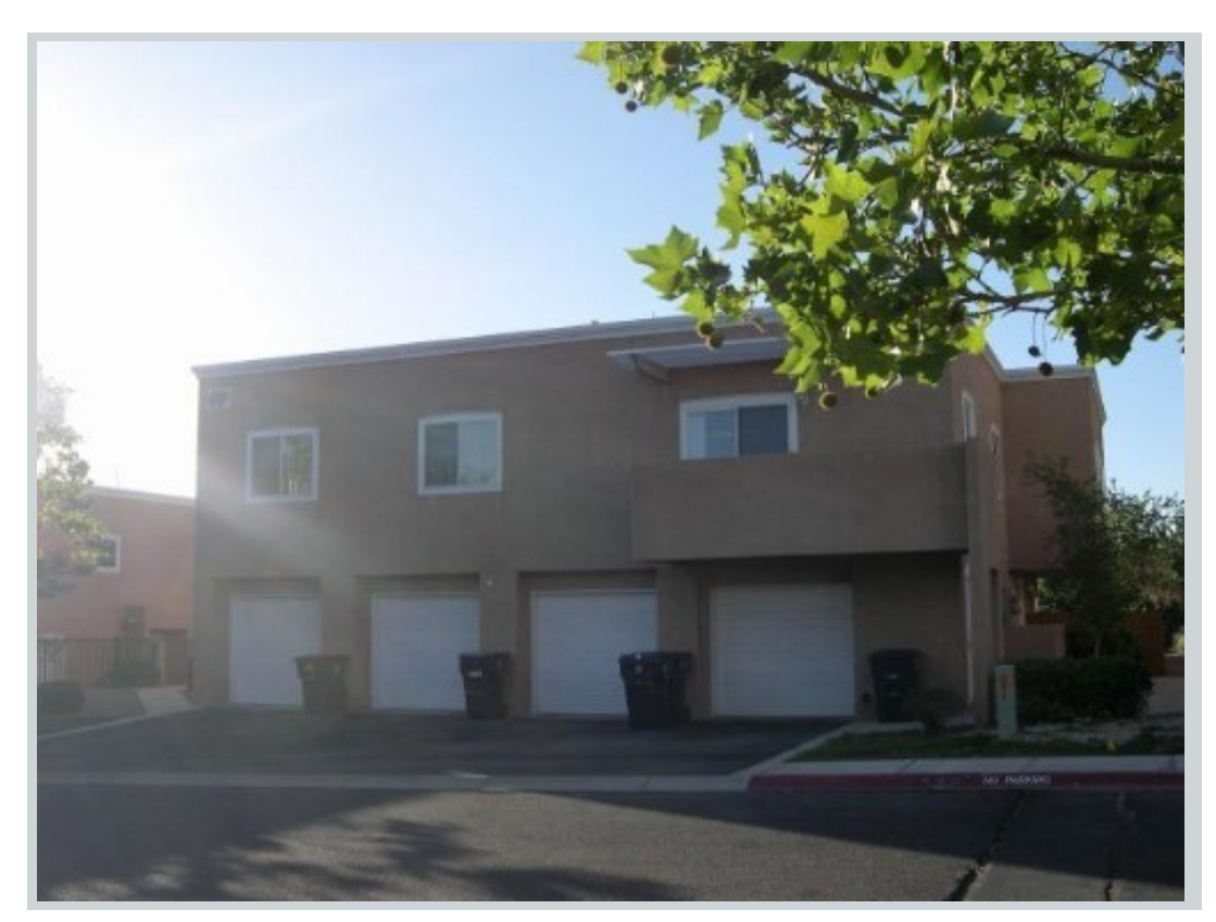
Listing Comp 2 4701 Morris St Ne Apt 704