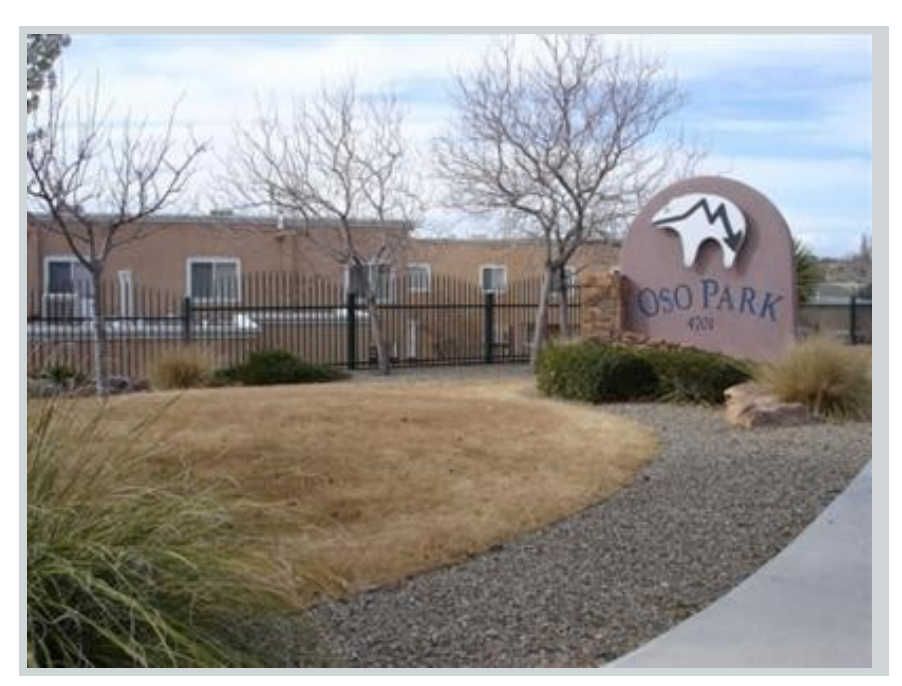
Subject 4701 Morris St Ne