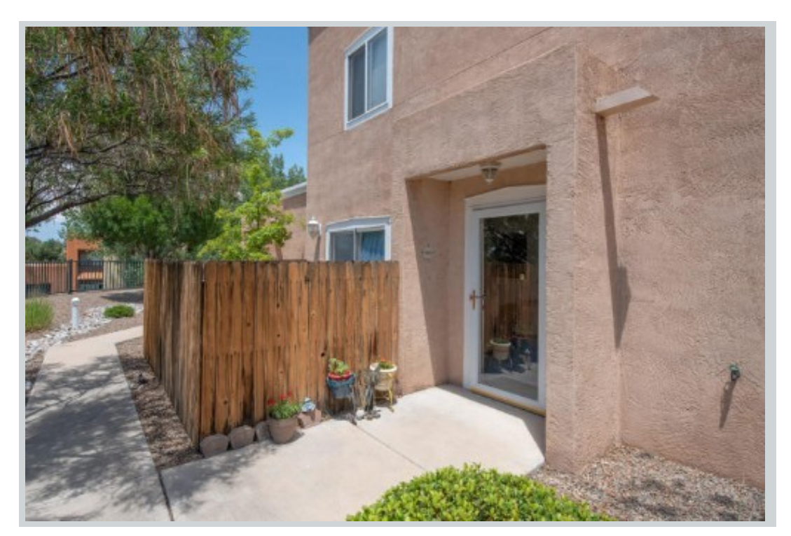
Sold Comp 3 4701 Morris St Ne Apt 1102

oan Number 37041 Suggested List $144,000 Suggested Repaired $144,000 Sale $141,500