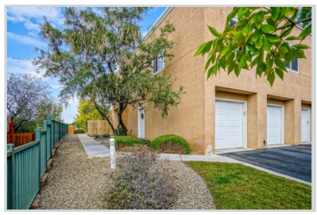
Sold Comp 1 4701 Morris St Ne Apt 1302