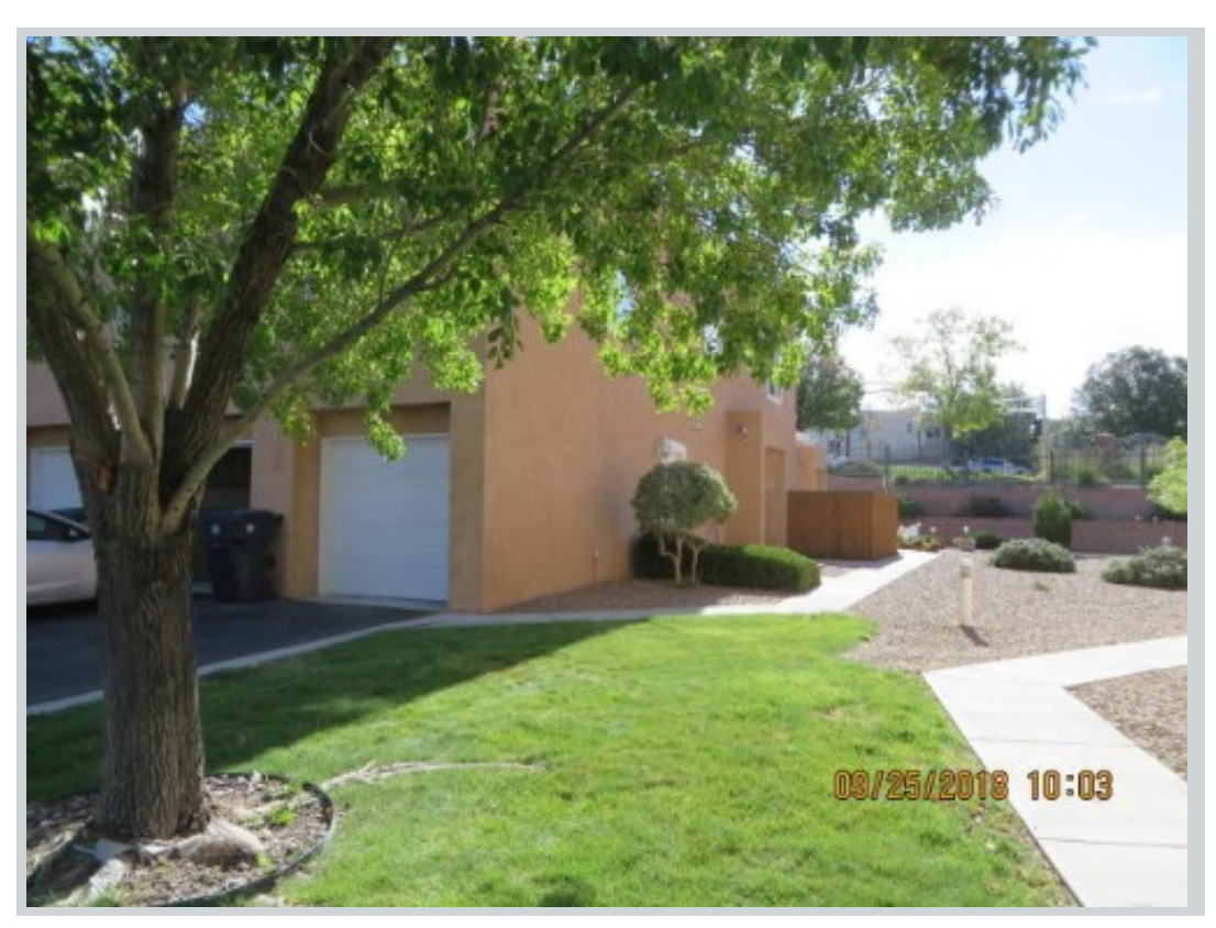
Listing Comp 1 4701 Morris St Ne Apt 402