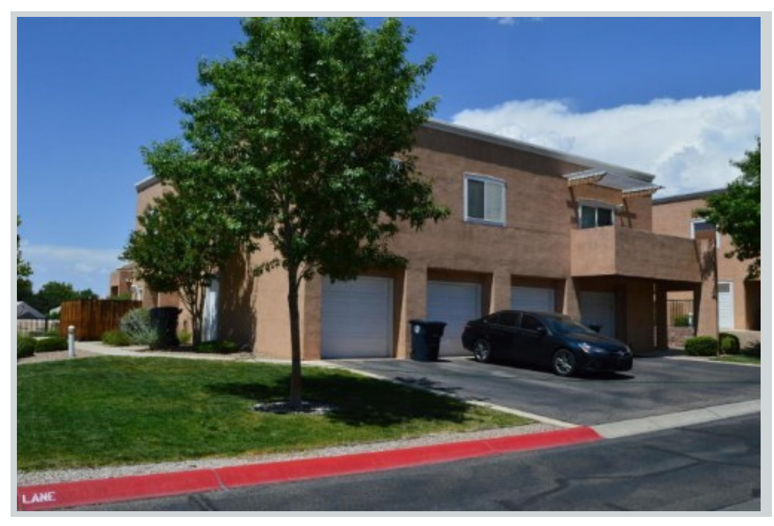
Subject 4701 Morris St Ne