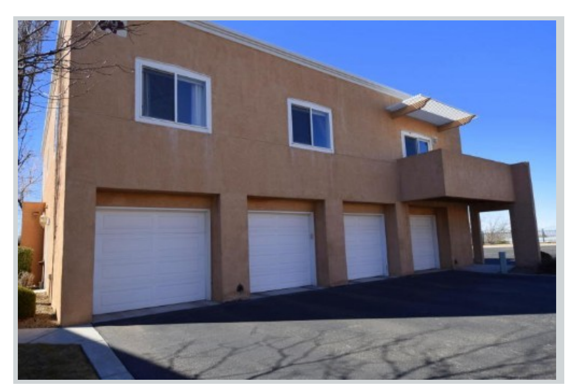
Listing Comp 3 4701 Morris St Ne Apt 2904