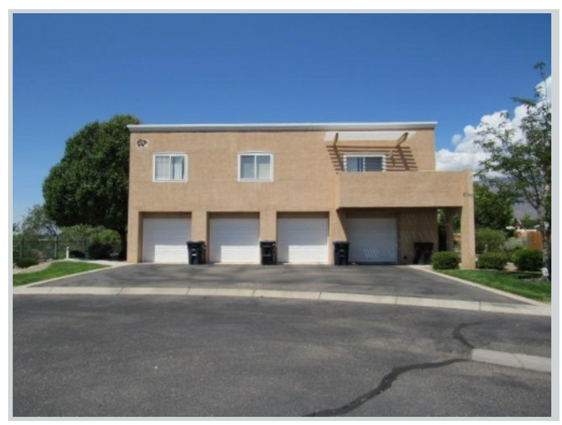
Sold Comp 2 4701 Morris St Ne Apt 2801